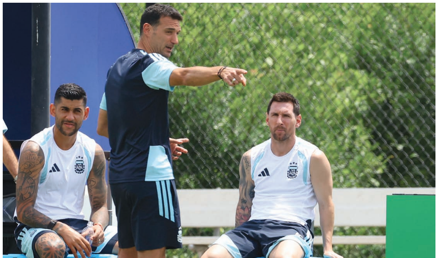
Argentina's head coach Lionel Scaloni gives instructions to forward Lionel Messi and defender Cristian Romero during a training session yesterday, ahead of the FIFA World Cup 2026 round of 16 match against Egypt at Kennesaw State University in Kennesaw, Georgia.

The winner of the match in Atlanta will face Switzerland or Colombia in Kansas City on July 11.