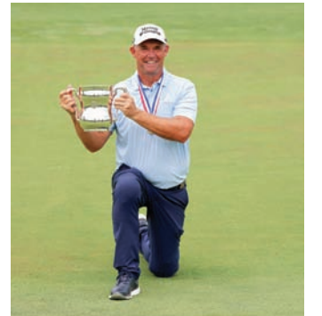
Pdraig Harrington of Ireland poses with The Francis D. Ouimet Memorial Trophy after winning the US Senior Open Championship 2026 at Scioto Country Club in Columbus, Ohio.

"Now I'm seeing guys coming along, and I'm kind of realizing there is only a window to win these tournaments," Harrington said. "They have told me, other players, that it's kind of up to about 56, 57, then it starts going downhill pretty quickly."