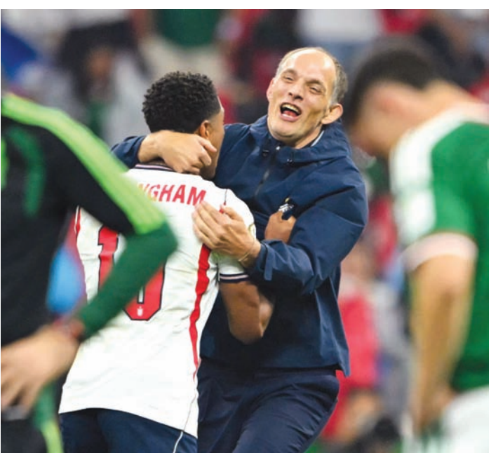
England's German head coach Thomas Tuchel and midfielder Jude Bellingham celebrate after winning against Mexico at the Mexico City Stadium in Mexico City.

home to revel in the glory of a memorable night. "To be a part of an England team that gives so much to the country that can give them these moments and nights like this means just as much as anything in my career and in my life really," he added. "Kids stay off school, parents don't go to work, enjoy the day. Be with your friends, go down the pub again if you can. "Enjoy it because these nights don't come around often." England will hope Bellingham has three more nights like this in him to finally bring the World Cup home.