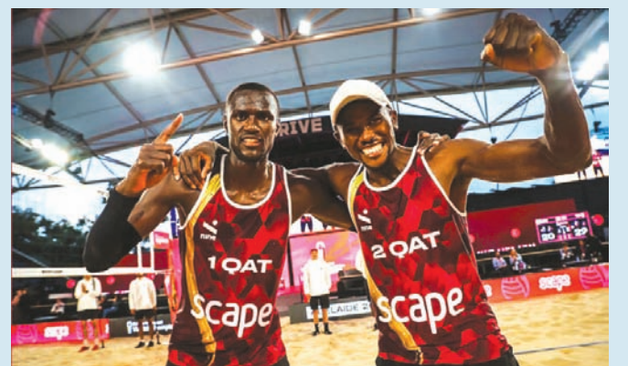
Qatar's Cherif Younousse and Ahmad Tijan won the 'Best Men's Beach Volleyball Players in Asia' award, in the first edition of the Asian Volleyball Confederation Awards (AVC Gala 2026), in recognition of the outstanding results they achieved during the season. The Qatari duo were chosen after their outstanding performances in various continental and international competitions and their continued success in achieving positive results that have strengthened the position of Qatari beach volleyball on both the Asian and global stages. Younousse and Tijan are scheduled to officially receive the award during the AVC Gala 2026, which will be held in Bangkok, Thailand, on August 8, in the presence of a select group of stars and officials from across Asia, to celebrate the most prominent individual and team achievements.