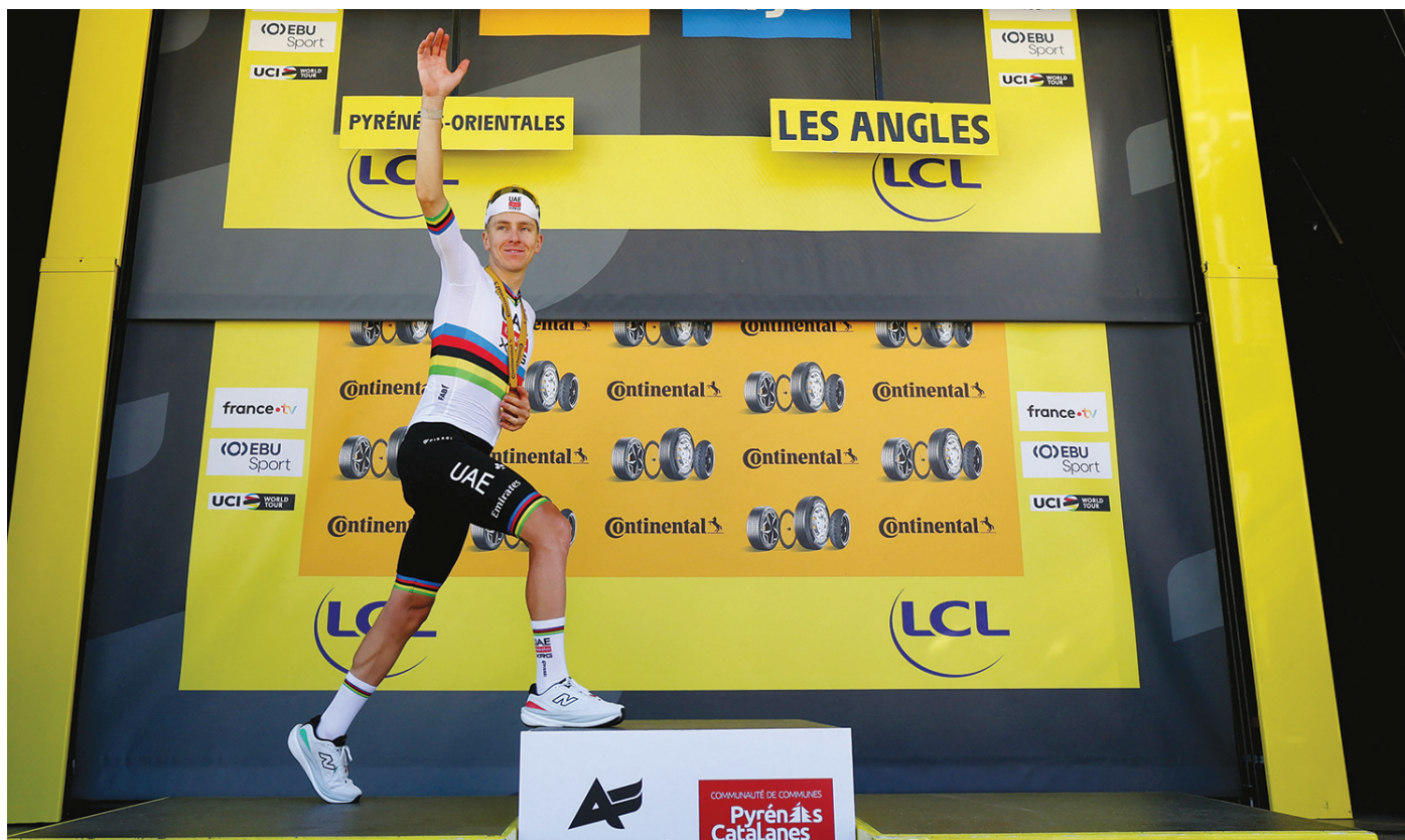
UAE Team Emirates - XRG's Tadej Pogacar celebrates on the podium after winning stage 3 of the Tour de France between Granollers to Les Angles in France yesterday.

VINGEGAARD FINISHES SECOND, CARAPAZ COMES IN THIRD