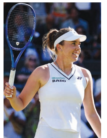
Czech Republic's Linda Noskova celebrates after winning her fourth round match against Madison Keys of the US.

Local fans were in for a treat in the evening when Fery fought past Dimitrov 7-5 3-6 4-6 6-4 7-6(10-7) in nearly four hours to continue his extraordinary journey as the last remaining Briton in the singles draw. Taylor Fritz made swift work of Kazakh 10th seed Alexander Bublik 7-6(1) 6-4 6-4 to reach the quarter-finals for the fourth time in five years at the All England Club.