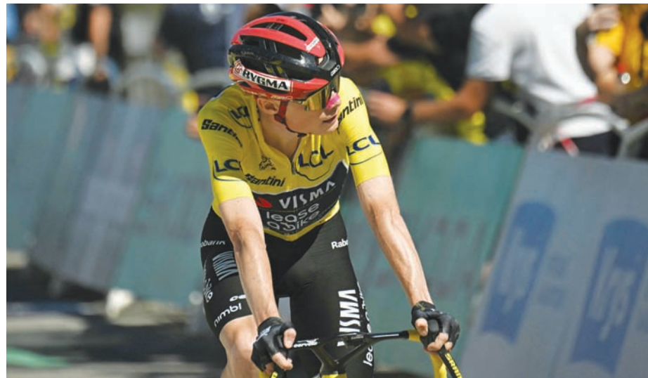
Team Visma | Lease a Bike's Danish rider Jonas Vingegaard cycles past the finish line to take second place in the 3rd stage of the 113th Tour de France yesterday.

A scorching sun bore down on the riders as they started the journey from Spain's Granollers in temperatures of more than 35 degrees Celsius.