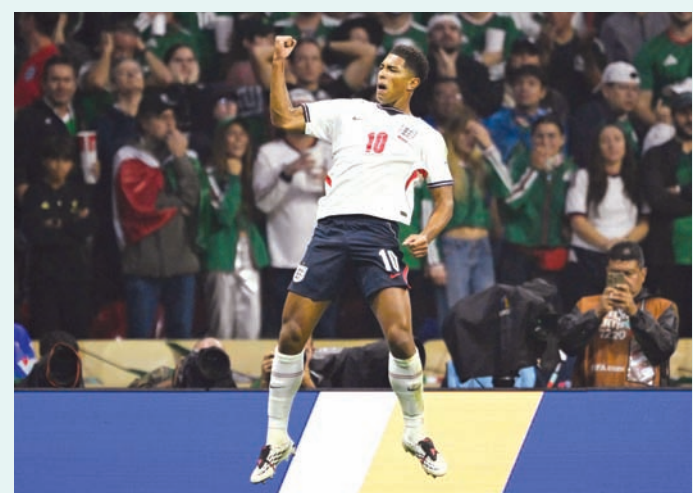
England's midfielder Jude Bellingham celebrates scoring his team's first goal during the World Cup round of 16 match against Mexico at the Mexico City Stadium in Mexico City.

The German called on those at home to revel in the glory of a