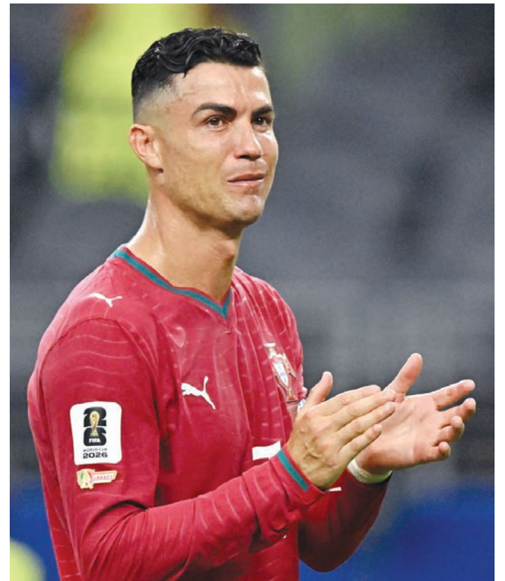
Cristiano Ronaldo looked dejected as Portugal was eliminated from the World Cup yesterday.