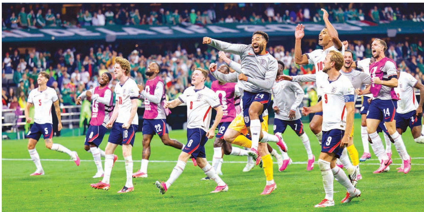
(From Left) England's forward Anthony Gordon, midfielder Elliot Anderson, defender Reece James, midfielder Jude Bellingham and forward Harry Kane celebrate after winning the World Cup round of 16 match against Mexico at the Mexico City Stadium in Mexico City.

But Kane quickly restored England's two-goal lead from the spot before he was then punished for a Mexico penalty, converted by Raul Jimenez. "Referees are just not good enough. The fourth officials are just not good enough. That's the bottom line," raged Tuchel. "VAR overturns a clear and obvious error for the (Mexico) penalty. Was it a clear and obvious error? I think not."