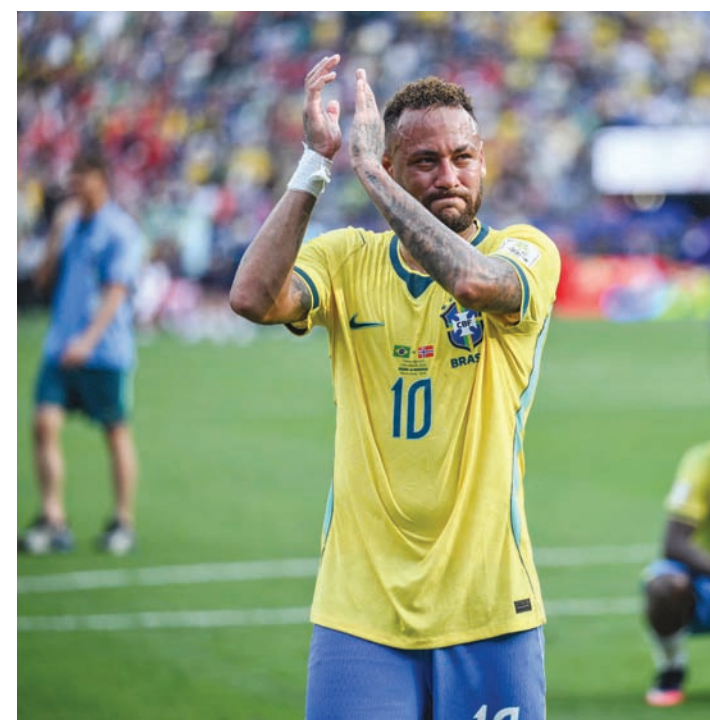
Brazil's forward Neymar reacts after losing the 2026 World Cup round of 16 match against Norway at the New York/New Jersey Stadium in East Rutherford.

Worn down by injuries in recent years, the former Barcelona and Paris Saint-Germain player, now back at first club Santos, was a surprise inclusion in Carlo Ancelotti's Brazil squad for the World Cup. Injury prevented him from