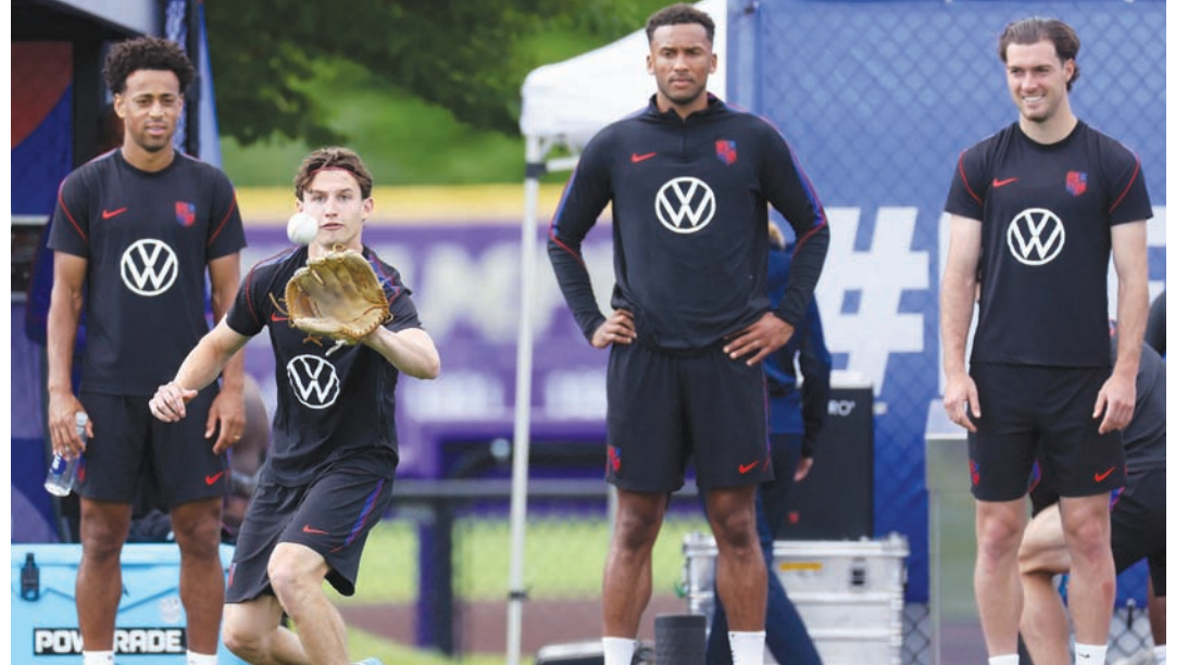
Brenden Aaronson of the United States catches a baseball as Tyler Adams, Auston Trusty and Joe Scally look on during a training session at Husky Soccer Stadium in Seattle.

For Belgium, the tournament may represent the final World Cup act for the country's so-called "Golden Generation," led by Kevin De Bruyne, Romelu Lukaku and Thibaut Courtois.