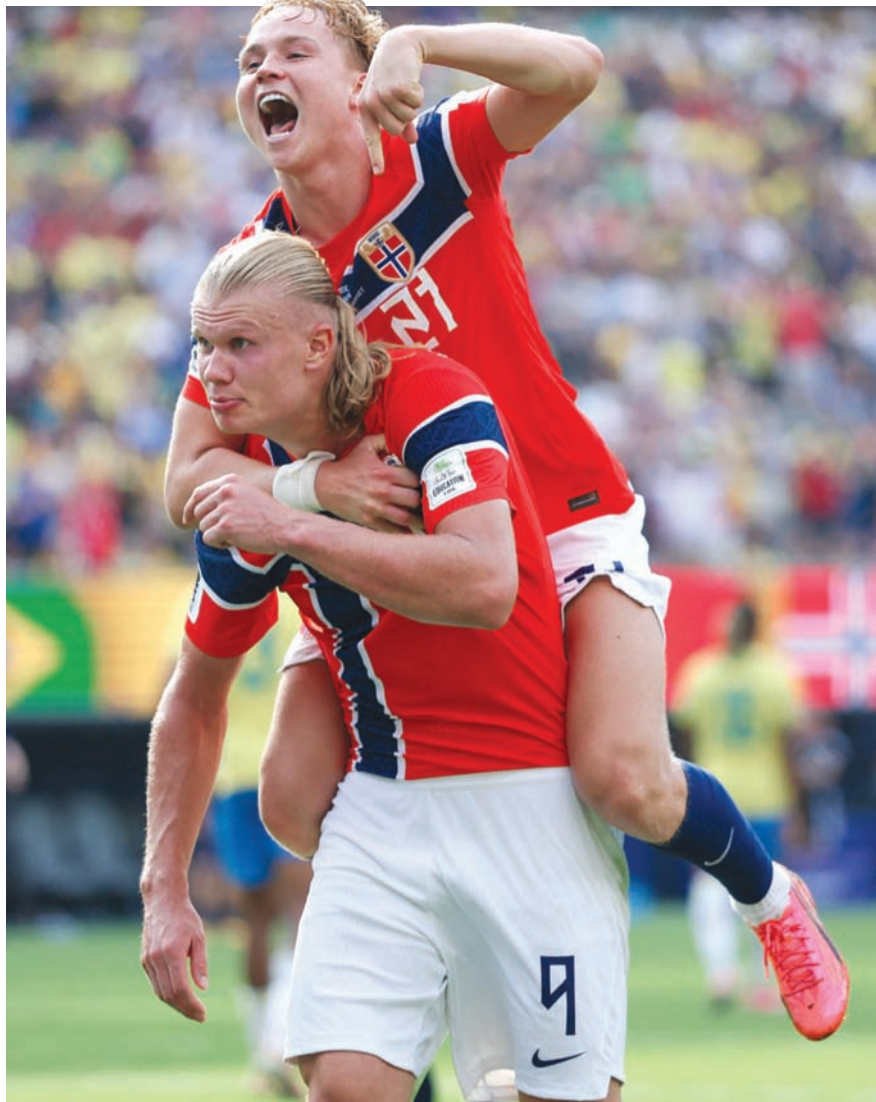
Erling Haaland of Norway celebrates with teammate Andreas Schjelderup after scoring his team's second goal during the FIFA World Cup Round of 16 match against Brazil at New York New Jersey Stadium in East Rutherford, New Jersey, yesterday.

As Brazil desperately chased an equaliser, an incredible fingertip save from a backpedalling Nyland prevented Ajer from looping the ball into his own net. Haaland gave Norway breathing space as he hammered low into the corner from the edge of the box in the 90th minute. It proved vital when Neymar converted a penalty in the 10th minute of stoppage time, preceded by an unseemly spat with 'keeper Nyland, following an elbow on Casemiro.