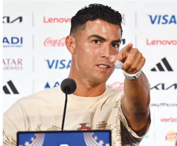
Portugal's forward Cristiano Ronaldo answers to journalists during a press conference at the Dallas Stadium in Arlington, Texas, yesterday, on the eve of the World Cup round of 16 match against Spain.

"Age gives you maturity and experience to see how relative