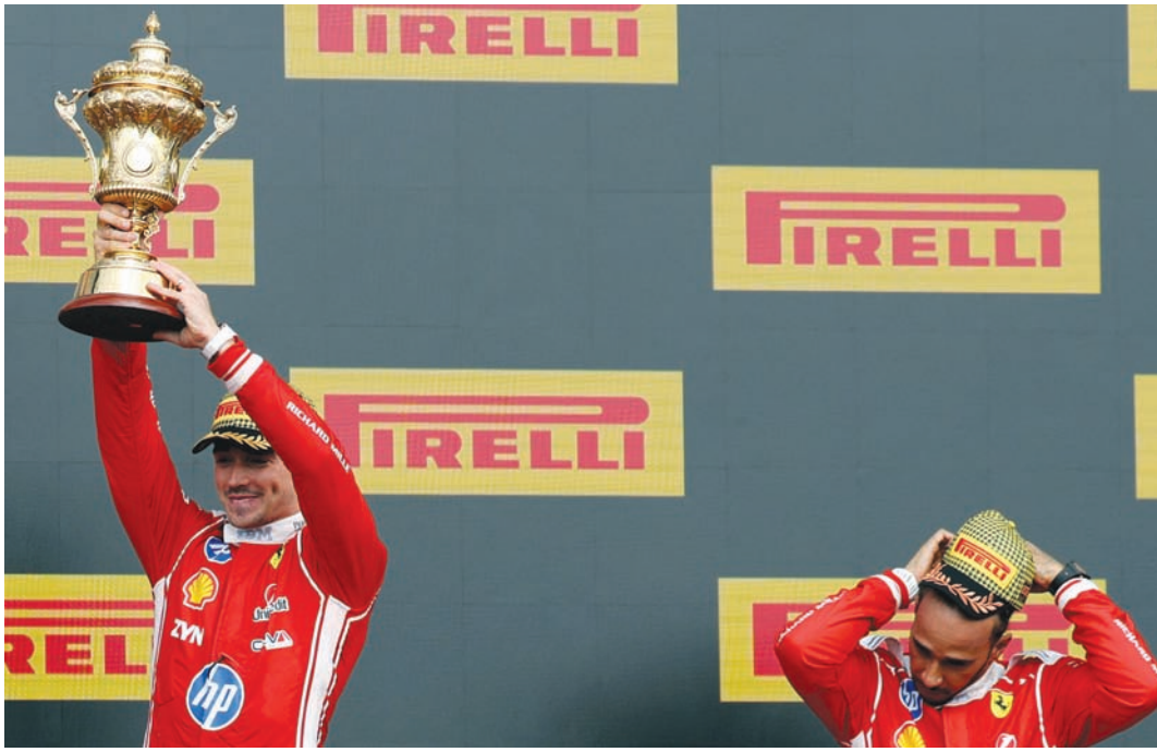
Ferrari's Charles Leclerc celebrates with his trophy on the podium after winning the British Grand Prix along with third-placed Ferrari's Lewis Hamilton at the Silverstone Circuit in Britain yesterday.

"I was unlucky with my puncture, but then very lucky with the Safety Car at the end. It's a shame for the fans to miss the finish."