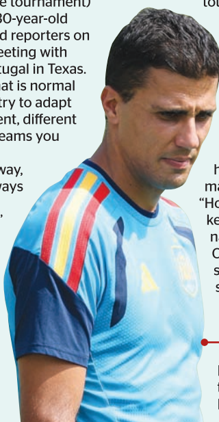
Rodri of Spain looks on during a training session at Cotton Bowl in Dallas, Texas, yesterday.

"This shows us that the respect we have to have for every opponent is massive. Hopefully we can win tomorrow and keeping making history with our national team." Spain lifted the World Cup for the first time in 2010, but then shockingly went out in the group stage four years later. In 2018 and 2022 they exited prematurely, in the last 16.