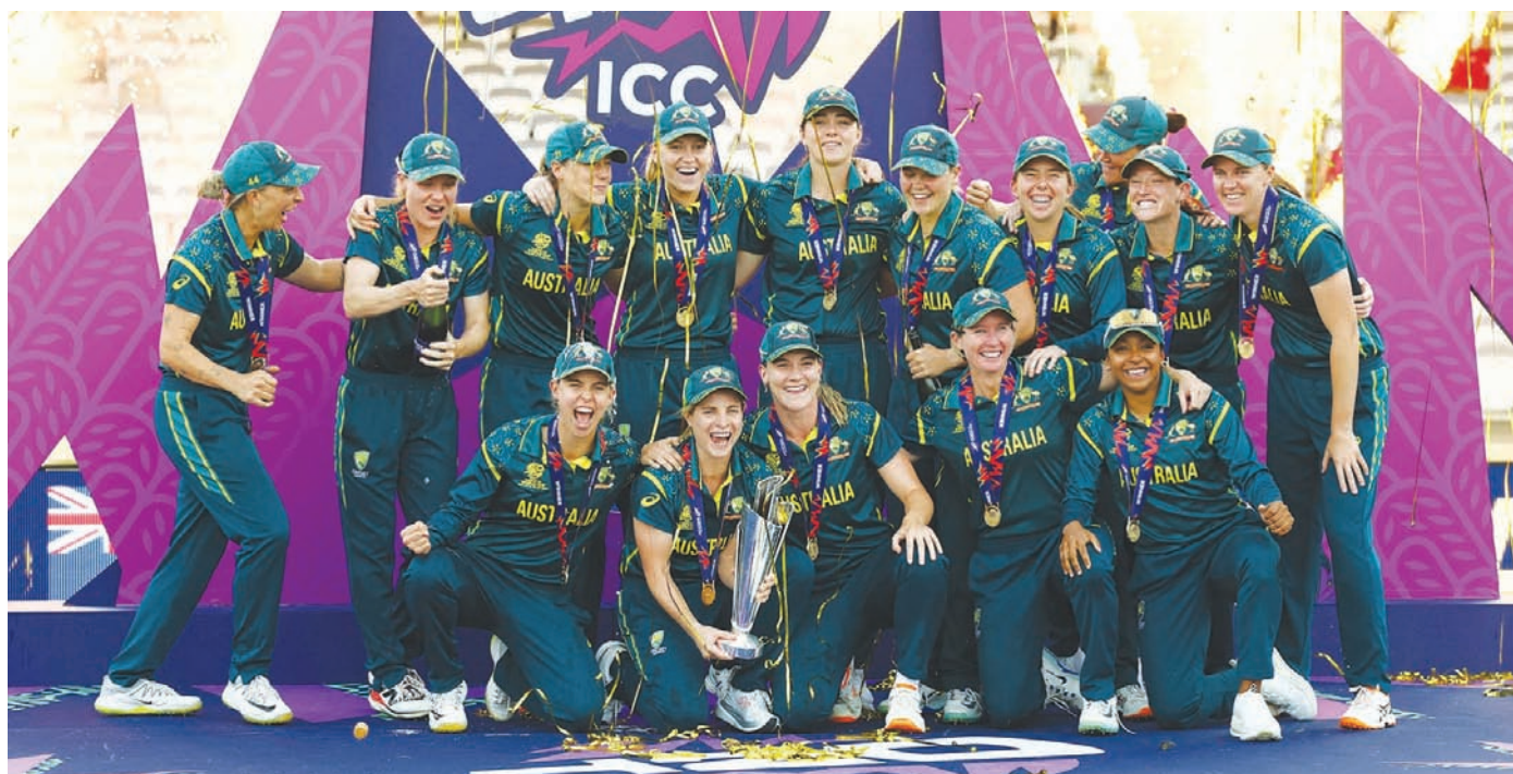
Australia's Sophie Molineux holds the trophy as she celebrates with teammates after winning the ICC Women's T20 World Cup in the final against England at Lord's Cricket Ground in London yesterday.

AUSTRALIA COMPLETE SEVEN-WICKET WIN AT LORD'S