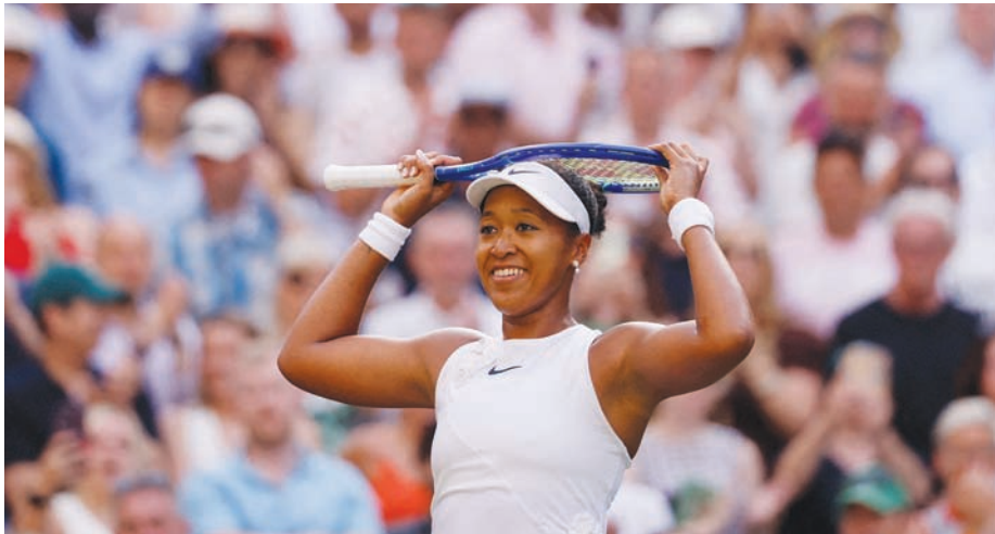
Japan's Naomi Osaka celebrates after winning her fourth round match against Belarus' Aryna Sabalenka yesterday.

first match I've won on this court. It means a lot," Osaka said. "It's been a long time since I've had so much fun on the court and to do it here, really means a lot."