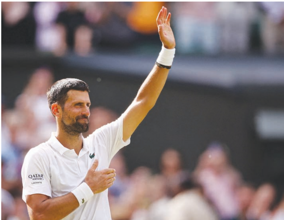
Serbia's Novak Djokovic celebrates beating Russia's Roman Safiullin during their singles match on the seventh day of the 2026 Wimbledon Championships yesterday.