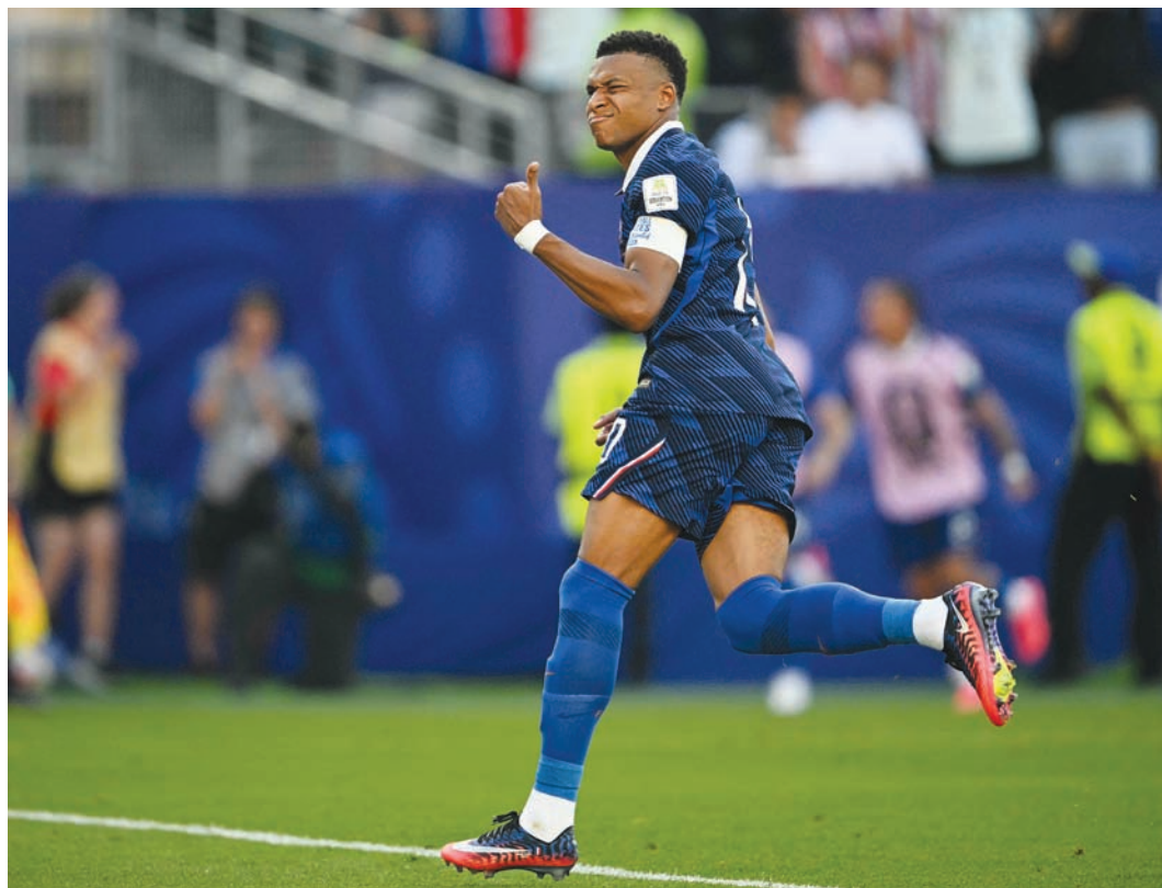
France's forward Kylian Mbappe celebrates scoring his team's first goal during the World Cup round of 16 match against Paraguay at the Philadelphia Stadium in Philadelphia.

"It wasn't easy. They used every resource possible. It is maybe not the kind of football that brings