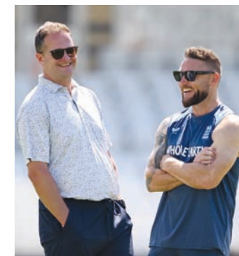
Rob Key (left) with Brendon McCullum