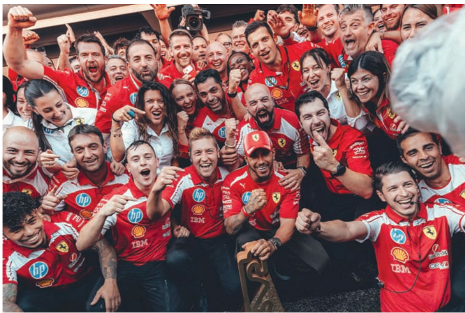
Lewis Hamilton with his Ferrari backroom staff.

"It is going to be hot, which is their only downfall... I expect we're going to have a cou-