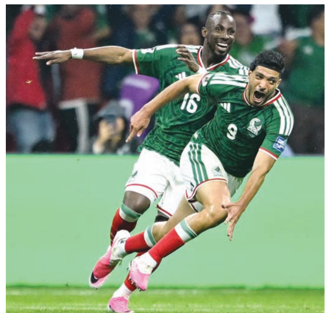
Mexico's forward Raul Jimenez celebrates next to teammate Julian Quinones after scoring his team's second goal during the 2026 World Cup round of 32 match against Ecuador at the Mexico City Stadium in Mexico City.

From the quarter-finals onwards, all the matches at the World Cup will be taking place in the United States.