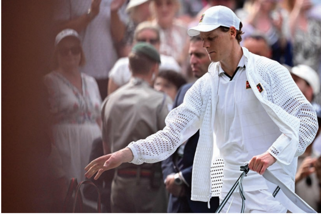
Italy's Jannik Sinner takes his things to leave the court after winning against Portugal's Nuno Borges on the third day of the Wimbledon Championships at The All England Lawn Tennis and Croquet Club, southwest London, yesterday.

Kessler had two set points at 5-3 and another two in the tiebreak but four-time Grand Slam champion Sabalenka raised the intensity levels to set up a third-round fire-fight against big-hitting Latvian Jelena Ostapenko. Sabalenka gave herself eight out of 10 for her first-round win over Teodora Kostovic