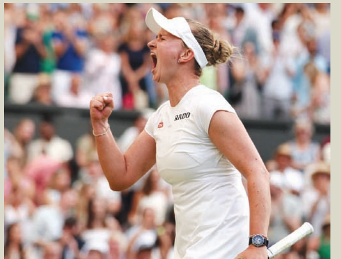
Czech Republic's Barbora Krejckikova celebrates winning her second round match against Russia's Mirra Andreeva.

London: French Open champion Mirra Andreeva suffered a shock defeat against Barbora Krejckikova in the Wimbledon second round on Wednesday. Andreeva arrived at the All England Club hailed as one of the sport's rising stars after winning her maiden Grand Slam crown in Paris in June.