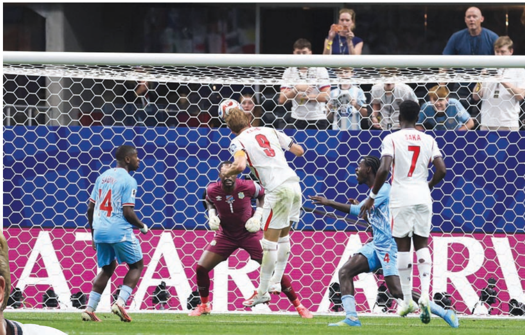
Harry Kane of England heads to score the team's first goal during the FIFA World Cup 2026 Round Of 32 match against DR Congo at Atlanta Stadium in Atlanta, Georgia, yesterday.

Moments later Marcus Rashford's powerful effort was blocked on the line by London-born Aaron Wan Bissaka after Noni Madueke's jinking run opened up the Congo defence.