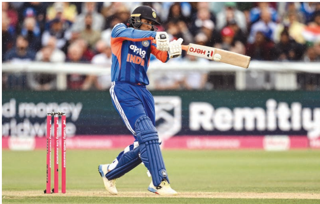
India's Abhishek Sharma plays a shot during the first Twenty20 match against England at the Riverside Ground in Chester-le-Street, north-east England yesterday.

100 T20 international sixes. He is the quickest player to reach the milestone off 785 balls.