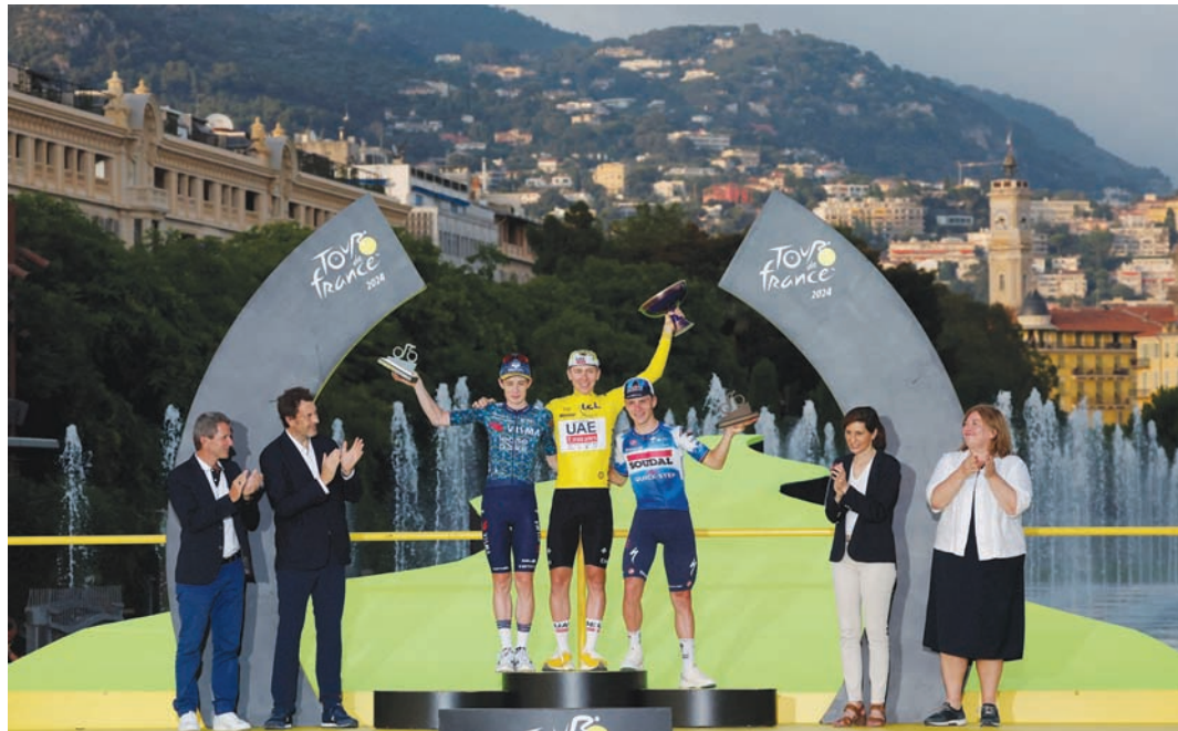
UAE Team Emirates' Tadej Pogacar celebrates on the podium wearing the yellow jersey with a trophy after winning the Tour de France alongside second place Team Visma | Lease a Bike's Jonas Vingegaard and third place Soudal Quick-Step's Remco Evenepoel on July 21, 2024.

"It gave us a huge boost and reinforced the feeling that we can win the Tour."