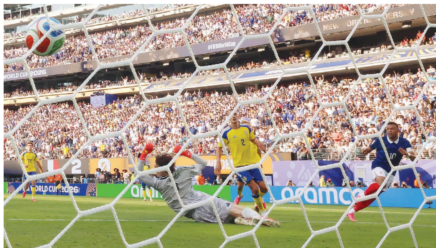
France's forward Kylian Mbappe scores his team's third goal during the 2026 World Cup round of 32 match against Sweden at the New York/New Jersey Stadium in East Rutherford on Tuesday.

Mbappe's 18 career World Cup goals have come in 18 matches