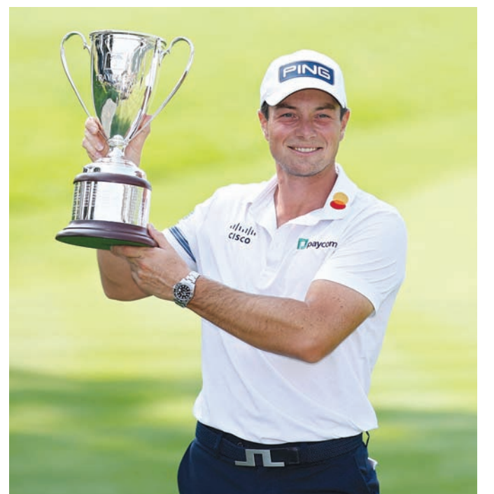
Viktor Hovland of Norway poses with the trophy after winning the Travelers Championship 2026 in a playoff at TPC River Highlands in Cromwell, Connecticut, yesterday.

Scheffler fired a two-under 68 in the final round while Hovland shot 69 after a late-afternoon storm halted play for 83 minutes,