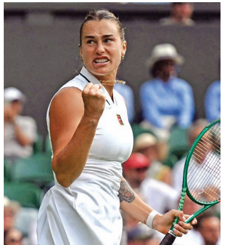
Belarus' Aryna Sabalenka celebrates beating Serbia's Teodora Kostovic in the first round yesterday.