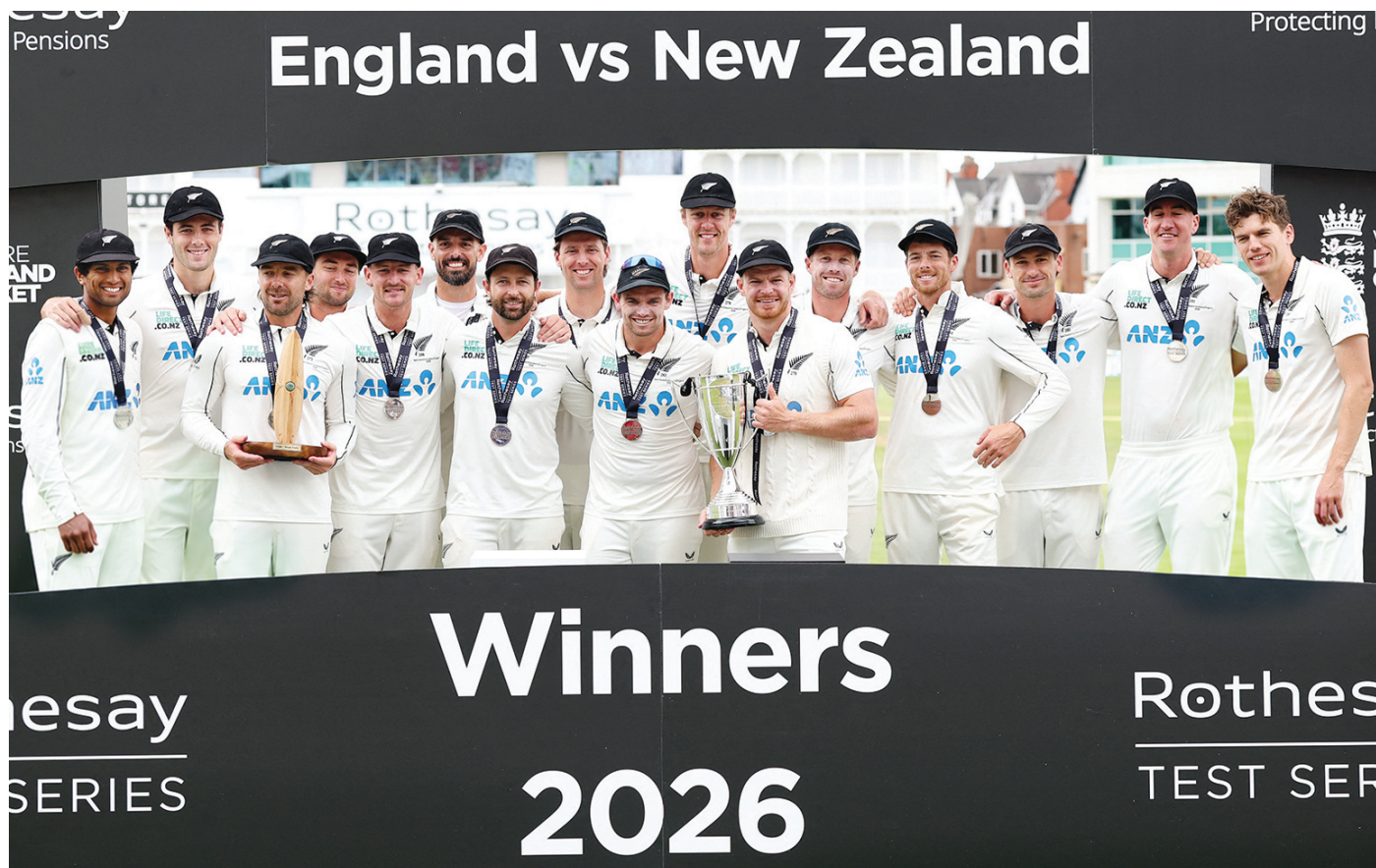
New Zealand's Glenn Phillips celebrates with the trophy alongside teammates during the trophy ceremony after the third and final Test against England at Trent Bridge Cricket Ground, Nottingham, Britain, yesterday.

NEW ZEALAND WRAP UP 160-RUN WIN IN THIRD AND FINAL TEST