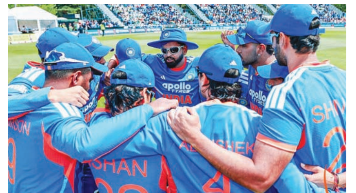
India players in a huddle during the second T20 against Ireland in Belfast on Sunday.