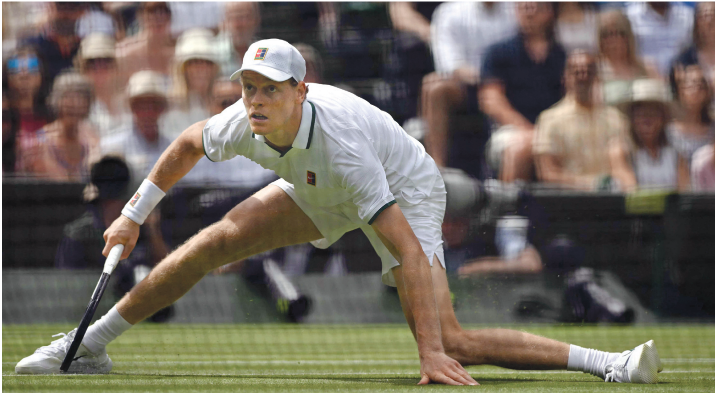
Italy's Jannik Sinner returns the ball to Serbia's Miomir Kecmanovic during their first-round match at The All England Lawn Tennis and Croquet Club in Wimbledon, southwest London, yesterday.

Sinner taken to five sets by Kecmanovic, defeats for Rublev and Ruud as Sabalenka through