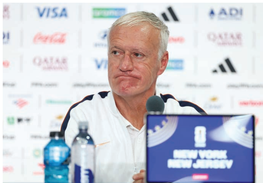
France's coach Didier Deschamps highlighted Sweden's athleticism, pace on the counter and threat from set pieces ahead of today's last 16 clash in New Jersey.

Les Bleus were one of only three teams to take the maximum nine points in the group