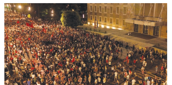
This aerial photograph shows people demonstrating in front of the prime minister's office in Tirana against a planned resort linked to US president's family.