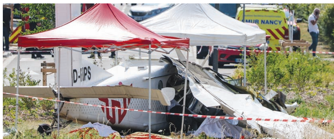
A view of the small plane that crashed in Tomblaine, France, yesterday.