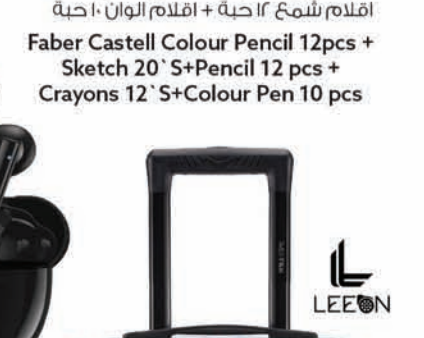
ايربودز Lenovo Lp12 Airpod HT06/