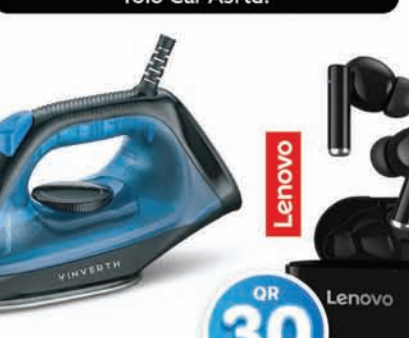
مكواة بخار فينفرث ١٤٠٠ مل - ١٢٠٠ واط، طلاء سيراميك مزيج الطبقات، متعددة الألوان Ververth Steam Iron 140ml-1200w 2 Layer Ceramic Coating Multi Color