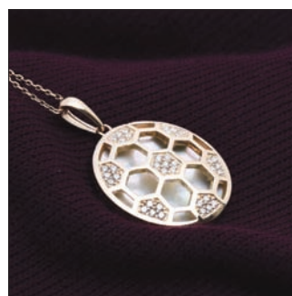
Midas FIFA 2022 necklace.

nated by the artistic possibilities embedded within the Arabic script itself.