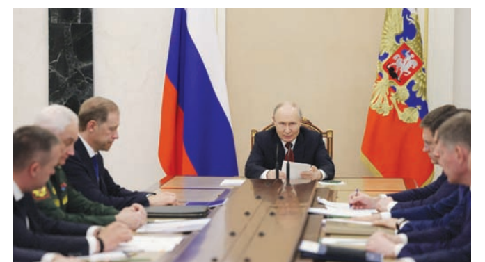
Russian President Vladimir Putin chairs a meeting on securing fuel supplies for the domestic market in Moscow, yesterday.

Brussels and Moscow will be watching to see how events play out in the coming weeks. The EU has condemned the use of force against peaceful protesters. It has also raised worries about press freedom and the independence of the judiciary.