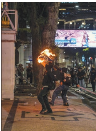
A student throws a fire box at riot police during anti-government protest in Surabaya on Friday.

Protests erupted in several Indonesian cities this month after the government hiked prices of non-subsidised gasoline by around 30%, seeking to alleviate budget