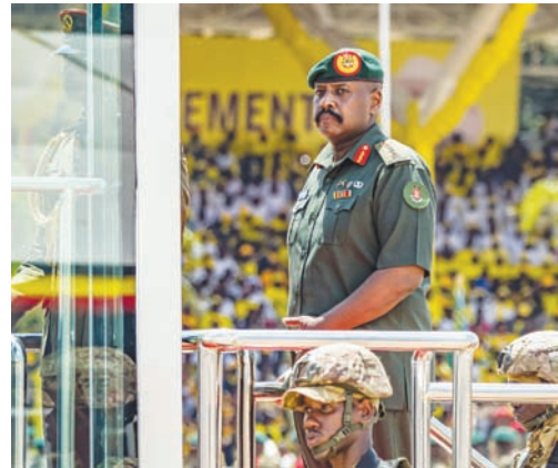
This picture taken last month shows Kainerugaba inspecting a military parade from a vehicle during the inauguration ceremony of his father, who was re-elected as president, at the Kololo Ceremonial Grounds in Kampala.