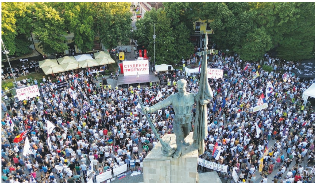
A drone picture shows people gathering for a protest, as part of a nationwide anti-government movement triggered by the deadly collapse of the Novi Sad railway station canopy in November 2024, following Serbian President Aleksandar Vucic's resignation announcement, in Kraljevo, yesterday.

What began as demands for justice for the dead later morphed into calls for the president to step