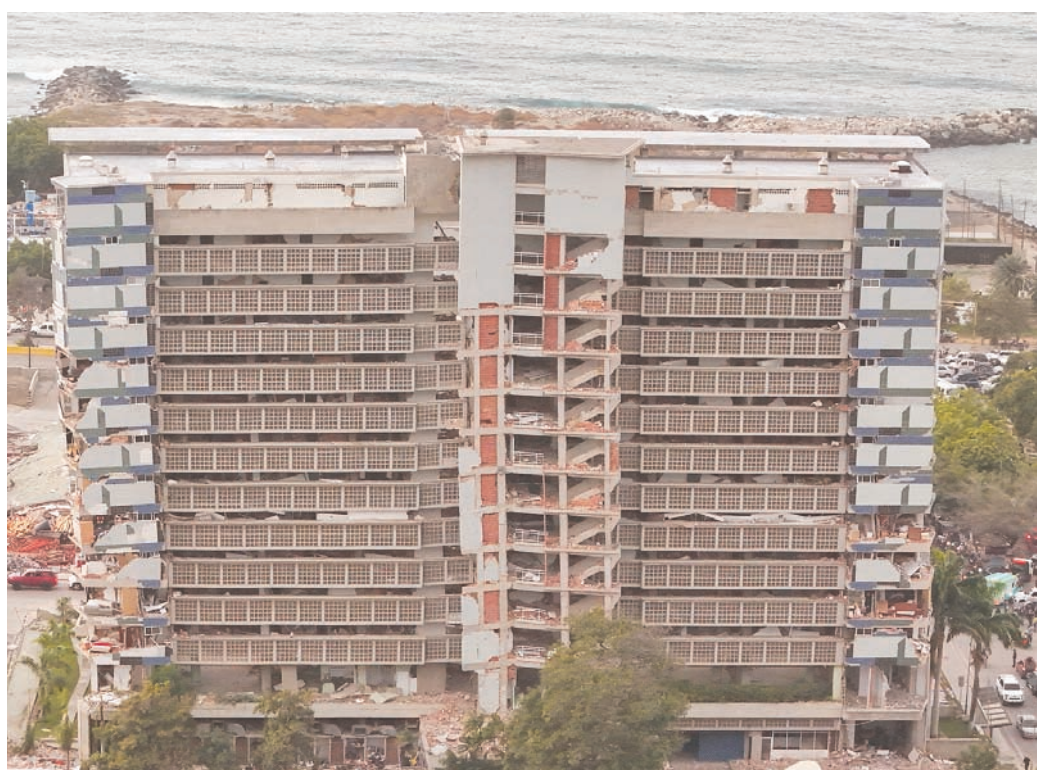
A drone view of the buildings destroyed by earthquakes, in La Guaira.

There was joy in the hardest-hit coastal area of La Guaira, north of Caracas, when locals pulled an infant alive out of the wreckage on Friday, some 32 hours after the