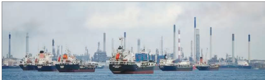
Ships are seen anchored in front of a refinery on Singapore's Bukom Island. About a quarter of the world's seaborne oil trade passes through the Malacca Strait, a choke point on the route between West Asia and the energy-hungry economies of East Asia.

By law, the British monarch is not obliged to pay income, capital gains or inheritance tax. In 1993 Queen Elizabeth agreed to voluntarily pay income tax at a time when the monarchy's public standing had suffered after the "annus horribilis" when Charles formally separated from his first wife, the late Princess Diana, Andrew Mountbatten-Windsor split from his wife Sarah Ferguson, and Princess Anne divorced her first husband. The amount she paid was never disclosed. As heir, Charles had also voluntarily paid an undisclosed amount of tax. Revealing these amounts for the first time on Friday, royal officials said Charles had paid £12.9mn in 2024/25, £11.7mn in 2023/24, and more than £30mn in total since becoming king. This placed him in the top 100 taxpayers in the UK, they said. However, no breakdown of the tax calculation was provided. Likewise, William's office revealed the prince had paid £7.76mn in 2024/25, and £8.34mn in 2023/24. He had paid more than £20mn in tax since becoming the heir and Prince of Wales.