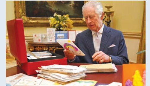
Britain's King Charles reads cards and messages, sent by well-wishers following his cancer diagnosis, in the 18th Century Room of the Belgian Suite in Buckingham Palace, London, Britain, in February, 2024.

King Charles has become the first British monarch to reveal how much tax he pays, providing the most detailed insight yet into royal finances.