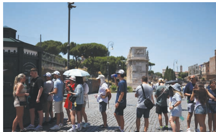
People queue to fill water bottles at a water dispenser, with the Arch of Constantine in the background outside the Colosseum, during a heatwave in Rome, yesterday.

In France, the highest-level heat alerts were expected to ease yesterday evening, although millions continued to endure sweltering conditions.