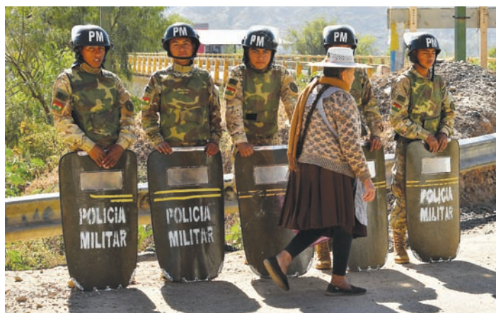
Military personnel stand while a woman walks past following nationwide state of emergency in Cochabamba.

the temporary breakdown of the final roadblocks, insisting the move was "not a surrender."