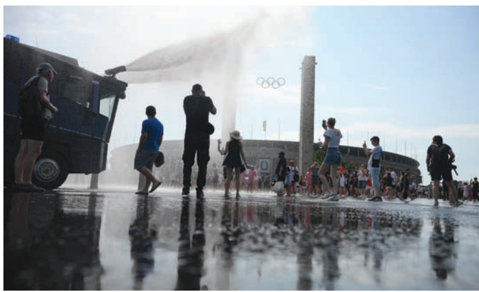
Police use water cannon to spray people with water as they arrive at the Olympic stadium for a concert of US singer Bruno Mars yesterday, in Berlin, as the German capital is expected to reach temperatures of around 40 degrees Celsius during a heatwave in Europe.

This heatwave is the most severe ever recorded in Europe, and would have been "virtually impossible" in June without climate change, the World Weather At-