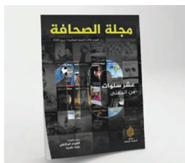
Cover page of the 41st Issue.