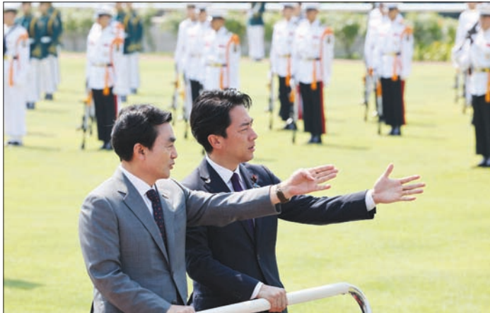
Japanese Defence Minister Shinjiro Koizumi and Korean Defence Minister Ahn Gyu-back inspect honour guards during a welcoming ceremony before their meeting at the Defence Ministry in Seoul, yesterday.

minister Shigeru Ishiba and President Lee agreed to closer security and economic ties, and the defence ministers committed to working with Washington against North Korea's nuclear threat and Pyongyang's growing military ties with Russia, including cooperation on AI and unmanned systems and annual trilateral drills.