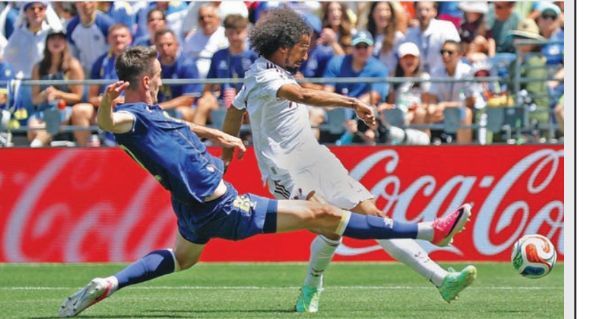
At the World Cup, Akram Afif struggled heavily in physical duels, winning only 41.7% of them (5 out of 12). He was dispossessed 4 times and managed to win 4 fouls.

"The younger generation must take their example and learn from their professionalism and behaviour. Hopefully, that will help Qatar have another opportunity like this in the future. I do not know when it will happen again, but I hope it does."