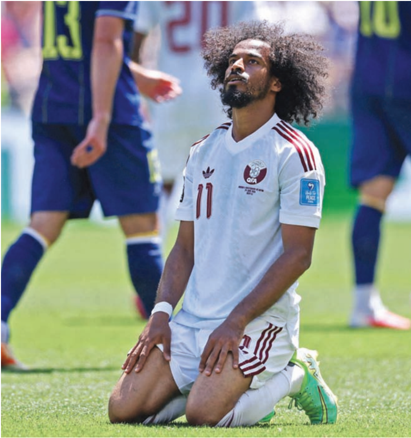
Qatar's forward Akram Afif reacts after a missed chance during the FIFA World Cup match against Bosnia and Herzegovina in Seattle on Wednesday.

Afif also found himself battling physically against defenders, winning just five of his 12 duels and being dispossessed four times as opponents focused much of their