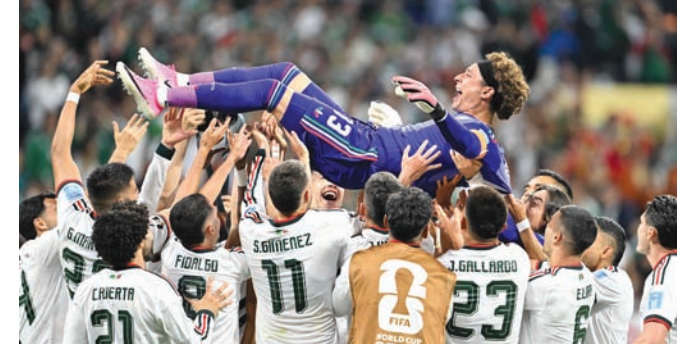
Mexico's players lift up goalkeeper Guillermo Ochoa after winning the World Cup Group A match against Czech Republic at the Mexico City Stadium in Mexico City.

They are already daring to talk about the prospect of a long-awaited return to the World Cup quarter-finals. Mexico have only reached that stage twice - in 1970 and 1986. When they were hosts.