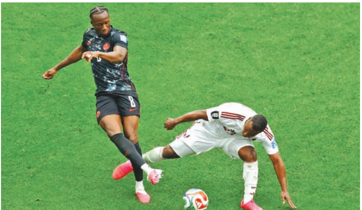
Assim Madibo was sent off during Qatar's 6-0 defeat on June 18 following a foul which resulted in Canada's Ismael Kone sustaining a broken leg.