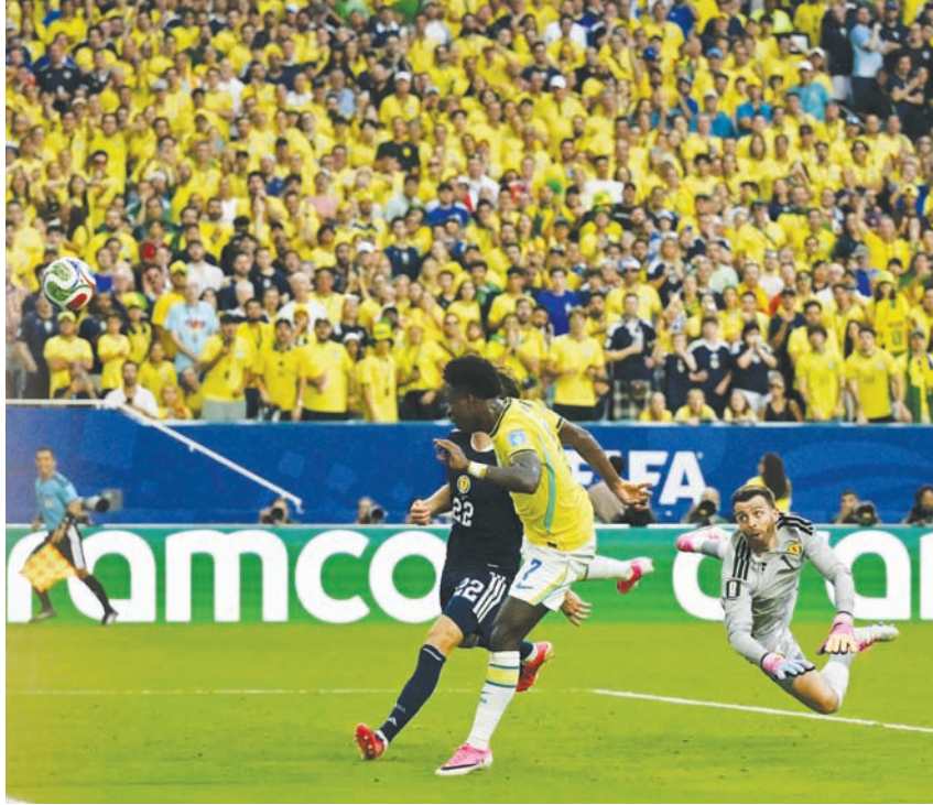
Brazil's Vinicius Junior heads the ball to score against Scotland during the World Cup Group C match in Miami Gardens on Wednesday.

"I always say I am not that bothered about numbers. I am not used to scoring so many goals, but the coach has moved me into a position to which I have adapted