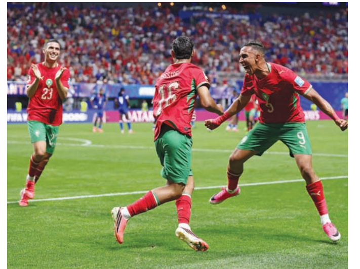
Morocco twice came from behind to beat Haiti 4-2 and finish second to Brazil in Group C on goal difference. A clash against the Netherlands, Japan or Sweden awaits in Monterrey on Monday.

The coach said before the match they were hoping to edge Brazil out of first place in Group C, but in the end, their 4-2 win