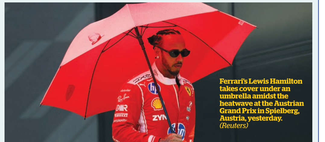
Ferrari's Lewis Hamilton takes cover under an umbrella amidst the heatwave at the Austrian Grand Prix in Spielberg, Austria, yesterday.

"With the engine, it's not the whole step, but it's one foot forward," he added. "And that's what we have got to keep doing." Hamilton's maiden win for Ferrari and record-increasing 106th of his career in Spain lifted him to second in the drivers' title race, 41 points adrift of series leader Italian teenager Kimi Antonelli of Mercedes.