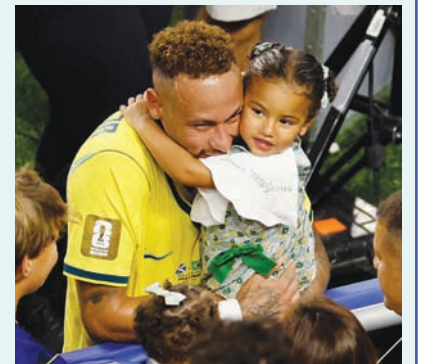
Neymar celebrates with his daughter after Brazil's win over Scotland.

Brazil's all-time top scorer with 79 goals, Neymar has now appeared in four World Cups, with eight goals and four assists in tournaments since 2014. "I had