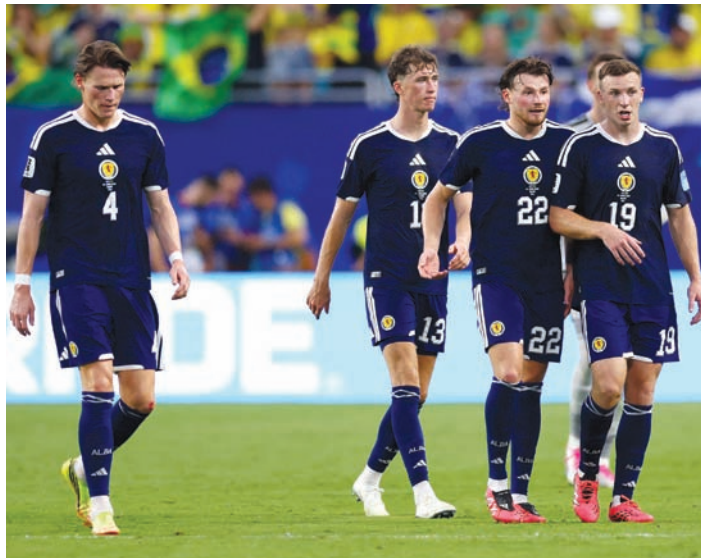
Scotland, who have been hoping to reach the knockout rounds at a World Cup for the first time after eight previous failed attempts, finish third in Group C with three points.

They will return to their tournament base in Charlotte, North Carolina and wait until Saturday, when all the group-stage games are completed, to discover their fate. Scotland had been hoping to