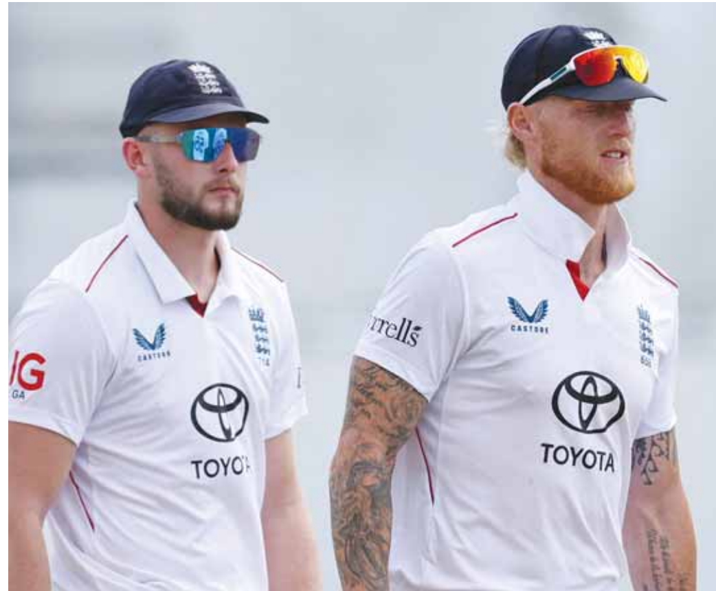
England's Gus Atkinson (left) and England's captain Ben Stokes leave the field for lunch on the second day of the four day Test against Zimbabwe at Trent Bridge in Nottingham on May 23, 2025. Stokes and Atkinson have been dropped from the squad for next week's second Test against New Zealand.

England enjoyed a 115-run victory in the first Test, with Atkinson taking five wickets in New Zealand's second innings, but that positive result has now been overshadowed by another embarrassing incident for the ECB.