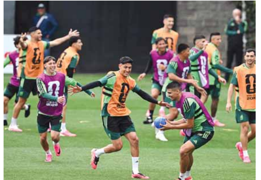
Mexico's players take part in a training session in Mexico City, on the eve of their World Cup opening match against South Africa.

He said ensuring Iran's participation de-