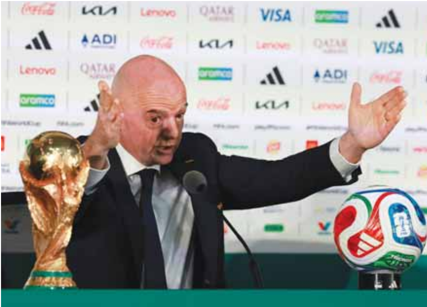
Asked whether visa-related controversies had made him regret selecting the US as one of the host nations, FIFA President Gianni Infantino said he had no regrets.

Infantino was asked by a British reporter