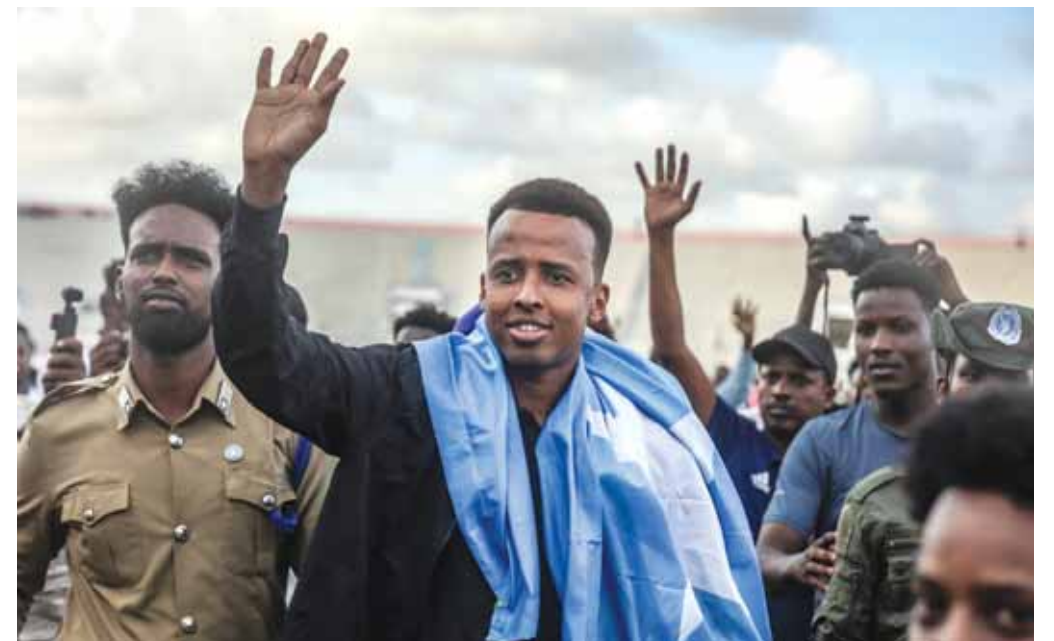
Somali referee Omar Abdulkadir Artan waves to supporters while draped in the Somali flag as he is welcomed ahead of a solidarity match after returning to Somalia in Mogadishu yesterday.