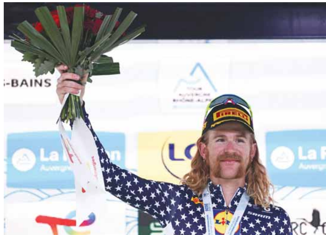
Lidl-Trek's US rider Quinn Simmons celebrates his victory on the podium after winning the 4th stage of the Tour Auvergne-Rhone-Alpes cycling race (formerly known as the Criterium du Dauphine), 167.4km between Le Puy-en-Velay and Montrond-les-Bains, central France, yesterday.

"I've never won a sprint before, so that's pretty cool," said Simmons, who described the win as payback for his efforts training in