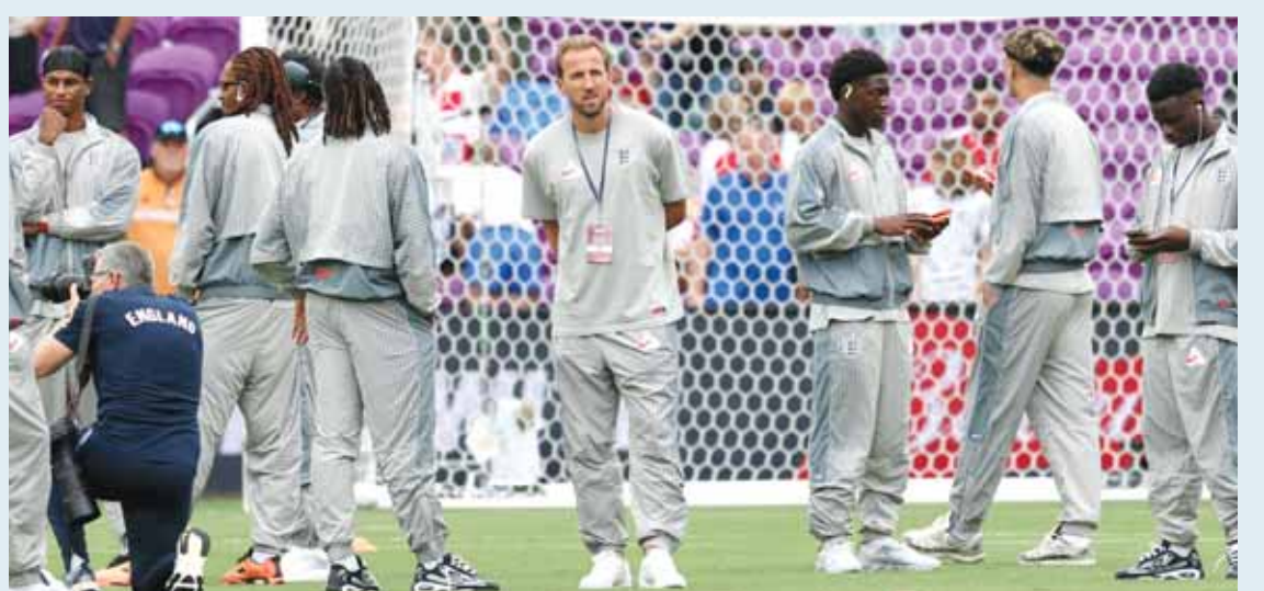
England's Harry Kane walks on the pitch before their friendly against Costa Rica in Orlando yesterday.

friendly before a Group L opener against Croatia in Dallas on June 17. When asked what he would say to the current squad, the 59-year-old Gascoigne added: "Enjoy it. Because you just never know it could be your last World Cup." Gascoigne famously burst into tears after being booked in the 1990 semi-final meaning he would have been suspended from the final had England qualified. His life has been blighted by addiction problems but Gascoigne, speaking following the publication of his new autobiography, said: "Everything's going well for us. It's probably the happiest I've been in about five years, definitely, you know." Turning to his autobiography, he said: "A lot of people have come up (to me) and said they've read it and (it's) saved their life. If that book can save one person's life, then I've done my job," with Gascoigne joking: "I think I should read it myself, you know! Do myself a favour." He added: "Every morning, I don't think about tomorrow because that's another day. I just try to keep it in the day, keep it simple. Some days I find it hard."