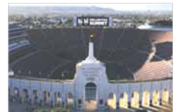
Ceremonial lighting of the cauldron ahead of ticket registration launch at the LA Memorial Coliseum, on January 13, 2026.