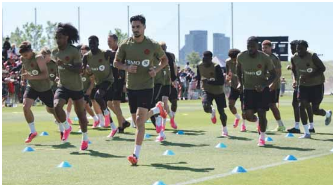
Canada's has lost all six matches across the 1986 and 2022 World Cup.