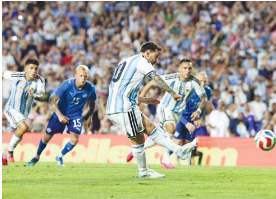
Lionel Messi converts penalty against Iceland during a World Cup warm-up game to become Argentina's oldest goalscorer at the age of 38 years and 11 months, two months older than Angel Labruna, who had held the previous record since 1957.

The expectant crowd had to wait until the final quarter for Messi to make his appearance. With his first involvement, Messi's brilliant pass played in Martinez, who was wiped out by