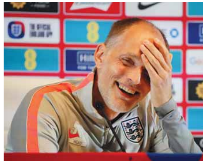
England manager Thomas Tuchel is all smiles during a press conference in Palm Beach Gardens, Florida, US.

Delays were prominent feature of the Club World Cup in the United States 12 months ago and could have a major impact on the largest ever World Cup, which begins today.