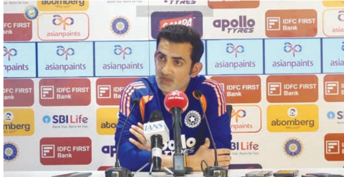
India coach Gautam Gambhir answers a question during a press conference in New Chandigarh yesterday.

"The responsibility is to play for India - the rest, everything else, is a by-product," Gambhir told