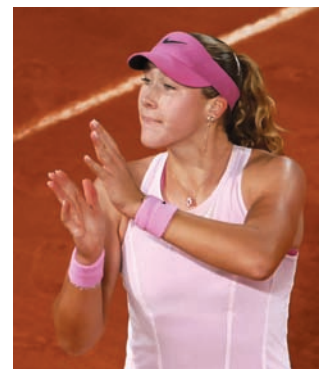
Russia's Mirra Andreeva celebrates after winning her semi-final against Ukraine's Marta Kostyuk.