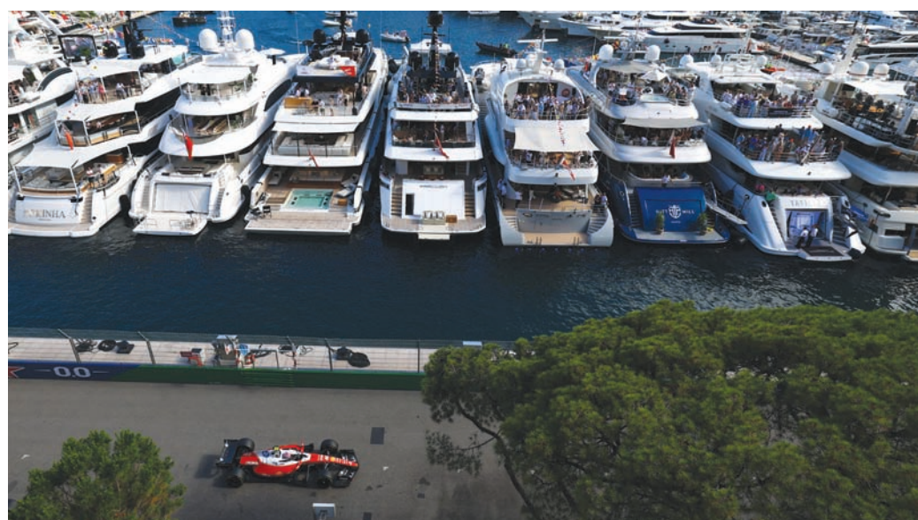
Ferrari's Lewis Hamilton, seven-time world champion, during practice at Monaco Grand Prix at Circuit de Monaco, Monaco, yesterday.

Isack Hadjar recovered from a crash during opening practice to finish sixth in the second Red Bull ahead of Oscar Piastri of McLaren,