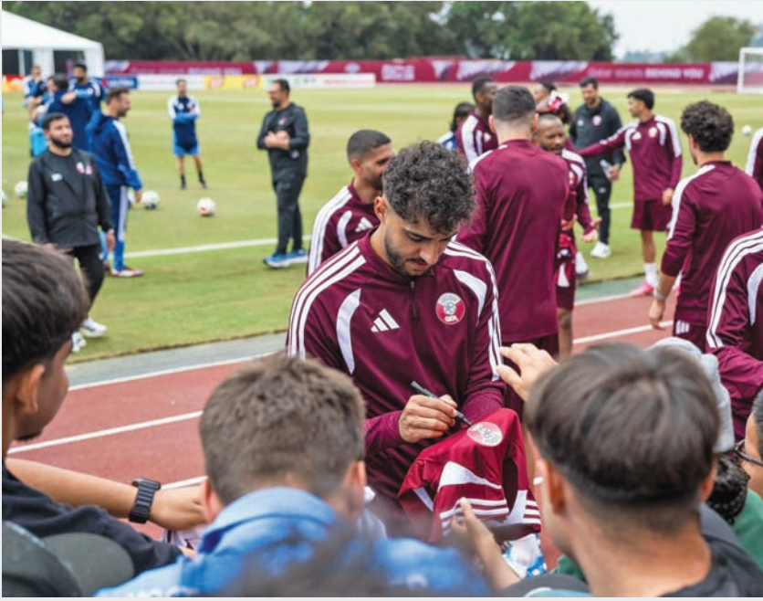
Qatar players drew warm reception from fans during the open training session in Santa Barbara, California. RIGHT: Qatar coach Julen Lopetegui signs autographs for fans.

Qatar have been training in Santa Barbara following a narrow 1-0 defeat to Ireland in Dublin last month. The camp has focused on fine-tuning tactics and integrating several new faces, with 12 players in the 26-man squad set to make their World Cup debuts. After their opening fixture against Switzerland, Qatar will then face co-hosts Canada in