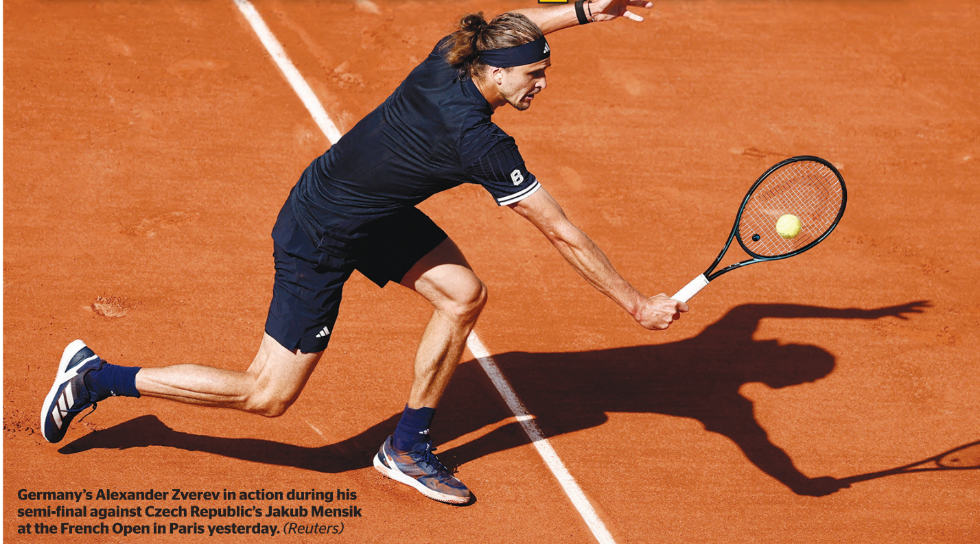
Germany's Alexander Zverev in action during his semi-final against Czech Republic's Jakub Mensik at the French Open in Paris yesterday.