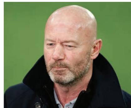
Alan Shearer led England at the 1998 World Cup and remains the Premier League's all-time top scorer.

"We're fortunate we've got the best league in the world here in the Premier League in England."