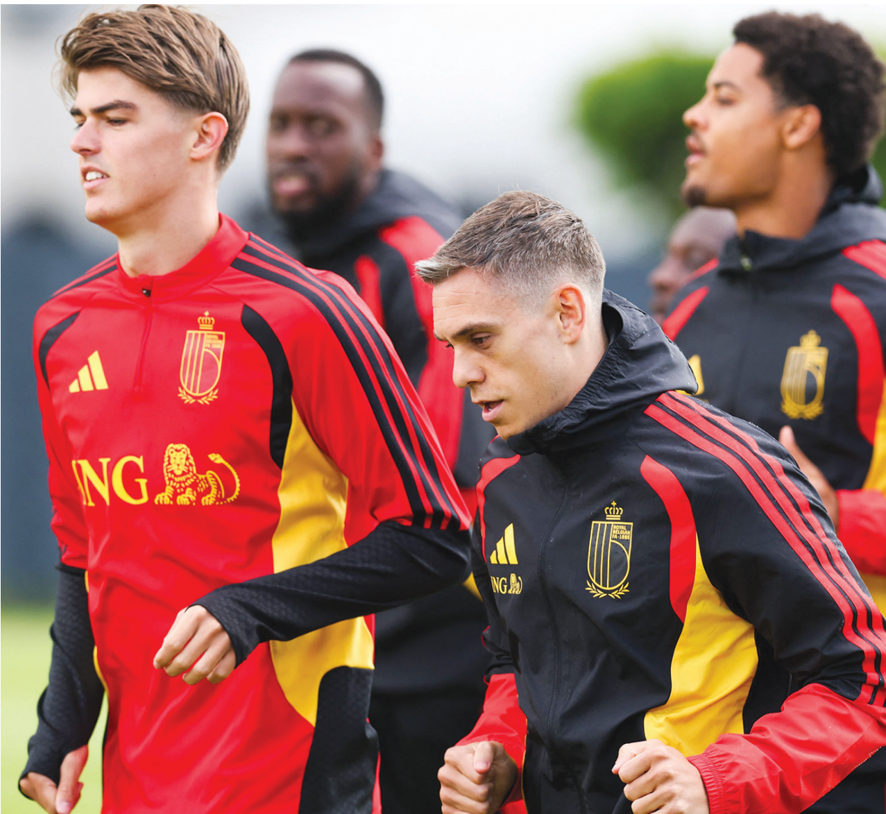
Belgium's Leandro Trossard and Charles De Ketelaere (left) take part in a training session on the eve of their friendly game against Tunisia as part of their preparation for the FIFA World Cup, in Brussels, yesterday.

ing the 33-year-old too quickly as he continues his recovery.