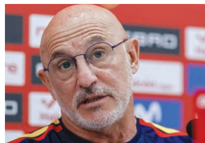
Tomorrow we're in the United States, and that puts our focus exactly where it needs to be."

"Now we enter a new phase with more intensity and more players contributing.