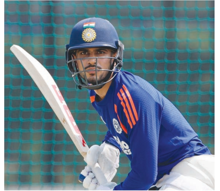
India Test captain Shubman Gill bats during a team training session in New Chandigarh yesterday. India take on Afghanistan in a one-off Test starting today.

"Our focus is on, cliché as it sounds, is really our control - it's what we need to do."