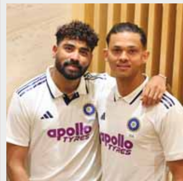
Fast bowler Mohammed Siraj and opener Yashasvi Jaiswal during the team photoshoot. RIGHT: Opening batsman KL Rahul, who has played 67 Tests, is also part of the squad.