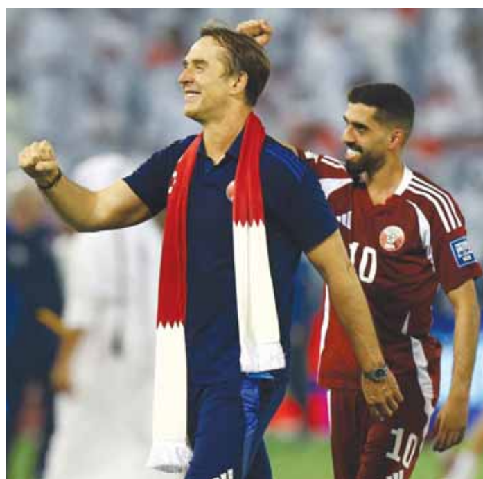
Hassan al-Haydos retired in March 2024, before reversing his decision a year later at the request of head coach Julien Lopetegui.

"The decision to retire from international football was not an easy one, and neither was the decision to return. At that time, however, I felt the team needed me, particularly in the dressing room, and that played a big part in my decision. As a player, the biggest difference now is the experi-