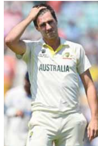
World Cup as he dealt with a nagging back injury.

Cummins played only the Adelaide Ashes Test in the last home summer and skipped the T20