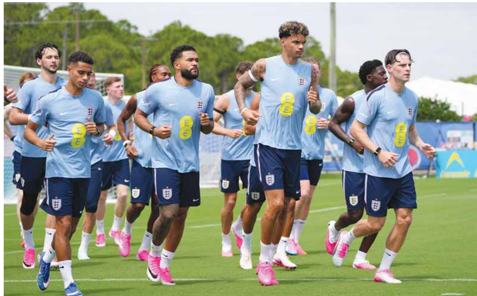
England have set up camp in Palm Beach, Florida, ahead of friendlies against New Zealand on Saturday and Costa Rica next week.

Tuchel's side open their campaign against Croatia in Dallas on June 17