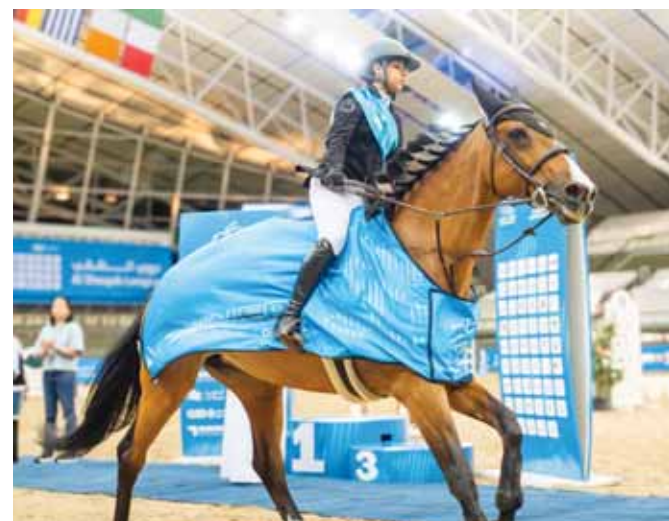
The final round is expected to play a decisive role in crowning this season's Al Shaqab Showjumping League champions.