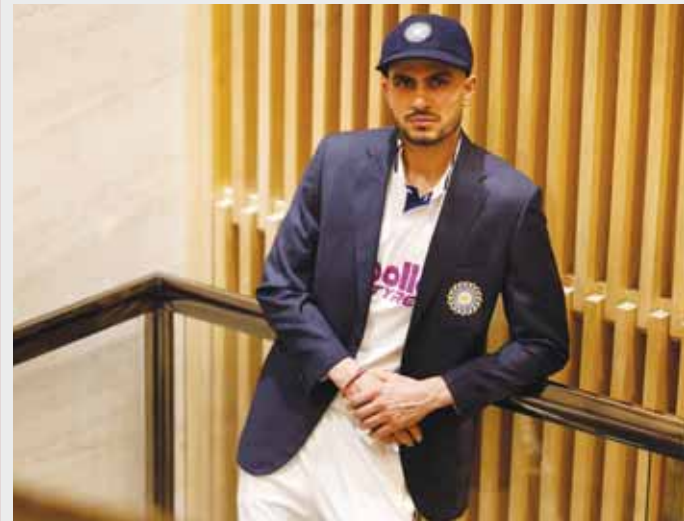
India's Test captain Shubman Gill strikes a pose for the camera during a team photoshoot ahead of the one-off Test against Afghanistan. The Test will be played at Maharaja Singh PCA Stadium in New Chandigarh from June 6 to 10.