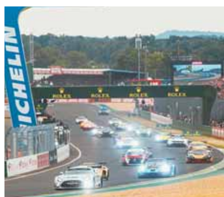
Unlike traditional circuit races, Le Mans puts teams to the test by making them compete continuously for 24 hours.

sion during the 2026 European Le Mans Series (ELMS) season, a highly competitive championship that serves as an important develop-