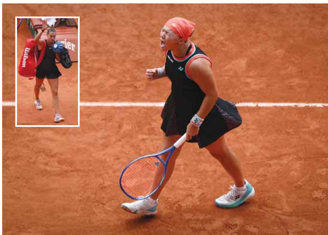
Diana Shnaider celebrates her victory against Aryna Sabalenka in the French Open quarter-final on Court Philippe-Chatrier at the Roland-Garros Complex in Paris yesterday.

"So of course I had that thought in the back of my mind that she was struggling with Coco last year. I was, like, 'Yeah, I've got to