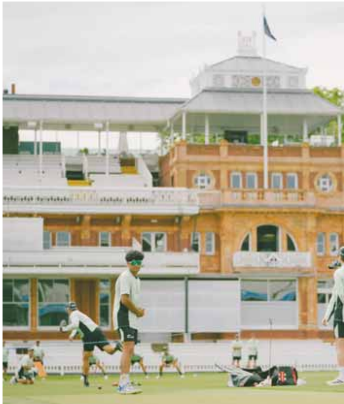
Rachin Ravindra of New Zealand does shadow batting practice on the pitch at Lord's Cricket Ground.

"If you're in front of the game, how are you able to close games out, what's required during those moments? If you're behind the game, tactically, how do you nav-