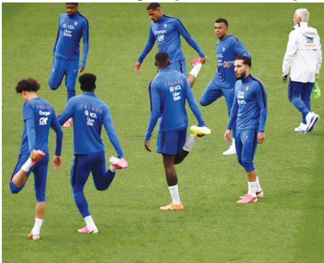
(From Left) France forward Bradley Barcola, defender William Saliba, forward Kylian Mbappe, midfielder Rayan Cherki, head coach Didier Deschamps and forward Desire Doue attend a training session yesterday in Nantes, on the eve of the friendly match against Ivory Coast ahead of the FIFA World Cup.

Mbappe's commitment has been questioned after he went on holiday while nursing a hamstring injury towards the end of the season. "What happened at club level stays at club level. Here, it's the national team. With the group and those who were there for the first sessions, he has put in the effort," said Deschamps. "He has experience that others don't. It will be his third World Cup. He knows how difficult a World Cup is."