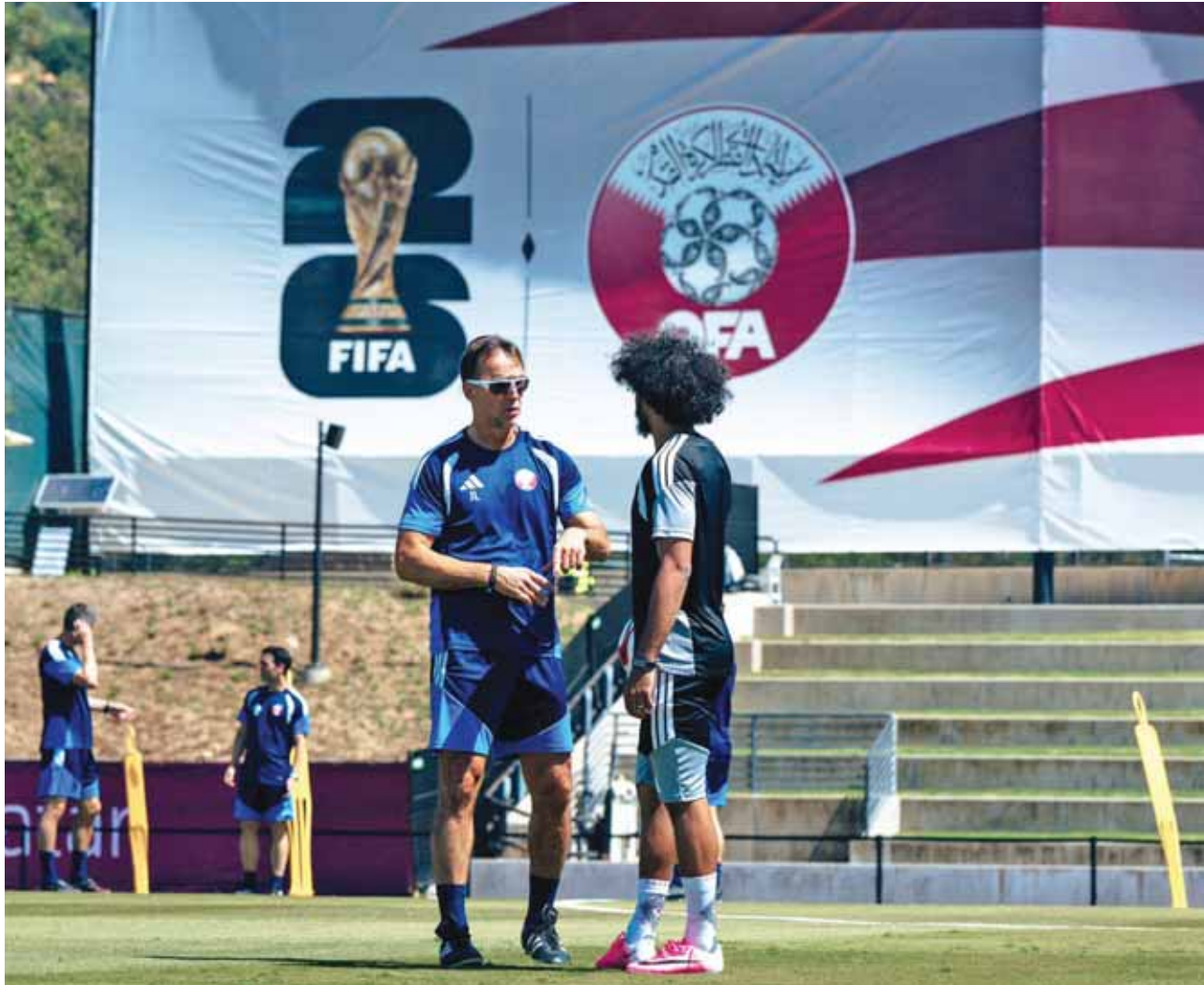
Qatar coach Julen Lopetegui speaks to star forward Akram Afif during a training session in Santa Barbara, California.

Qatar's maiden World Cup appearance in 2022 proved a difficult experience as they became the first host nation in tournament history to lose all three group-stage