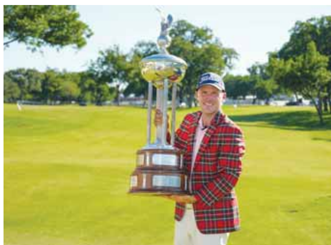
Russell Henley with the winner's trophy following the final round of the Charles Schwab Challenge golf tournament. Henley won the tournament in a one hole playoff over Eric Cole.