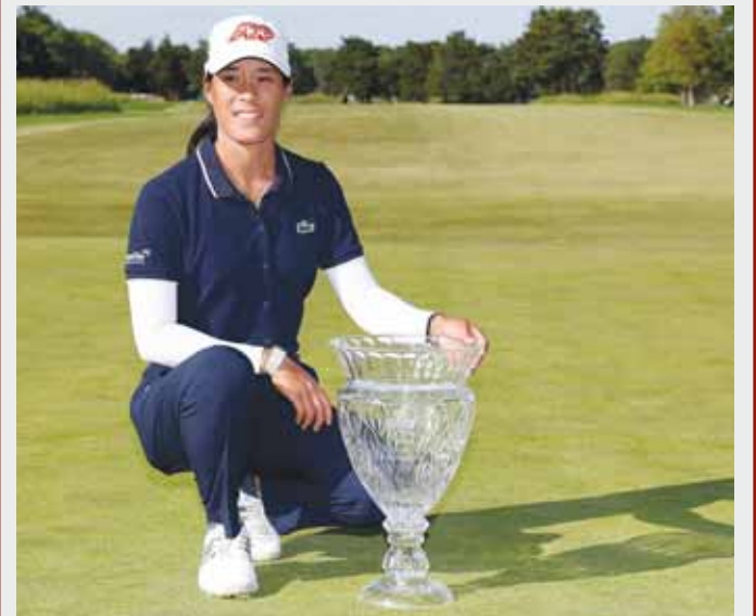
Celine Boutier of France poses with the trophy after putting in to win on the 18th green during the final round of the ShopRite LPGA powered by Wakefern 2026 at Seaview Bay Course in Galloway, New Jersey. Boutier fired a five-under-par 66 in the final round to finish on nine-under 204. The 32-year-old from suburban Paris captured her seventh career LPGA title and first since the 2023 Maybank Championship in Malaysia. Boutier will play in next week's US Women's Open at Riviera