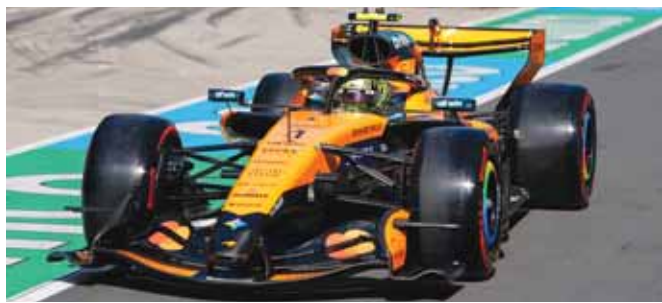
McLaren's driver Lando Norris drives during the Chinese GP qualifying session in Shanghai on March 14, 2026.

"It's all about people," said Brown, an American. "When I started, the team had definitely gone through tough times. We were ninth in the championship, we didn't have many partners and the partners we had weren't very happy. Our fans were disgruntled, a lot of politics inside the racing team. "What was great was our brand. It wasn't in a great place but you can't take away the history and heritage."