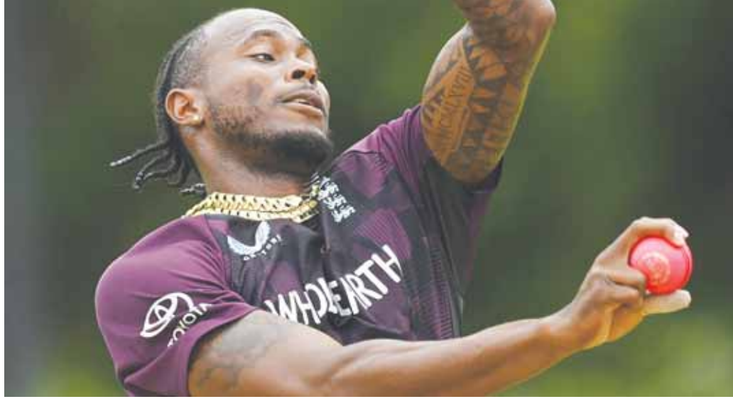
A file photo of England pacer Jofra Archer bowling with a pink ball before an Ashes Test last winter.

Meanwhile the ICC has suspended Canada over breaches of the national board's membership