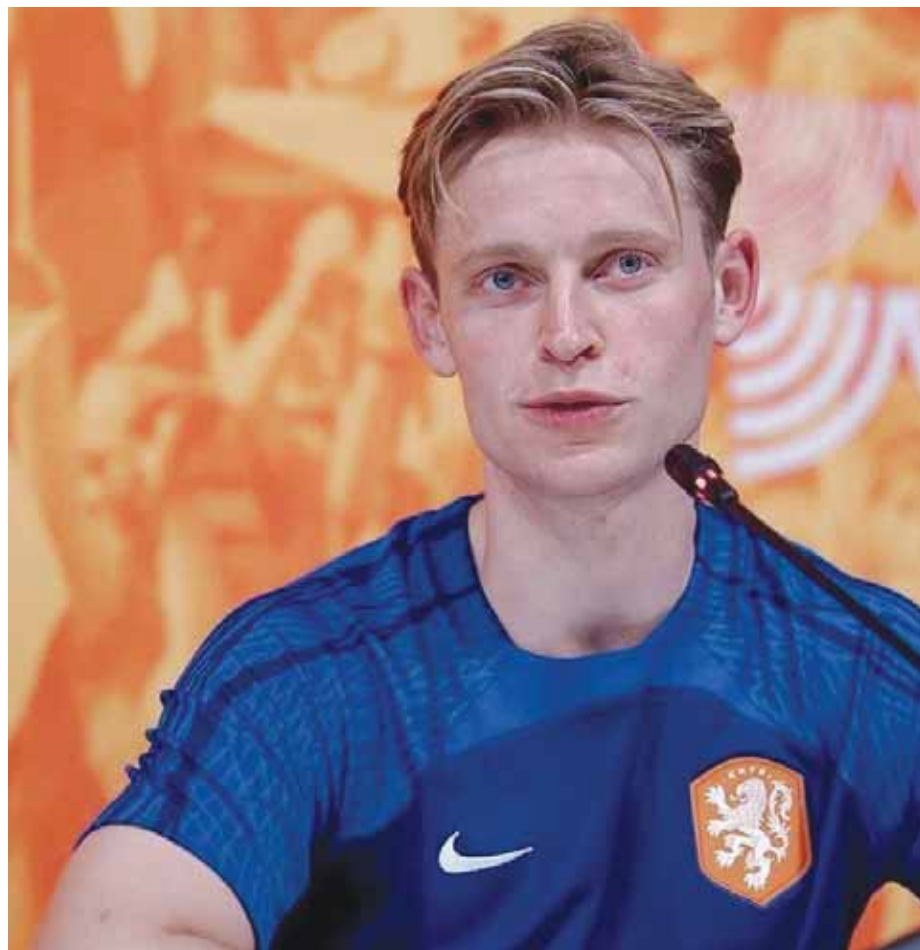
Netherlands' midfielder Frenkie de Jong talks to the media in Zeist yesterday.

De Jong returned to help the Netherlands qualify for the World Cup and last month