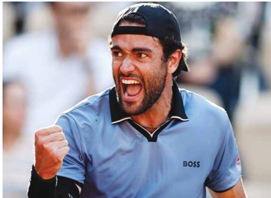
Italy's Matteo Berrettini celebrates winning his fourth round match against Argentina's Juan Manuel Cerundolo at the French Open in Paris yesterday.