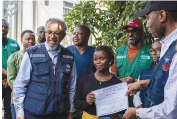
WHO chief Tedros Adhanom Ghebreyesus with a woman who has recovered from Ebola in Bunia, in the northeastern Democratic Republic of the Congo.

"We must move at the speed of the epidemic," added Kaseya,