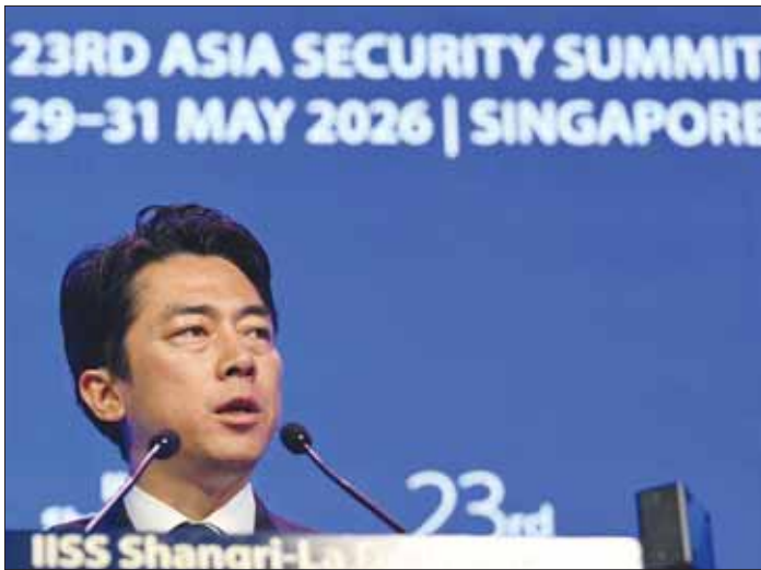
Shinjiro Koizumi, Japan's defence minister, speaks at the Shangri-La Dialogue security summit in Singapore, yesterday.

A diplomatic spat between the Asian rivals has been rumbling since Takaichi suggested in November that Japan might intervene militarily if China were to attempt