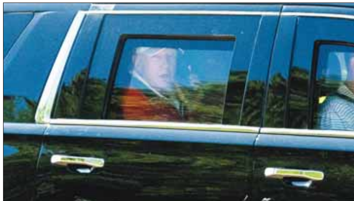
US President Donald Trump talks on the phone as he departs the White House for Trump National Golf Club in Sterling, Virginia, yesterday.

"The one guarantee that I have to have is that there will be no nuclear weapons. They've agreed to that, and it was very interesting," he told his daughter-in-law Lara Trump in an interview on her Fox News show.