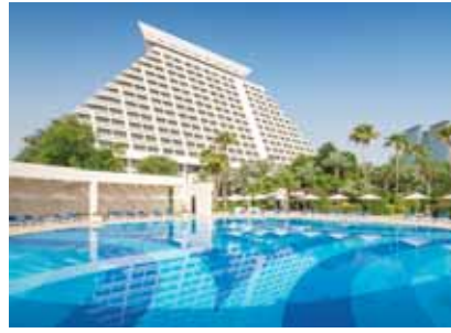
Sheraton Grand Doha