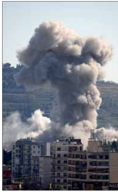
Smoke billows from southern Lebanon, following Israeli strikes, as seen from Nabatieh, Lebanon, yesterday.

French Minister for Foreign Affairs, Jean-Noel Barrot announced yesterday that France has requested a UN Security Council emergency meeting, following Israeli's capture of the strategic Beaufort Castle (Qalaat Al Shaqif) in southern Lebanon.