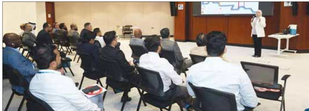
The initiative was held as part of QIB's activities marking 'World No Tobacco Day' to promote healthier lifestyle and raise awareness of the health risks associated with smoking.

Qatar Islamic Bank (QIB) has reinforced its commitment to Corporate Social Responsibility (CSR) by organising a 'Smoking Risks Awareness Day' for employees at its head office, in collaboration with Qatar Cancer Society.