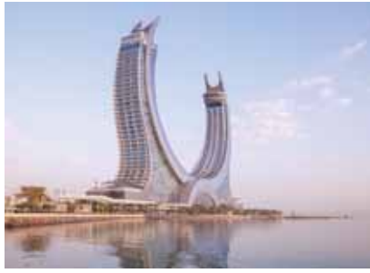
Raffles and Fairmont Doha

Participating properties include The Ritz-Carlton, Doha; Sharq Village & Spa, a Ritz-Carlton Hotel; Sheraton Grand Doha Resort & Convention Hotel; Al Messila, a Luxury Collection Resort & Spa, Doha; Fairmont Doha; Raffles Doha; Hilton Salwa Beach Resort & Villas; Rixos Gulf Hotel Doha; Simaisma, a Murwab Resort; Sealine Beach, a Murwab Resort; Jouri, a Murwab Hotel; Mövenpick Hotel Doha; Somerset West Bay Doha; and Dana Club. The "Summer Your Way" campaign re-