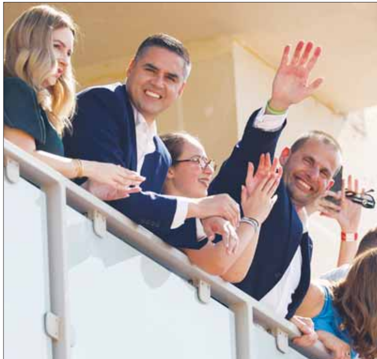
Malta's Prime Minister and Labour Party leader Robert Abela waves to supporters after the party won a record-breaking fourth consecutive general election, at the party headquarters in Hamrun, yesterday.

Heritage groups have denounced environmental degradation and risks