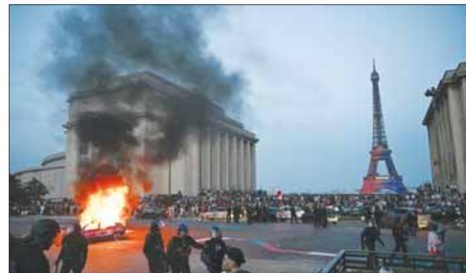
A car is set ablaze as PSG supporters celebrate their team's win in the UEFA Champions League final between Paris Saint-Germain (PSG) and Arsenal FC played in Budapest, at Place du Trocadero opposite the Eiffel Tower.

Nunez said a small number of thefts and lootings had taken place in around fifteen cities