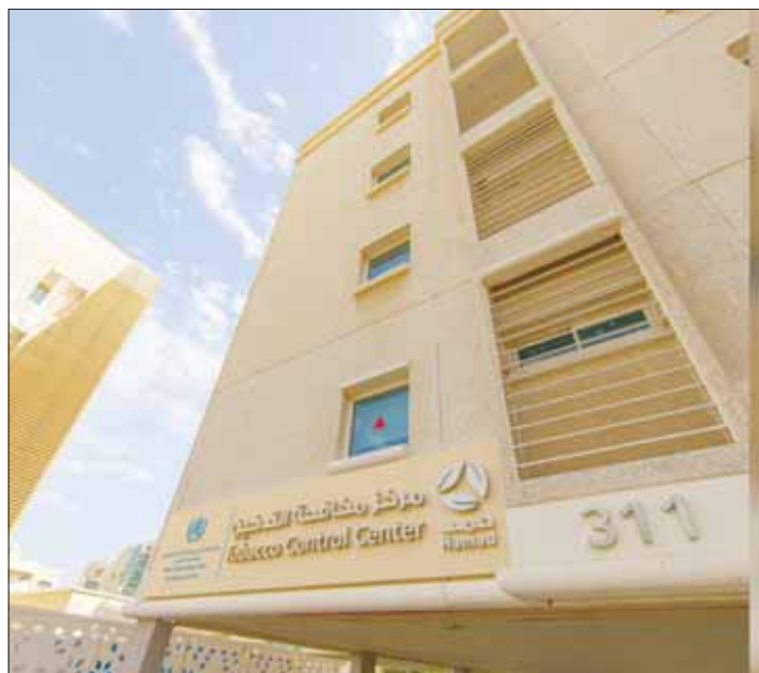
Qatar Tobacco Control Centre.

In addition, the centre also conducts public health campaigns to educate the community on the dangers of tobacco and emerging