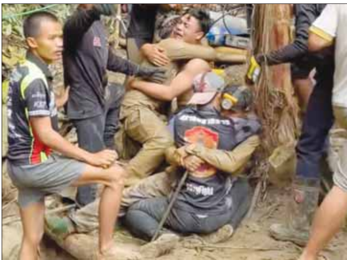
This screen grab shows two men being hugged after they were rescued from a semi-submerged cave in central Xaysomboun province.

Rescue divers extracted the first man on Friday, and four more