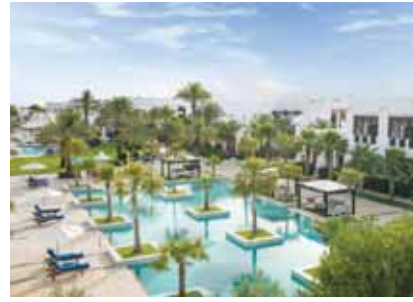
The Ritz-Carlton Spa Sharq Village

flects Katara Hospitality's commitment to creating meaningful experiences that encourage families to reconnect, explore new destinations within Qatar and enjoy exceptional hospitality closer to home.