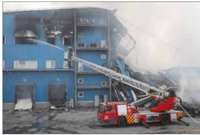
Firefighters work at a site of a Russian drone strike, in Dnipro, yesterday.

Lazarevo pumping station in the Kirov region, northeast of Moscow and around 1,300km (800 miles) from Ukrainian-held territory, which serves the Surgut-Gorky-Polotsk pipeline, shipping Russian oil from Siberia to Belarus.