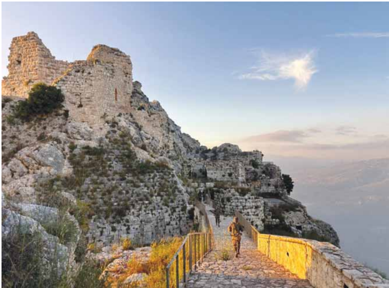
Israeli soldiers are seen at Beaufort Ridge in southern Lebanon, in this handout image released yesterday.

The latest operation, the military said,