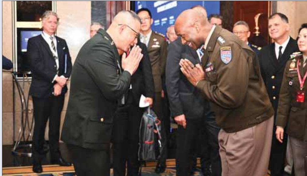
Commander of United Nations Command, Combined Forces Command, and United States Forces Korea Xavier Brunson greets a Thailand representative at the ISS Shangri-La Dialogue security summit in Singapore yesterday.