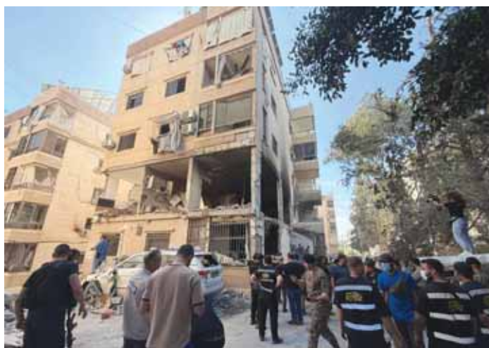
Rescue workers and local residents inspect the damage to a building following an Israeli air strike in the Choueifat area, south of Beirut on the outskirts of the capital's southern suburbs.

Reuters reached mukhtars from 20 of the towns and villages subject to Israeli evacuation