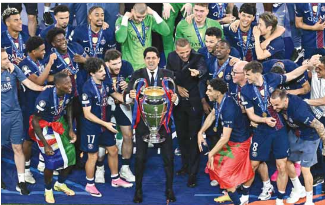
Paris Saint Germain's President Nasser al-Khelaifi lifts the trophy next to players after winning the UEFA Champions League final against Arsenal at the Puskas Arena in Budapest yesterday.

PSG's first triumph was 55 years in the making, 14 of those under Qatari ownership, the second could start what they hope is an era of dominance and dynasty-building.