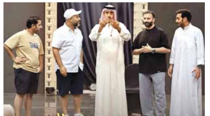
A scene from the comedy.

comedy framework, exploring the nature of contemporary relationships, which are often based on self-interest and materialistic expectations. Through a series of satirical situations and unexpected twists, the play reveals the transformations that have occurred in some human relationships in the modern era. The story revolves around the intertwining of personal interests and emotions, as the characters find themselves in complex and humorous situa-