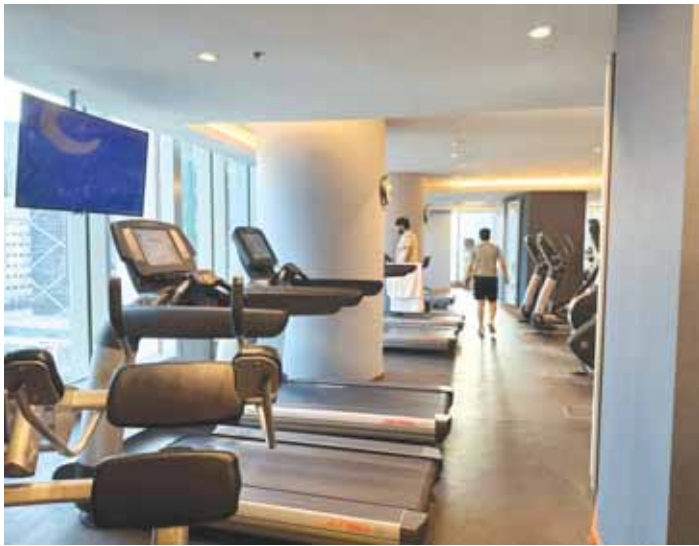
Residents are choosing staycations to unwind in Doha.

alternative that still offers the feeling of a genuine holiday.