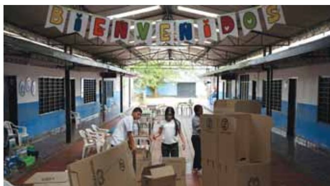
Preparations underway for the first round of the presidential election to be held on May 31, in Santander de Quilichao.

"Ultimately, AI should complement, not replace, human care and offline coping mechanisms, enhancing resilience, while preserving the social bonds vital for long-term wellbeing," he added.