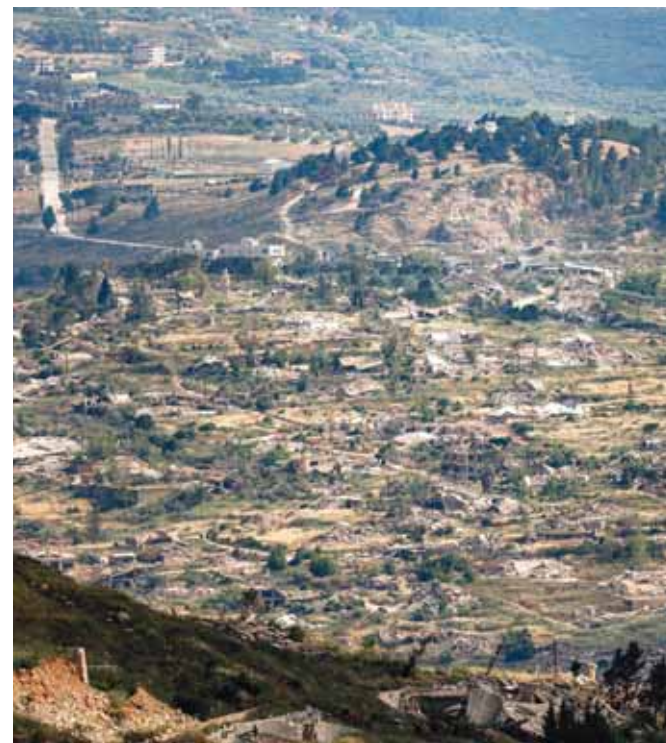
Destroyed buildings in the village of Kfarkila in southern Lebanon are seen from across the border in the Upper Galilee region of northern Israel. - AFP

He also commended Christodoulides's efforts in strengthening ties between Qatar, Gulf Co-operation Council (GCC) states, and Arab states on the one hand, and the EU on the other. - QNA