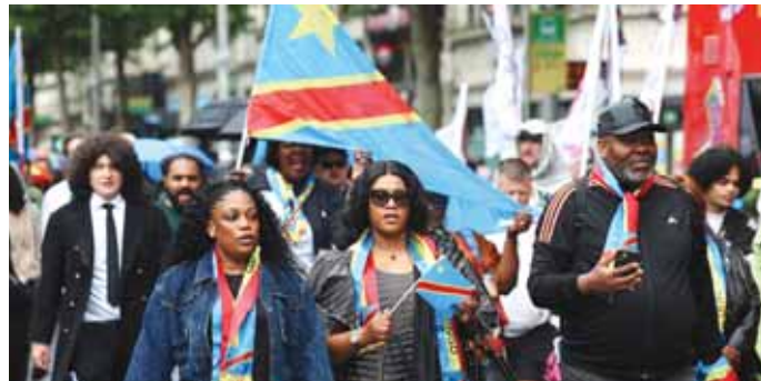
Protesters walk down O'Connell Street in central Dublin.

Video footage widely shared on social media showed Sakila being held on the ground for almost five minutes by security workers outside a department store on a busy shopping street in central Dublin