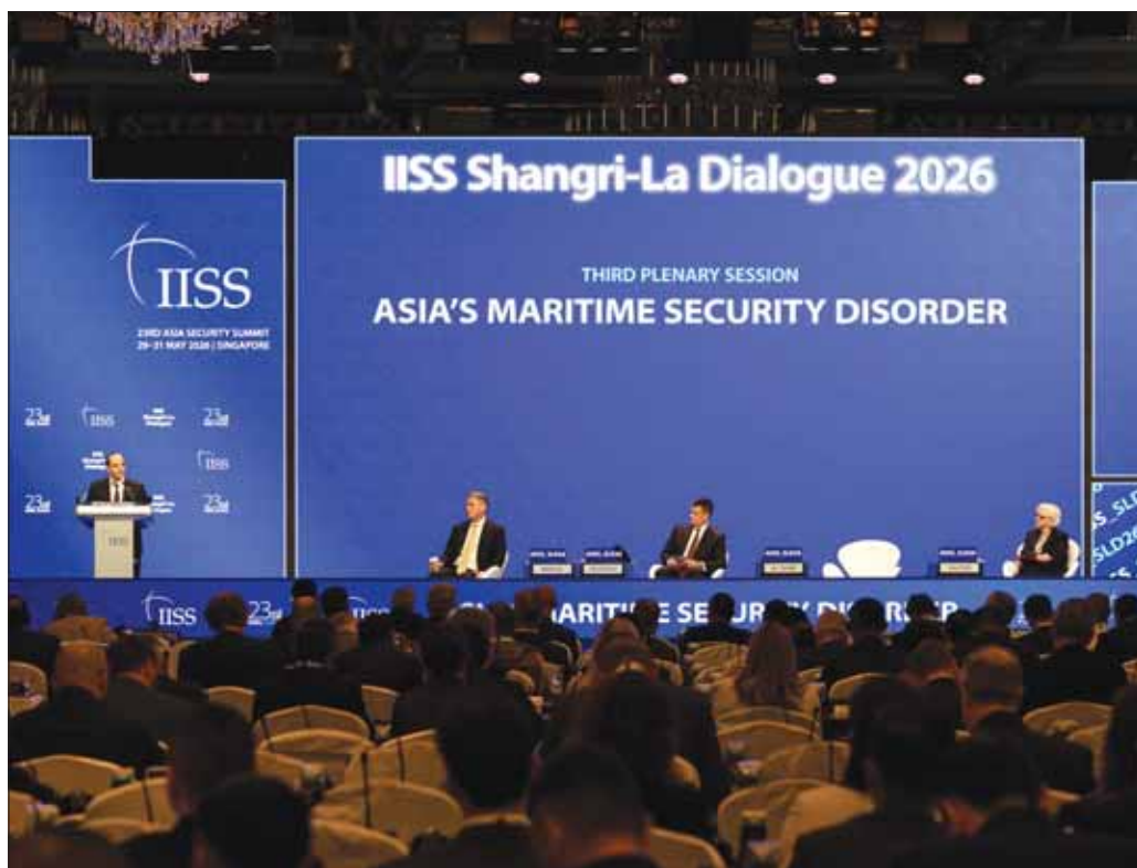
HE Deputy Prime Minister and Minister of State for Defence Affairs Sheikh Saoud bin Abdulrahman bin Hassan al-Thani speaking at the third plenary session of the Shangri-La Dialogue 2026 in Singapore under the theme "Asia's Maritime Security Disorder." Page 6