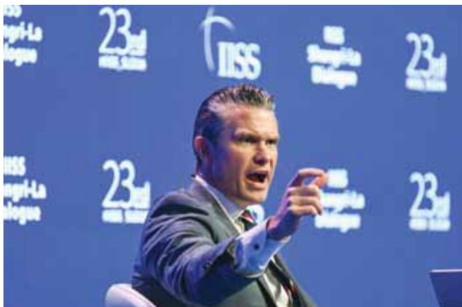
US Secretary of Defence Pete Hegseth at the 23rd Shangri-La Dialogue summit yesterday.

The Pentagon chief said the US sought "respectful" and "good-faith" engagement with Beijing, adding: "I wish my counterpart