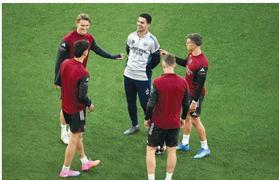
Arsenal's manager Mikel Arteta (centre) is all smiles as he speaks to captain Martin Odegaard (left) and other players during a training session at the Puskas Arena in Budapest.

Arsenal's defensive strength helped them reach the final unbeaten, conceding just six goals en route. Arteta said he had no doubts about his team deserving their place on the biggest stage, but had to prove today they deserve to be crowned champions. "We are here because