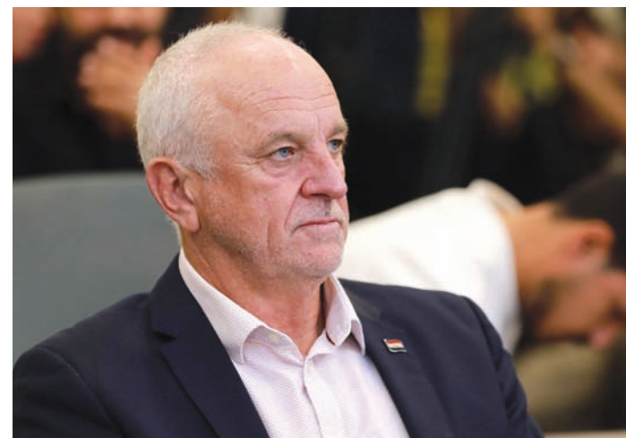
Graham Arnold was appointed as Iraq's coach in May last year to succeed Spaniard Jesus Casas.

France will play two friendly internationals before the World Cup, against Ivory Coast in Nantes on June 4 and at home to Northern Ireland in Lille four days later. They begin their Group 1 campaign against Senegal on June 16 in East Rutherford.