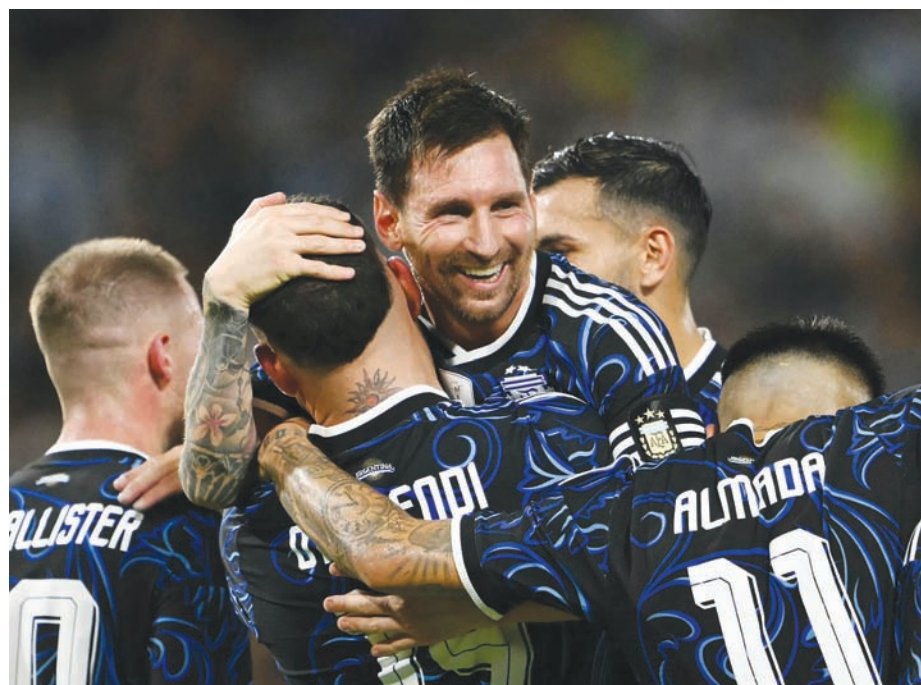
Lionel Messi, 38, had not previously confirmed he would play in what will be a record-breaking sixth World Cup for the Argentine superstar.