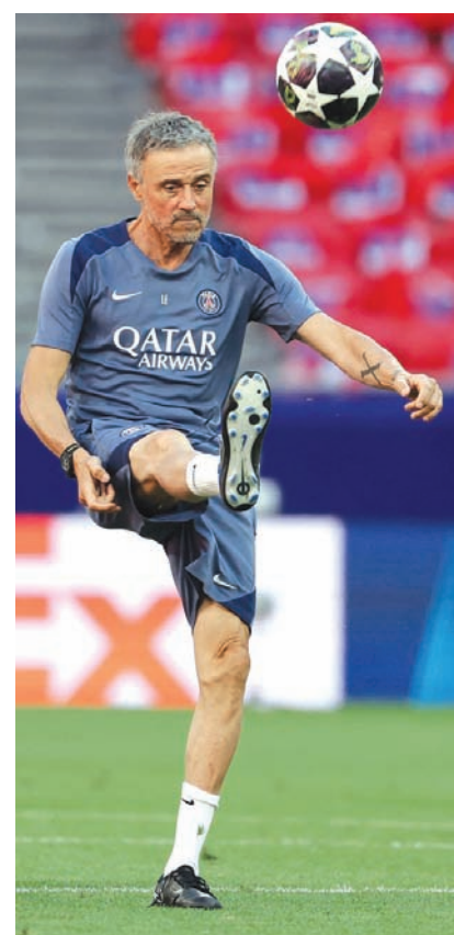
Paris Saint-Germain's Spanish head coach Luis Enrique.

With Arsenal chasing a first Champions League title in the same way PSG were a year ago, Luis Enrique said his side now had an even greater source of motivation - the chance to win it again.