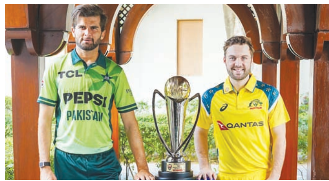
Pakistan captain Shaheen Shah Afridi and Australia skipper Josh Inglis pose with the series trophy in Rawalpindi yesterday.

Under-strength Australia and Pakistan meet in the first of three one-day internationals in Rawalpindi today, aiming to build strong combinations for next year's World Cup. Australia are without their regular skipper Pat Cummins along with his pace partners Mitchell Starc and Josh Hazlewood and opener Travis Head - all rested to manage their workloads following their stints in India's T20 League. Mitchell Marsh, initially appointed captain for the tour, was also ruled out with an ankle injury, leaving Josh Inglis to lead the series with the last two matches in Lahore on June 2 and 4. Despite being depleted, Inglis termed the squad as talented enough to put up a good fight. "Obviously, disappointing to lose Mitch and unfortunately we are missing some others but we have some exciting players