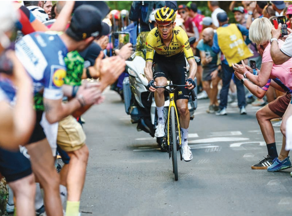
Team Visma Lease a Bike rider Sepp Kuss of the US cycles in a lone breakaway in the final ascent to win the 19th stage of the Giro d'Italia 2026 - Tour of Italy between Feltre and Alleghe, Italy, yesterday.

However, Kuss launched a relentless pursuit as soon as the final uphill climb commenced, catching and passing Ciccone