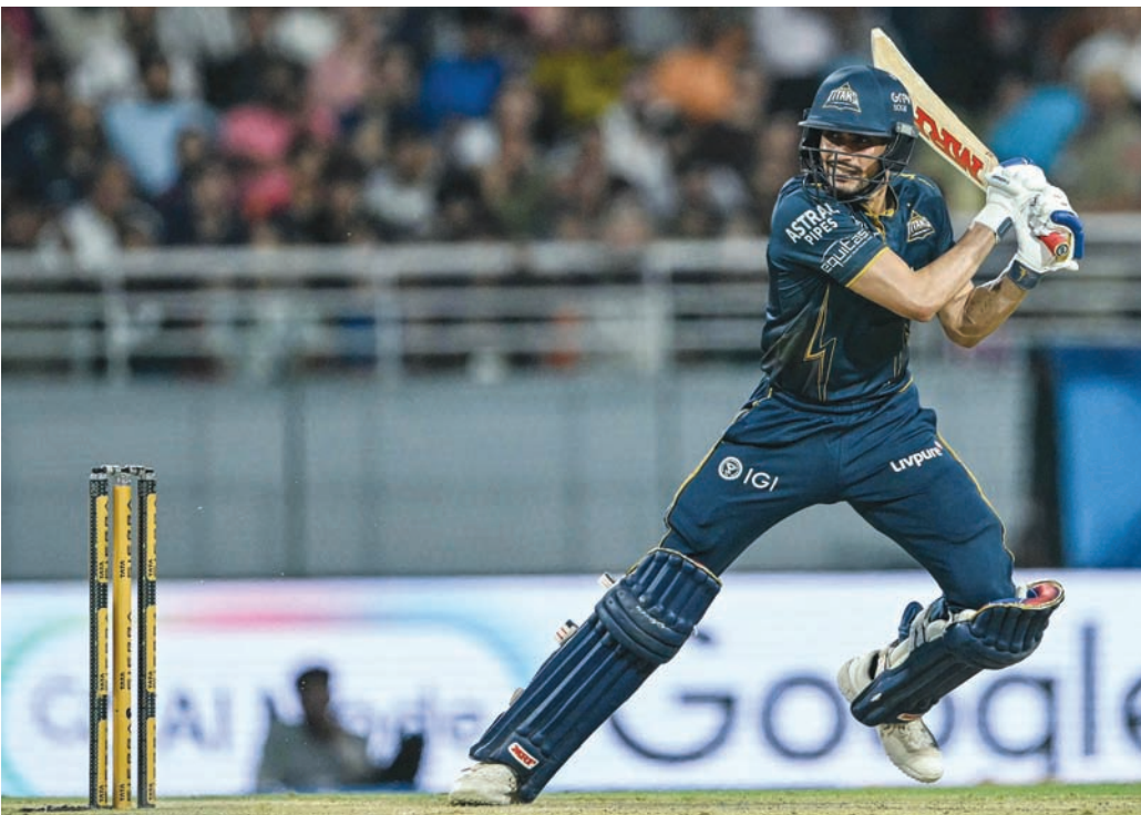
Gujarat Titans' captain Shubman Gill plays a shot during the IPL Second Qualifier against Rajasthan Royals at the Maharaja Yadavindra Singh International Stadium on the outskirts of Chandigarh yesterday.

Fifteen-year-old Vaibhav Sooryavanshi's 96 was in vain as Gujarat Titans beat Rajasthan Royals by seven wickets yesterday to set up an IPL final against defending champions Royal Challengers Bengaluru. Chasing 215 for victory after Sooryavanshi's second successive 90-plus score in the last play-off, Gujarat skipper Shubman Gill's 104 saw them chase down their target with eight balls to spare in New Chandigarh. Gill put on 167 runs with opening partner Sai Sudharsan, who made 58, as Gujarat, who lost the first play-off to Bengaluru, reached their third final in five seasons since their title-winning debut in 2022. Teenage sensation Sooryavanshi bowled out at the top of this season's batting chart with 776 runs after his 47-ball knock laced with eight fours and seven sixes. Gill - India's Test and ODI captain - is behind the boy wonder with 722 runs but has a chance to move ahead of him in the final in Ahmedabad tomorrow. Gill and the left-handed Sudharsan batted with control in a classical display to ease into the chase against a bowling attack led by Jofra Archer. Sudharsan, who was dropped on 14, fell hit wicket for the second time in two matches as his bat slipped to rattle the stumps after he had guided the ball for a four. Gill reached his first century of