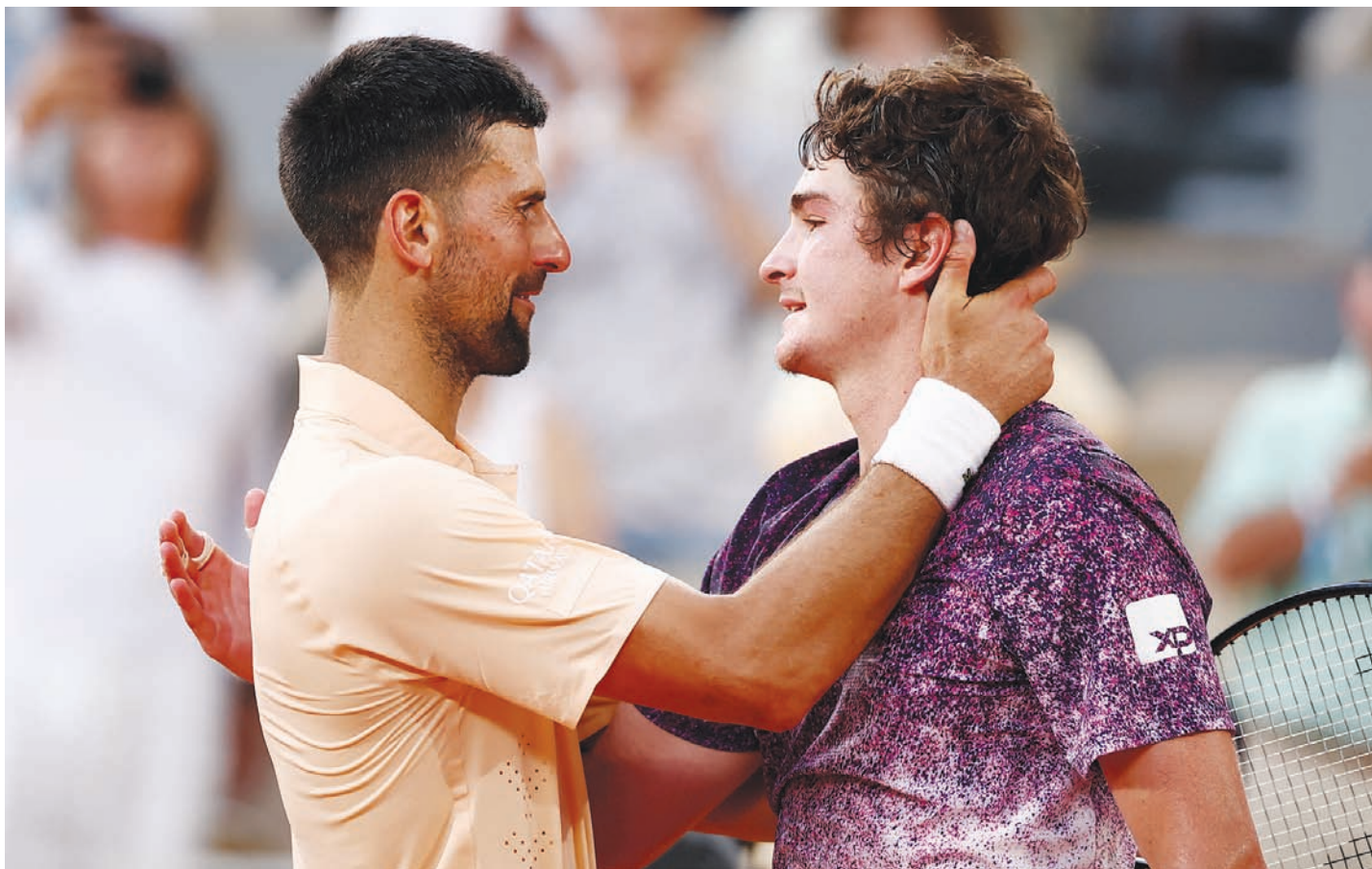
Brazil's Joao Fonseca celebrates winning his third-round match against Serbia's Novak Djokovic at the French Open yesterday.

to focus on myself, prepare tactically, as before any other match, and we'll see."