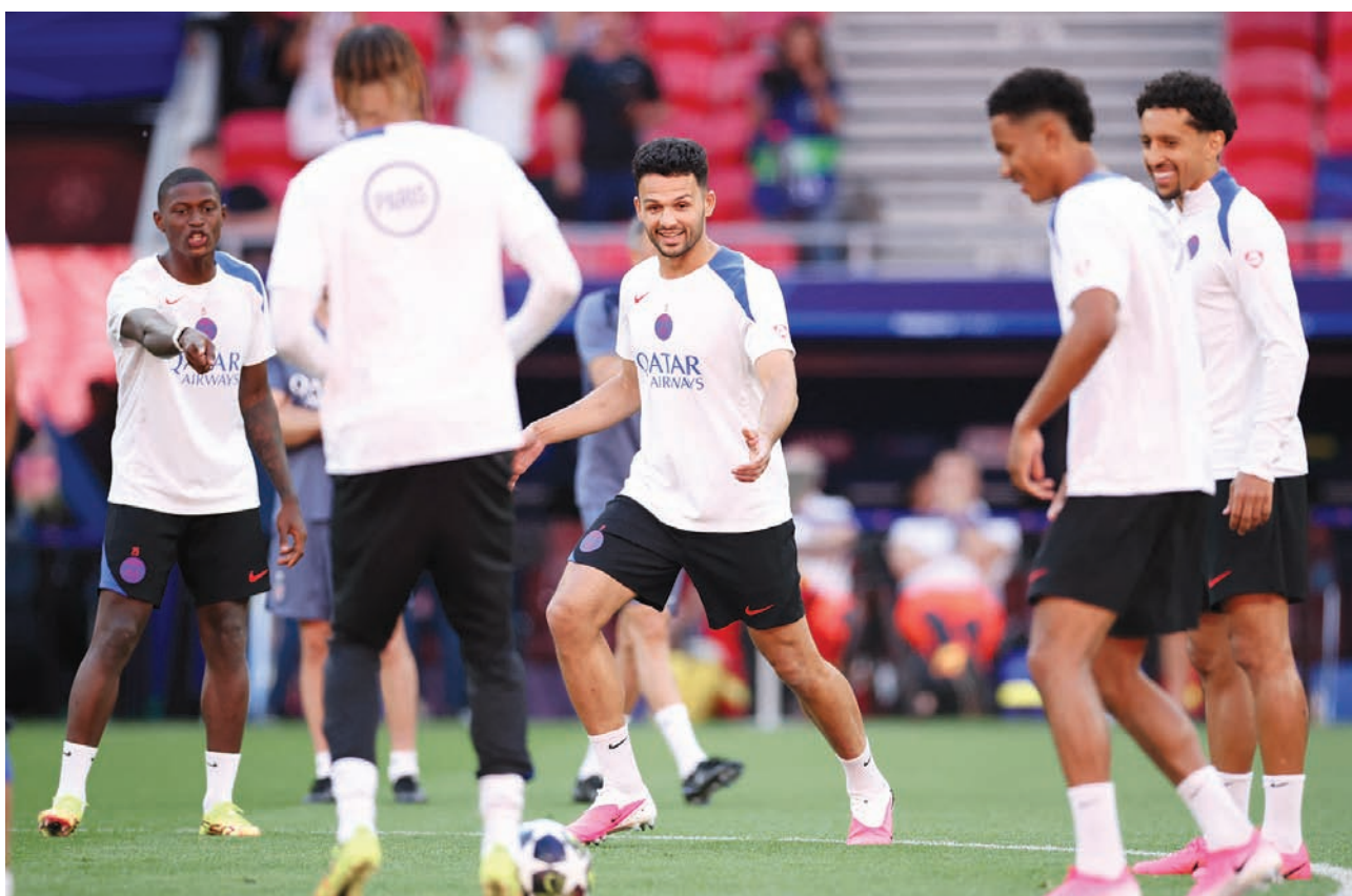
Paris St Germain's Goncalo Ramos (centre), Nuno Mendes (left) and Marquinhos (right) train yesterday at the Puskas Arena in Budapest, Hungary, on the eve of UEFA Champions League final against Arsenal.

"But our motivation is not to make history because we already did that last year," Luis Enrique said when asked about the slogan. "Our motivation is to continue being one of the best teams in Europe and in the world."