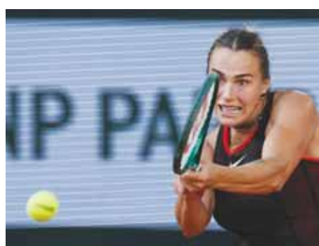
Aryna Sabalenka ground down a battling Elsa Jacquemot to win 7-5, 6-2.