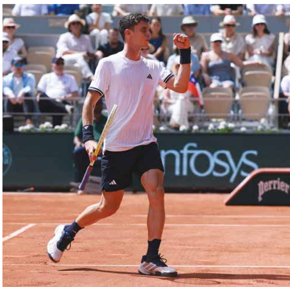
Argentina's Juan Manuel Cerundolo appeared inspired by the unexpected opportunity and raced to victory against top seed Italy's Jannik Sinner at the French open.

Sabalenka, chasing a fifth Grand Slam title and first at Roland Garros, will next take on