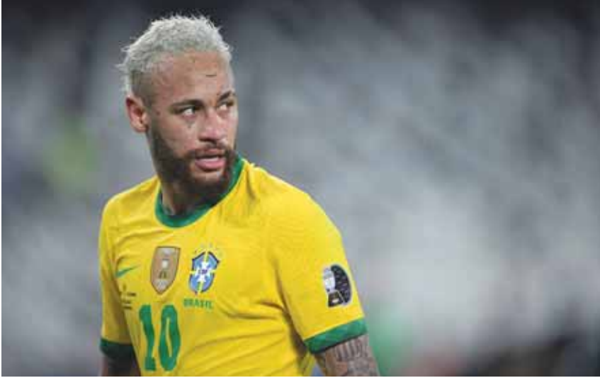
Brazil's Neymar faces two to three weeks on the sidelines after injuring his calf.