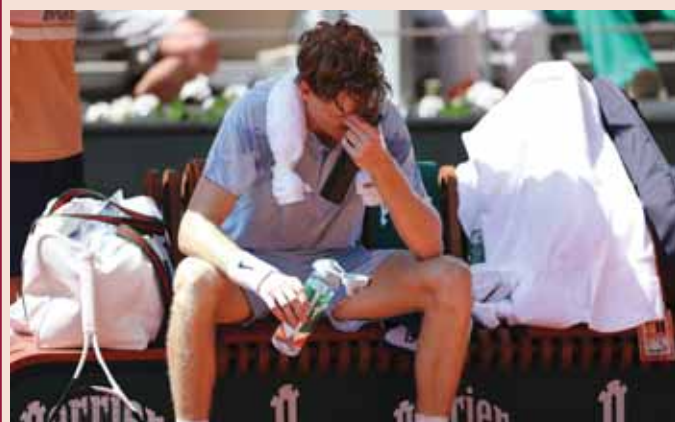
Italy's Jannik Sinner, the red-hot favourite at Roland Garros, suffered a dramatic five-set defeat by Argentina's Juan Manuel Cerundolo after a sudden collapse on another sweltering day in Paris.

"It's tough for him (Sinner). I think I was a little bit lucky," said Cerundolo. "I'm super happy. I'm going to keep trying to play my best. It's a tournament I really like to play, clay is my best surface."