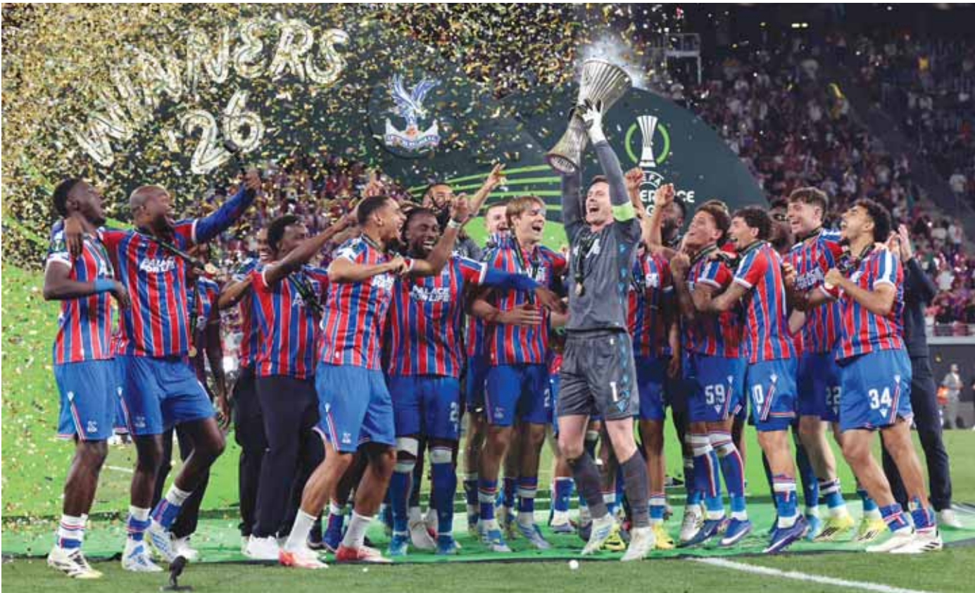
Crystal Palace's goalkeeper Dean Henderson raises the trophy as he celebrates with his teammates after winning the UEFA Conference League final against Rayo Vallecano in Leipzig on Wednesday.

Mateta fires Palace to Conference League glory in Glasner farewell