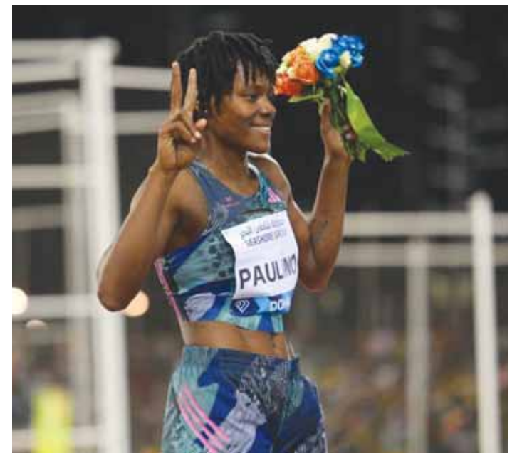
Marileidy Paulino has dominated the 400m in the Diamond League in recent years, claiming 18 victories in athletics' premier one-day series and winning the series title three years in a row from 2022 to 2024.

The first leg was held in Shanghai/Keqiao on May 16 and ends at the two-day series final in Brussels on September 4-5. The series unites the biggest names in track and field in some of the world's most iconic arenas, crossing four continents and 15 cities over the course of the season.