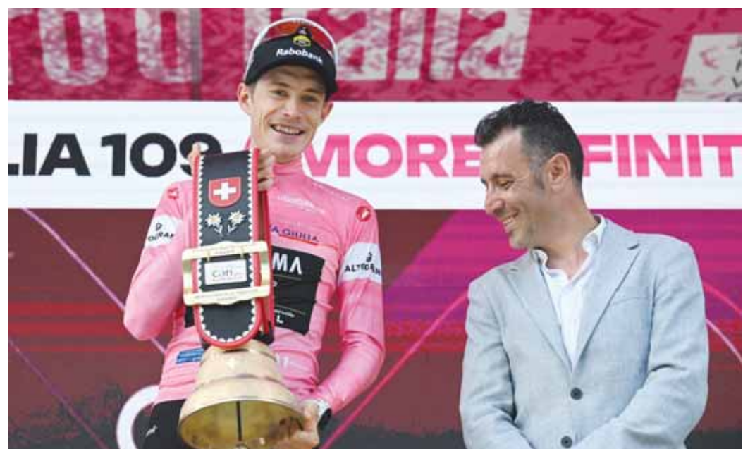
Team Visma - Lease a Bike's Jonas Vingegaard celebrates on the podium wearing the maglia rosa jersey after stage 16 with former cyclist Vincenzo Nibali during the Giro d'Italia - Stage 16 from Bellinzona to Cari - in Switzerland yesterday.

Gall did move into second overall but with five stages left and two more mountain rides to come, the likelihood is Vingegaard will only increase his lead further before