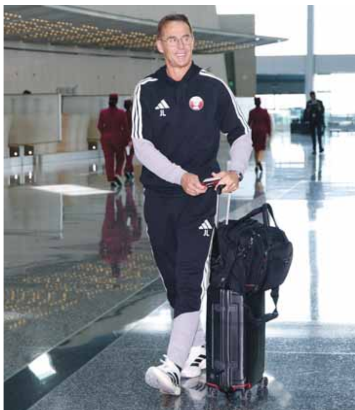
Qatar coach Julen Lopetegui and players departed from the Hamad International Airport for Dublin yesterday.

Qatar will base their FIFA World Cup campaign in Santa Barbara, California, with the national team