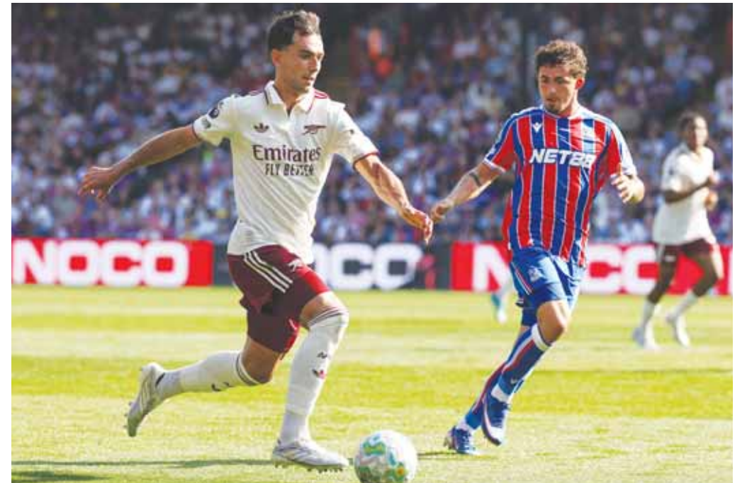
Arsenal's Spanish defender Martin Zubimendi (left) dribbles the ball during the Premier League match against Crystal Palace at Selhurst Park in south London on May 24.

"Is it fair that instead of focusing on football he has to focus on his own body? That shouldn't be the case... Despite sleeping well and eating well, he's injured."