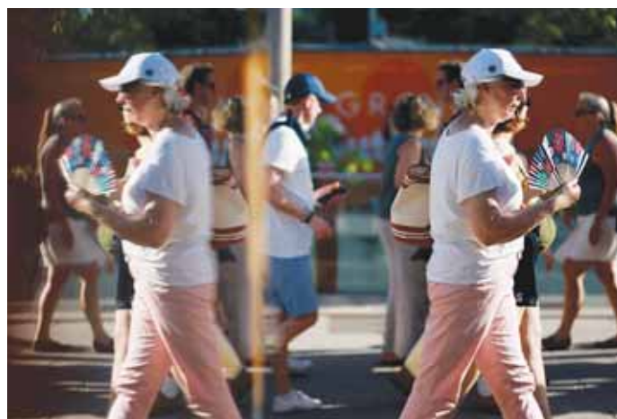
A general view of spectators outside the courts during the French Open in Paris yesterday.

said. "So we stood at the rail." "We're not used to this heat, but who is?"