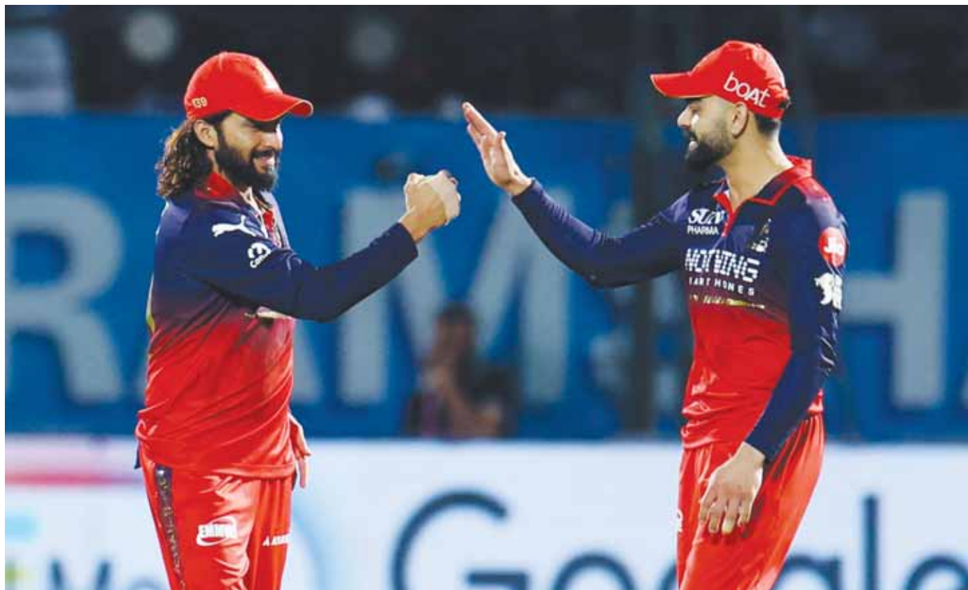
Royal Challengers Bengaluru's Virat Kohli and Rajat Patidar celebrate the wicket of Gujarat Titans' Rahul Tewatia during their IPL match at Himachal Pradesh Cricket Association Stadium in Dharamshala yesterday.

The defending champions reach final for second time in a row