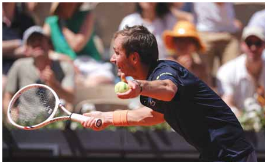
Daniil Medvedev reacts to a point against Australia's Adam Walton during their match in Paris yesterday.

"I seem to be able to last. I'm not saying I last better than him, but I last better than probably the field in the heat. Just given the way I play, that's one aspect that is huge for me, because I'm not the most talented player out there."