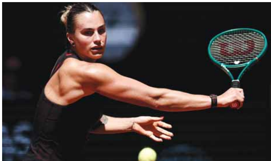
Belarus' Aryna Sabalenka plays a backhand return to Spain's Jessica Bouzas Maneiro during their match on day 3 of the French Open in Paris yesterday.

"And the diamonds, I don't really feel the heaviness of it, but I can imagine how it looks from the outside ... for me, it's important to look good. If I feel good looks-