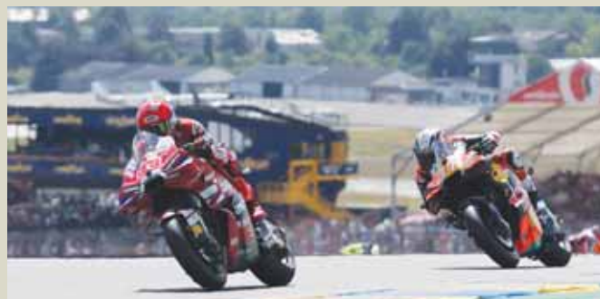
Ducati Lenovo Team's Marc Marquez and Red Bull KTM Factory Racing's Pedro Acosta during the sprint race at the French Grand Prix at Bugatti Circuit, Le Mans, France, on May 9, 2026.

MILAN: Reigning MotoGP champion Marc Marquez is set to return for the Italian Grand Prix this weekend, his team Ducati said yesterday, following two surgeries after his crash at Le Mans earlier this month.