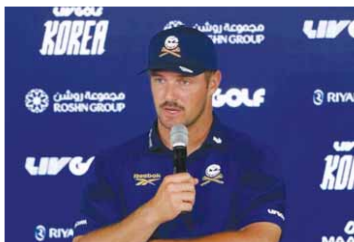
American golfer Bryson DeChambeau talks to the media ahead of the start of LIV Golf Korea yesterday.

Johnson, 41, won the US Open in 2016, the Masters in 2020 and is a 24-time winner on the PGA Tour.