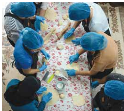
Volunteers prepare croissants at Tres Marias, an organisation supporting migrant workers, in Beirut.