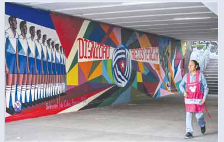
A woman walks past a mural depicting the Cuban national football team that participated in the 1938 World Cup in France, painted on a metro station in Mexico City.