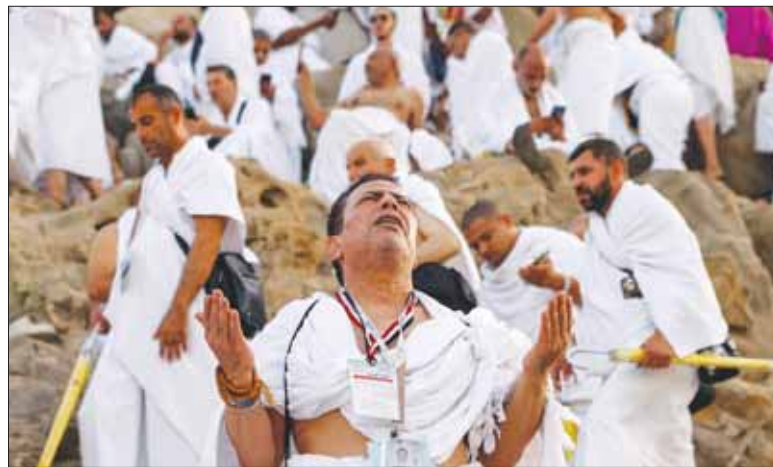
A pilgrim prays with others on Mount Arafat, also known as Jabal al-Rahma or Mount of Mercy, during the climax of the Haj yesterday.

More than 30,000 Iranians have made the journey, about a third of