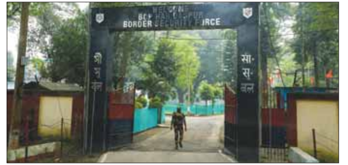
A Border Security Force (BSF) official walks into a Border Outpost (BOP), a self-contained defence outpost situated near the India-Bangladesh international border in Petrapole, India.

Japan and India have historically both maintained cordial relations with Iran, although they grudgingly complied with US sanctions on Iranian oil.