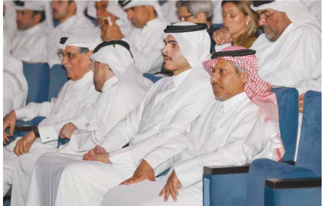
Snapshots from the event.