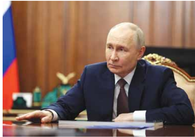
Russian President Vladimir Putin during a meeting in Moscow on Monday.

He will be joined by the heads of Russia's space agency Roscosmos, which leases the Baikonur cosmo-