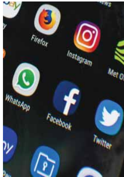
This photo illustration shows a mobile phone screen displaying the icons for the social networking apps Facebook, Twitter and Instagram.