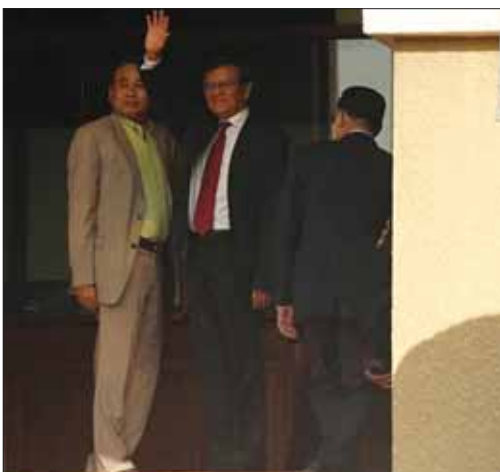
Former CNRP leader Kem Sokha arrives at the Phnom Penh Municipal Court for the hearing of the verdict in his treason case, in Phnom Penh.

"The decision to mitigate only the prison sentence while maintaining the ban on political activity and restricting freedom of travel abroad is merely shifting the form of detention from house arrest to political confinement," it said.