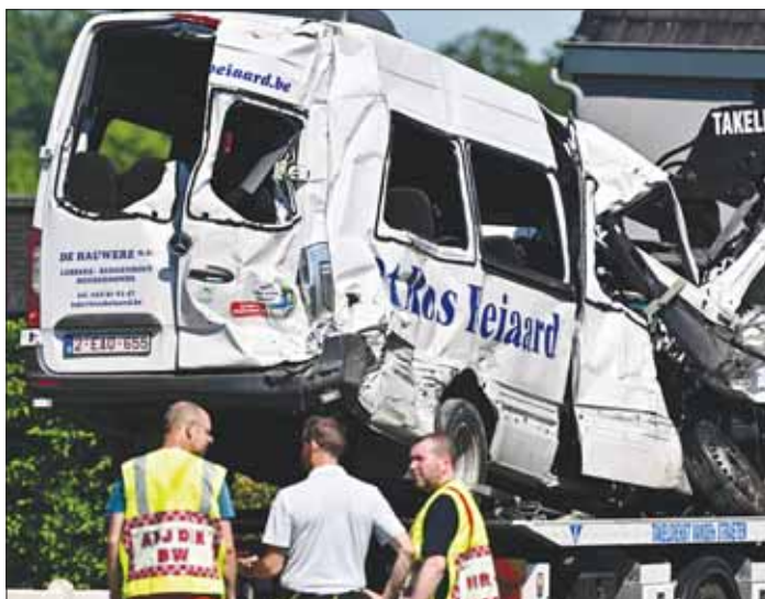
A school minibus is towed away at the scene of a collision with a train in Buggenhout yesterday.

cy said footage from the scene showed that the barriers at the crossing had been closed and a red light was showing at the time of the incident.