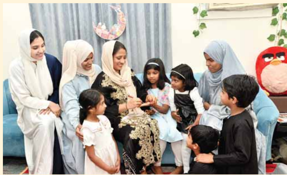
A family get-together to apply the traditional henna as they prepare to celebrate the joyous occasion of Eid al-Adha.