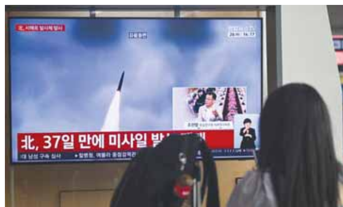
A woman watches a television screen showing a news broadcast with file footage of a North Korean missile test, at a train station in Seoul yesterday.

Seoul's foreign ministry spokesperson Park Il said at a regular news