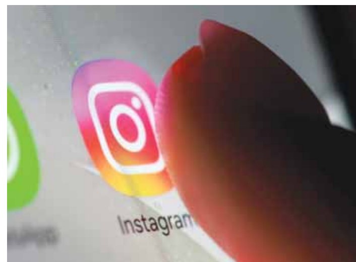
Instagram app icon on a smartphone.

Vermont's Democratic Attorney General Charity Clark sued Meta in 2023 in state court under the state's consumer protection law, claiming that Instagram has even studied teens' neurological, cognitive and psychological vulnerabilities to cause them to use the