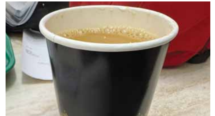
Karak – quick, inexpensive, and deeply embedded in daily life in Qatar.