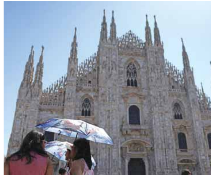
Tourists shield themselves from the sun with an umbrella during a heatwave next to Duomo cathedral, in Milan yesterday.

The UK reported its hottest-ever day for May, at 35.1C at Kew Gardens, in southwest London — breaking a record of 34.8C set at the same location Monday — as