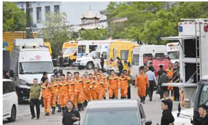
Rescuers work at the site following a gas explosion at Liushenyu coal mine in Qinyuan county, Shanxi province.

The mine, controlled by Shanxi Tongzhou Coal Coking Group, maintained two separate sets of plans and surveillance systems, Xinhua said. One set matched the actual operations while the other