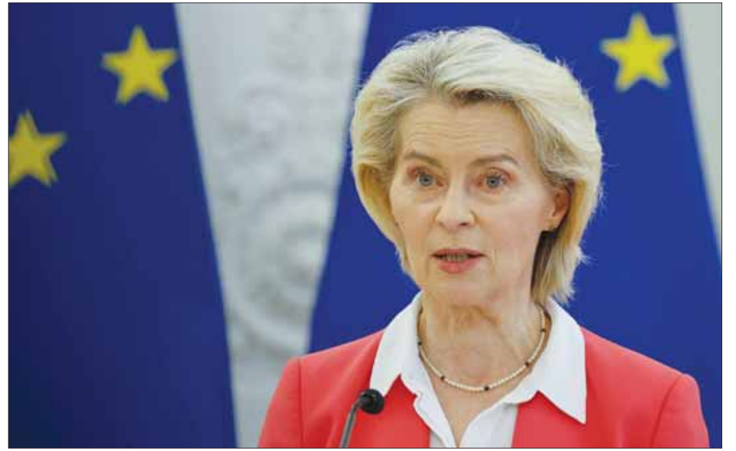
European Commission President Ursula von der Leyen addresses a joint press conference after talks on the security in the region yesterday.

Nato said it would respond later. Nato officials have warned for years of an increased threat from Russia, which they say could potentially mount a large-scale assault on allied territory as early as 2029. Moscow denies aggressive intentions and accuses the alliance of stoking tensions by expanding into neighbouring territory.