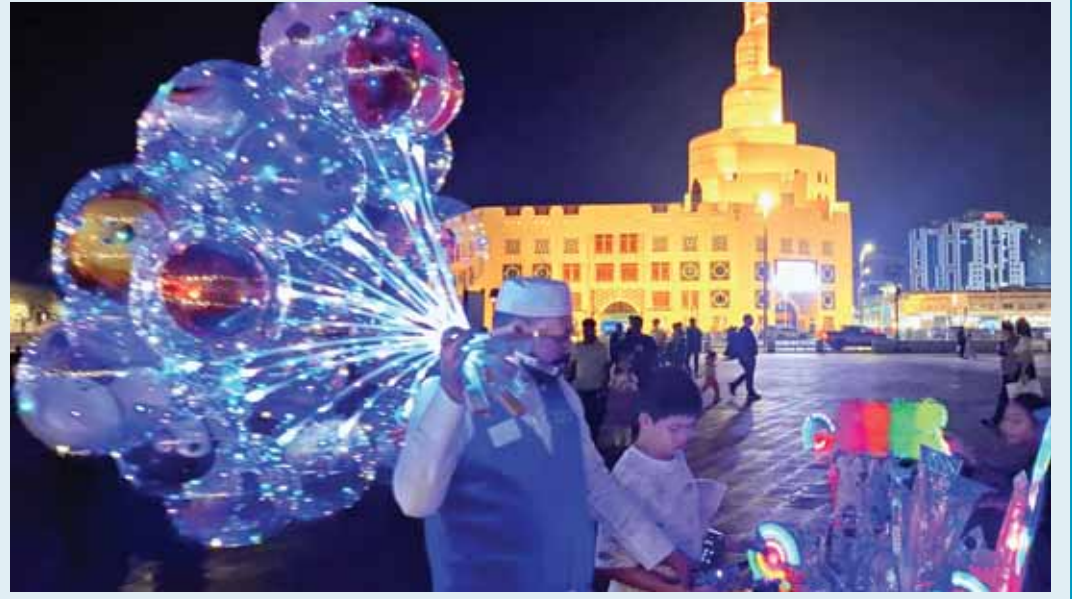
Residents and visitors thronged Souq Waqif on the eve of Eid al-Adha yesterday, where illuminated heritage facades, a glowing minaret and a balloon-seller's cluster of fairy lights lent the historic quarter a festive shimmer. The marketplace draws crowds each year as families gather to soak up the celebratory mood ahead of the holiday.