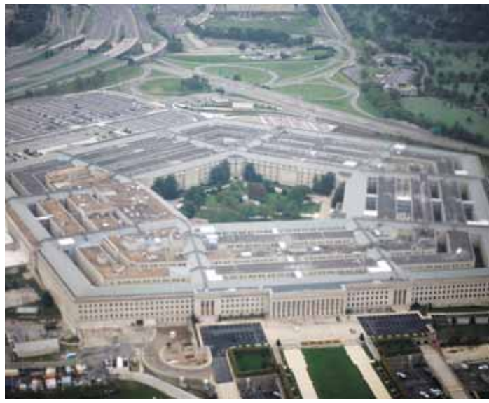
Aerial view of the US military headquarters, the Pentagon, (Reuters)

SpaceX argued the LUCAS drones were operating under conditions that aligned more closely with its aviation tier subscription rather than a lower priced land or mobility service. Pentagon officials argued that the $25,000 price tag — a monthly fee — was designed for aircraft, not kamikaze drones that used Starlink connection for