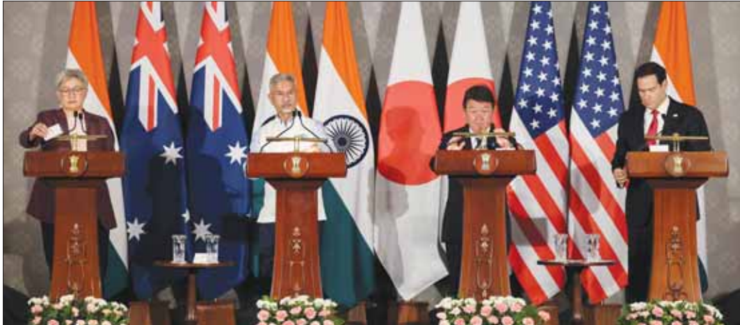
US Secretary of State Marco Rubio, Australian Foreign Minister Penny Wong, Japanese Foreign Minister Toshimitsu Motegi and Indian Foreign Minister Subrahmanya Jaishankar attend a joint press conference after attending the Quad Foreign Ministers' meeting at the Hyderabad House in New Delhi, yesterday.

The four powers said they would also work together on two maritime initiatives — one that combines their surveillance capabilities, and another that will provide enhanced real-time information to commercial traffic at sea.