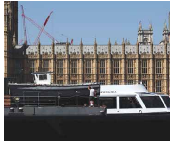
A man paints the hull of a boat in front of the House of Parliament in central London in heat.