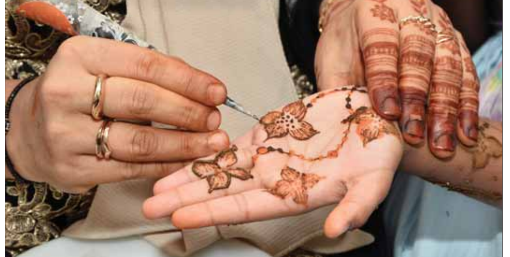
A henna artist applies an intricate floral design to a woman's palm on the eve of Eid al-Adha yesterday, a cherished tradition that sees women across the region decorate their hands ahead of the festival. The fine handcraft, marked by delicate flowers and trailing patterns, is among the most enduring rituals of the celebrations, which begin today.