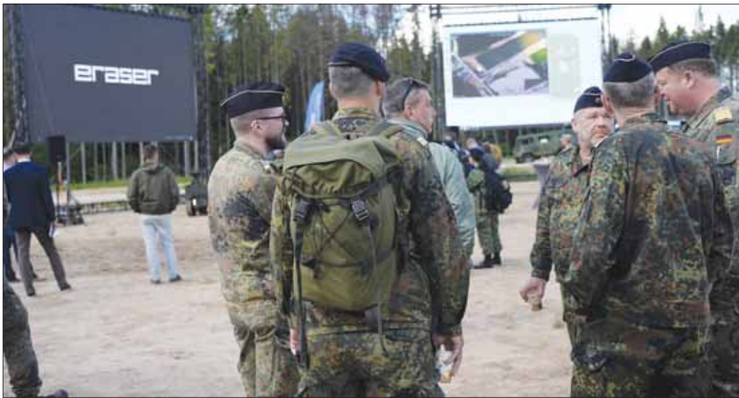
German Army servicemen attend Nato Innovation Range demo day in Latvia yesterday.