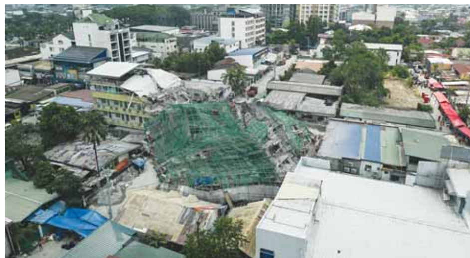
A view of the collapsed nine-storey building that was under construction in Balibago, Angeles City, Pampanga, yesterday.

through. Rest assured, we did everything we could to save lives, and now we have to move forward," she said.