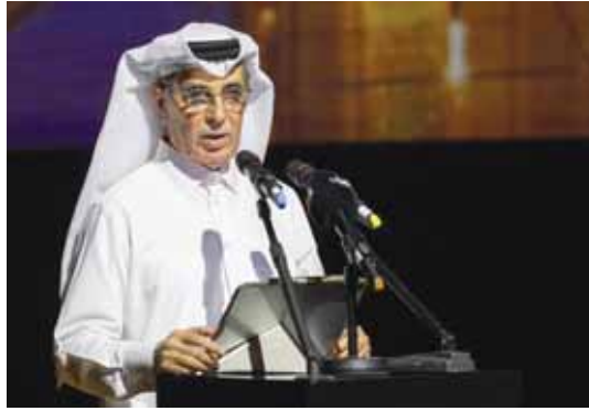
HE Dr Hamad bin Abdulaziz al-Kawari speaking at the event.