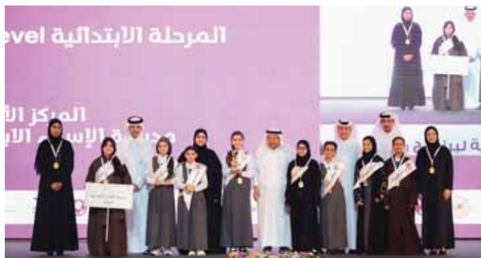
The Al Faisal Without Borders Foundation, led by HE Sheikh Faisal bin Qassim al-Thani, honours winning school teams of the "Destination Imagination" programme for the 2025/2026 academic season.