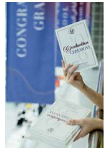
Every banner tells a story, every programme marks a milestone - celebrating the journey of the Class of 2026.