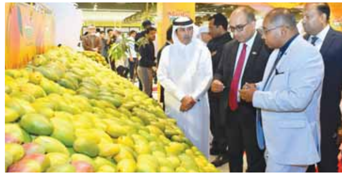
The festival features a wide range of popular and premium mango varieties, including Alphonso, Kesar, Badami, Langra, Dasher, and Mallika, among others.