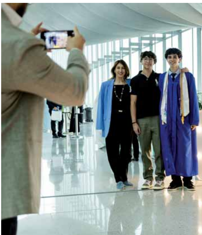
Proud smiles, warm embraces, and memories to last a lifetime as families celebrate their graduates.

As education continues to adapt to global challenges, the ASD's model highlights a growing shift, one that views success not as a final outcome, but as a continuous journey shaped by purpose, perspective and the ability to thrive in an interconnected world.