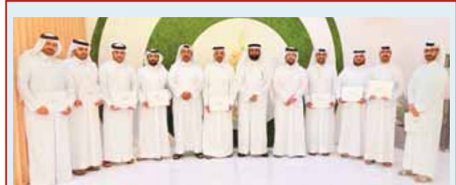
The programme forms part of the ongoing co-operation between Al Jazeera Media Institute and Vodafone Qatar, which focuses on supporting employee development and strengthening media and communication capabilities.

Through the centre, QU continues its efforts to provide an integrated educational environment that promotes early learning and supports the development of future generations capable of continuing their educational journeys with confidence and competence, in alignment with national development priorities and Qatar National Vision 2030.