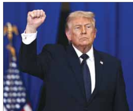
US President Donald Trump raises a fist as he departs after delivering a speech about the economy at Rockland Community College Fieldhouse in Suffern, New York, on Friday.