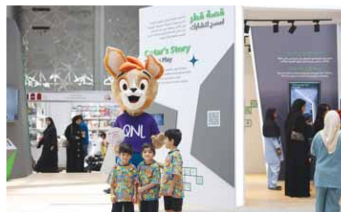
Children at DIBF 2026

designed to appeal to a wide audience. Families discovered the "Ready for School" initiative through "Dream Big, The Hero is You," allowing children to create personalised digital stories.