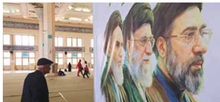
An Iranian man walks past an image of former and the current Iranian supreme leaders, Ayatollah Ruhollah Khomeini (L), Ali Khamenei, and his son, the current leader Mojtaba Khamenei (R), in Tehran yesterday.

• The writer is a leading scholar specialising in Gulf politics and international political economy, and a fellow at the Baker Institute and co-director of the Middle East Energy Roundtable.