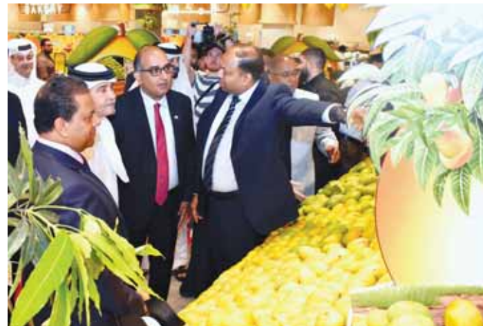
LuLu is presenting more than 40 varieties of premium Indian mangoes sourced from various regions across India.

The mango promotion is currently running across all LuLu Hypermarket outlets in Qatar, offering customers a unique opportunity to enjoy the finest flavours of India's mango season.