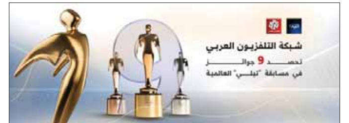
Awards won by Alaraby Television Network at 2026 Telly Awards.