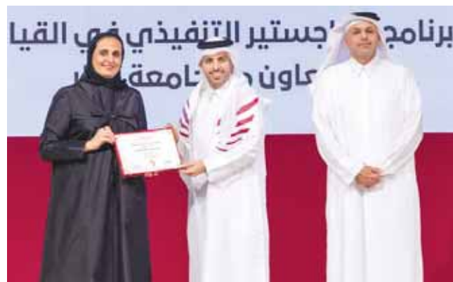
Snapshots from the ceremony.

"These experiences provided valuable opportunities for knowledge exchange and exposure to global best practices, further strengthening leaders' readiness for the future," he said. "Today marks the beginning of a new chapter of responsibility and continued growth, where our graduates will serve as role models in giving, pioneers in innovation, and ambassadors of values, contributing to the continued progress and prosperity of the nation."