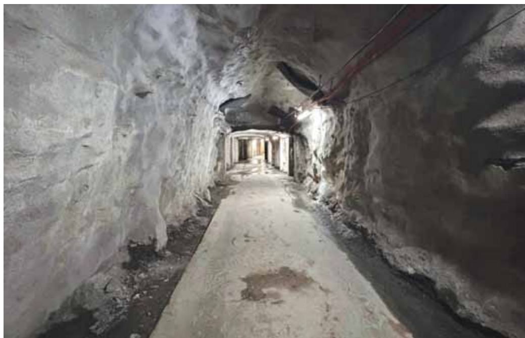
A tunnel in one of Oslo's largest bomb shelters in Hanshaugen.

Building shelters is among the 100 proposals included last year in a white paper.