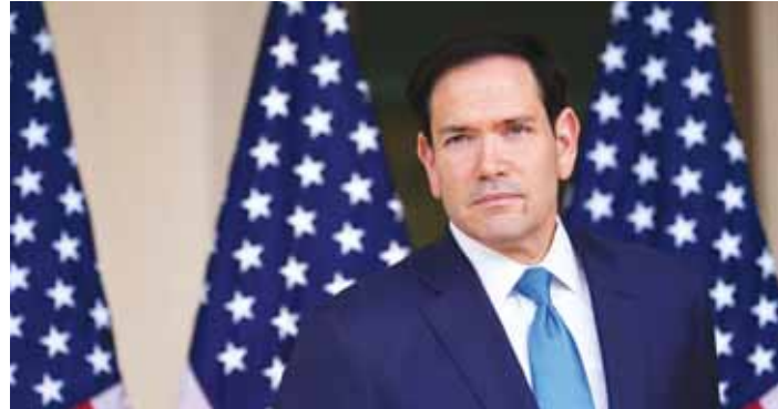
Marco Rubio during a ceremony for an annex building at the US embassy in New Delhi yesterday.

Cutting a ribbon earlier at a new US embassy building, Rubio said the US-India relationship lay "at the cornerstone of our approach to the Indo-Pacific". Such glowing statements were for decades routine between the US and India.