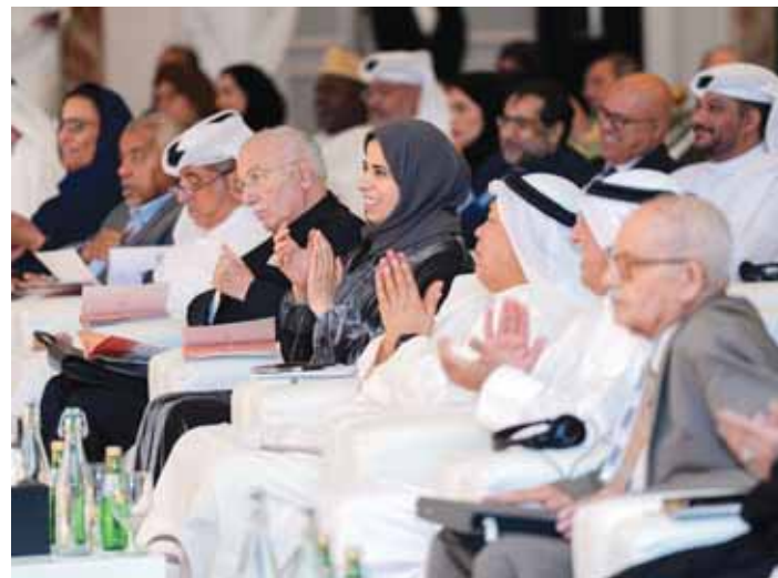
the symposium would achieve its desired objectives. This was followed by the keynote lecture delivered by the distinguished historian, Prof Ekmeleddin Ihsanoglu, on new trends in the study of the history of Islamic science.

The symposium's proceedings were divided into two academic tracks, which included intensive academic sessions on: The history of science and Islamic scientific thought, networks of transmission of ideas and sciences to