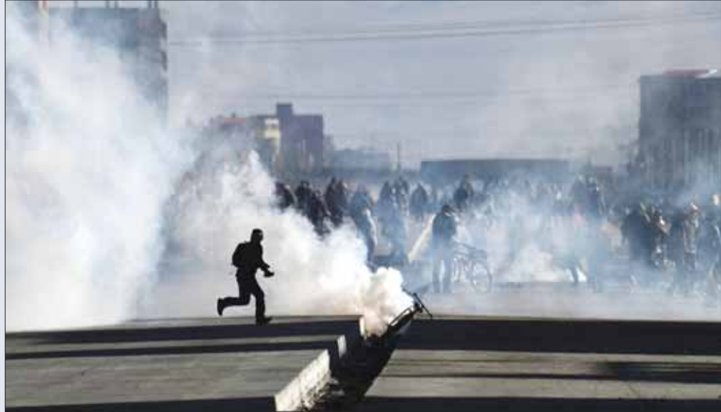
Security forces use tear gas during nationwide protests aiming to press Bolivian President Rodrigo Paz's government to roll back austerity measures and address rising costs of living, in El Alto, Bolivia, yesterday.