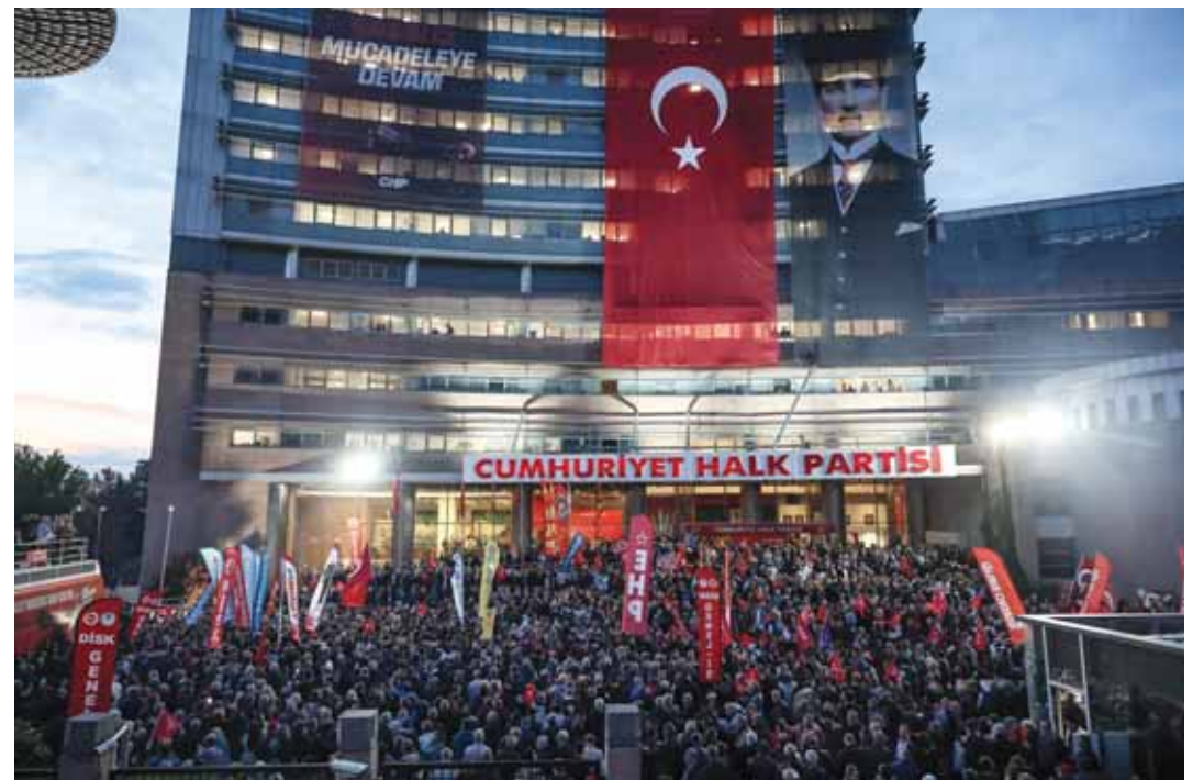
Supporters gather during a protest attended by the leader of Republican People's Party (CHP) Ozgur Ozel at their party headquarters in Ankara on Friday.

The government denies criticism that it uses courts to target political rivals, saying the judiciary is independent.