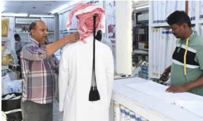
Demand has been especially strong for men's thobes, which remain one of the most commonly worn traditional garments during religious and national celebrations

The Eid season is widely regarded as an important social and cultural occasion in Qatar, where families gather to celebrate and exchange visits. Wearing new clothes during Eid is considered an essential tradition, particularly among children and young people who eagerly anticipate the festivi-