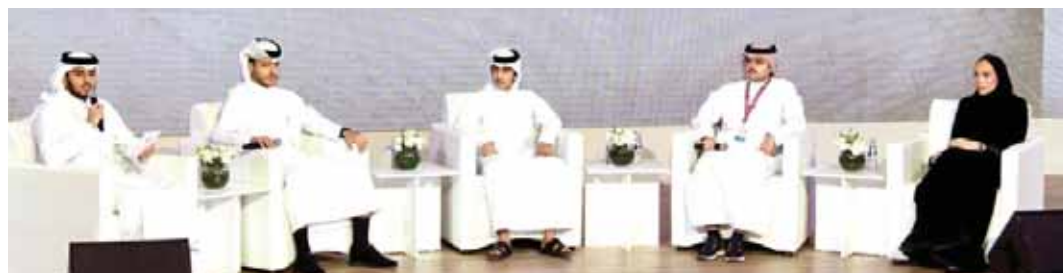
Participants in the session on the 'Reading Guide' initiative.

Those accepted also underwent specialised training programmes and workshops aimed at training them to evaluate books and provide appropriate reading guidance to the public according to their age