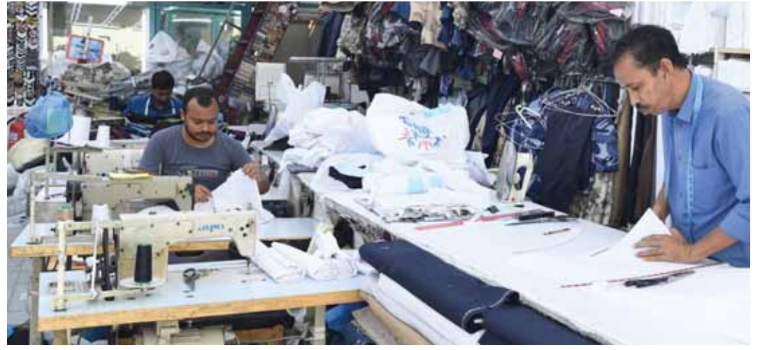
Tailoring shops at Souq Al Ali are experiencing increasing rush ahead of Eid al-Fitr.

Accordingly, many tailoring shops have extended their working hours until late hours in the evening to cope with the large number of orders. Some businesses have also recruited additional workers and temporary staff to accelerate work and maintain delivery schedules. However, some tailors continue to receive last-minute orders from customers hoping to obtain new garments before the start of Eid celebrations. Shop owners say the pressure during this period is intense but expected, as Eid consistently represents one of the most profitable seasons for the tailoring and fashion industry in the country. The weeks leading up to the holiday often determine a significant por-