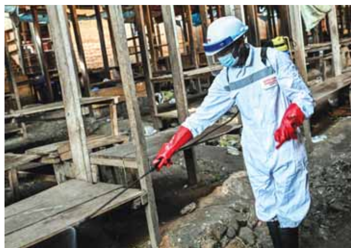
A sanitation worker from the Bunia city government sprays chlorine at the central market yesterday.

There are 82 confirmed cases and seven confirmed deaths in the vast, unstable DRC, alongside almost 750 suspected cases and 177