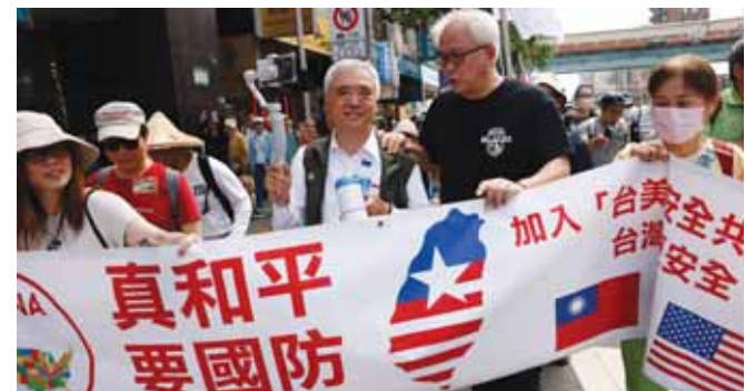
People rally in support of the government's plans to increase defence spending in Taipei yesterday.

One would bar payments to January 6 rioters who assaulted law enforcement at the Capitol, while others would prohibit the use of any taxpayer money to make payments, and require all payments to be made public if the fund survives, a spokesperson for the senator said.