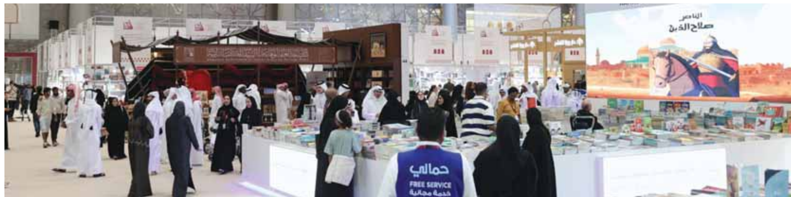
The 35th Doha International Book Fair at the DECC, which concluded yesterday, witnessed a huge public turnout since its opening on May 14.