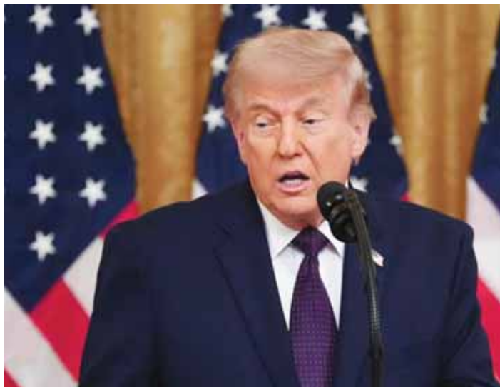
US President Donald Trump speaks during a swearing-in ceremony for new Chairman of the Federal Reserve Kevin Warsh in the White House on Friday.

While many Republican senators were uncharacteristically mum coming out of a Thursday meeting on the spending bill, Tillis and others were clear on just how politically unpalatable the president's demands had become.