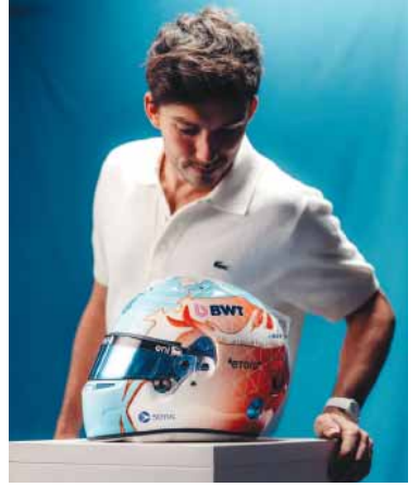
Pierre Gasly will debut a helmet designed by Qatari artist Ghada al-Suwaidi.

By integrating artistic expression into global sporting events, the initiative creates opportunities for artists to engage with international audiences while reinforcing the role of creativity in building lasting human connections.