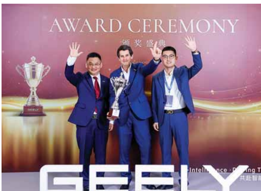
"This achievement is the result of our firm commitment to delivering the highest standards of quality and operational excellence. Jaidah Group continues to work towards providing an exceptional customer experience throughout every stage of the sales and after-sales journey."