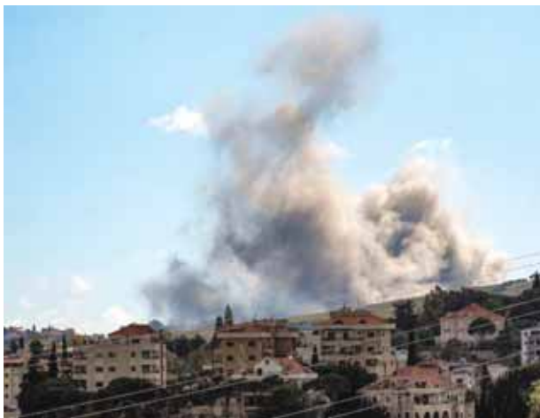
Smoke rises following Israeli bombardment on the village of Jibshit in southern Lebanon yesterday.

The Israeli military late on Friday night had issued