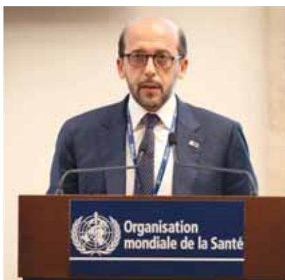
HE al-Mahmoud said that Qatar's approach to healthy longevity is grounded in a prevention-focused strategy.

She stressed the importance of strengthening primary healthcare to reduce the gap between life expectancy and