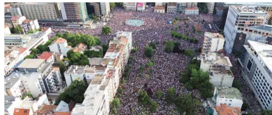
A drone view of demonstrators attending a student-led protest in Belgrade yesterday.

The organisers had called for a rally between 6:00 pm (1600 GMT) and 8:00 pm.