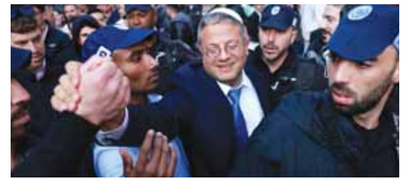
Ben Gvir, Israel's minister of national security.

In the video, dozens of activists are seen forced to kneel with their foreheads to the ground and their