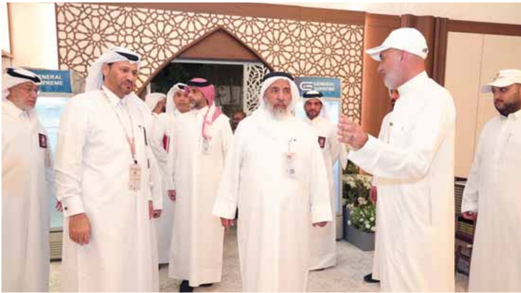
HE Minister of Endowments (Awqaf) and Islamic Affairs and Head of the Qatari Haj Mission, Ghanem bin Shaheen al-Ghanim conducts an inspection tour at camp sites.

Officials from Makkah Hospitality Company confirmed that the Mina camps are equipped with multi-purpose seating for each pilgrim, which can be used as a bed or a seat. Each pilgrim also has a dedicated dining and reading table,