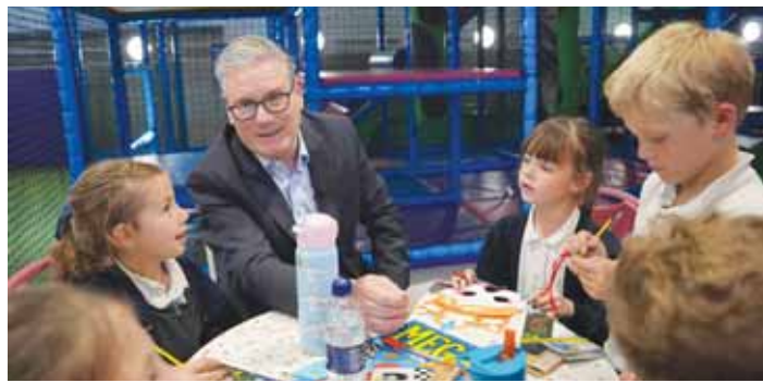
Britain's Prime Minister Keir Starmer visits a children's activity centre in Essex, yesterday.

The issue is expected to feature prominently in a high-stakes by-election in northwest England next month that could determine Starmer's political fate, as potential leadership rival Andy Burnham bids to return to parliament.