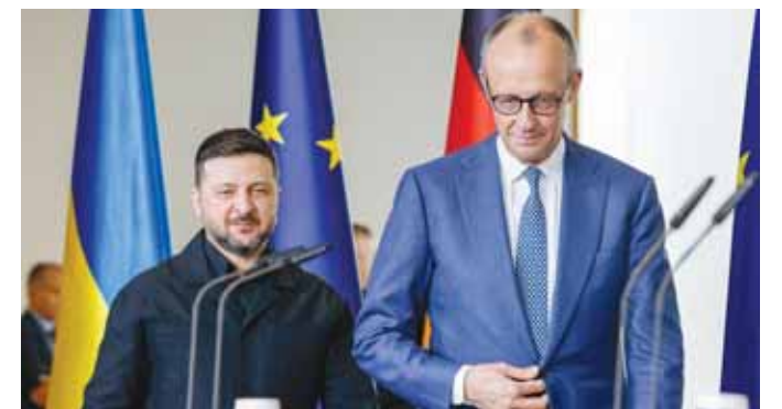
German Chancellor Friedrich Merz and Ukrainian President Volodymyr Zelensky on the day of the German-Ukrainian government consultations, at the Chancellery in Berlin.

"What I envisage is a political solution that brings Ukraine substantially closer to the European