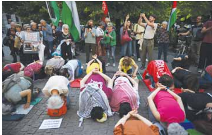
People take part in a flash mob entitled "In the same boat" to protest against the detention and treatment by Israel of activists participating in the Global Sumud Flotilla, in Milan, yesterday.

Tajani wrote on X yesterday that he had requested sanctions against the minister for "seizing the activists in international waters and subjecting them to harassment and humiliation, in violation of the most basic human rights".