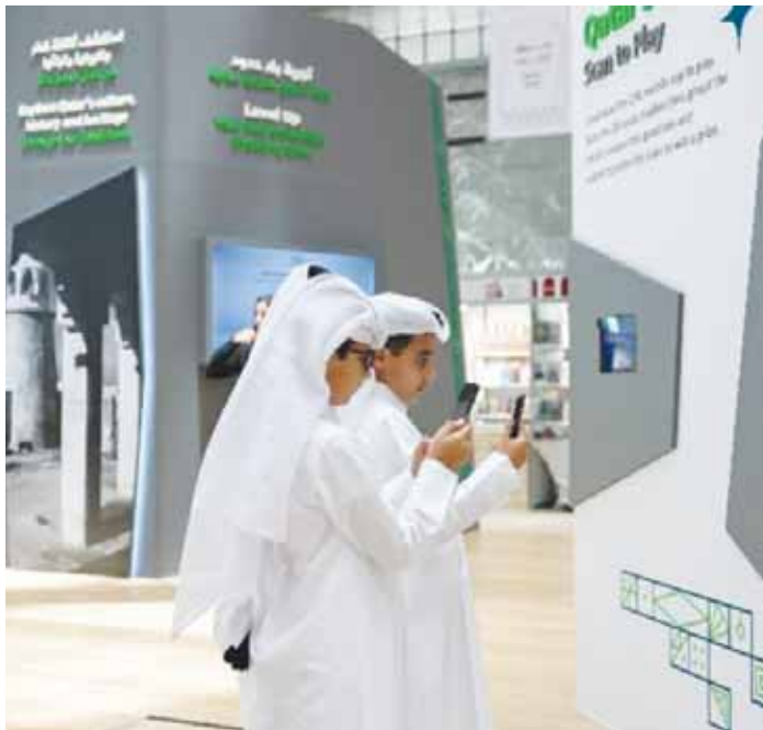
Youth at QNL interactive pavilion.

Dr Nizar Shaqroun stressed that the image is no longer merely an aesthetic element or visual medium, but has evolved into a central language in shaping contemporary knowledge and awareness. He noted that people today live in a world increasingly dominated by images and visual