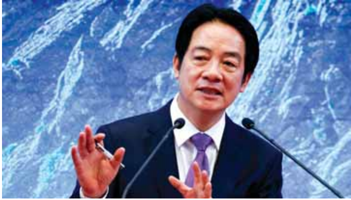
Taiwan President Lai Ching-te speaks at a news conference on the second anniversary of his taking office, at the presidential building in Taipei.

Lai said Taiwan was "committed to maintaining the stable status quo in the Taiwan Strait" and that "China is the disruptor of peace and stability", the Tai-