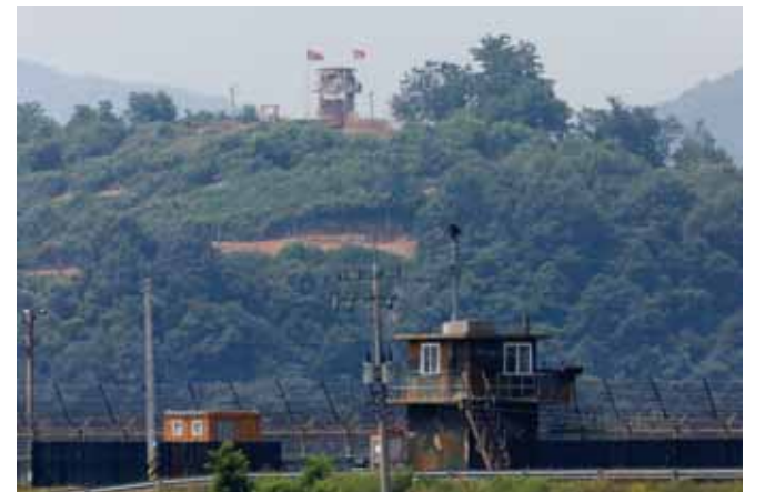
A North Korean soldier stands guard at his guard post inside North Korean territory, in this picture taken from Paju, Republic of Korea.