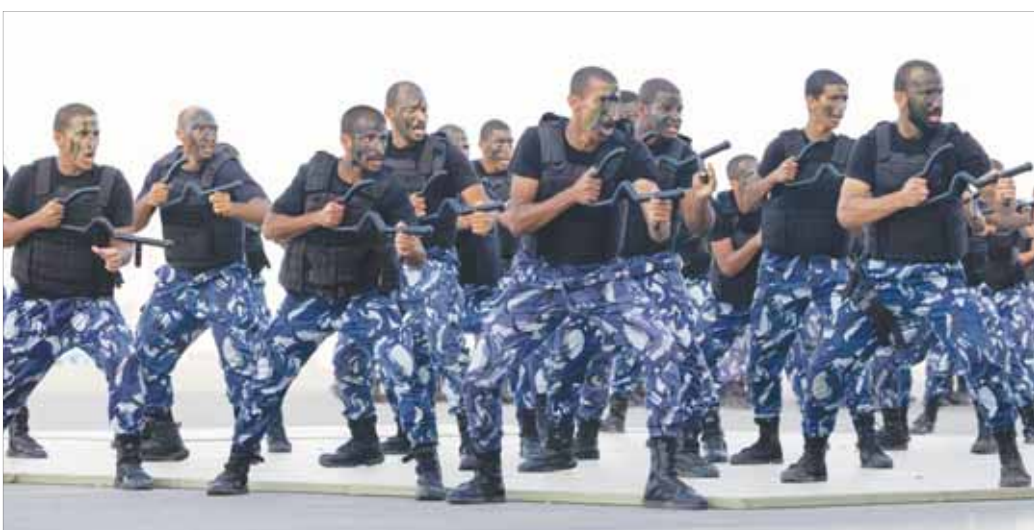
Special Operations Command personnel advance in formation during the joint final exercise at Zekreet Camp, marking the conclusion of the first phase of the Internal Security Force (Lekhwiya) 2026 training programme. Page 2