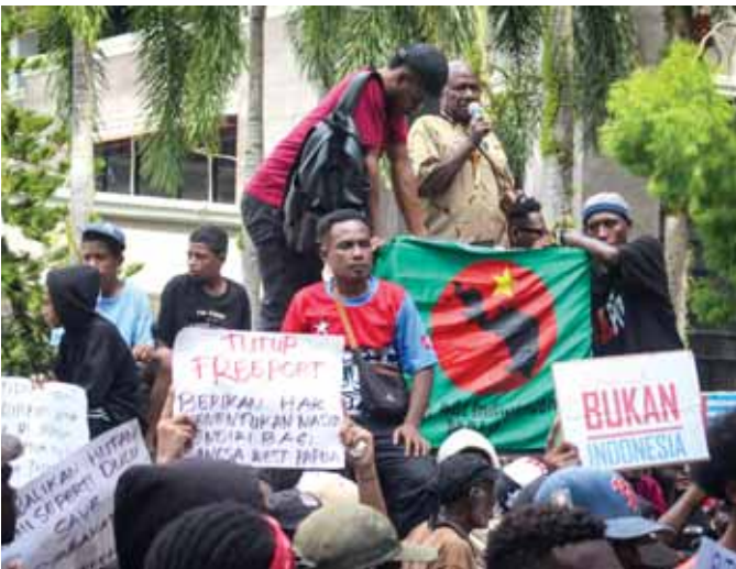
Indigenous Papuans and university students take part in a protest against the government's National Strategic Projects (PSN) and increased military presence in Papua, which demonstrators say threaten traditional lands and the rights of Indigenous Papuans, outside the Southwest Papua governor's office in Sorong yesterday.

Papua, which shares an island with Papua New Guinea, is a former Dutch colony that declared independence in 1961.