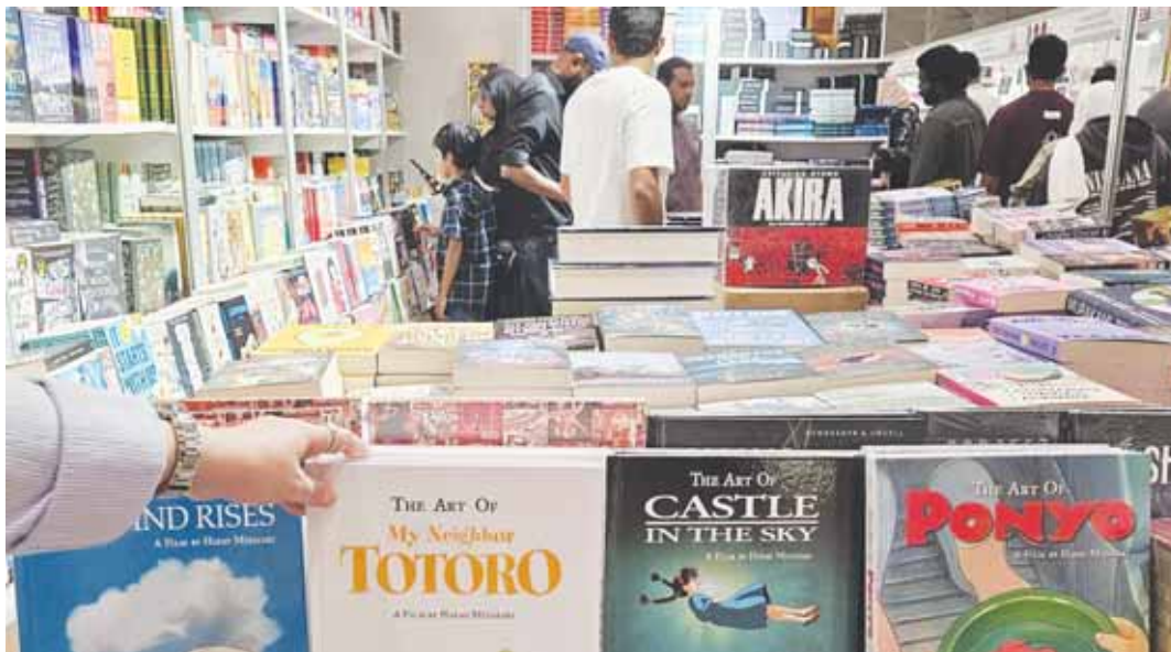
Visitors browse shelves featuring Japanese animation classics, including Hayao Miyazaki's The Wind Rises, My Neighbor Totoro, Castle in the Sky, and Ponyo, alongside other popular titles.

"It was deeply exciting to see such a wide range of comics available," she said, and explained that reading manga with friends