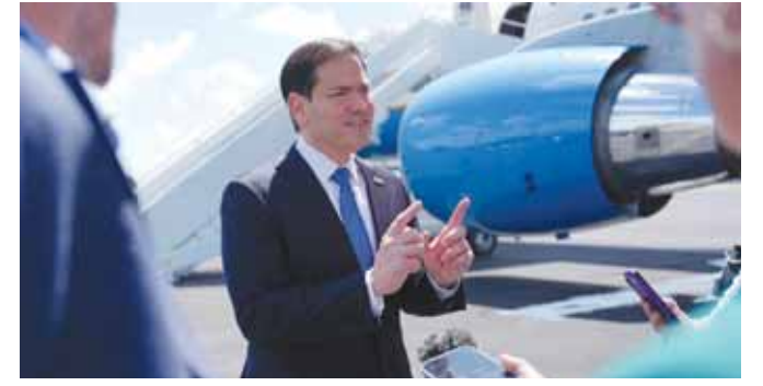
Secretary of State Marco Rubio speaks to the press before boarding his plane at Homestead Air Reserve Base, Florida, yesterday.