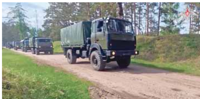
Military trucks drive along a road during nuclear forces exercises at an unidentified location in Belarus, yesterday.

Russia and Belarus began joint nuclear drills this week involving thousands of troops, planes and