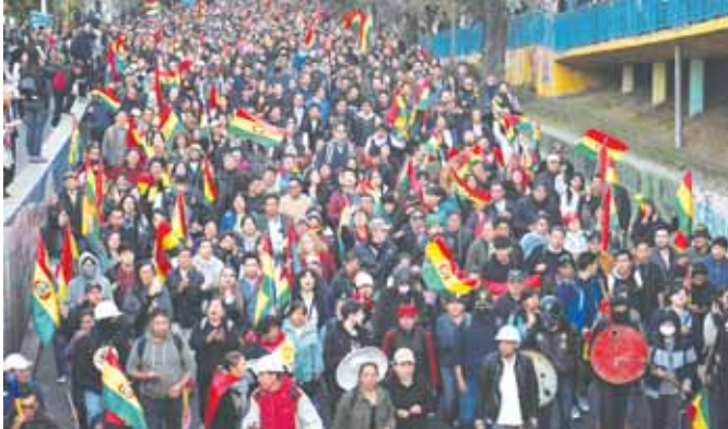
Demonstrators take part in a march, which organisers have dubbed a “defence of democracy,” to rally against road blockades and what they call pressure measures used by protesters calling for the resignation of Bolivia's President Rodrigo Paz, amid the country's economic and fuel crisis, in La Paz.