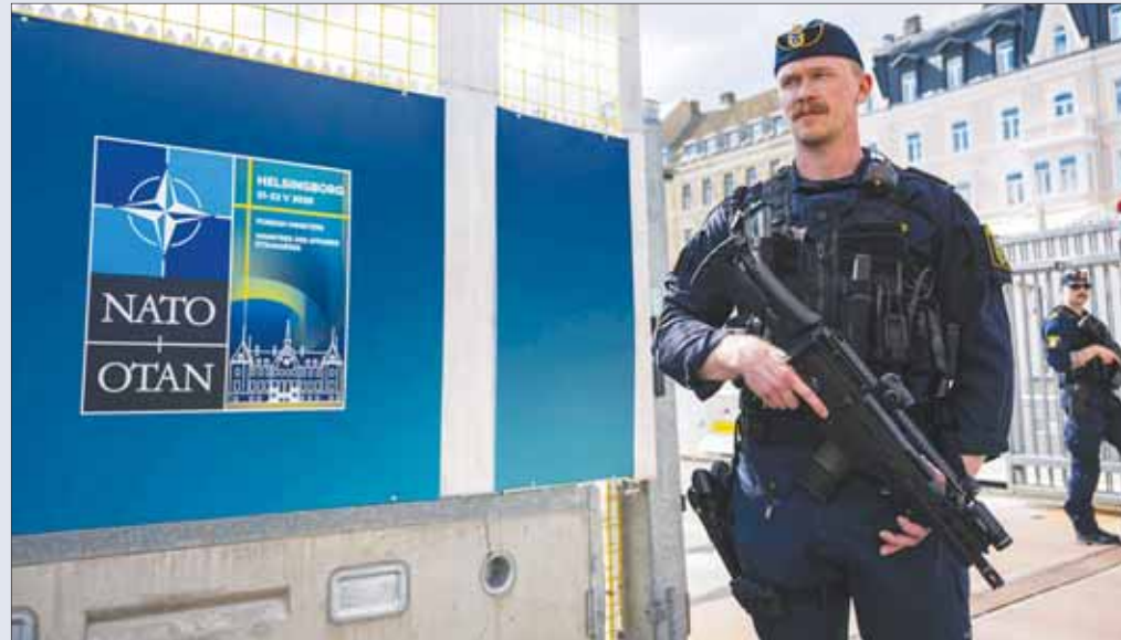
A Swedish police officer stands guard outside the venue ahead of the meeting of Nato Ministers of Foreign Affairs in Helsingborg, Sweden. Nato foreign ministers gather in Helsingborg on May 21-22 for talks focused on security, defence co-operation and regional stability. (AFP)