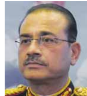
Field Marshal Asim Munir

Iran's ISNA news agency said Munir's visit was aimed at continuing "talks and consultations" with Iranian authorities, without providing further details. Three sources told Reuters the army chief - a powerful figure