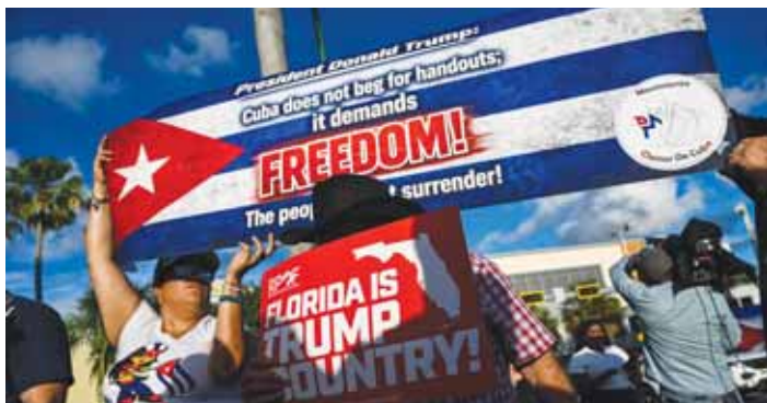
People hold signs outside Versailles Restaurant in support of charges announced by US federal prosecutors against the former Cuban president in Miami.