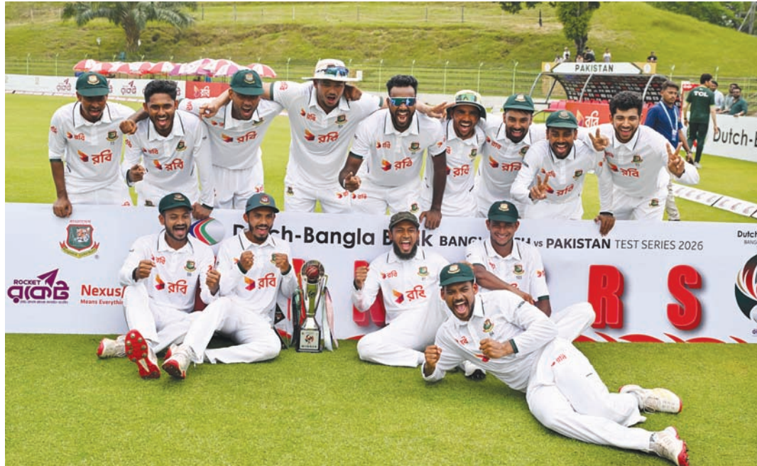
Bangladesh's players pose with the tournament trophy after winning the second Test against Pakistan at the Sylhet International Cricket Stadium in Sylhet yesterday.

Sajid for his 18th Test five-wicket haul and pace bowler Shoriful Islam had Rizwan caught in the next over to end Pakistan's resistance.