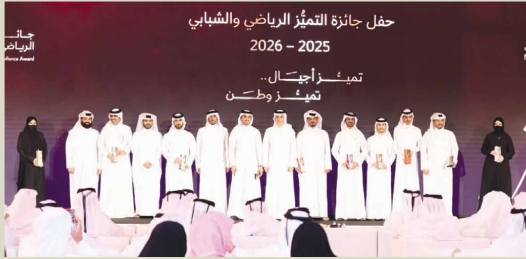
The winners at the Sports and Youth Excellence Award ceremony for the 2026-26 season held yesterday.

the award recipients, commending their exceptional efforts and remarkable achievements, which embodied determination, commitment, and excellence. The Minister said the fifth edition of the Sports and Youth Excellence Award marks a significant milestone in strengthening a culture of institutional excellence in Qatar. He noted that the award has evolved beyond an annual recognition program into a comprehensive national framework that motivates institutions and individuals to adopt best practices and elevate performance standards based on quality, sustainability, and innovation. The Minister further stated that the award's continuous development reflects the dedicated efforts of sports and youth institutions to enhance their programs and initiatives in alignment with Qatar's vision of investing in people and building national capabilities. Through its successive editions,