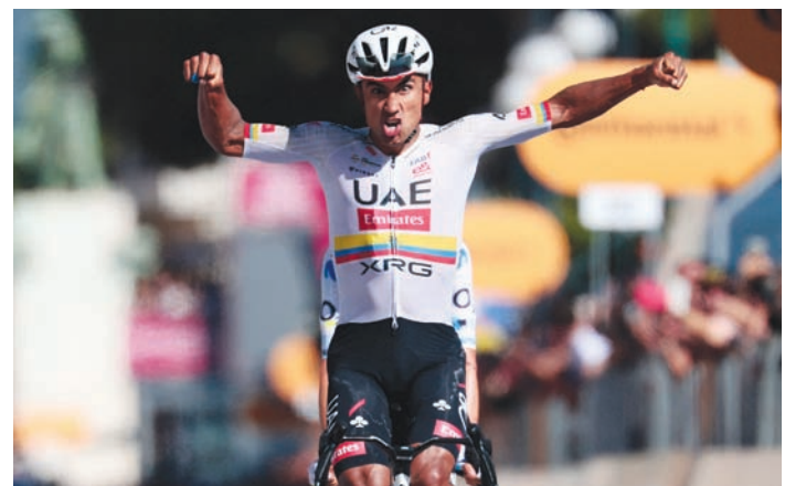
Jhonatan Narvaez celebrates as he crosses the finish line to win the 11th stage of Giro d'Italia between Porcari and Chiavari in Italy yesterday.

The peloton, containing all the GC contenders, trailed in over three minutes behind the winner, and Eulalio (Bahrain Victorious) will wear the pink in Thursday's stage 12, a flat 175-km ride from Imperia to Novi Ligure.