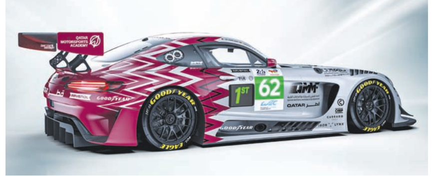
Team Qatar is set to compete in the LMGT3 category aboard the Mercedes-AMG Motorsport LMGT3 at 24 Hours of Le Mans.