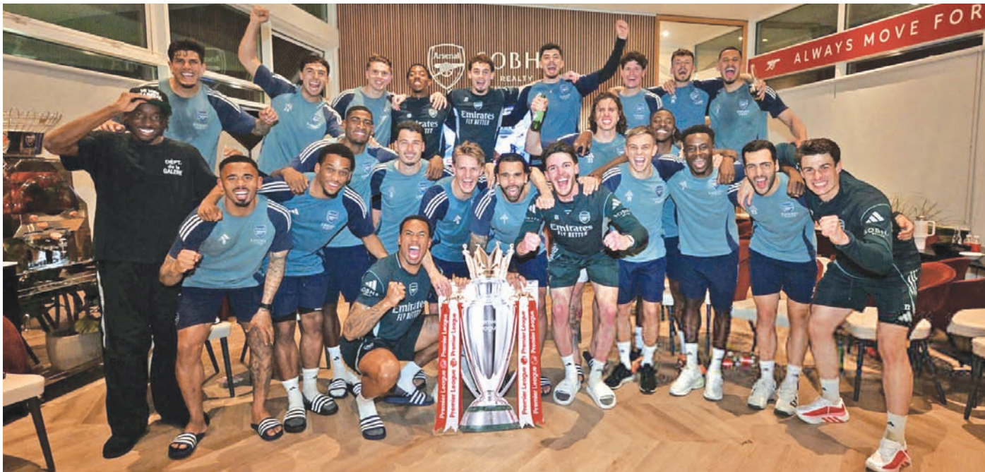
Arsenal players celebrate after being confirmed as Premier League champions for the first time in 22 years.

Arteta's side had faced accusations of "bottling" their title bid