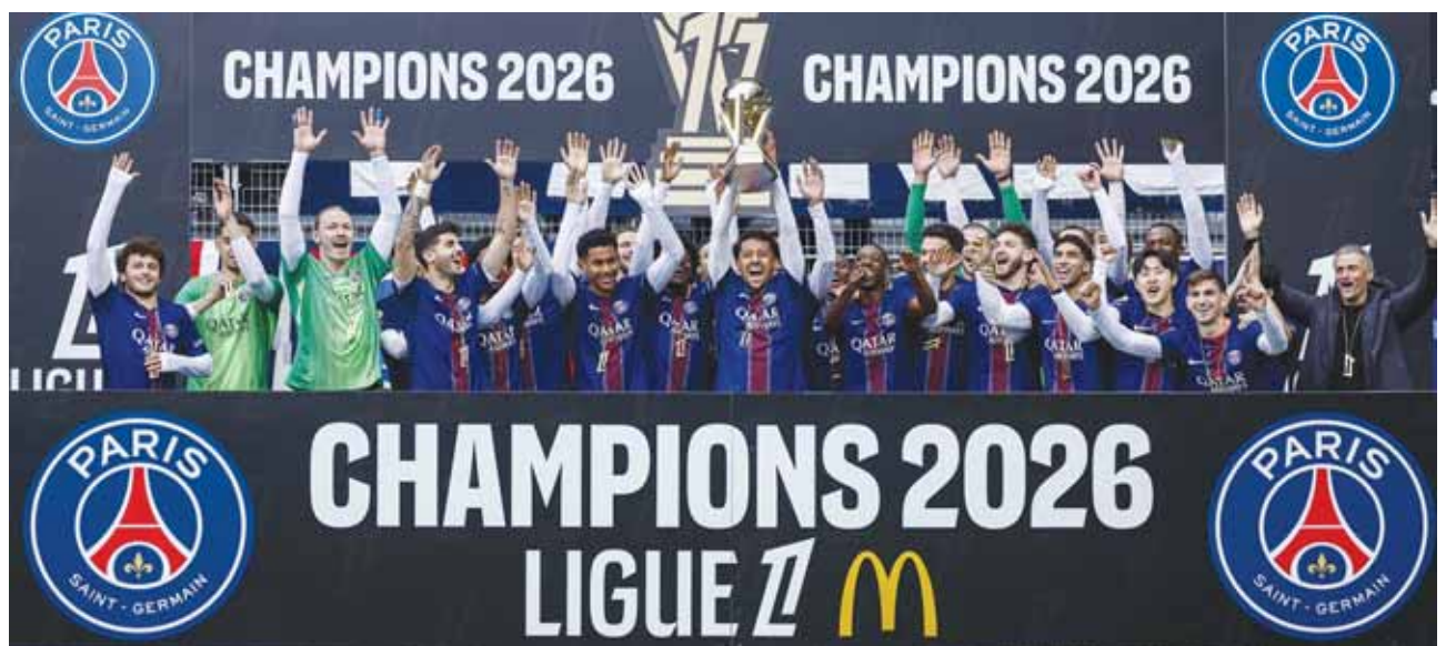
PSG players and head coach Luis Enrique (right) celebrate with the Ligue 1 trophy on Sunday. PSG, who had already secured their fifth straight title, were beaten 2-1 by local rivals Paris FC on Sunday.

fered numerous physical setbacks this season, particularly thigh and calf issues. Meanwhile, Achraf Hakimi resumed indi-