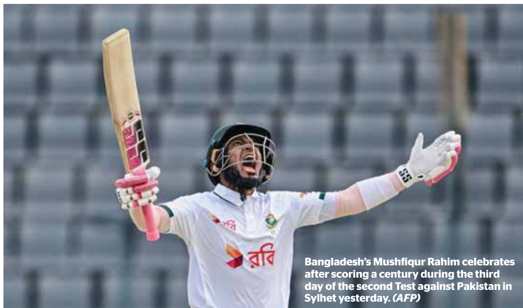
Bangladesh's Mushfiqur Rahim celebrates after scoring a century during the third day of the second Test against Pakistan in Sylhet yesterday.

the first innings, looked good for another big score but fell to Hasan Ali at deep third-man.