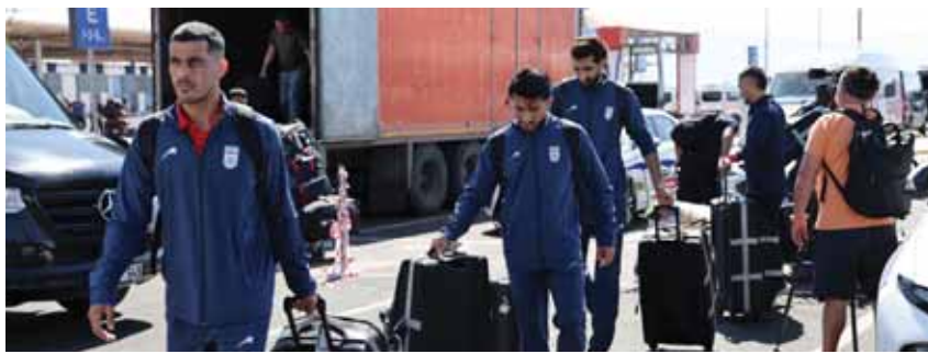
Iran players on their arrival at Antalya airport in southern Turkey.

But with negotiations in the doldrums, new weekend drone attacks on Gulf countries and fresh threats from US President