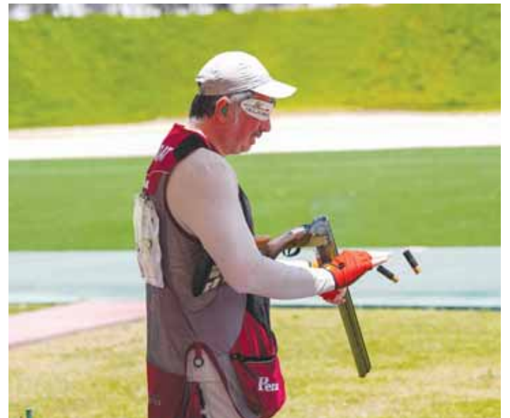
A Qatari shooter in action during the competitions held at the Lusail Shooting Complex at the 4th GCC Games - Doha 2026. The opening day of the trap competition featured strong and exciting contests in the men's and women's individual and team categories, with shooters competing over 75 targets across three rounds of 25 targets each.