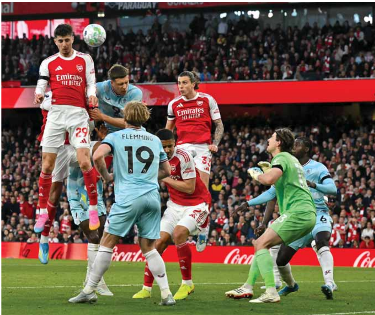
Arsenal's German midfielder Kai Havertz heads the ball to score during the Premier League match against Burnley at the Emirates Stadium in London yesterday.

Havertz raked his studs down the calf of Lesley Ugochukwu in a mistimed challenge.