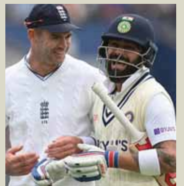
TWO GREATS: Jimmy Anderson (left) with Virat Kohli.

I think Virat Kohli has inspired a generation of players. He has done wonderful things for world cricket. Similarly players like Steve Smith, Dale Steyn, Kane Williamson and Joe Root have inspired everyone with their phenomenal, sustained performances over the years. Jimmy Anderson is also on my list as one of the most impactful players. I played against him but he became a regular after I retired (in 2007). He was awesome. Virat and Anderson are two players who have been top performers. Their longevity in cricket is admirable. Virat took cricket fitness to a new level. He set the standards for the new or young players. Anderson changed the concept for fast bowlers who would retire at the ages of 33 or 34. Anderson showed that you can play as long as you want with proper fitness.