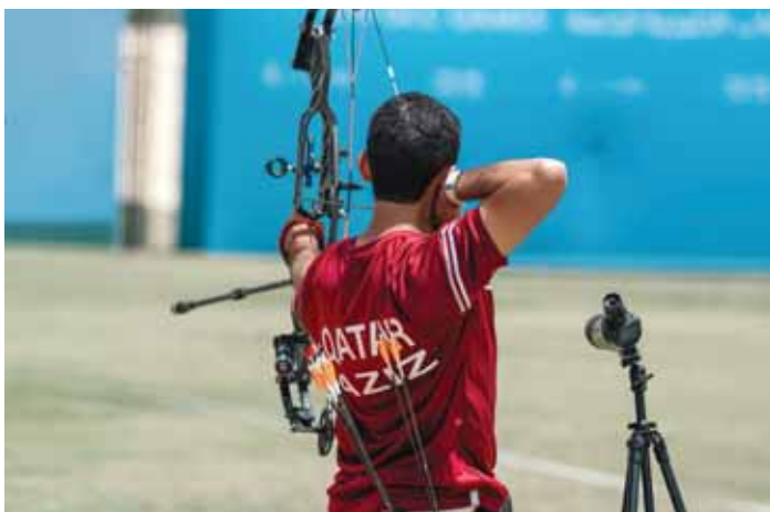
A Qatari athlete in action during the archery competition.