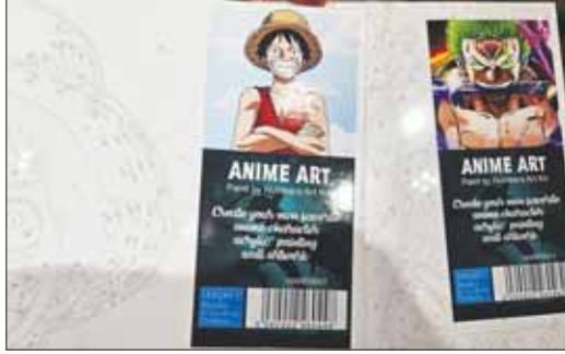
The Harpers Books & Creativity stall draws a wide range of customers with kits featuring characters from popular Japanese manga and anime alongside classical paintings.

At his DIBF stall, visitors can commission personalised bookmarks and small calligraphic items, while also browsing an array of supplies, including nibs, pen holders, inks, gouaches, and paper.