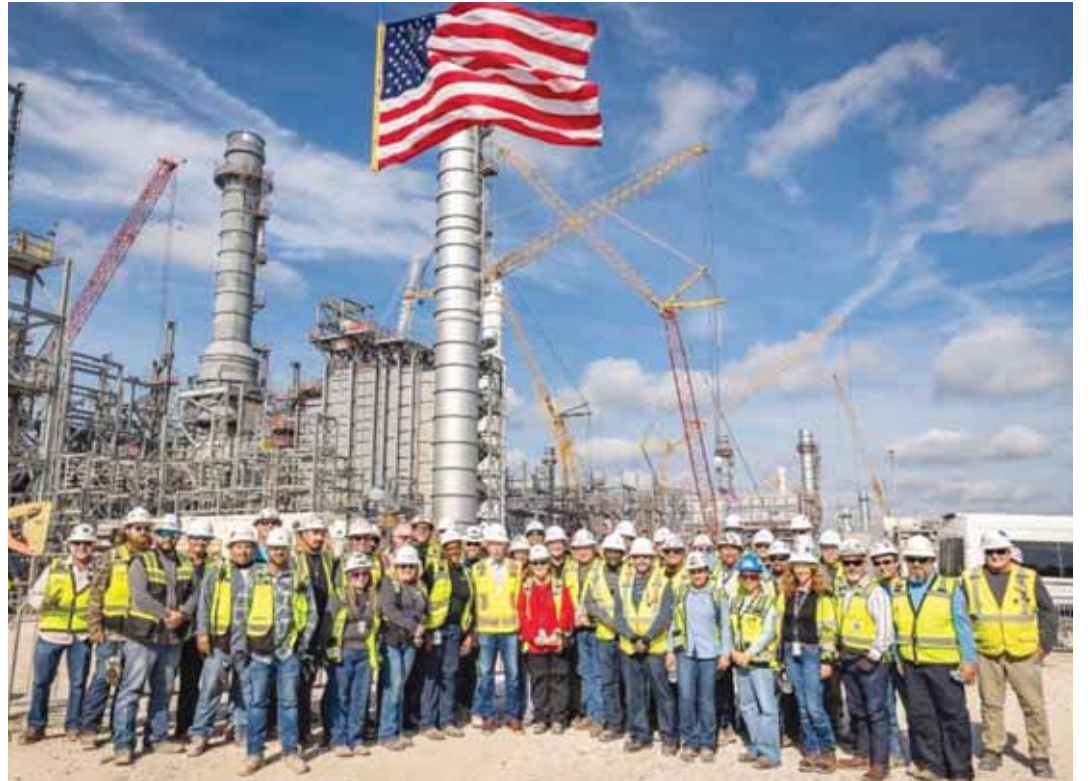
Golden Pass LNG will produce up to 18 MTPA of LNG when its three LNG trains are fully operational.

"I would like to thank the government of the United States and the legislature of the State of Texas for their valued support of this project, as well as our strategic partner ExxonMobil, and all