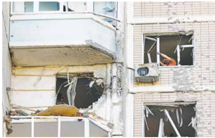
Residents clear broken windows in a damaged apartment building following a Ukrainian drone attack in Krasnogorsk, Moscow region, yesterday.

On Saturday night, AFP journalists were granted rare access to an undisclosed location where Ukraine launched its long-range drones from, in what turned out to be one of the largest pummelling of Russia during the conflict.