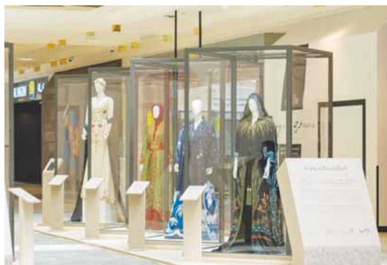
Part of the exhibition.

This edition presents a focused showcase of eight fashion pieces created by Qatari designers, each offering a contemporary interpretation of al-Hariri. Known for its rich storytelling, wit, and vivid characters, the work serves as a powerful source of inspira-