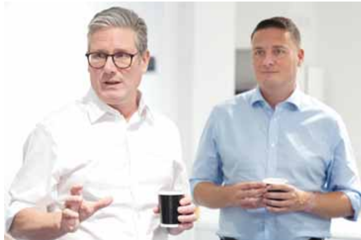
Prime Minister Sir Keir Starmer, left, and Health Secretary, Wes Streeting, in this file photo taken in 2024.

• The writer is a leading scholar specialising in Gulf politics and international political economy, and a fellow at the Baker Institute and co-director of the Middle East Energy Roundtable.