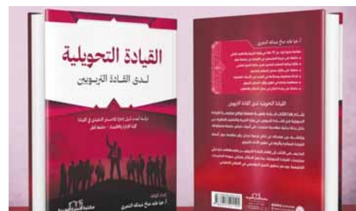
Cover page of Transformational Leadership for Educational Leaders.

panies over media places a major responsibility on societies to build awareness across all segments of the community.