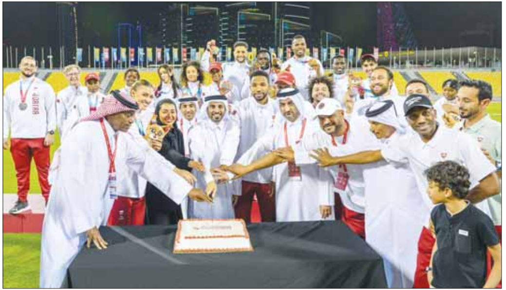
Qatar's athletes and Qatar Athletics Federation president Mohammed al-Fadala celebrate the home team's superb performances at the 4th GCC Games - Doha 2026 at Suheim Bin Hamad Stadium in Doha yesterday. Qatar ended the athletics campaign with 34 medals including 12 gold, 13 silver and 9 bronze. On the final day, Qatar added nine medals including two gold, five silver, and two bronze to secure top spot in GCC athletics.