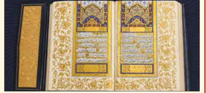
Copy of Ottoman Sultanic Qur'an