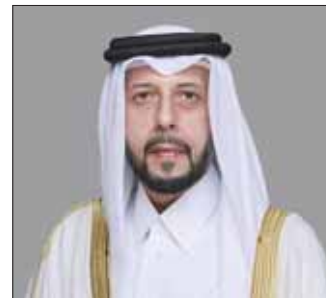
HE the Minister of Public Health Mansoor bin Ebrahim al-Mahmoud

Participants are set to address preparedness and plans for public health contingencies, as well as boost rehabilitation in