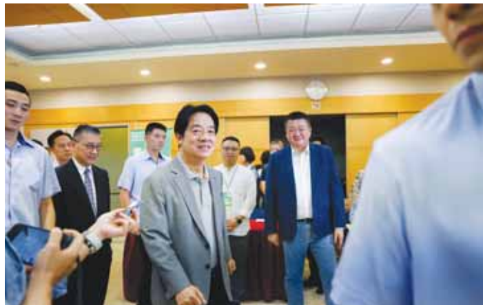
Taiwan President Lai Ching-te arrives at an event to mark the 40th anniversary of the founding of the Democratic Progressive Party in Taipei, Taiwan, yesterday.

China has never renounced the use of force to bring Taiwan under