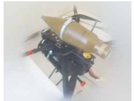
A FPV (first-person view) drone fitted with a PG-7 warhead in this image on social media.

• The writer is a news anchor, programme presenter and media instructor.