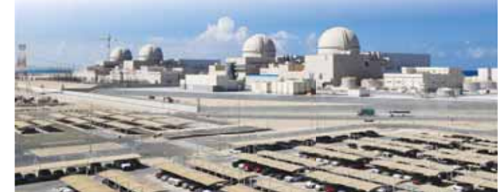
A file photo obtained from the media office of the Barakah Nuclear Power Plant on February 13, 2020 shows a general view of the power plant in the western Al Dhafra Region of Abu Dhabi.

H e the Prime Minister and Minister of Foreign Affairs Sheikh Mohammed bin Abdulrahman bin Jassim al-Thani held a telephone conversation yesterday with UAE Minister of Foreign Affairs Sheikh Abdullah bin Zayed al-Nahyan. During the call, the prime minister reiterated Qatar's condemnation of the attack on the UAE with three UAVs, one of which targeted the Barakah Nuclear Power Plant in Al Dhafra region. He stressed Qatar stands in full solidarity with the UAE in all measures it takes to safeguard its sovereignty, security, and the safety of its facilities. In addition, the PM underscored the importance of all parties engaging positively with the ongoing mediation efforts, which ultimately pave the way for addressing the root causes of the crisis through peaceful means and dialogue, culminating in reaching an enduring accord that prevents re-escalation. Meanwhile, in a statement issued yesterday, the Ministry of Foreign Affairs said the attacks marked a dangerous escalation through the targeting of vital facilities and civilian infrastructure. The ministry stressed the need to spare the region the consequences of such unjustified attacks and to intensify efforts aimed at de-escalation. (QNA)