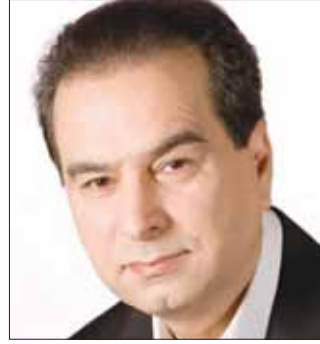
By Jasim al-Azzawi

In the ruined townships of southern Lebanon, a new kind of war has emerged – one that no Iron Dome can intercept and no electronic warfare suite can blind. A small quadcopter, guided not by radio waves but by a hair-thin fibre-optic cable unreeled silently behind it, skirts rooftops before slamming into an Israeli Merkava tank with the precision of a surgeon's scalpel. Israel's multibillion-dollar defence architecture is, in this moment, rendered irrelevant by a spool of cable and a repurposed commercial drone.