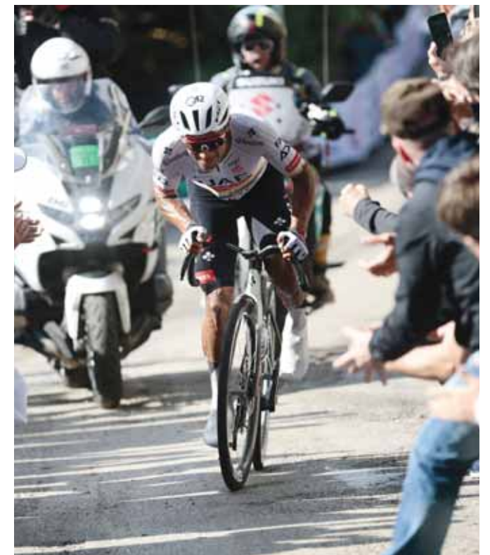
UAE Team Emirates - XRG Ecuadorian rider Jhonatan Narvaez sprints to win the 8th stage of the Giro d'Italia between Chieti and Fermo, Italy, yesterday.

Some 15 riders have pulled out so far by comparison with 25 who never made it as far as Rome in 2025.