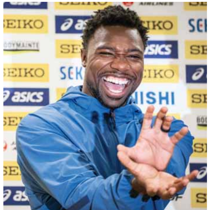
US' Noah Lyles poses after a press conference ahead of the Golden Grand Prix Athletics 2026 in Tokyo yesterday.

"I'd say by the time I leave tomorrow, I want to have my fastest season opener."