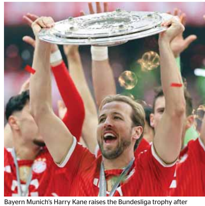
Bayern Munich's Harry Kane raises the Bundesliga trophy after winning the match against Cologne in Munich yesterday.