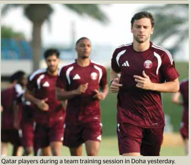
Qatar players during a team training session in Doha yesterday.