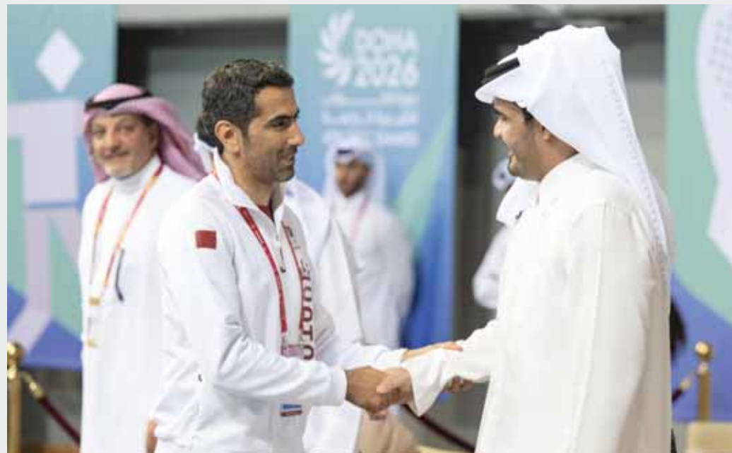
HE Sheikh Joaan bin Hamad al-Thani, President of the Olympic Council of Asia, President of the Qatar Olympic Committee, President of the Organizing Committee for the 4th Gulf Games - Doha 2026, meets with Qatar's padel player Mohammed Saadon al-Kuwari.