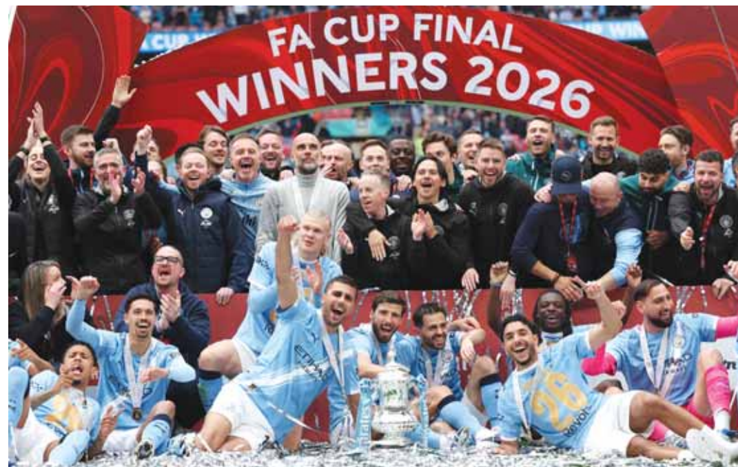
Manchester City's players and staff celebrate with the trophy after winning the FA Cup in London yesterday.

His attention will turn back to City's slender hopes of making it 21 pieces of silverware with a miracle in the Premier League title race. City, on a 21-game unbeaten domestic run, will be five points behind leaders Arsenal if the Gunners beat relegated Burnley at home on Monday.