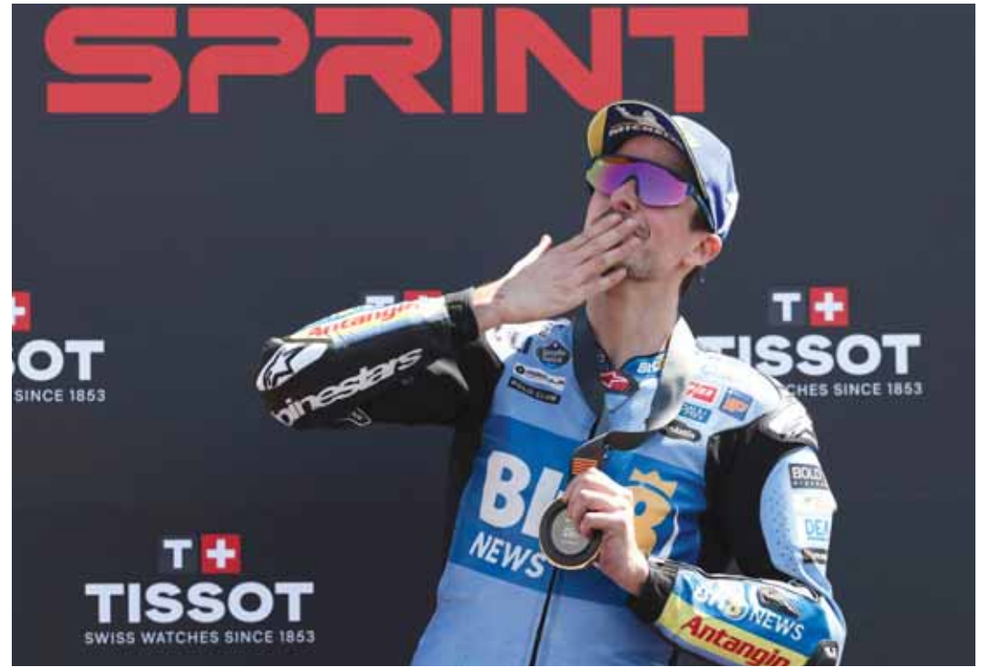
Team Gresini Racing MotoGP's Alex Marquez celebrates winning the sprint at the Catalunya MotoGP Grand Prix at the Catalunya racetrack in Montmelo, near Barcelona, yesterday.

Championship leader Marco Bezzecchi finished ninth to take only one point while Martin now sits two points behind his Aprilia teammate going into today's race.