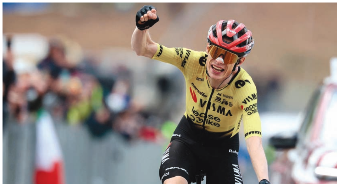
Team Visma Lease a Bike Danish rider Jonas Vingegaard celebrates as he crosses the finish line to win the 7th stage of the Giro d'Italia 2026 - Tour of Italy cycling race between Formia and Blockhaus, Italy, yesterday.

Today's stage eight is a 156-km ride from Chieti to Fermo.