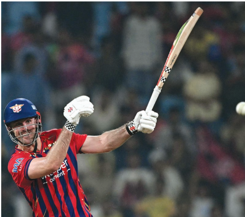
Lucknow Super Giants' Mitchell Marsh plays a shot during the IPL match against Chennai Super Kings at the Ekana Cricket Stadium in Lucknow yesterday.

He unloaded a series of bruising pulls while fellow Australian and opener Josh Inglis was largely