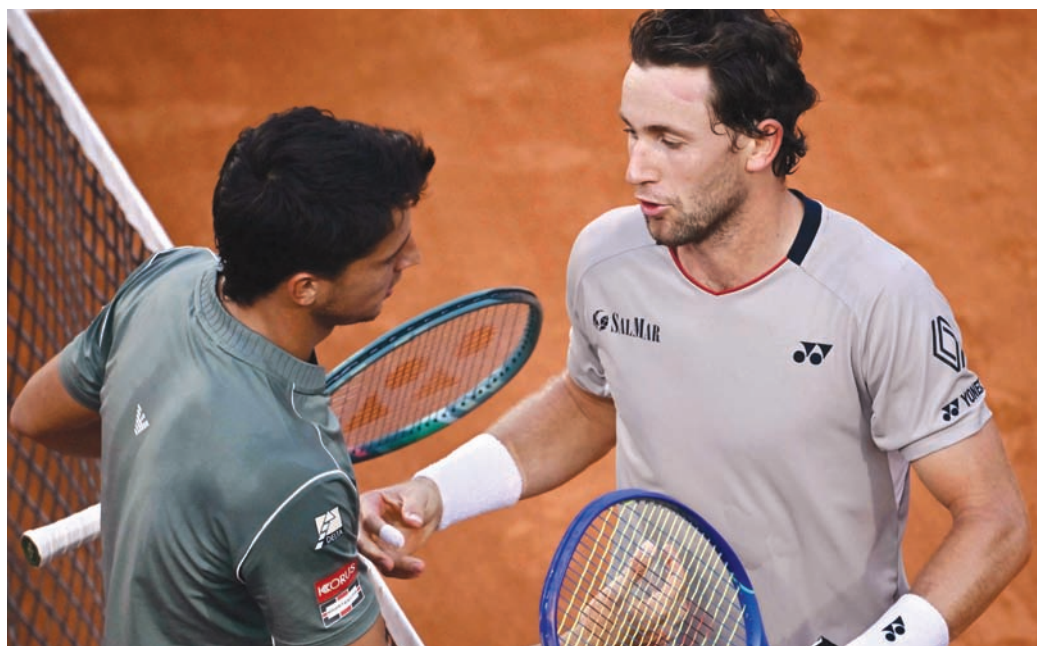
Italy's Luciano Darderi (left) shakes hands with Norway's Casper Ruud after being defeated in their semi-final at the ATP Rome Open at Foro Italico in Rome yesterday.

Such was the comprehensive nature of his victory there was a small delay to Daniil Medvedev which was scheduled to start no earlier than