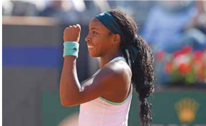
USA's Coco Gauff celebrates after winning against Romania's Sorana Cirstea in the Italian Open yesterday.

win for me, if I win great but even if things don't go well that's OK because I'll have a few more days to prepare for Paris, which is my main objective this year."