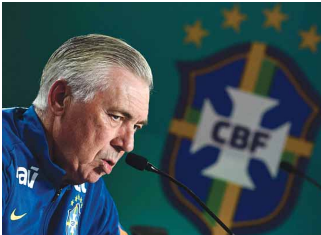
Ancelotti faces pressure selecting Brazil's World Cup squad amid injuries and Neymar uncertainty

Brazil, who are joint-fourth favourites with holders Argentina to win the World Cup behind European champions Spain, France and England, face Morocco, Haiti and Scotland in Group C. "It weighs