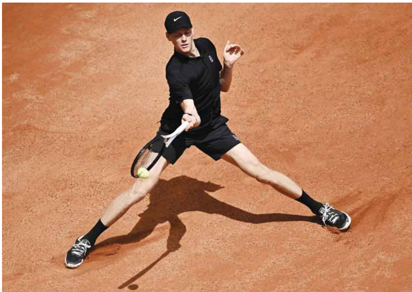
Italy's Jannik Sinner hits a return to Russia's Andrey Rublev during the Italian Open at Foro Italico in Rome yesterday.

Gauff eases past Cirstea to reach second straight Italian Open final