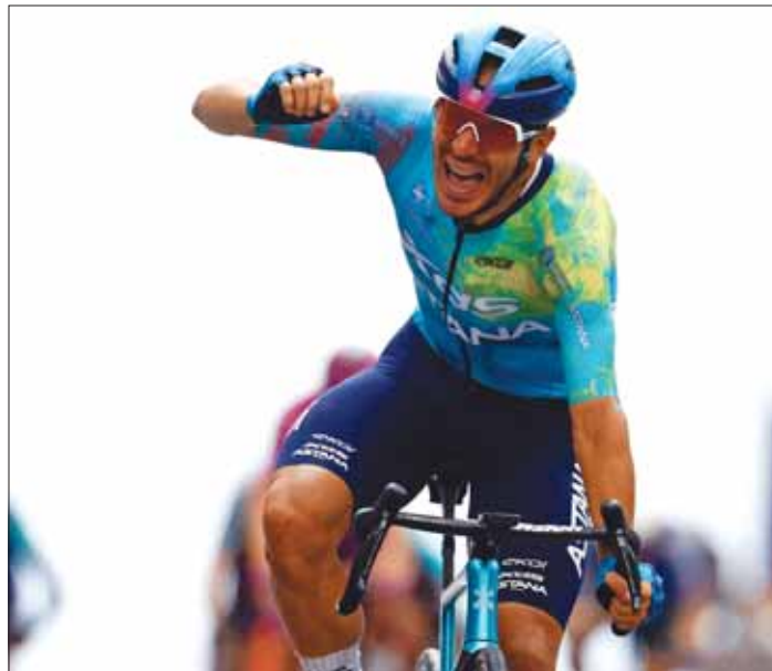
XDS Astana Team Italian rider Davide Ballerini celebrates as he crosses the finish line to win in the 6th stage of the Giro d'Italia between Paestum and Naples yesterday.

"In cycling there is always some problems and when you don't ex-