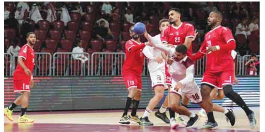
Qatar's handball team made a winning start to their campaign, defeating the UAE 28-20.

doubles billiards, producing a dominant 7-1 win over Kuwait in the final. The pair had reached the title match after a 7-4 semi-final victory over Saudi Arabia.