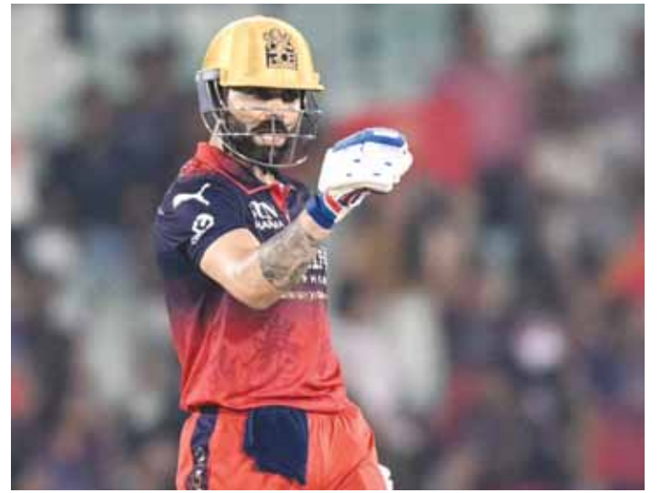
RCB's Virat Kohli gestures during the IPL match against KKR at the Shaheed Veer Narayan Singh International Stadium in Raipur.

He ended his T20 career with a match-winning innings in the 2024 World Cup final victory in Barbados.