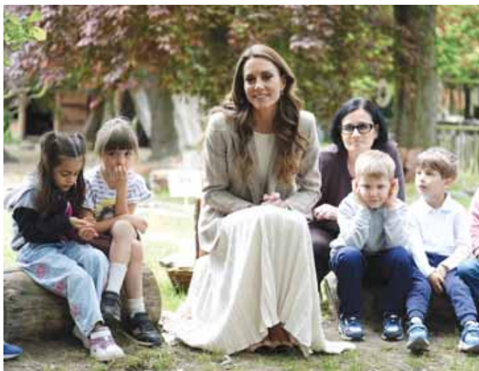
Britain's Kate, Princess of Wales, visits the "Salvador Allende" Scuola dell'infanzia in Reggio Emilia, yesterday.

The subject is close to the princess's heart as a mother of three children — George, 12, Charlotte, 11, and Louis, eight.