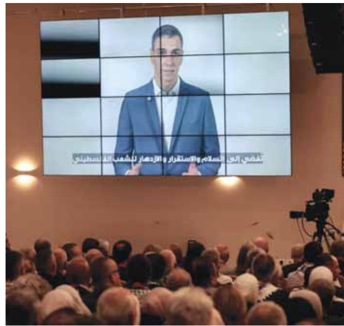
Spain's Prime Minister Pedro Sanchez appears on a screen during the 8th General Conference of Fatah in Ramallah in the Israeli-occupied West Bank, yesterday.

a time of profound difficulty for the Palestinian people and for the region, a moment that calls for responsibility, unity and political leadership," Sanchez noted.