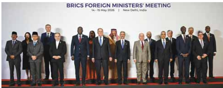
India's Foreign Minister Subrahmanyam Jaishankar (sixth left, front) and foreign ministers of Brics nations pose for a family photograph with delegates of partner countries during the Brics Foreign Ministers' meeting at the Bharat Mandapam in New Delhi yesterday.

In response to the US and Israeli attacks on Iran, Tehran launched strikes on Gulf States including the UAE. Their differences could make it difficult for Brics, which operates by consensus, to agree on a joint statement.