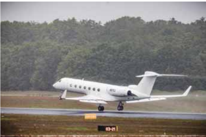
A chartered aircraft transporting six passengers who sailed on a hantavirus-affected cruise, to Australia departs from Eindhoven Airport, in Eindhoven yesterday.