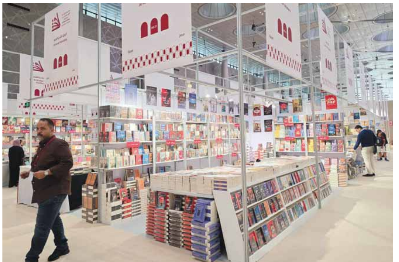
The 35th Doha International Book Fair opened yesterday at the DECC