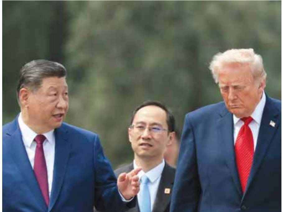
US President Donald Trump and Chinese President Xi Jinping in Beijing yesterday.

“There are those who say this may be the biggest summit ever,” Trump told Xi in brief opening remarks, after a ceremony that featured an honour guard and throngs of children waving flowers and flags at Beijing’s Great Hall of the People. Page 7