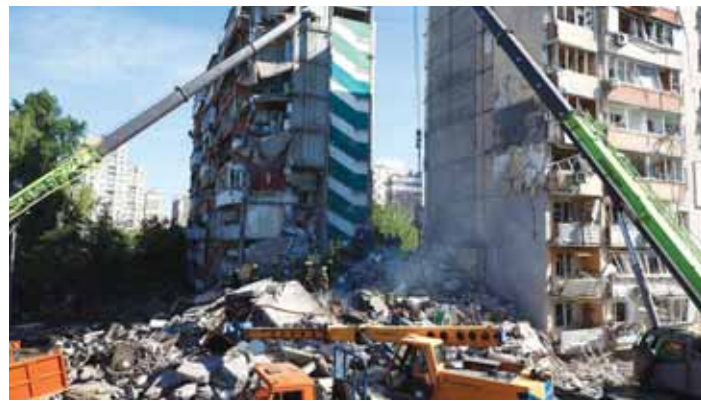
Rescuers work at the site of an apartment building damaged during Russian missile and drone strikes, in Kyiv, yesterday.

"As of now, we know that a total of 10 people have died in Kyiv as a result of the Russian massive