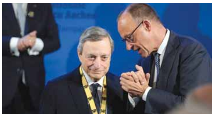
The former president of the European Central Bank and former Italian prime minister Mario Draghi (left) talks with German Chancellor Friedrich Merz after Draghi was awarded the 2026 International Charlemagne Prize of Aachen, yesterday in western Germany.

The EU has long relied upon subsidies and redistribution to assuage the impact from disruptions caused by reducing internal trade barriers, as well as to help integrate poorer nations as the bloc has expanded east.