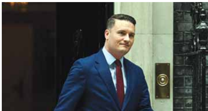
British Health Secretary Wes Streeting walks on Downing Street, on the day of the State Opening of Parliament, in London.

Four junior ministers have resigned and more than 80 Labour MPs have urged him to quit, but he has vowed to cling on and more than 100 lawmakers from the ruling party have called for him to stay.