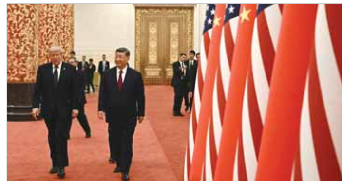
China's President Xi Jinping and US President Donald Trump arrive to attend a state banquet at the Great Hall of the People in Beijing yesterday.