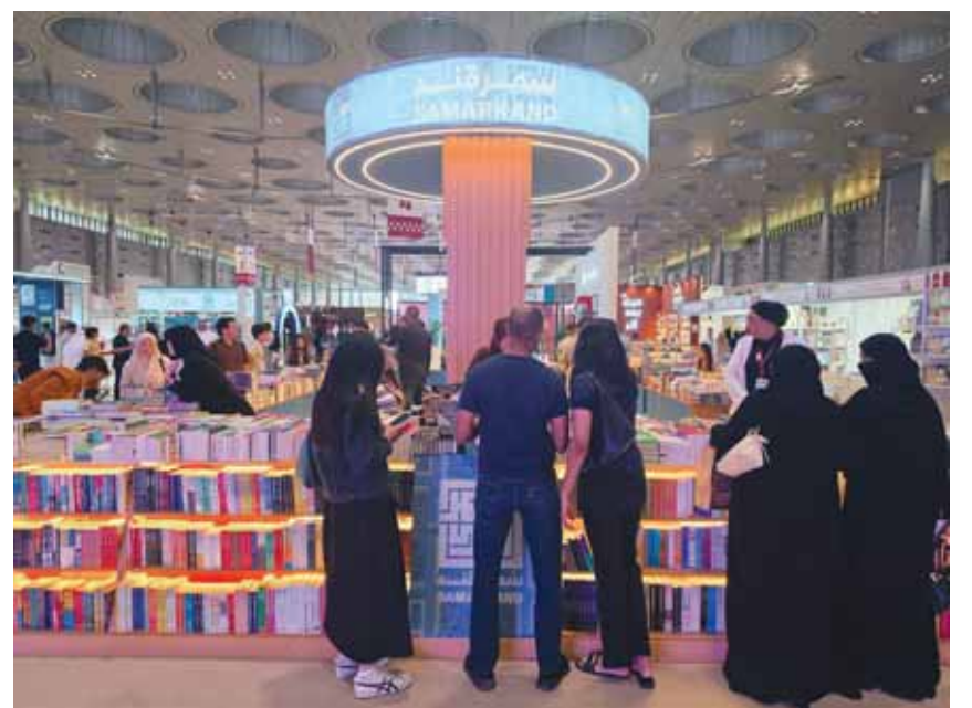
Arab and international publishing houses, alongside a diverse cultural programme. This year's fair features over 1.85mn

Organised by the Ministry of Culture, the 35th edition of the DIBF opened yesterday with broad participation from