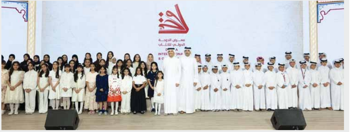
HE the Prime Minister and Minister of Foreign Affairs Sheikh Mohammed bin Abdulrahman bin Jassim al-Thani inaugurated yesterday the 35th edition of the Doha International Book Fair (DIBF), which will run through May 23 at the Doha Exhibition and Convention Centre (DECC). The exhibition features 520 publishing houses from 37 countries across 910 booths, bringing together a wide range of local, regional, and international literary and cultural works.

The opening ceremony was attended by a number of sheikhs, ministers, heads of diplomatic missions, senior officials, and guests of the fair. - QNA