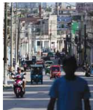
Electric vehicles travel along an avenue as Cuba's electrical grid suffered a partial collapse, cutting power across eastern Cuba, in Havana, yesterday.

ister said on Wednesday that the island had completely run out of fuel oil and diesel, both critical to powering the island's electrical grid, and blamed blackouts on the US blockade.