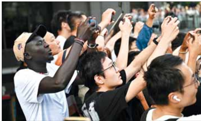
People gather to watch US President Donald Trump's motorcade drive by in Beijing yesterday.

but under domestic law is required to provide weapons to Taiwan for its defence.