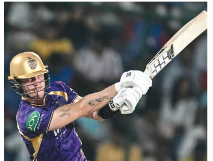
Kolkata Knight Riders' Finn Allen plays a shot during the Indian Premier League match against Delhi Capitals in New Delhi.

BRIEF SCORES: Kolkata Knight Riders 147 for 2 (Allen 100*) beat Delhi Capitals 142 for 8 (Nissanka 50, Tyagi 2-25, Roy 2-31) by eight wickets