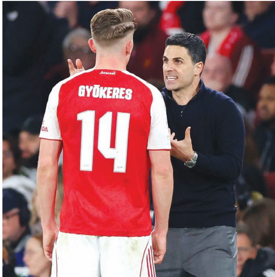
Mikel Arteta's Arsenal will be crowned English champions for the first time in 22 years if they can win their final three league games.

The Hammers are in 18th spot, one point behind Tottenham, with Wolves and Burnley already relegated. Tomorrow, they have the daunting task of hosting leaders Arsenal -