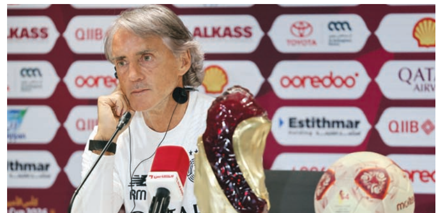
Al Sadd Italian manager Roberto Mancini said the club's history and status meant it must always compete for titles.

Sadd but insisted the team was fully focused on lifting the trophy once again.