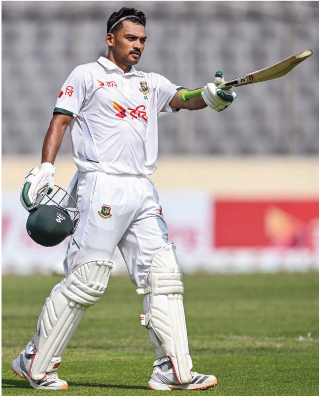
Bangladesh's captain Najmul Hossain Shanto celebrates after scoring a century during the first Test against Pakistan at the Sher-e-Bangla National Stadium in Mirpur yesterday.

Pakistan's bowlers toiled in hot and humid conditions, finding little assistance from the pitch. They also conceded 32 extras.