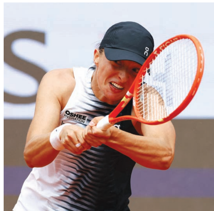
Poland's Iga Swiatek in action during her second round match against Caty McNally of the US yesterday.

The 29-year-old has been beaten by Sinner in four Masters 1000