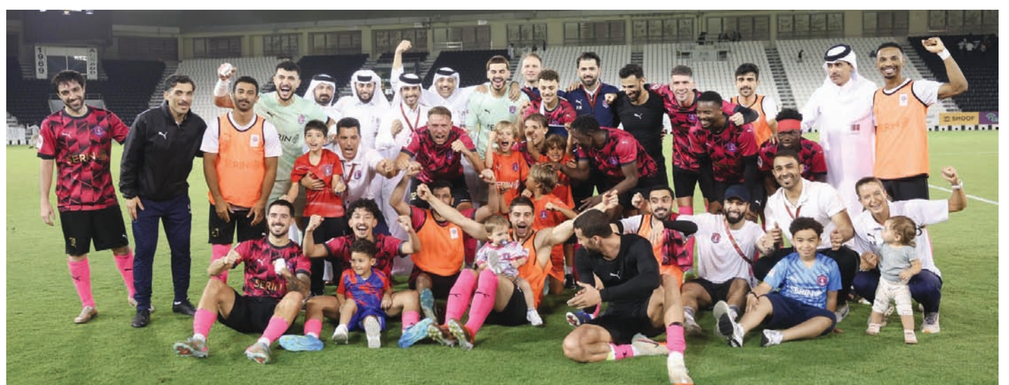
Al Shahania players celebrate with support staff and their families after winning the Qatar Stars League Play-Off match against Al Kharaitiyat.

Al Shahania had ended their Qatar Stars League campaign in 11th place with 21 points to be pushed into the relegation contest while Al Kharaitiyat had finished as runners-up in the Second Division.