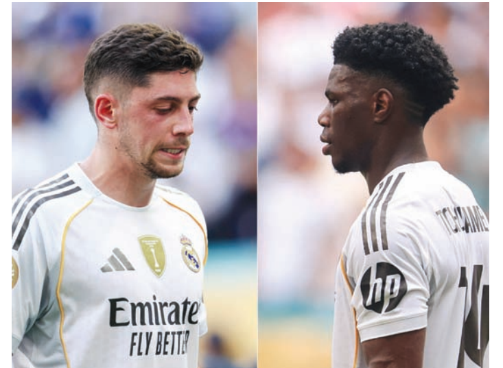
Real Madrid teammates Federico Valverde (left) and Aurelien Tchouameni were involved in a training ground clash that left the latter needing hospital treatment for head injury.

Tensions are running high at Real Madrid with the club on the verge of a second consecutive season without a major trophy. Los Blancos trail Barca by 11 points at the top of La Liga, with Hansi Flick's side able to clinch back-to-back league titles if they do not lose.