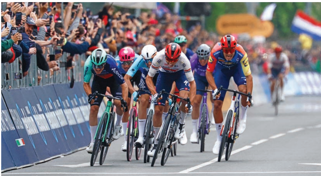
Soudal Quick-Step French rider Paul Magnier (centre) sprints to the finish line to win the 1st stage of the Giro d'Italia 2026 race between Nessebar and Burgas, Bulgaria, yesterday.