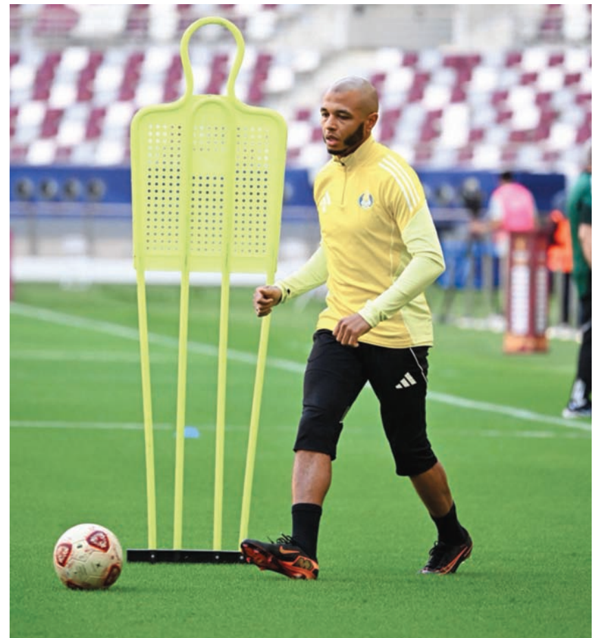
Al Gharafa star Yacine Brahimi said reaching a second successive Amir Cup final was a source of pride for his team.