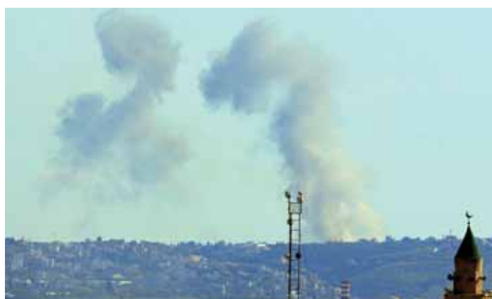
Smoke rising from the site of an Israeli airstrike.

Israeli forces used as a base during their two-decade occupation of southern Lebanon ending in 2000.