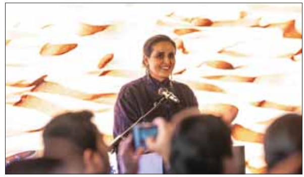
HE Sheikha Al Mayassa bint Hamad bin Khalifa al-Thani at the opening of the country's national pavilion at La Biennale di Venezia.

of La Biennale di Venezia was unveiled at the future site of Qatar's permanent pavilion in the Giardini della Biennale. The exhibition is organised by Qatar Museums (QM) and presented by Rubaiya Qatar, a nationwide multidisciplinary contemporary art quadrennial set to debut this November. "Our participation in La Biennale di Venezia started with the vision of our leadership, the Amir, His Highness Sheikh Tamim bin Hamad al-Thani, to encourage dialogue and share the talent of Qatar and the region with the world," said HE Sheikha Al Mayassa, also the Commissioner of the National Pavilion of Qatar. To Page 11