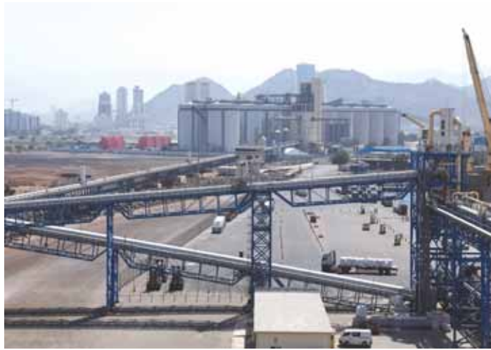
A view of the Port of Fujairah, UAE.

Fujairah sits at the end of the Abu Dhabi Crude Oil Pipeline, which can carry between 1.5 mn and 1.8