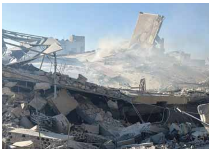
Site of an Israeli strike in Saksakiyeh.

AFP photos showed a cloud of smoke rising behind the town's historic Beaufort Castle, which