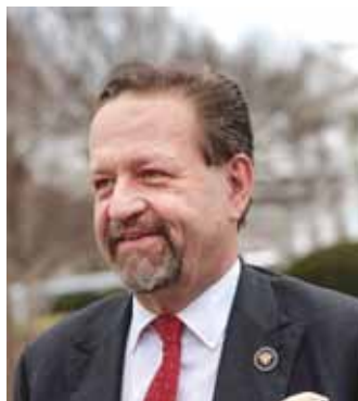
Sebastian Gorka

"Our new counterterrorism strategy first prioritises the neutralisation of hemispheric terror threats by incapacitating cartel operations until these groups are