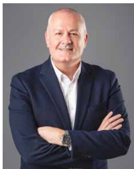
By Neil Wilson Doha

The International Monetary Fund's (IMF) recent description of Qatar as a "model of resilience" reflects something that is increasingly visible on the ground, but not always fully understood. The label itself is not new. What is changing is what sits behind it. The resilience Qatar is demonstrating today is fundamentally different from what defined it ten or even five years ago.