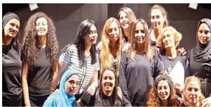
Participating actresses during a rehearsal.

Halawi added: "We are keen to instil in each participant the con-