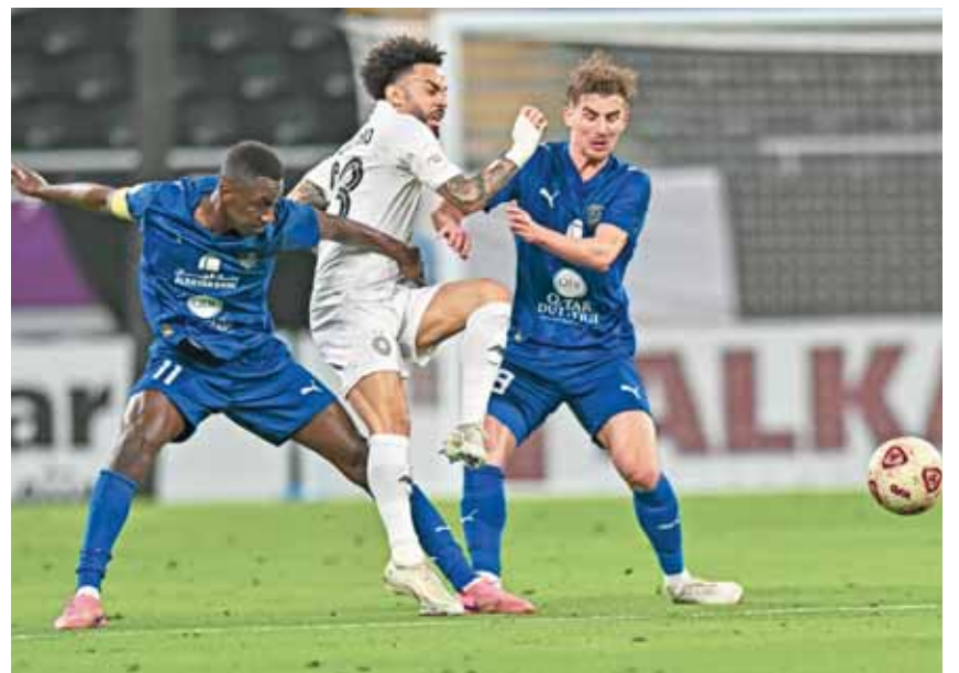
Al Sadd and Al Duhail players battle for the ball.