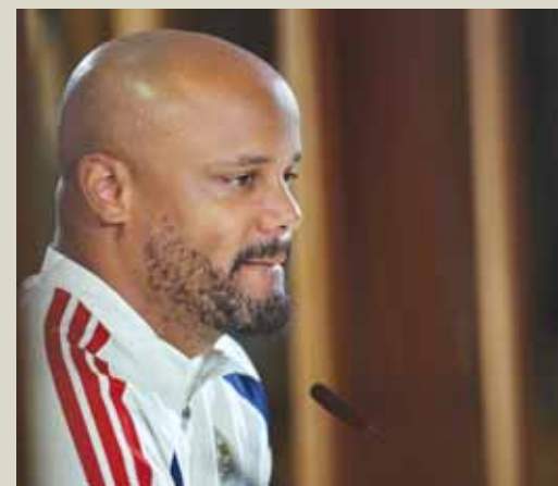
Bayern Munich's coach Vincent Kompany addresses a press conference in Munich yesterday.

"That's why I'm looking forward to this game."