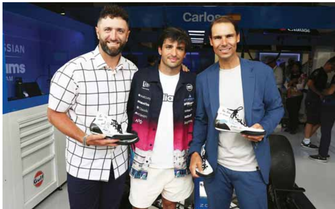
Golfer Jon Rahm poses with Williams driver Carlos Sainz and tennis legend Rafael Nadal on Sunday at the Williams garage prior to the F1 Grand Prix of Miami at Miami International Autodrome in Miami on Sunday.