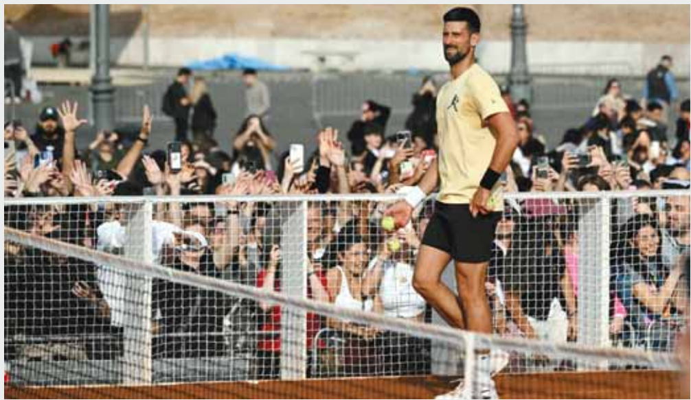
Serbia's Novak Djokovic meets fans during an exhibition match on a temporary clay tennis court at Piazza del Popolo in Rome, on the sidelines of the Italian Open yesterday. (AFP)