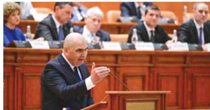
Romanian Prime Minister Ilie Bolojan addresses the Parliament in Bucharest yesterday.

Centrist President Nicusor Dan, who nominates the prime minister, said he expected a new pro-European government to be created within a "reasonable" amount of time, even though Bolojan's Liberals and another junior coalition ally ruled out further talks with the leftists. Although a snap election looks unlikely, financial markets