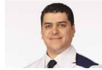
Dr Nedal Alkhatib

tionally uncommon injury, with only a limited number of cases reported worldwide," he said. "Our care programme involved a highly specialised approach tailored to a growing patient." The procedure used a minimally invasive arthroscopic technique with all-suture anchors, without metal or permanent implants. Crucially, the procedure preserved the patient's growth plates which are particularly vulnerable in children and young adults. The patient has since shown strong recovery, with restored joint stability and improved function. "Treating sports injuries in children is fundamentally different from adult care," Dr Alkhatib pointed out.