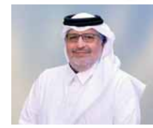
Faisal Abdulhameed al-Mudahka, Editor-in-Chief of Gulf Times