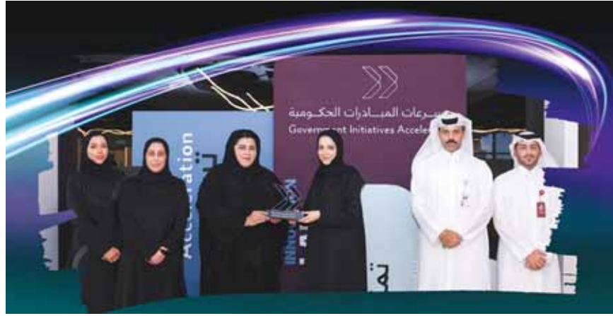
This picture taken from social media shows the officials at the delivery ceremony.

In the first project, the department delivered the outputs of the "Development of the Labour Dispute Resolution Platform" to the Ministry of Labour, supporting its efforts to strengthen digital services and improve the efficiency of its dispute resolution system.