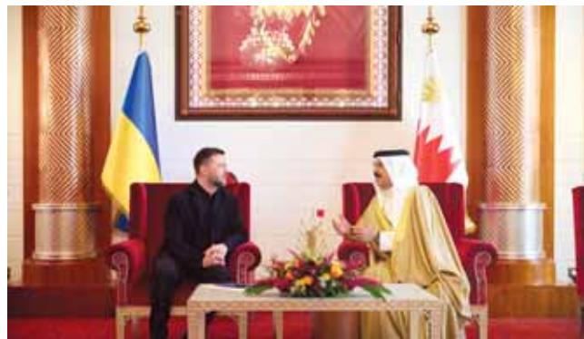
President Volodymyr Zelensky and Bahrain's King Hamad bin Isa al-Khalifa.