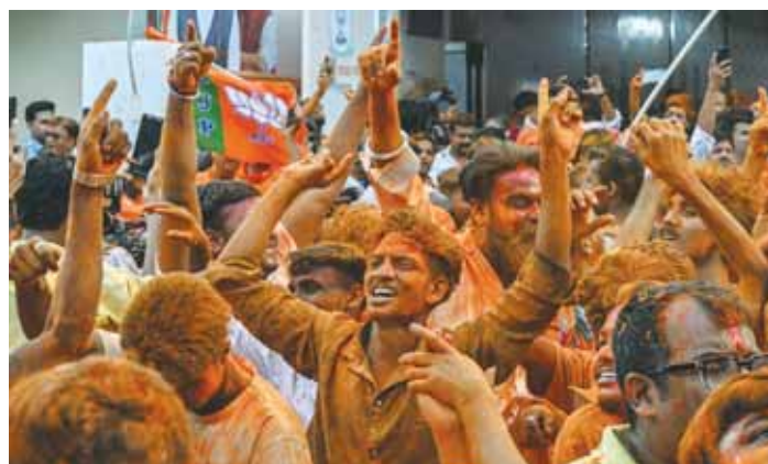
BJP supporters celebrate after taking a lead during vote counting for the West Bengal Legislative Assembly elections on Monday.

The TMC tally fell to 80 seats from its earlier 215, with Banerjee herself losing her seat.