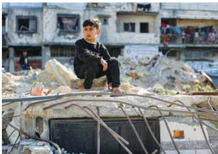
A boy looks on as he sits on rubble at the site of an Israeli strike on a police station in Gaza City yesterday.

At Al Shifa Hospital, the largest medical facility still partially functional in the en-