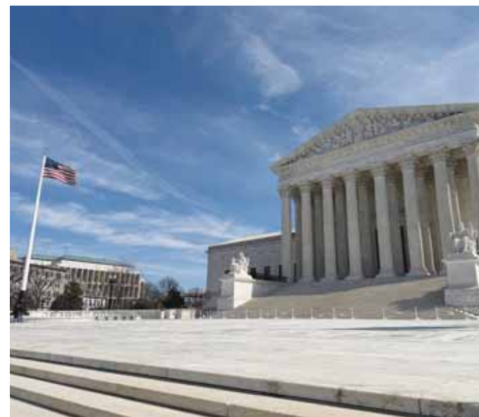
A US flag flutters outside the US Supreme Court building in Washington, DC.

US law enforcement officials have told Reuters that China at times seeks to link Washington's requests on deportations to Beijing's requests to extradite economic or political fugitives who have fled to the US.