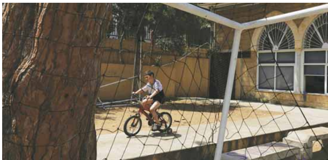
A boy rides a bicycle in Hariri High School used as a temporary shelter for displaced people.

In a statement to Reuters, a representative of the school administration said it sympathised with