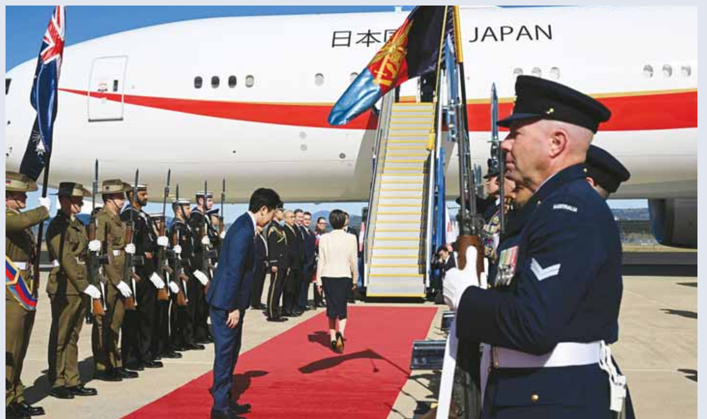
Japan's Prime Minister Sanae Takaichi walks towards her aircraft at a Royal Australian Air Force base in Canberra yesterday, ahead of her departure following a three-day official visit to Australia.