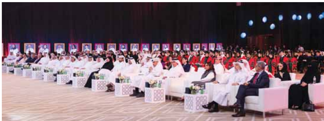
Dignitaries in attendance at the graduation ceremony.