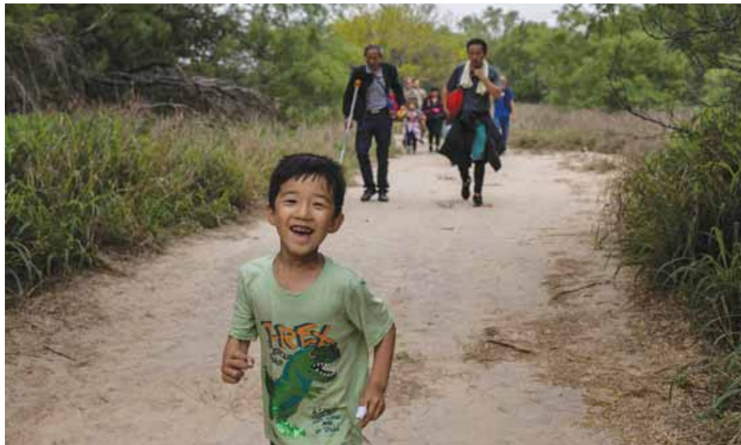
A five-year-old migrant boy from China chases his brother down a trail after he and his family crossed the Rio Grande river into the United States from Mexico in Fronton, Texas.

ate with the US to take back its citizens," the official said, calling it a violation of China's international obligations and responsibility toward its people.