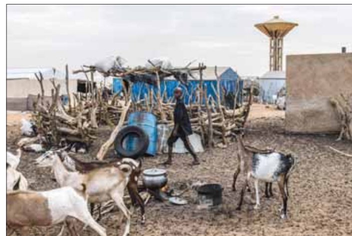
A refugee walks past goats at M'berra refugee camp, which hosts 120,000 refugees fleeing violence and instability in Mali, in the Hodh Ech Chargui region of Mauritania.

It confirmed that mercenaries from Russia's Africa Corps, controlled by the government in Moscow and sent to back up the Malian junta, had been forced to withdraw from the northern town of Kidal, now un-