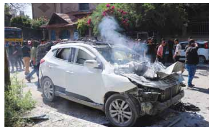
Palestinians inspect the site of an Israeli strike on a vehicle in Gaza City, yesterday.

Israeli strikes on the Gaza Strip killed five people on Tuesday, including a Hamas commander and a nine-year-old boy, Palestinian sources said.