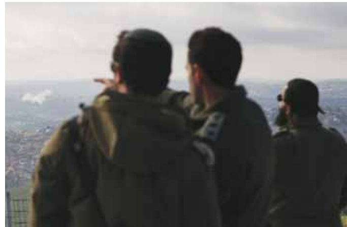
Israeli soldiers watch as smoke rises following explosions in southern Lebanon as seen from northern Israel, yesterday.

In a jab at Hezbollah, which accused the government of "surrender", Aoun rejected criticism of the