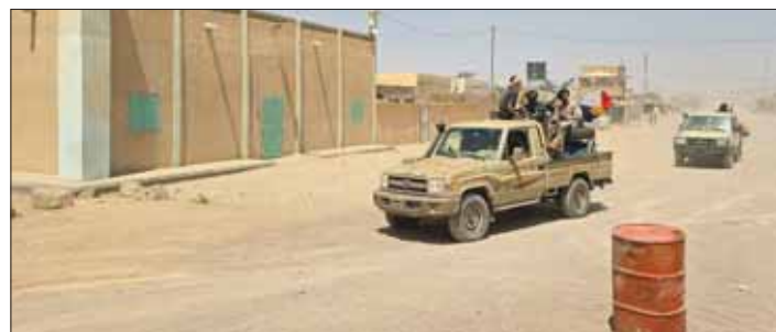
Tuareg rebels of the Azawad Liberation Front (FLA) coalition ride on the back of a pickup truck in Kidal, on Sunday.

"The military have abandoned their position in Labbezanga, near