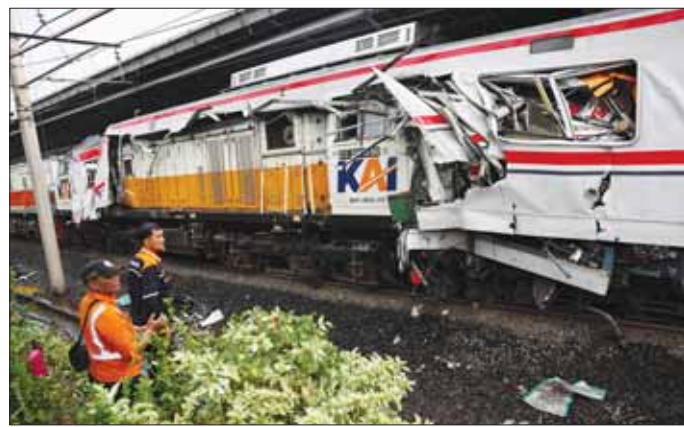
Technicians work after a deadly train collision in Bekasi, Jakarta, Indonesia, yesterday.

Before disengaging the trains, rescuers were seen using angle grinders to cut through the metal of the compartments and reach the survivors.