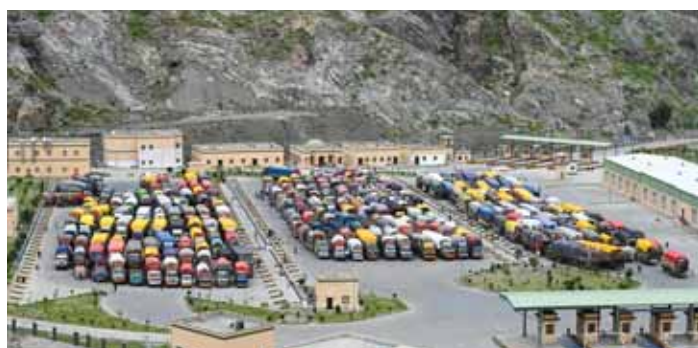
Afghan refugee trucks are parked along the Landi Kotal highway near the Torkham border in Pakistan's Khyber Pakhtunkhwa province, as they await deportation to Afghanistan yesterday.

Many said as they waited to cross yesterday that they hoped differences could be resolved peacefully to end a conflict that has killed hundreds and hampered deep eco-