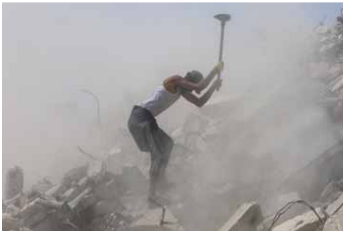
A Palestinian worker breaks up concrete while working on rubble in Khan Younis, southern Gaza Strip.

In Khan Younis in southern Gaza, Palestinians were operating heavy machinery to tear through mountains of destroyed concrete, sending plumes of dust