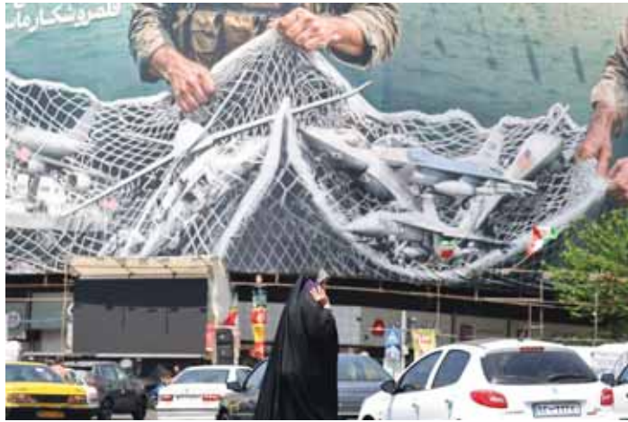
A woman walks past a giant billboard reading "The Strait of Hormuz remains closed" at the Revolution Square in Tehran.

While the total length of submarine cables has grown considerably