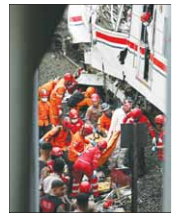
Rescuers carry the body of a victim at the site yesterday.

"I haven't even finished with the call and the trains collided," she said. Commuter line trains are some