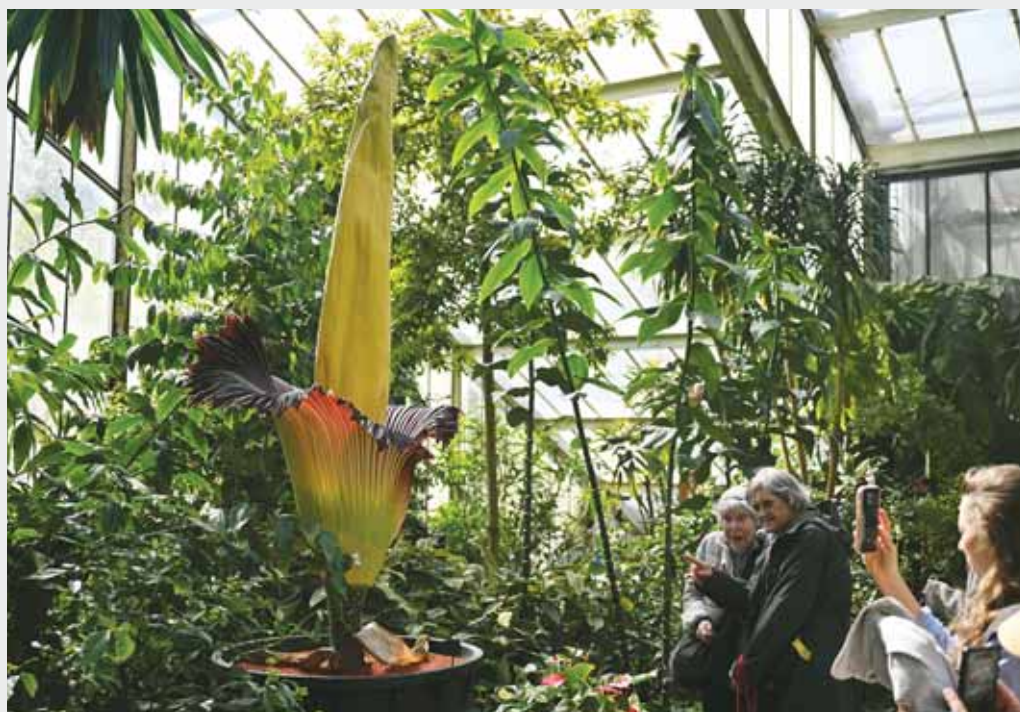
Members of the public take photographs of the flowering titan arum in bloom at the Princess of Wales Conservatory at Kew Gardens in south-west London yesterday. Titan arum - the smelliest plant in the world - takes several years to produce a flower that can grow up to three metres (9.8ft.) in height, and is then in bloom for less than 48 hours.