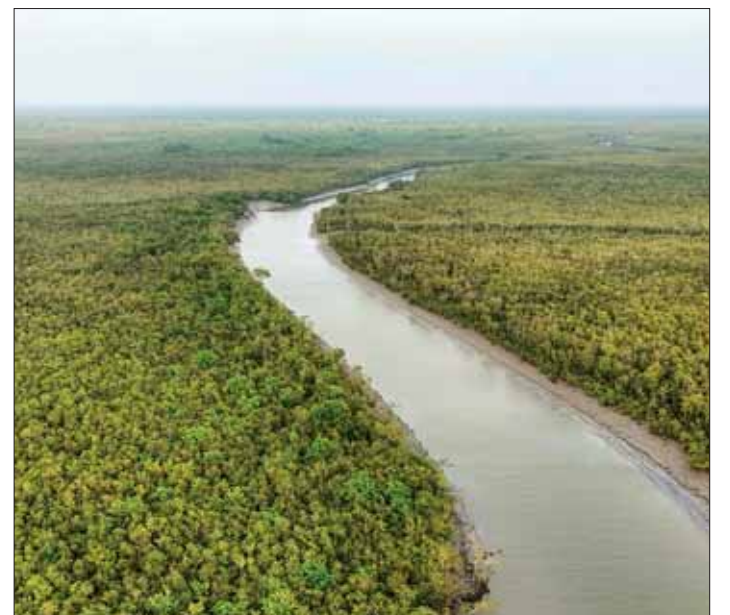
This photograph shows an aerial view of a river winding through the Sundarbans at Dacope in Bangladesh's Khulna district.

The slow growth has drawn scrutiny over the effectiveness of the nation's conservation efforts, including the latest $4.2mn tiger project.