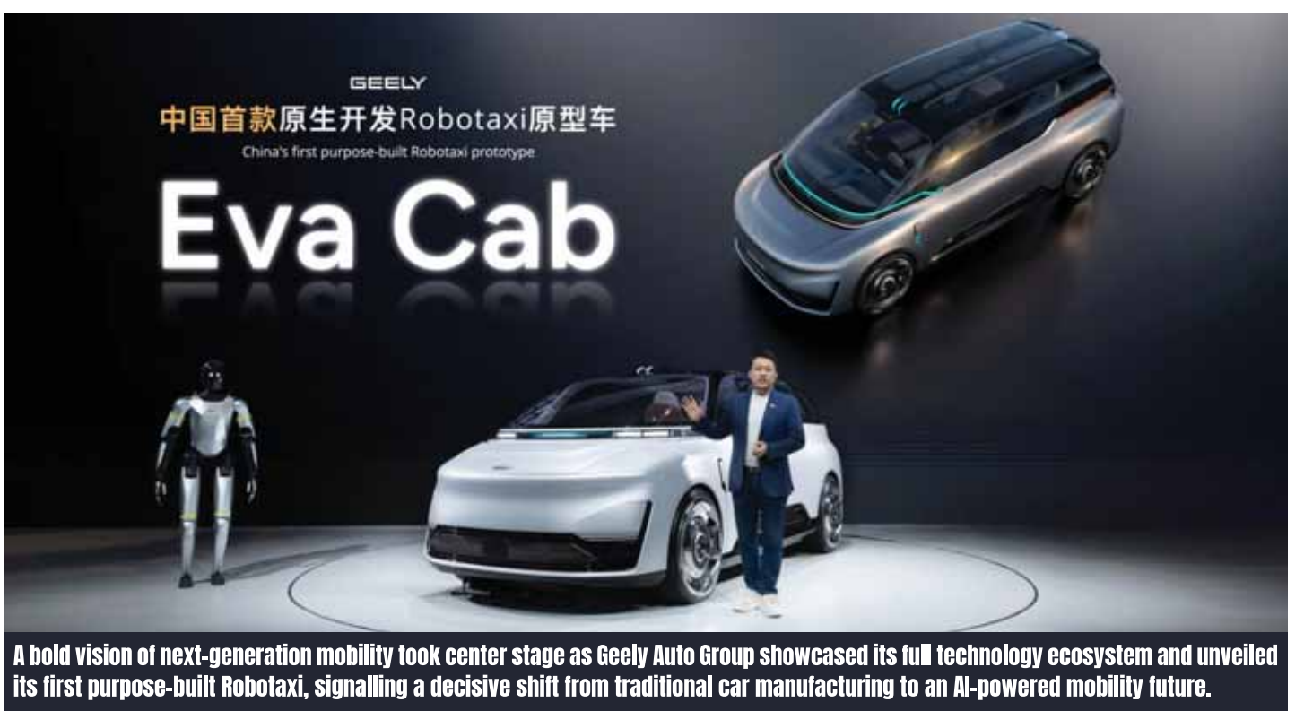
A bold vision of next-generation mobility took center stage as Geely Auto Group showcased its full technology ecosystem and unveiled its first purpose-built Robotaxi, signalling a decisive shift from traditional car manufacturing to an AI-powered mobility future.

Commercial rollout, however, remains a medium-term goal. A customized EVA Cab for CaoCao Mobility is expected to launch in 2027, signalling Geely's intent to move beyond demonstration into scaled deployment.