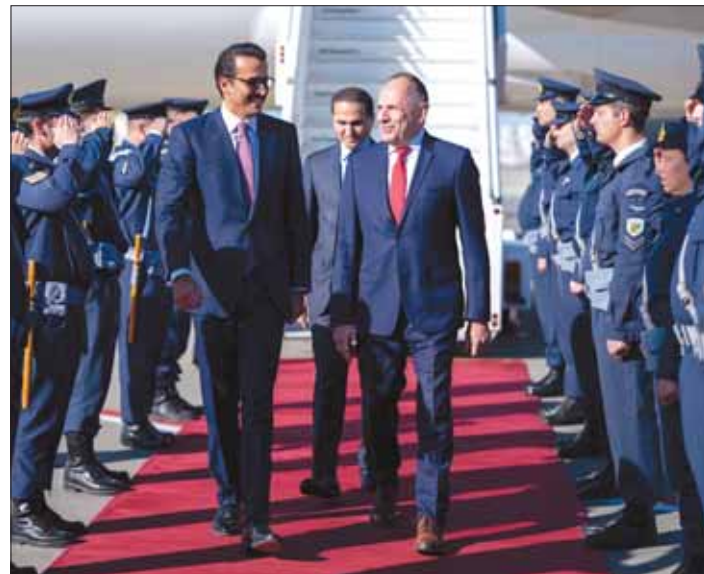
His Highness the Amir Sheikh Tamim bin Hamad al-Thani arrived in Athens on a working visit to Greece. Upon his arrival at Athens International Airport, His Highness was welcomed by Greek Minister of Foreign Affairs Georgios Gerapetritis, Qatar's ambassador Ali bin Khalfan al-Mansouri and members of the Qatari embassy. His Highness the Amir is accompanied by an official delegation.