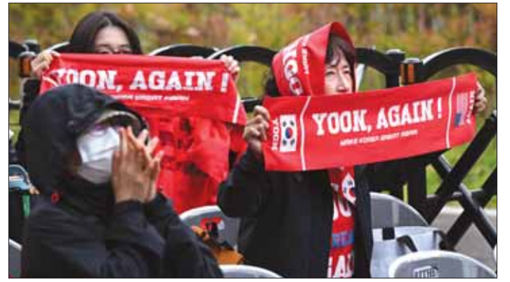
Supporters of South Korea's former president Yoon Suk-yeol and his wife Kim Keon-hee react as they watch a live stream of the trial of the former first lady on a street near the Seoul High Court in Seoul yesterday.

The verdict in another appeal, against his five-year sentence for obstructing justice and other crimes linked to the declaration, is expected on Wednesday.