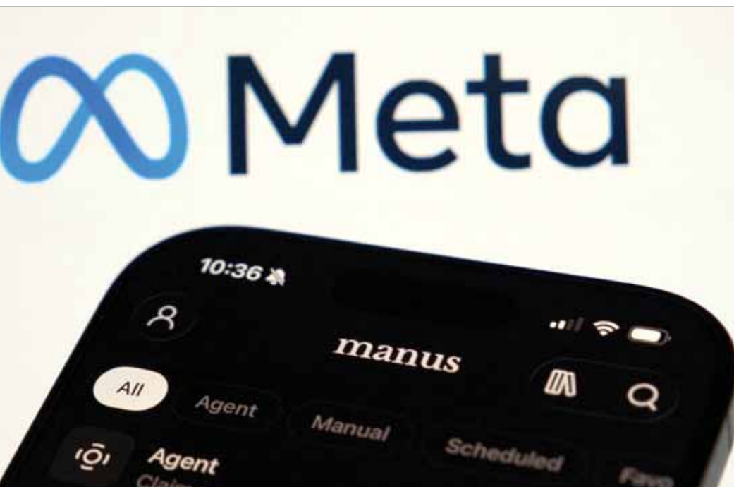
The Manus AI agent app is displayed on a mobile phone near the logo of tech giant Meta.