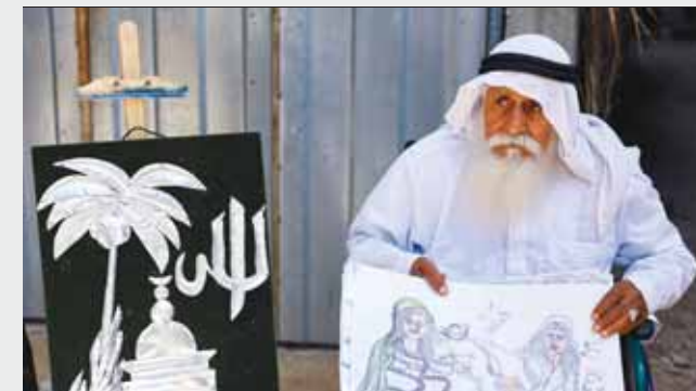
A man holds an artwork in the Bureij refugee camp in the Gaza Strip, where Palestinians are displaying their works.