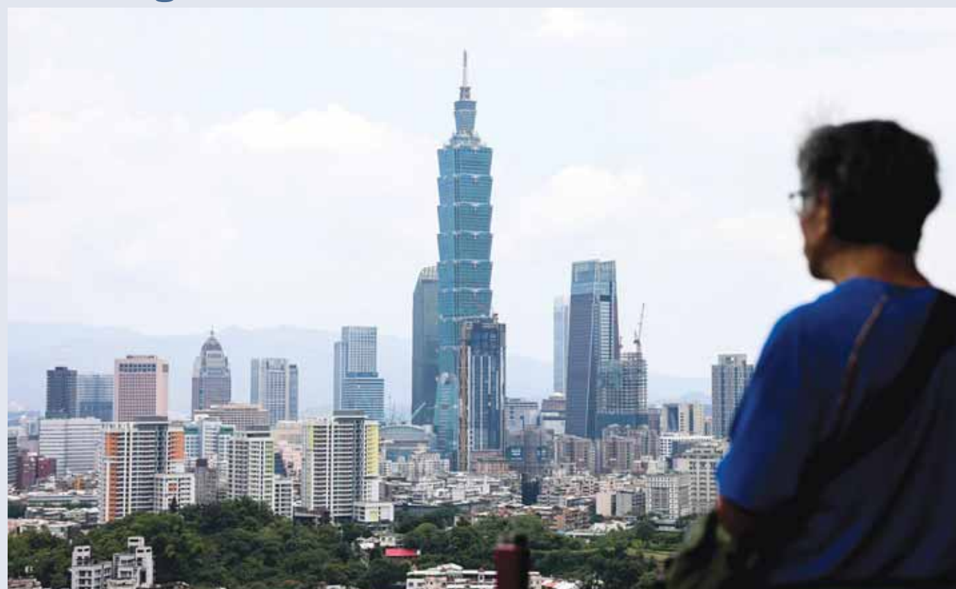
A man looks at the Taipei 101 building standing among residential and commercial buildings in Taipei yesterday.