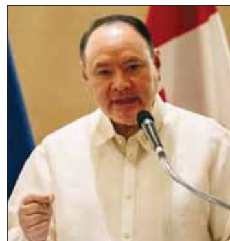
Philippine Defence Minister Gilberto Teodoro Jr.

China has previously criticised the joint military exercises con-