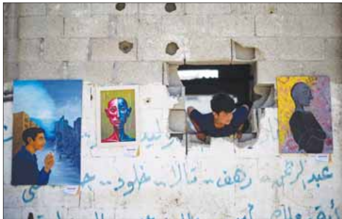
A child looks through damaged wall at an open-air art exhibition at the Bureij camp for Palestinian refugees in the Gaza Strip yesterday.

The MSF report, which was slammed by Israel, pointed to data from the United Nations, European Union and World Bank indicating that Israel had destroyed or damaged nearly 90% of water and