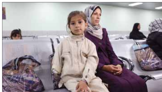
A child looks on as wounded children evacuated from Gaza for medical treatment arrive at the King Hussein Bridge in Jordan.