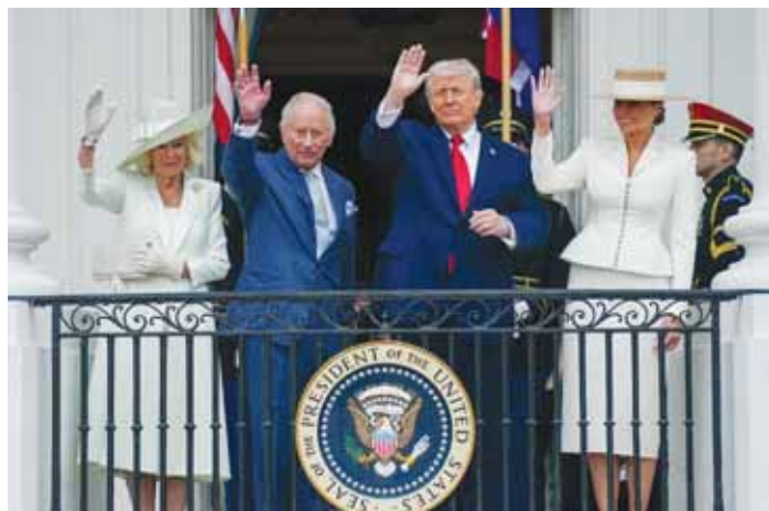
US President Donald Trump, first lady Melania Trump, Britain's King Charles and Queen Camilla wave during an arrival ceremony at the White House in Washington, DC, yesterday.

Using a phrase prized by British governments since Winston Churchill first used it after World War II, Trump said that the two countries had a "special relationship, and we hope it will always remain that way."