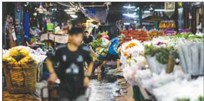
A worker pulls a cart loaded with flowers at a market in Bangkok early yesterday.

Thailand's economic growth and tourist arrivals are forecast to drop this year as the Middle East war roils global energy prices, the finance ministry said yesterday. The country's GDP growth is projected to dip to 1.6%, the ministry said in a statement, down from 2.4% in 2025.