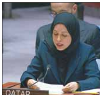
HE Sheikhha Alya Ahmed bin Saif al-Thani

HE Sheikhha Alya stated that the meeting is held at a critical time. Threats to the safety of international waterways and freedom of navigation are escalating beyond traditional challenges, posing a threat to international peace, security, and economy, particularly in vital maritime corridors such as the Strait of Hormuz. She pointed out that freedom of navigation is a core principle of international law as stipulated in the 1982 UN Convention on the Law of the Sea. She also underscored the importance of UN Security Council Resolution 552 of 1984, which highlighted the Gulf region's significance for international peace and security and its vital role in global economic stability. The resolution called on all