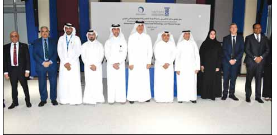
Officials of UDST and Mannai Corporation at the signing ceremony.

The collaboration includes establishing a clear roadmap toward carbon neutrality, with defined timelines and measurable performance indicators, in addition to assessing campus energy consumption and emissions, developing environmental performance metrics, exploring photovoltaic solar energy opportunities, enhancing building and facility efficiency, and supporting the transition toward sustainable mobility solutions, including electric vehicle charging infrastruc-