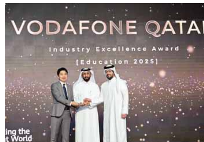
Dignitaries from Vodafone Qatar receiving the 'Industry Excellence Partner Award in Education' award bestowed by Huawei Headquarters.