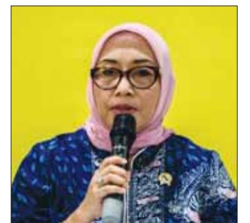
Arifah Choiri Fauzi, Indonesia's minister of women's empowerment and child protection, speaks during a press conference on a child abuse probe at a daycare centre in Yogyakarta, on Monday.

His son had been repeatedly hospitalised with pneumonia, which the father now suspects may have had something to do with him being made to sleep on