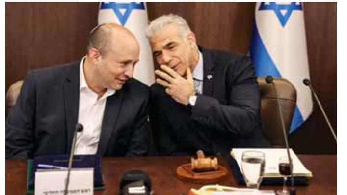
Israel's former caretaker prime minister Yair Lapid speaks with former premier Naftali Bennett during a meeting.

But Hamas storming of Israel, which plunged the Middle East into turmoil and saw Israel fighting on multiple fronts, left