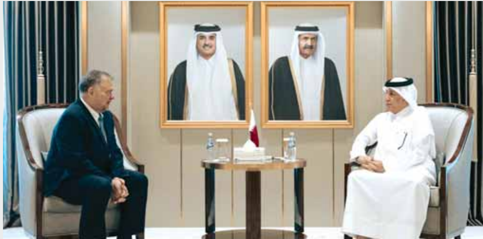
HE the Minister of State for Foreign Affairs Sultan bin Saad al-Muraikhi met with ambassador of the Republic of Costa Rica to the State of Qatar Juan Carlos Esquivel, on the occasion of the end of his tenure. HE the Minister of State for Foreign Affairs extended thanks to the ambassador for his efforts in supporting and strengthening bilateral relations, wishing him success in his new duties. (QNA)