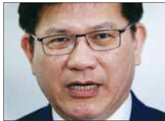
Taiwan's Foreign Minister Lin Chia-lung.

pressure can shake our resolve and will to safeguard our dignity