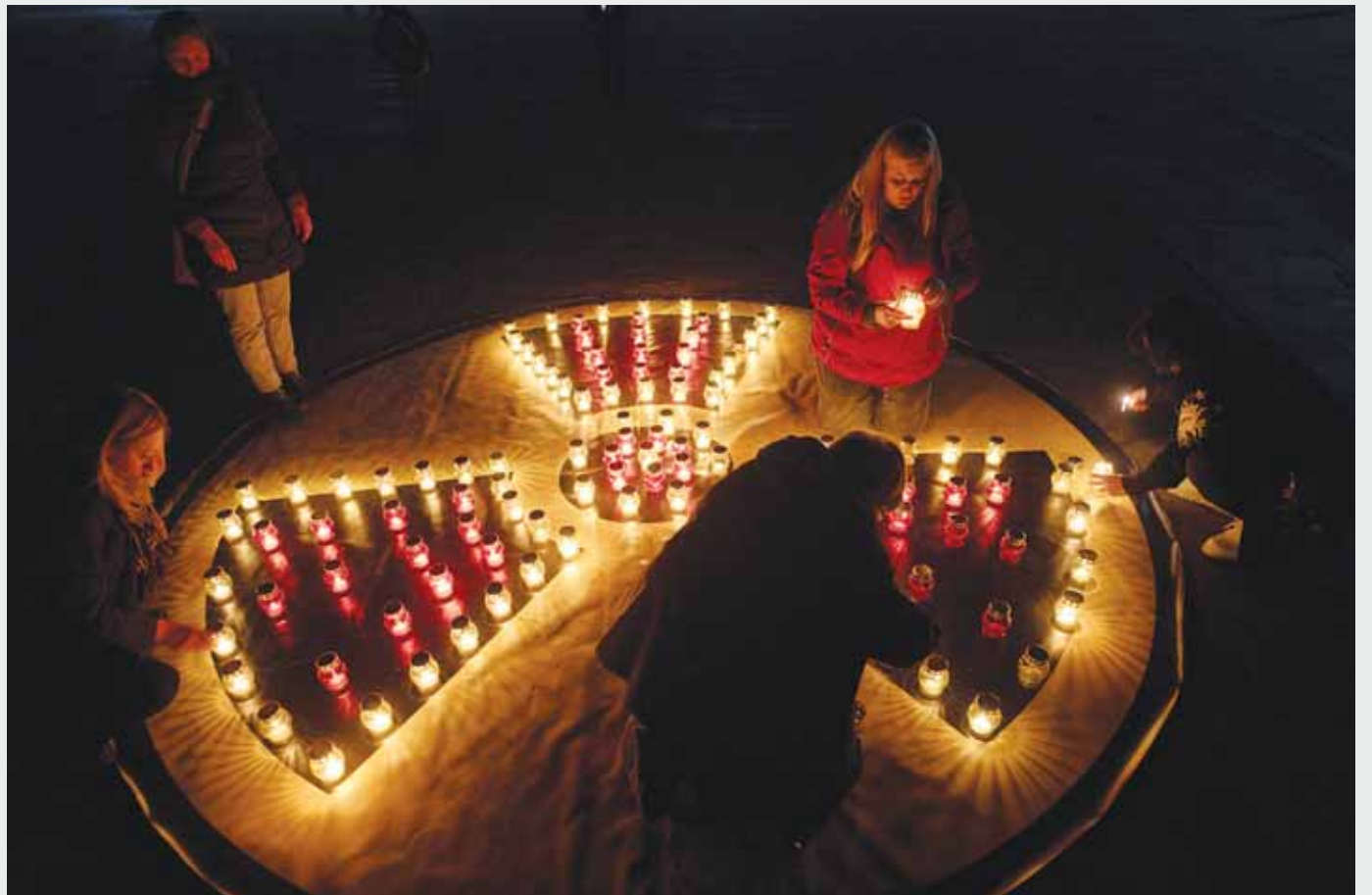
People light candles set in shape of a radiation sign during a ceremony yesterday marking the 40th anniversary of the explosion at the Chernobyl nuclear power plant, in front of a memorial for Chernobyl victims in the town of Slavutych.