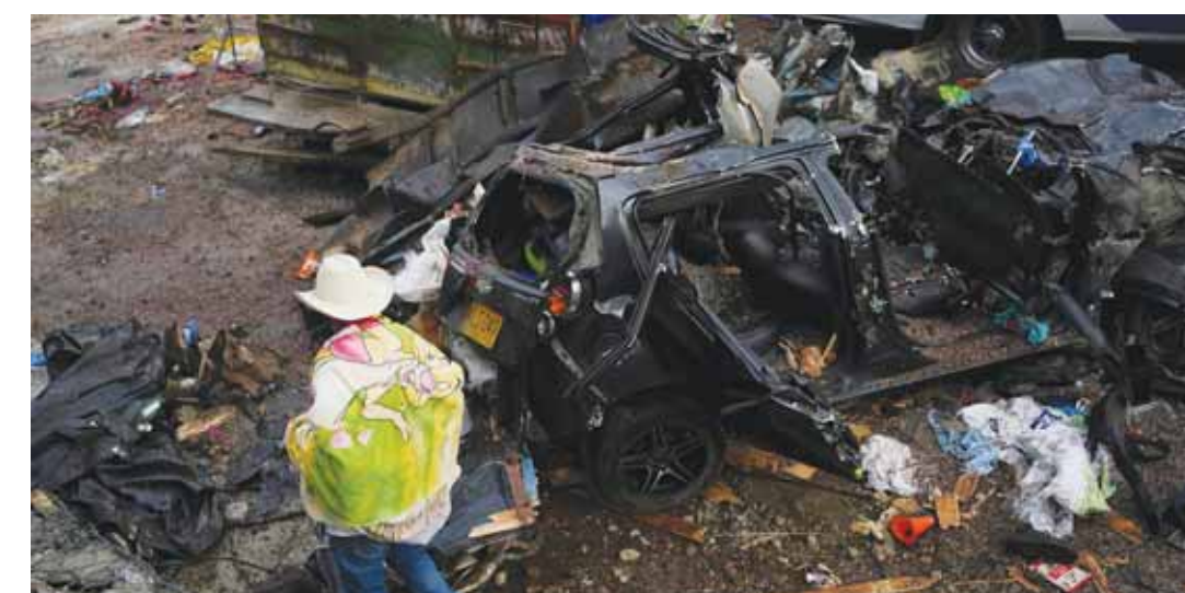
A man walks past destroyed vehicles after an attack with explosives in Cajibío, Colombia yesterday.

According to Lopez, 26 attacks have been recorded in the two de-