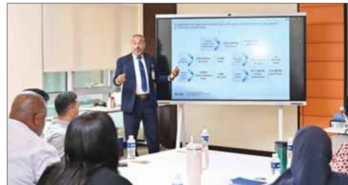
The programme brought educators into real-world banking environments to strengthen the connection between academic learning and industry practice.

In line with Qatar National Vision 2030, QNB remains committed to supporting the development of a strong education system that fosters innovation, capability building, and long-term economic growth.