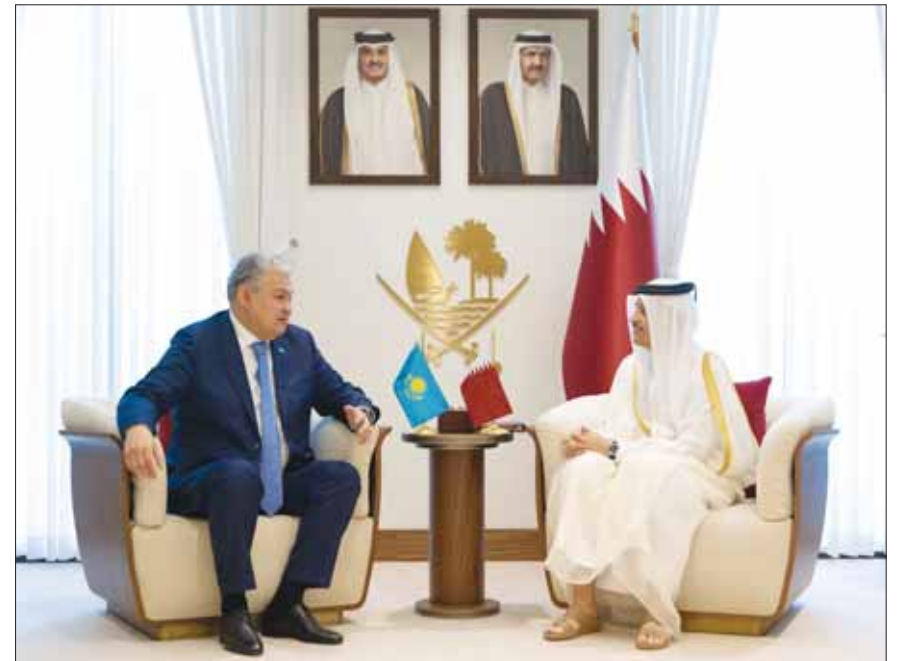
HE the Prime Minister and Minister of Foreign Affairs Sheikh Mohammed bin Abdulrahman bin Jassim al-Thani met yesterday with Kazakhstan Minister of Foreign Affairs Yermeq Kosherbayev, who is visiting the country. They discussed co-operation between the two countries and ways to support and develop it. They also discussed the developments in the region, particularly those related to the ceasefire between the US and Iran, in addition to efforts aimed at reducing escalation in a way that contributes to enhancing security and stability in the region. HE the Prime Minister stressed the need for all parties to respond to the ongoing mediation efforts, which would pave the way for addressing the root causes of the crisis through peaceful means and dialogue, and lead to a sustainable agreement that prevents renewed escalation. (QNA) Page 2