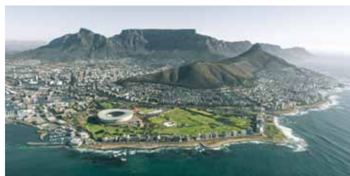
Cape Town in South Africa.

The values enshrined in our Constitution compel us to act consistently on the international stage. It is within this moral and historical framework that South Africa has approached the International Court of Justice (ICJ) to hold Israel accountable for acts of genocide.