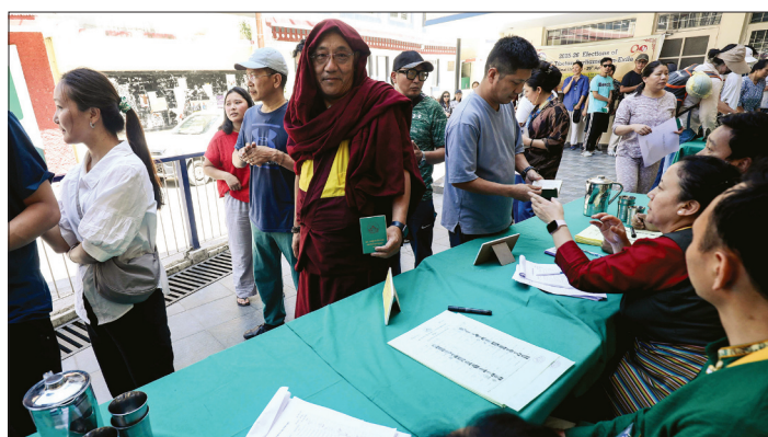
A Tibetan reacts as he gets his documents verified before casting his ballot at a polling station in Dharamsala yesterday during the final round of parliamentary elections held for exiled Tibetans.

based in India since fleeing the Tibetan capital Lhasa after Chinese troops crushed an uprising in 1959, insists he has many more years to live.