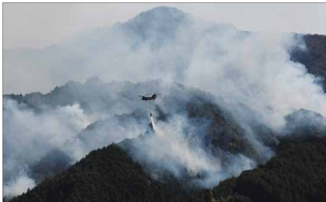
A helicopter conducts firefighting operations in Otsuchi, Iwate Prefecture, Japan, yesterday.