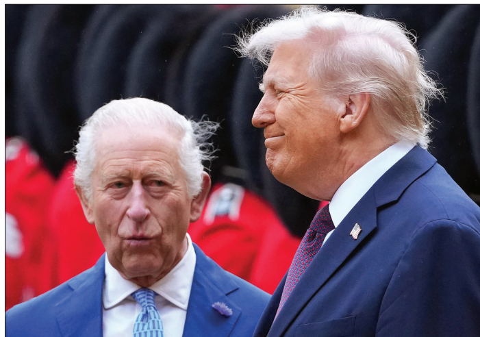
US President Donald Trump and Britain's King Charles III inspect a guard of honour during a ceremonial welcome in the Quadrangle at Windsor Castle in Windsor during the US president's second state visit.

Earlier, senior UK minister Darren Jones told British broadcasters during a round of interviews that security teams in Britain and the