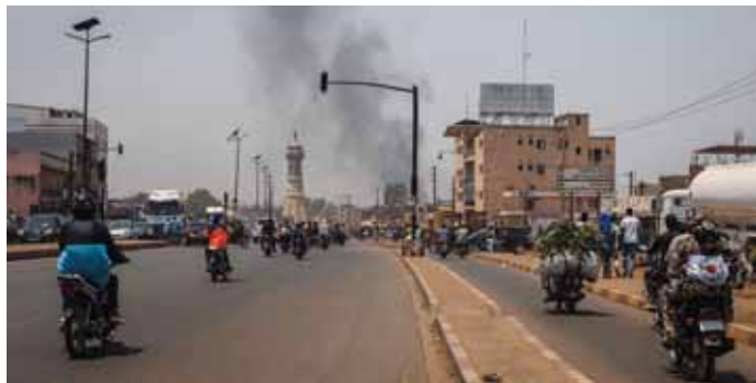
A column of black smoke rises above buildings as traffic passes the Africa Tower monument in Bamako yesterday.

"Today, Sunday, fighting resumed in Kidal between the Malian army, the Russians and the (Tuareg) rebels. Residents heard gunfire. There's shooting," the of-