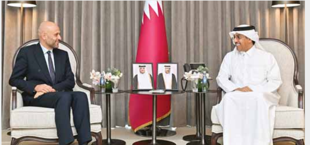
HE the Minister of Labour Dr Ali bin Smaikh al-Marri met yesterday with the Charge d'Affaires of the US Embassy in Qatar, Mohammed Barghouty. During the meeting, discussions focused on a range of topics of mutual interest, with a particular emphasis on bilateral co-operation within the labour sector, as well as ways to support and develop it. (QNA)