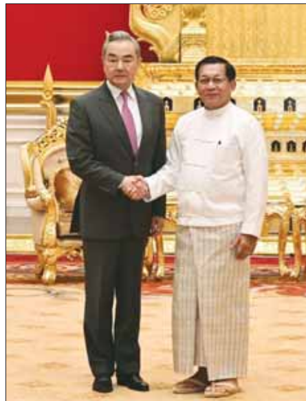
China's Foreign Minister Wang Yi shaking hands with Myanmar's President Min Aung Hlaing during a meeting at the Presidential House in Naypyidaw, Myanmar, yesterday.

Over the past year, there have been signs the