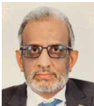
By Ghulam Hoosein Asmal South Africa's ambassador to Qatar

Today millions of South Africans at home and across the world commemorate Freedom Day, a moment of profound significance for our nation.