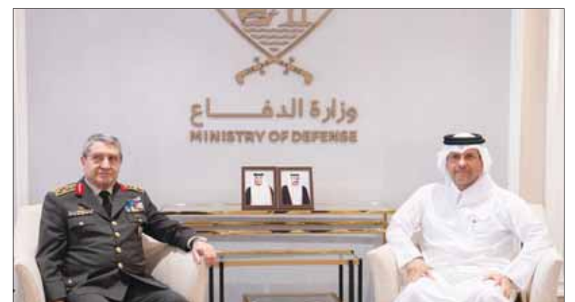
HE the Deputy Prime Minister and Minister of State for Defence Affairs Sheikh Saud bin Abdulrahman bin Hassan al-Thani met yesterday with Chief of the General Staff of the Turkish Armed Forces Selçuk Bayraktaroğlu and his accompanying delegation, during the Turkish military commander's visit to Qatar. The two sides reviewed the latest security developments in the region and discussed aspects of defence co-operation and joint co-ordination in light of the current circumstances. The talks were attended by Chief of Staff of the Qatar Armed Forces Major General (Pilot) Jassim bin Mohammed al-Manaa, alongside a number of senior officers from both sides. The visit comes amid sustained engagement between Doha and Ankara on regional security, and follows a series of high-level defence exchanges over recent months.