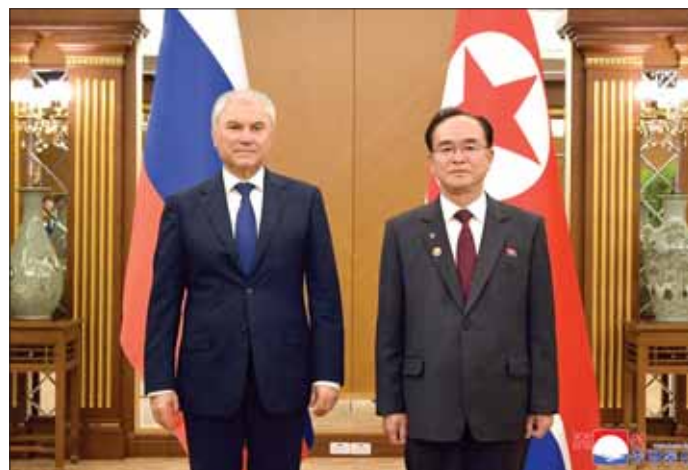
Russia's State Duma Chairman Vyacheslav Volodin with Jo Yong-won, head of the North Korean Supreme People's Assembly, in Pyongyang, on Saturday.

The two soldiers have expressed their desire to come to South Korea.