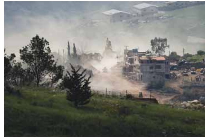
An Israeli military vehicle drives in Lebanon, as seen from the Israeli side of the border, in northern Israel, yesterday.

It has kept up deadly strikes on Lebanon and its troops are operating inside what it calls the "yellow line", which demarcates a ribbon