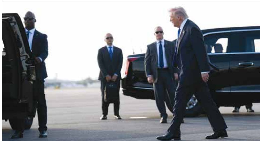
President Donald Trump arrives at the Palm Beach International Airport on Friday.