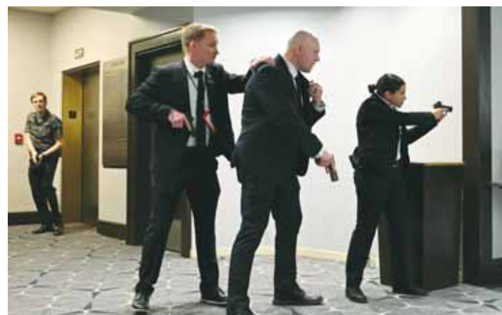
Agents draw their guns during the White House Correspondents' dinner at the Washington Hilton in Washington, DC.

"It does appear that he, he did, in fact, have set out to target folks that work in the administration, likely including the president," Blanche told NBC News' "Meet the Press," adding that the suspect likely travelled by train from Los Angeles to Chicago and then to Washington.