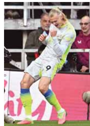
Manchester City's Erling Haaland celebrates scoring against Burnley.

facts are we had to overachieve this year and we've not managed to do that," said Parker.