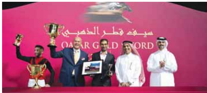
Connections of Sovereign Spirit celebrate after the bay gelding won the Qatar Gold Trophy yesterday.

to score by 2 lengths after settling behind the early leader before asserting in the closing stages.