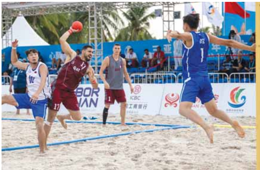
Qatar's beach handball team beat Bangladesh and Mongolia, both with identical 2-0 scoreline to stay top of the group stage at the Asian Beach Games in Sanya, China.