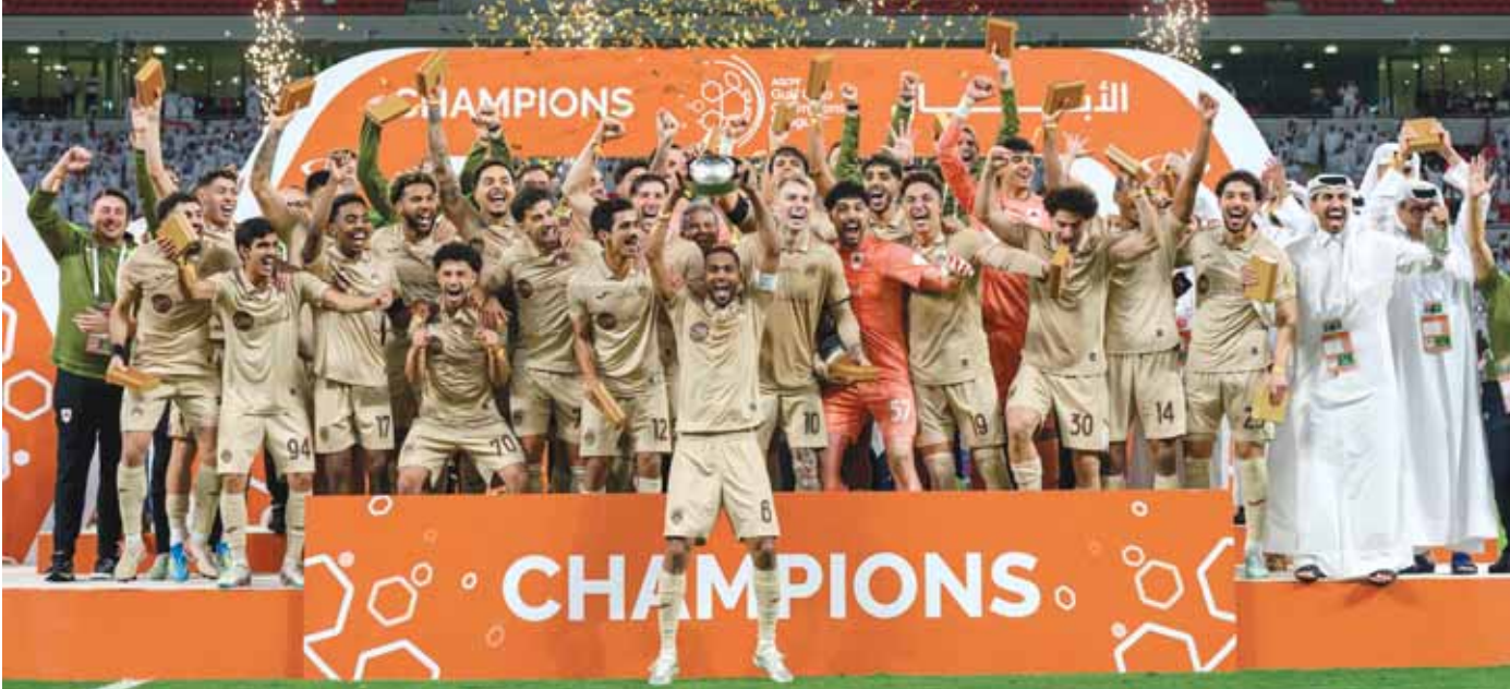
Al Rayyan players celebrate clinching the Gulf Club Champions League after a 3-0 win over Saudi Arabia's Al Shabab in the final at Ahmad Bin Ali Stadium yesterday.

The triumph marks Al Rayyan's second trophy of the season