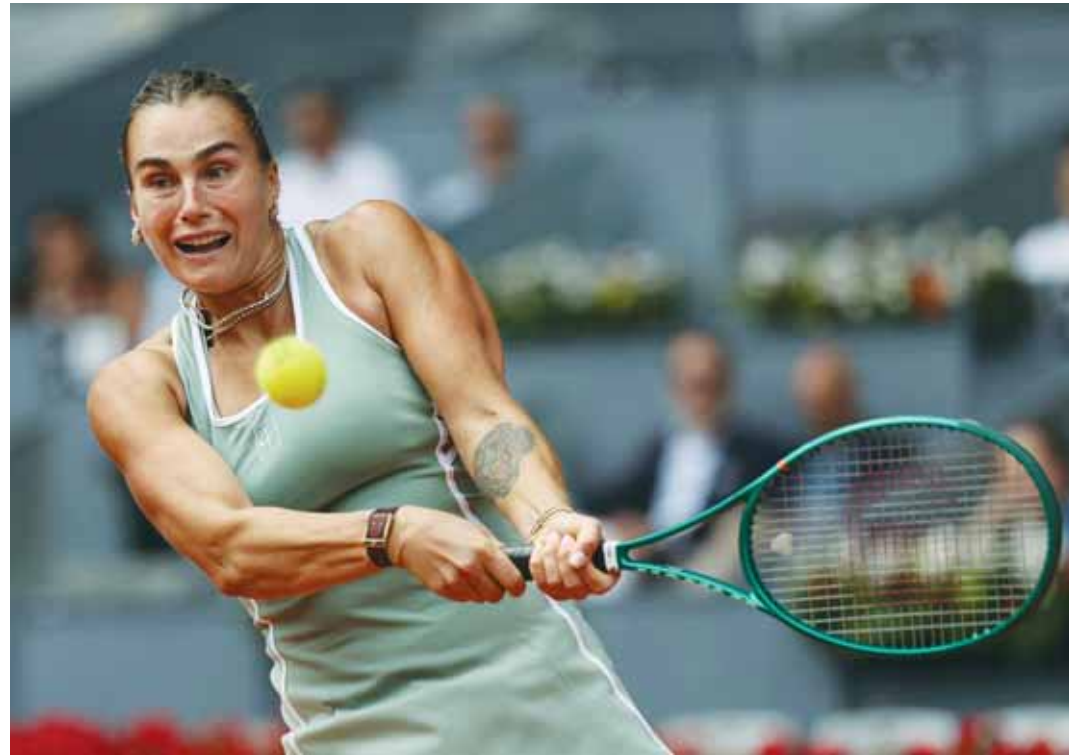
Belarus' Aryna Sabalenka in action during Madrid Open match against USA's Peyton Stearns yesterday.

The Polish fourth seed needed just 61 minutes to move past Snigur, who was coming off the first tour-level main draw victory of her career on clay over Daria Kasatkina. The Ukrainian qualifier saved four match points