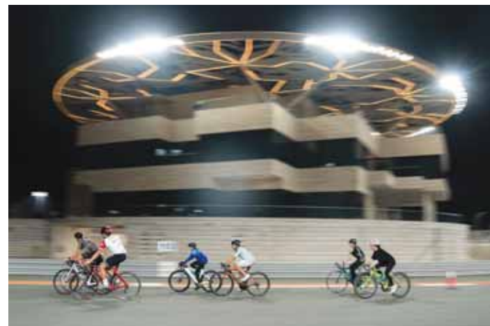
Open to runners, walkers and cyclists alike, participants took to the same asphalt that hosts Formula 1 and MotoGP races.

L usail International Circuit (LIC) concluded a standout edition of its Mixed Training Day, drawing more than 1200 participants onto its iconic 5.38 km track in a fully enhanced and integrated sports and wellness experience. The event represents a significant evolution of the community initiative, and a clear validation of LIC's commitment to making the circuit a destination for active living, not just world class motorsport.