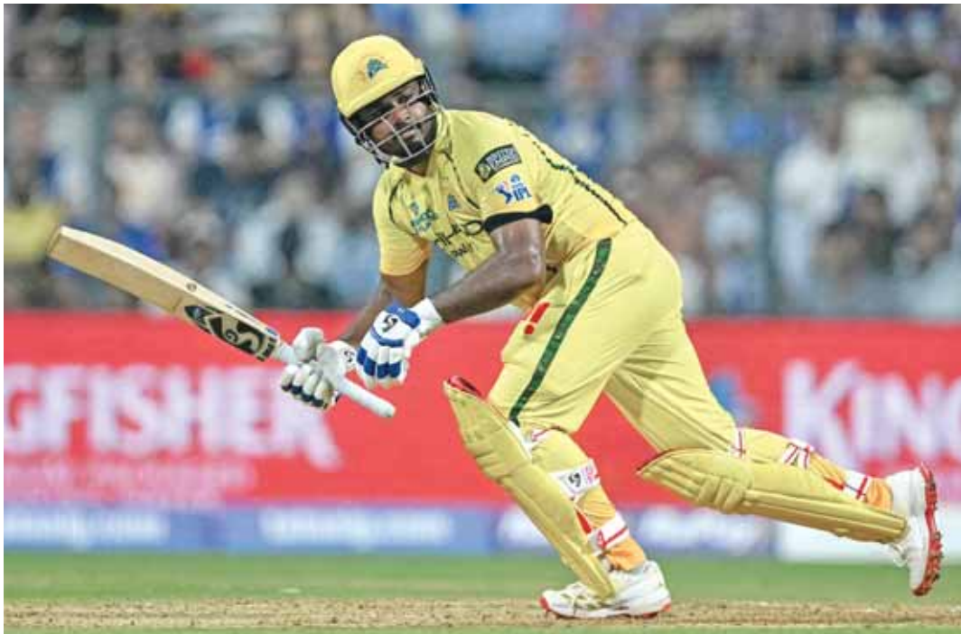
Chennai Super Kings' Sanju Samson in action during the Indian Premier League match against Mumbai Indians at the Wankhede Stadium in Mumbai yesterday.