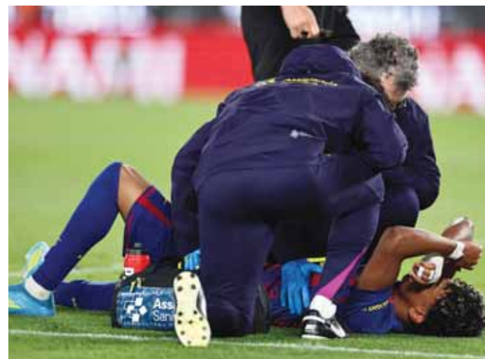
Barcelona's Lamine Yamal receives medical attention after sustaining an injury during the La Liga match against Celta de Vigo at Camp Nou stadium in Barcelona on Wednesday.

However, the 18-year-old could be rested at the start of the tournament given the significant risk of aggravating the injury.