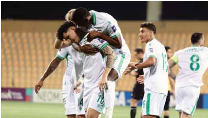
Al Ahli booked their place in the last four with a convincing 3-1 victory over Jordan's Al Hussein in the quarter-finals.