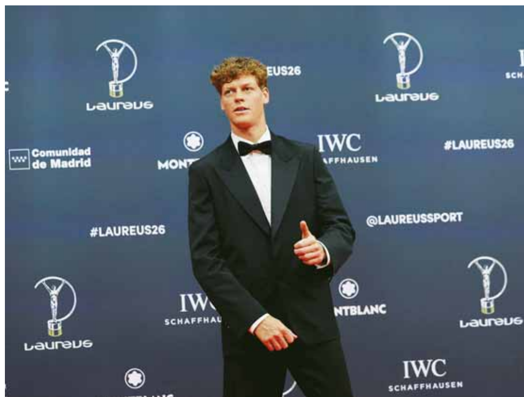
Italy's Jannik Sinner poses on the Red Carpet ahead of the 27th Laureus World Sports Awards gala in Madrid.

"We try to maximise to be in the best possible shape there, but I'm here trying to do my best and