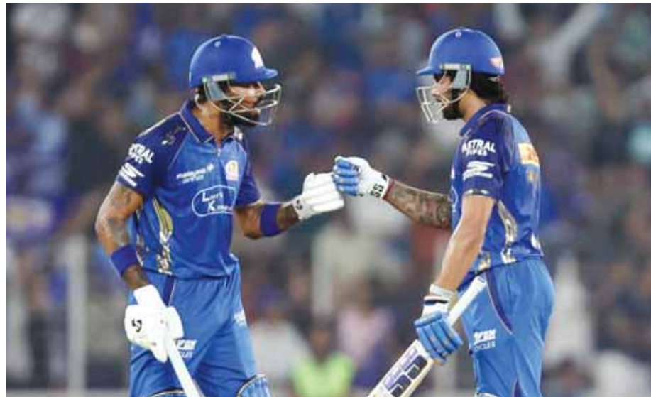
Mumbai Indians' Tilak Varma (right) and Hardik Pandya react during their IPL match against Gujarat Titans in Ahmedabad on Monday.

"In the last five games, I haven't spent much time in the middle. So I was just thinking that in this game, I want to spend time in the mid-