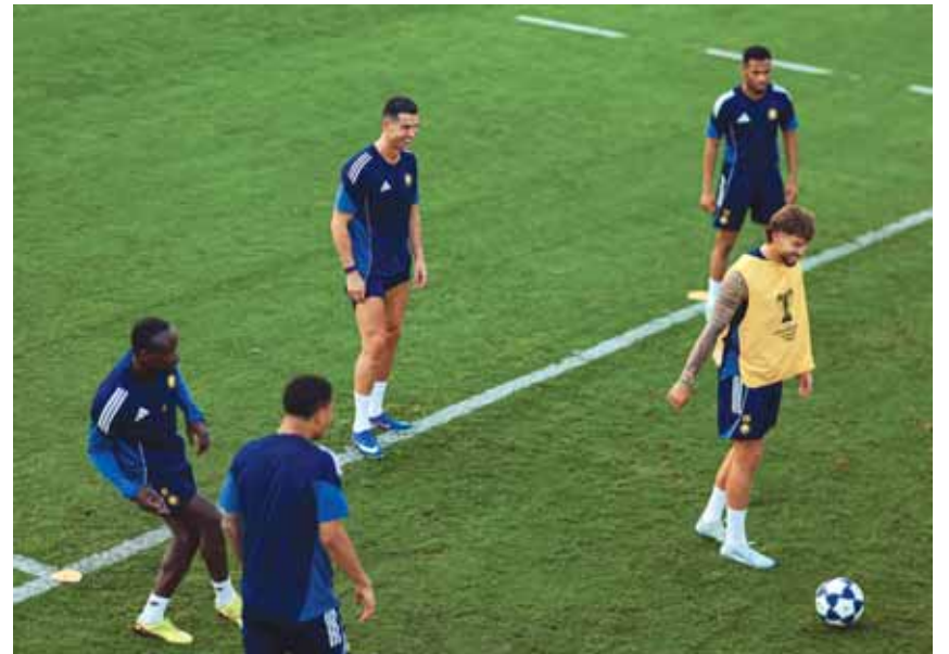
Al Nassr's Cristiano Ronaldo (centre) trains with team-mates in Dubai yesterday.

while, is equally determined to guide his side to continental success, stating his ambition to make history by becoming the first Saudi Arabian club to lift the AFC Champions League Two title.