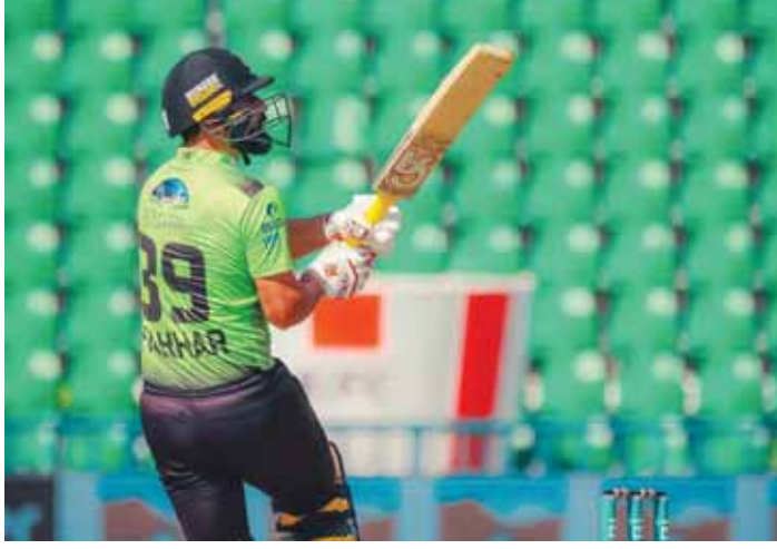
Fakhar Zaman of Lahore Qalandars hooks during his century against Quetta Gladiators in a PSL match in Karachi yesterday.