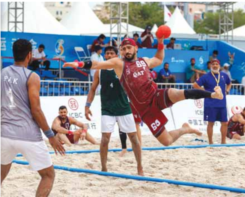
Qatar secured a 2-0 win over Pakistan in their opening match before beating Oman by the same scoreline at the Asian Beach Games in Sanya, China.

Qatar are top of the group, level with Thailand, boosting their chances of qualifying for the semis