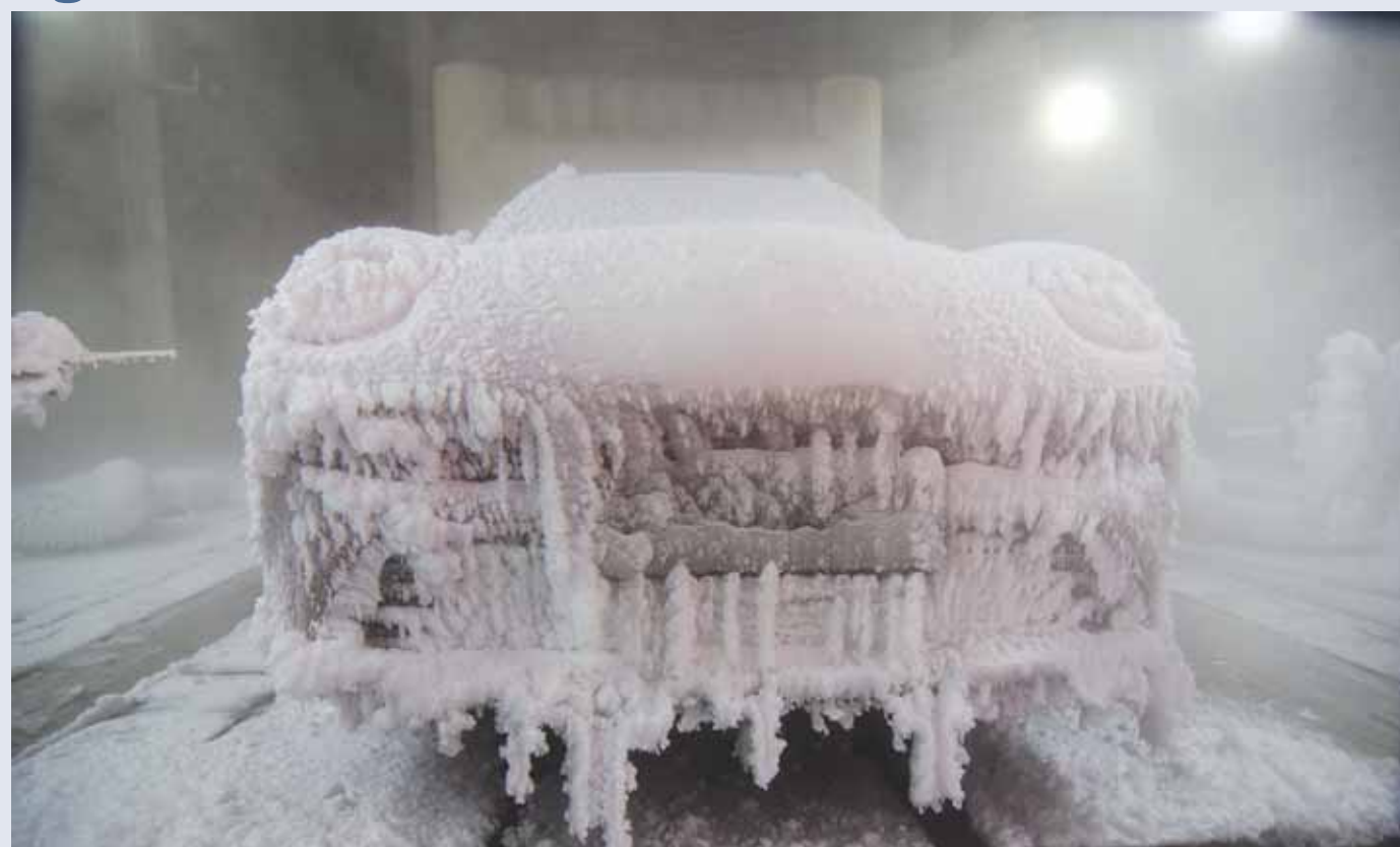
A Great Wall Motor branded Ora 5 model undergoes extreme weather testing at Great Wall Motor's technical centre in Baoding, China, yesterday.