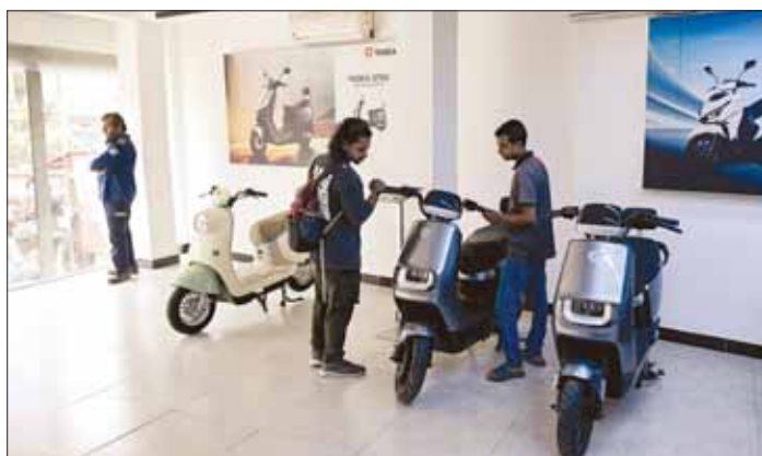
A customer inspects an electric scooter of Chinese e-bike maker Yadea at a showroom in Dhaka on April 21, 2026 amid Bangladesh's fuel crisis triggered by the Middle East war.

Sweden's environment minister announced on April 7 that "electrification is the future" to protect citizens from surging oil and natural gas prices.