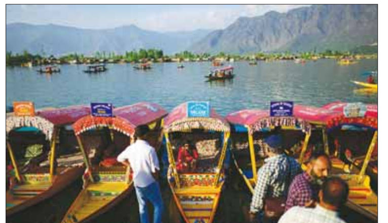
Tourists ride Shikara, a traditional wooden boat at the iconic Dal Lake in Srinagar.

India has at least 500,000 soldiers permanently deployed in Kashmir.