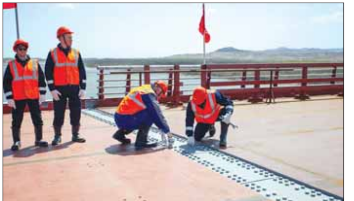
A ceremony marking the connection of the two sides of the new Russia-North Korea road bridge over the Tumen River, set to open this summer.

a defence treaty in 2024 that calls for military support in the case of either country being attacked.