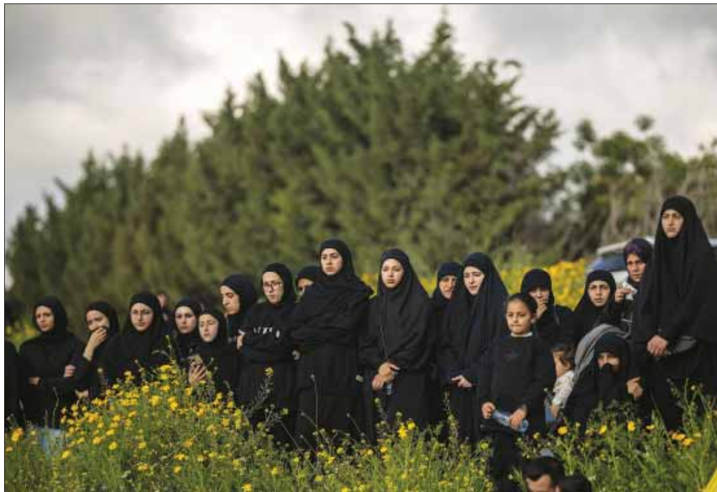
Mourners attend the mass funeral of Hezbollah members and others killed during the conflict with Israel in Kfar Sir, Lebanon on Tuesday

The Frenchman was killed and three others wounded when their unit was ambushed on Saturday as it headed to a UN Interim Force