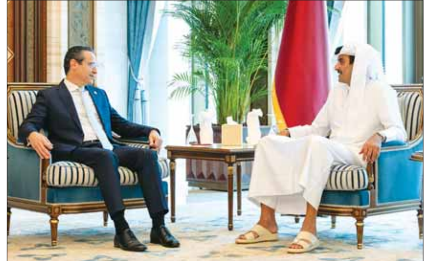
His Highness the Amir Sheikh Tamim bin Hamad al-Thani met yesterday morning, in his office at Lusail Palace, with Chief Executive Officer of Shell plc Wael Sawan during his visit to the country. The two sides discussed existing co-operation between Qatar and Shell plc and ways to support and develop it, particularly in the energy sector.