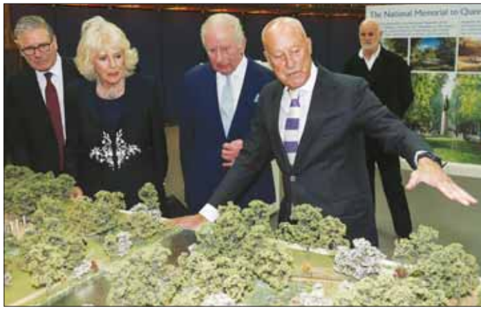
Britain's King Charles and Queen Camilla, with architect Norman Foster and British Prime Minister Keir Starmer, attend a presentation on the final design for the national memorial to Queen Elizabeth II at the British Museum, on the 100th anniversary of the late queen's birth, in London, yesterday.