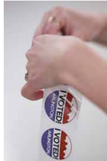
Stickers for Virginia voters are seen at a polling location at Washington-Liberty High School in Arlington, Virginia.

Texas moved first, adopting a map that could add up to five Republican seats. California an-