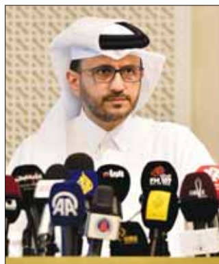
Dr Majed bin Mohamed al-Ansari at the media briefing yesterday.

Qatar is maintaining active communication with all concerned international and regional parties, including the United States, to monitor developments and support efforts toward a peaceful resolution of the ongoing crisis, the country's top foreign ministry spokesman said yesterday. Speaking at the Ministry of Foreign Affairs' weekly media briefing, Adviser to the Prime Minister and Official Spokesperson Dr Majed bin Mohamed al-Ansari threw Qatar's full weight behind Pakistan's mediation efforts, describing them as a critical pathway toward de-escalation. He cautioned against drawing premature conclusions about the outcome of current negotiations, noting that Gulf states, including Qatar, are in near-daily contact with various stakeholders given the crisis's direct impact on regional security and stability. "The international community is backing these efforts and remains hopeful for their success," he said. On Iran, al-Ansari revealed that during the most recent call