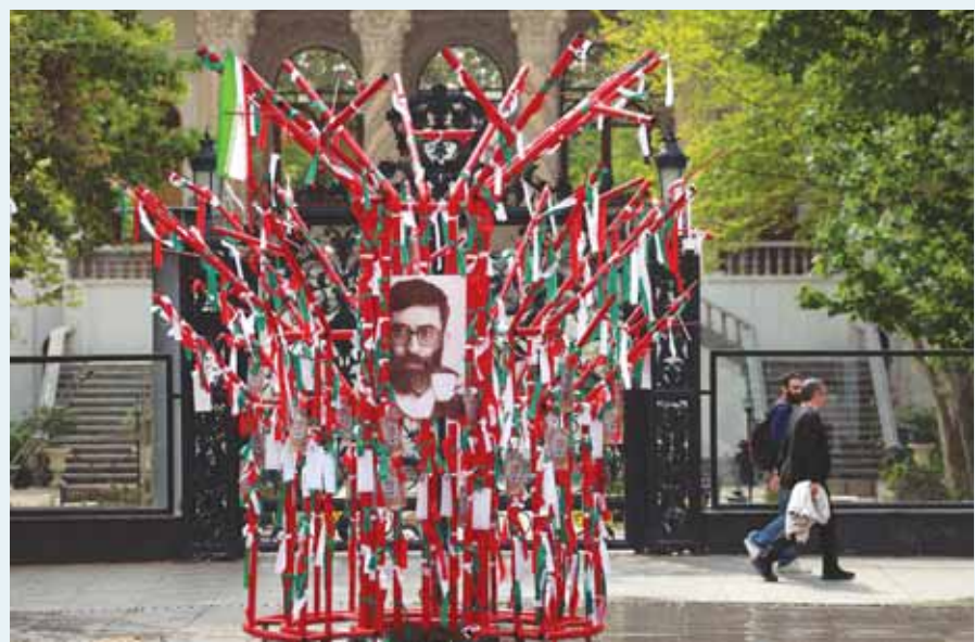
A structure adorned with the national flag and a portrait of the late Iranian supreme leader Ayatollah Ali Khamenei as a young man at a park in northern Tehran. With the ceasefire extended, a great contingency awaits in Islamabad where a fresh round of negotiations brokered by Pakistan to end the US-Iran conflict is expected to take place. The ensuing conflict has sent crude prices soaring – leaving the world in the grip of inflation fears.