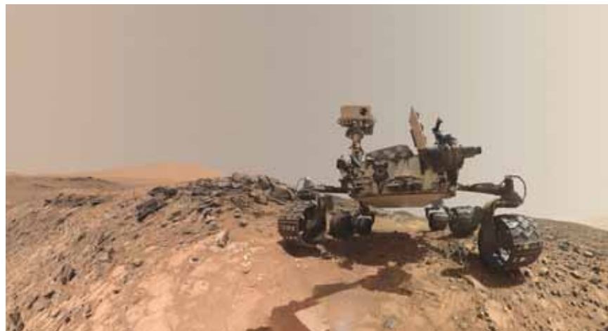
This Nasa photo released in 2018 shows a low-angle self-portrait of Nasa's Curiosity Mars rover vehicle at the site from which it reached down to drill into a rock target called 'Buckskin' on lower Mount Sharp. A Nasa rover has discovered more building blocks of life on Mars after carrying out a chemistry experiment never before conducted on another planet, scientists said yesterday.

"This experiment's never been run before