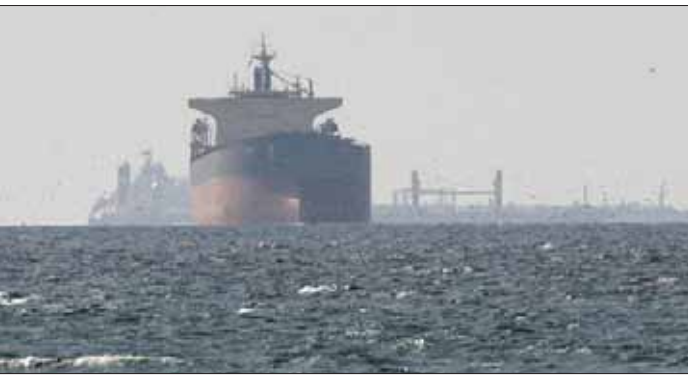
Cargo ships in the Gulf, near the Strait of Hormuz, as seen from northern Ras al-Khaimah in March.

The key to returning to normal production remains the reopening of the Strait of Hormuz, through which approximately 20% of global oil and LNG production was