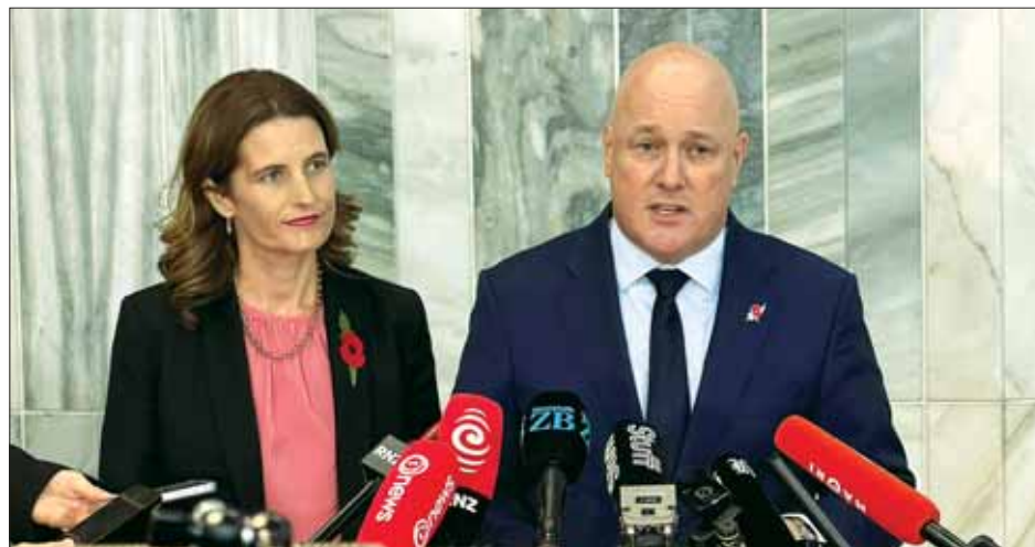
New Zealand Prime Minister Christopher Luxon speaks at a press conference besides National Party deputy leader Nicola Willis in Wellington yesterday.

Luxon, a former airline executive, has seen both his personal and his party's popularity fall