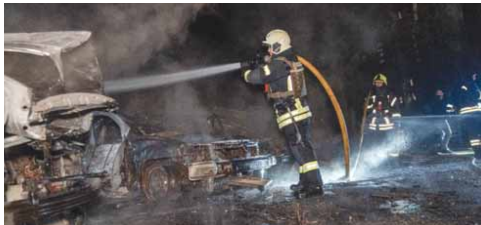
Firefighters extinguish burning cars at the site of a residential area which was hit during overnight Russian drone strikes, in Sumy, yesterday.

Gerasimov said Russia's Southern Grouping of forces was attacking the Donetsk fortress belt comprising the cities of Sloviansk, Kramatorsk and Kostiantynivka, and that Russian forces were about 7 to 12km (4.3 to 7.5 miles)