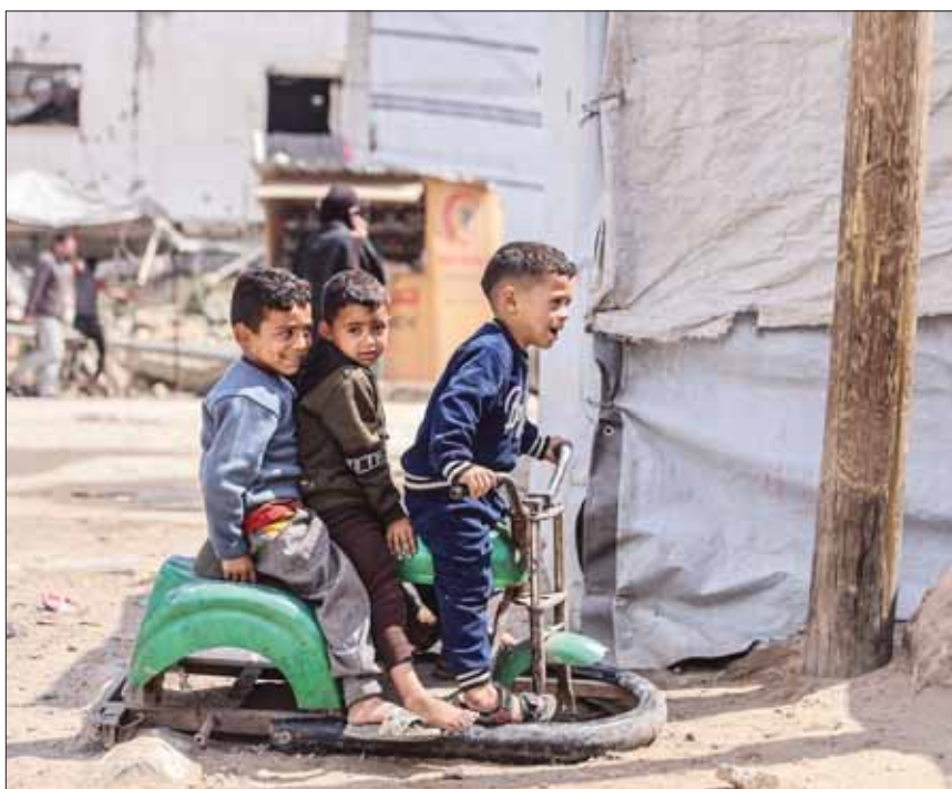
Palestinian children play on a street in Gaza City. Since October 10, a fragile US-sponsored truce in Gaza has largely halted the fighting between Israeli forces and Hamas, but both sides have alleged violations.

"There's tonnes of supplies sitting over the border, in Egypt and in Jordan, and