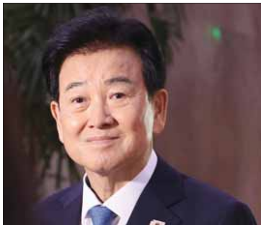
South Korea's Unification Minister Chung Dong-young speaks to reporters as he arrives at the Government Complex in Seoul.

He said on Monday it was "deeply regrettable" that his remarks had been interpreted as a leak of classified information, insisting that they were based on publicly available information and had been raised at his confirmation hearing in July.