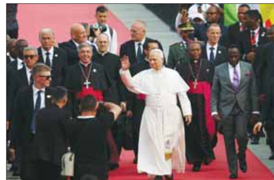
Pope Leo XIV walks at the Leon XIV campus of the National University of Equatorial Guinea in Malabo, Equatorial Guinea on Monday.

The leader of the world's Catholics voiced regret that "the gap between a 'small minority' – 1% of the population – and the overwhelming majority has widened dramatically" while the country was bogged down in endemic corruption. Leo has to strike a delicate balance in Equatorial Guinea: supporting the faithful without backing the regime, which is regularly accused of authoritarianism