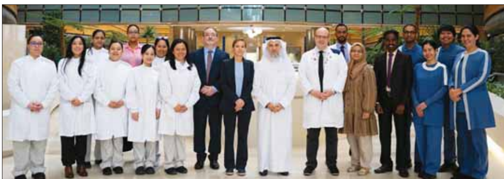
Haematology and Oncology and GMP teams.