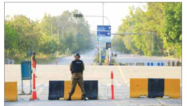
Police officers stand guard on a road leading to the Serena Hotel yesterday as Pakistan prepared to host the US and Iran for the second phase of peace talks in Islamabad.

al cure. This milestone reinforces Qatar's position as a regional leader in advanced medicine and precision health. Through our collaboration with Vertex, we are bringing the world's first approved medicine using the Nobel Prize winning CRISPR/Cas9 technology to treat transfusion-dependent beta thalassaemia and severe sickle cell disease." Approved by the Ministry of Public Health in Qatar, as well as the US Food and Drug Administration, the European Medicines Agency, and other agencies, Casgevy is the first-in-class CRISPR/Cas9 gene-edited therapy that targets the genetic root cause of these inherited blood disorders. The therapy has shown transformative outcomes for patients with sickle cell disease and independence from regular blood transfusions for patients with transfusion-dependent beta thalassaemia. To Page 4