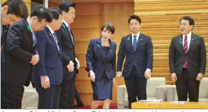
Japanese Prime Minister Sanae Takaichi attends a cabinet meeting at the Prime Minister's Office in Tokyo yesterday.

Exports had previously been limited to equipment classified under five categories: search and rescue, transportation, warning, surveillance and minesweeping.