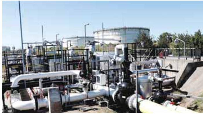
The Druzhba oil pipeline between Hungary and Russia is seen at the Hungarian MOL Group's Danube Refinery in Szazhalombatta.

"The pipeline can resume operation," he added.