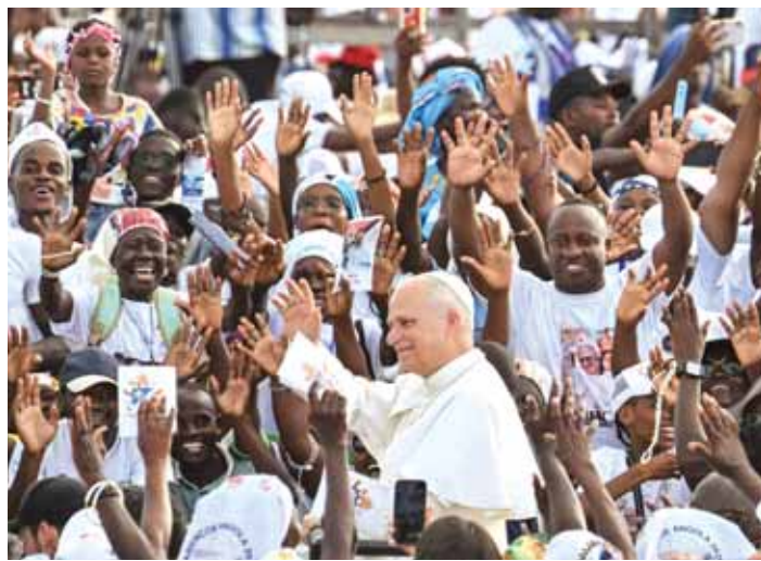
Pope Leo XIV waves to the crowd as he arrives to lead a Holy Rosary Prayer on the esplanade in front of the "Mama Muxima" Shrine in Muxima yesterday.