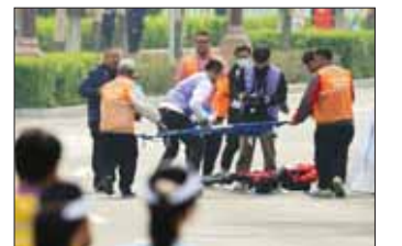
Staff members pick up a humanoid robot that fell close to the finish line at the half-marathon in Beijing yesterday.

That included a lengthy martial arts demonstration where over a dozen Unitree humanoids performed sophisticated fight sequences waving swords, poles and nunchucks in close proximity to human children performers.