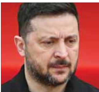
Ukraine's President Volodymyr Zelensky.

Zelensky said: "It is important that Russian tankers are stopped, not allowed to deliver oil to ports.