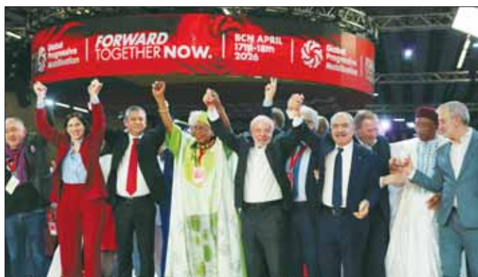
Brazil's President Luiz Inacio Lula da Silva attends the Global Progressive Mobilisation in Barcelona, Spain, on Saturday.

While organisers were adamant the event, hosted by several left-wing political networks and Spain's Socialist Party, was not a mobilisation against Trump, they also said the left could not afford to sit tight and wait for a new US administration, with many echoing Canadian Prime Minister Mark Carney's call for "middle powers" to coalesce.