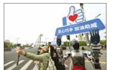
A robot cheers for the robots taking part in the half-marathon in Beijing yesterday.