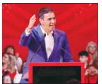
Spain's Prime Minister Pedro Sanchez speaks at the Global Progressive Mobilisation in Barcelona, Spain, on Saturday.