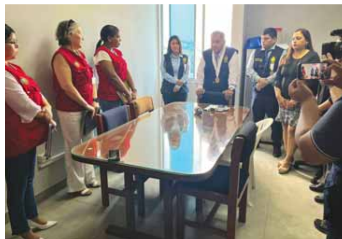
Prosecutors raiding a warehouse where the ONPE (National Organisation of Electoral Processes) stores electoral material in Lurin, south of Lima.