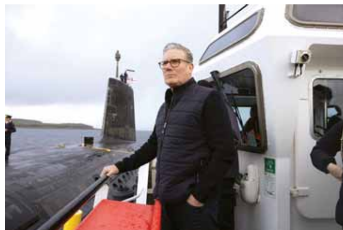
British Prime Minister Keir Starmer observes a Vanguard-class submarine, in Helensburgh, Scotland.

Ex-civil servants have accused Starmer of scapegoating Robins, who is to give his own account to a parliamentary committee to-