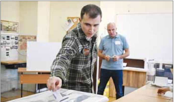
A voter casts his ballot at the polling station during Bulgaria's parliamentary elections in Sofia yesterday.