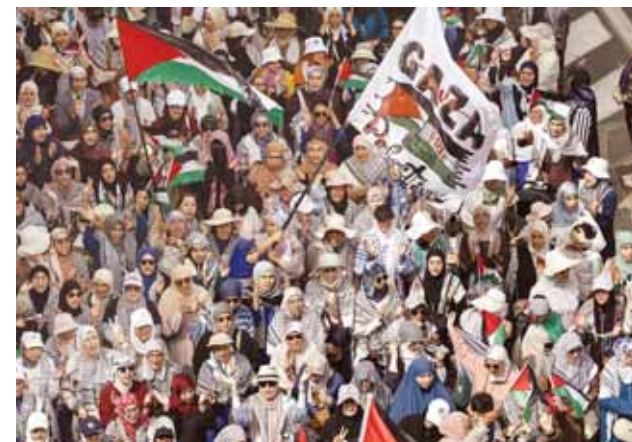
Moroccan protesters wave flags during a rally in support of the Palestinian people and against Israel's approval of a death penalty bill, in Rabat yesterday.