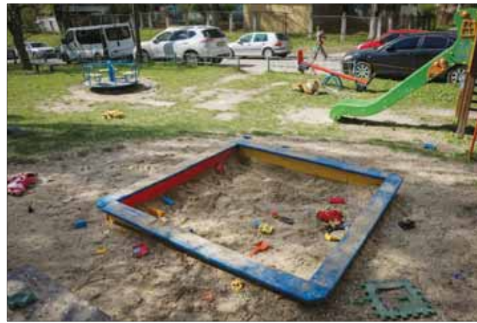
Abandoned toys on the playground at the site of yesterday's shooting incident, in Kyiv, yesterday.

The supermarket has been cordoned off and remains closed. Bullet holes are visible in windows of the supermarket, and