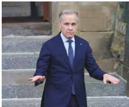
Prime Minister Mark Carney waiting for Finland's President Alexander Stubb in Ottawa, Ontario.

"The situation today feels unique, but we've faced down threats like this before," Carney said, referencing Brock and several other Canadian historical figures, including Chief Tecumseh who united Indigenous Nations across the Great Lakes to resist US expansion in 1812.