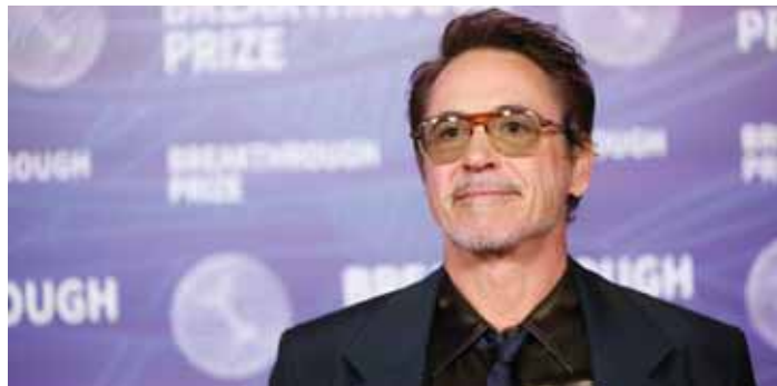
Robert Downey Jr attends the 12th Breakthrough Prize ceremony gala in Santa Monica, California.

"The US has the most anti-science administration in US history," the actor said. "It's always impor-