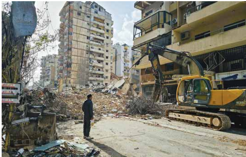
A bulldozer clears the rubble from the site of an Israeli airstrike as people return to Beirut's southern suburbs yesterday.

Fait accompli Lebanon's state-run National News Agency (NNA) said that "the Israeli enemy is still destroying what remains of houses" in Bint Jbeil on Sunday after report-