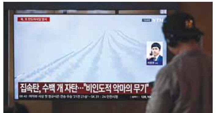
A man watches a television screen showing a news broadcast with file footage of a North Korean missile test, at a train station in Seoul yesterday.

Among them was an expression of regret from Seoul over civilian drone incursions into the North