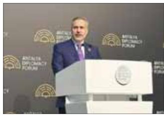
Turkiye's Foreign Minister Hakan Fidan delivers a speech as he attends the 5th edition of the Antalya Diplomacy Forum yesterday.

Fidan said he spoke with Pakistani officials on Sunday but would not give a date when new talks could be held.