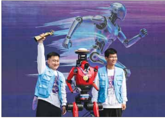
Team members celebrate next to the winning Honor Lightning humanoid robot during a medal ceremony after the second Beijing E-Town Half Marathon and Humanoid Robot Half Marathon in Beijing yesterday.

"The humanoid robots' running posture I saw was really quite impressive... considering that AI has only been developing for a short