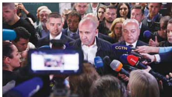
Rumen Radev, former Bulgarian president and leader of Progressive Bulgaria coalition, speaks to the media after the first exit polls at the parliamentary election, in Sofia, Bulgaria.

He said that he would be willing to work with the pro-Euro-