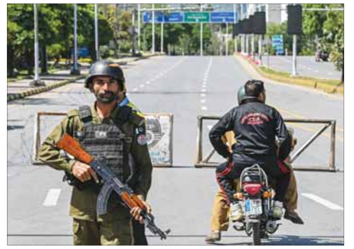
A police personnel stands guard at a closed road leading to the Serena Hotel in the Red Zone area of Islamabad yesterday.

AFP journalists saw armed guards and checkpoints near Islamabad's most secure hotels, including the Marriott and the