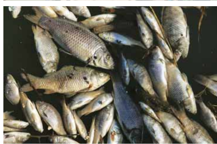
Iraqi fish farmers clean tanks of dead fish at a farm in the town of al-Numaniyah, near the city of Kut in southern Iraq.

Normally, it would gradually mix into the Tigris, but this time heavy rain created a stronger current in Diyala, sending a less-diluted polluted water into the Tigris, and "thus affecting downstream fisheries and potentially also water treatment plants".