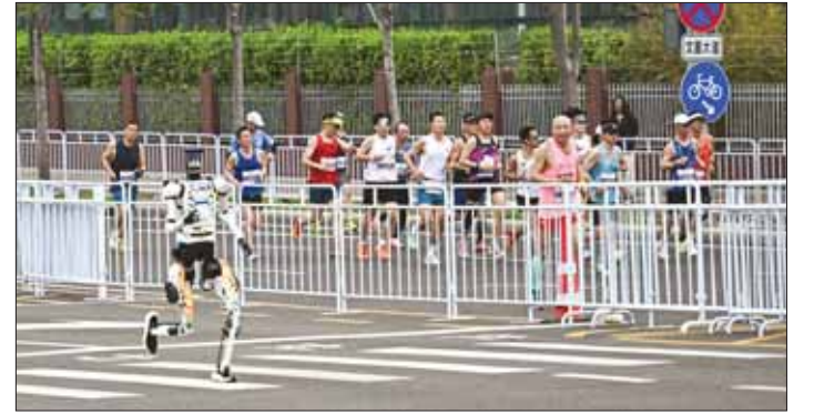
A robot runs in the second Beijing E-Town Half Marathon and Humanoid Half Marathon in Beijing yesterday.

Experts said the skills on display during the half-marathon, while