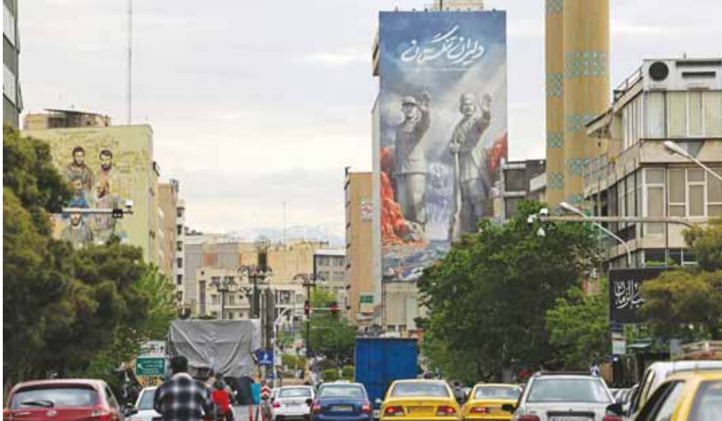
A giant billboard referring to the 'Strait of Hormuz' and IRGC navy along a busy street in the Iranian capital on Sunday.

That prompted elation in global markets and sent oil prices plunging, but Tehran reversed course after Trump insisted the