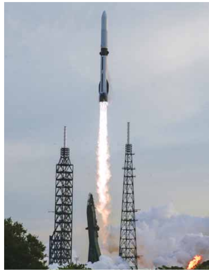
A Blue Origin New Glenn rocket lifts off from the Cape Canaveral Space Force Station in Florida yesterday.