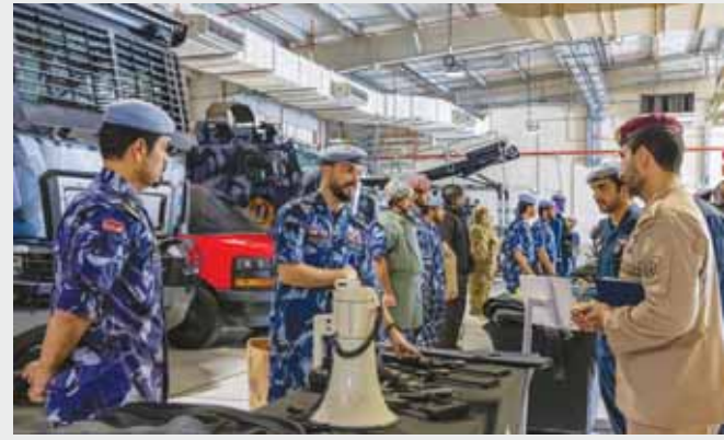
The Internal Security Force (Lekhwiya) hosted the second cohort of the Police Academy's Security Command and Staff Programme, in a visit aimed at familiarising them with the Force's tasks and duties. HE the Deputy Commander of the Internal Security Force (Lekhwiya) Major-General Mohammed Mesfer al-Shahwani delivered a lecture outlining Lekhwiya's role in maintaining the country's internal security. During a tour of Al Duhail Camp, the visiting officers were also shown the equipment and vehicles used in various security operations. - QNA