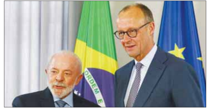
German Chancellor Friedrich Merz (right) and Brazilian President Luiz Inacio Lula da Silva meet for bilateral talks in Hanover, Germany, yesterday.

Merz on Sunday contended that the deal would "make all the economies involved stronger, more independent and more resilient".