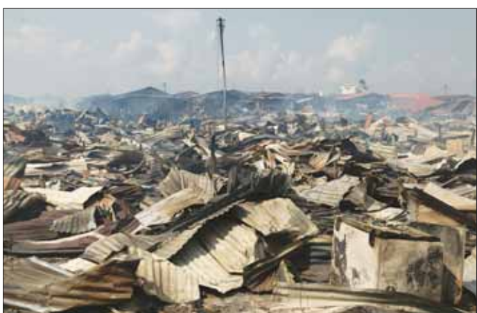
Ruins of houses following a fire that destroyed around 1,000 homes in a coastal village in Sandakan, Malaysia, yesterday.

"The priority now is the safety of the victims and immediate assistance on the ground," he said in a Facebook post.