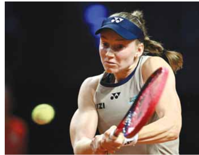
Kazakhstan's Elena Rybakina returns the ball to Russia's Mirra Andreeva during the Stuttgart Open semi-final yesterday.

That sole break was enough as Muchova then served out the match to love, sealing the deal with an ace out wide.