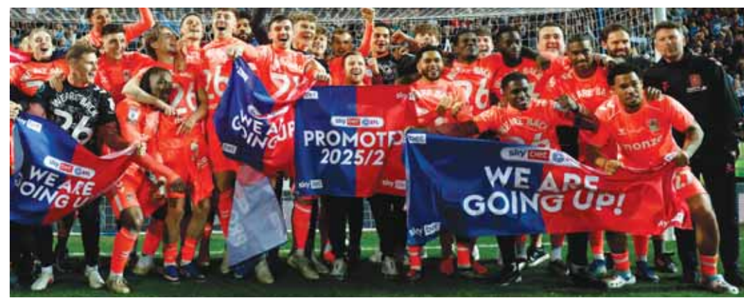
Coventry City players celebrate after winning promotion to the Premier League in Blackburn, Britain.