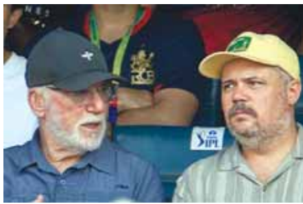
Former Australian Test great and captain Allan Border watches the IPL match with his son in Hyderabad yesterday. Border, who played 156 Tests, captained Australia to World Cup glory in 1987.

"We didn't want to take it too deep, we just wanted to stay positive... and try to put pressure on the bowlers," Rahul said at the post-match presentation.