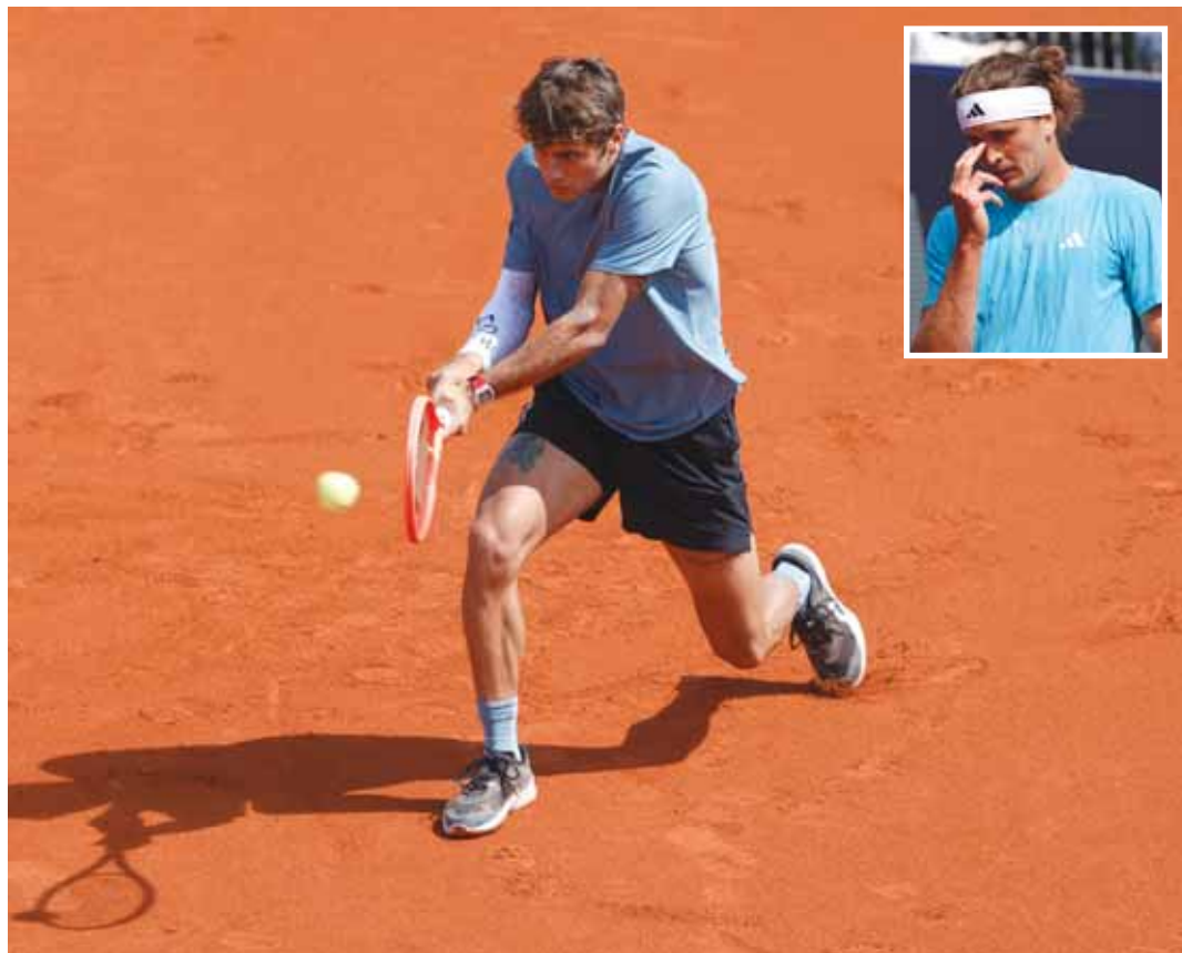
Italy's Flavio Cobolli in action during the Munich Open semi-final against Germany's Alexander Zverev (in set) yesterday.

But Zverev hit back immediately as he secured his first break points of the encounter, converting at the second time of asking to halt