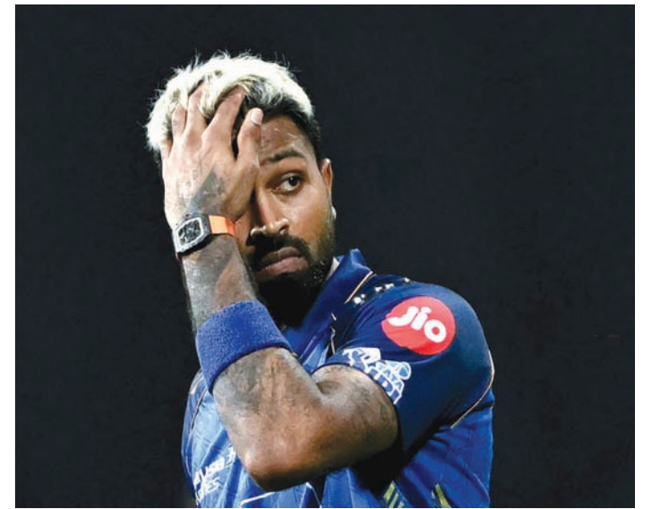
Mumbai Indians' captain Hardik Pandya reacts after his team's defeat against Punjab Kings at the Wankhede Stadium in Mumbai on Thursday. Mumbai have lost five matches out of six.