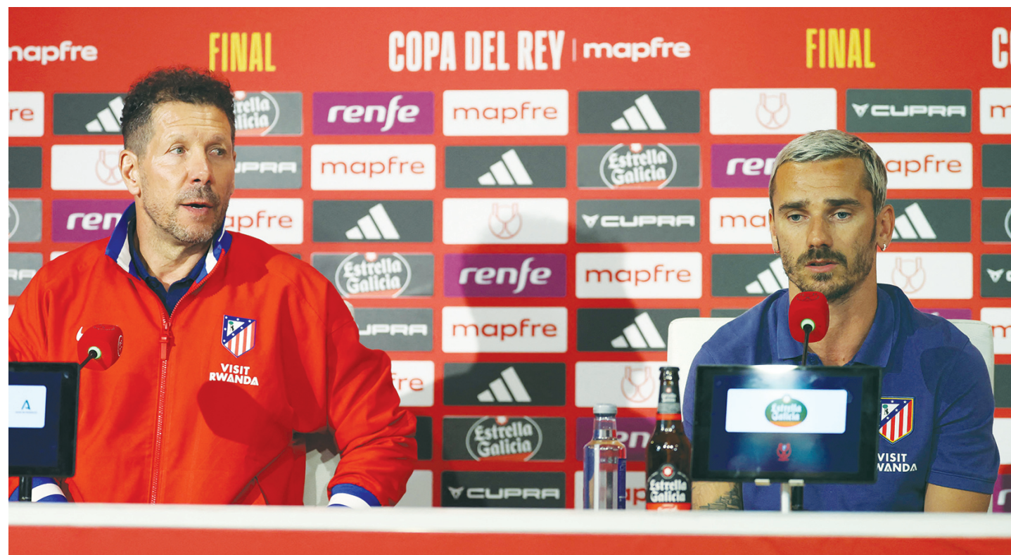
Atletico Madrid's coach Diego Simeone (left) and forward Antoine Griezmann during a press conference yesterday, on the eve of the Copa del Rey final against Real Sociedad at La Cartuja stadium in Seville.

'We'll only realise over time that we had and still have a football genius'