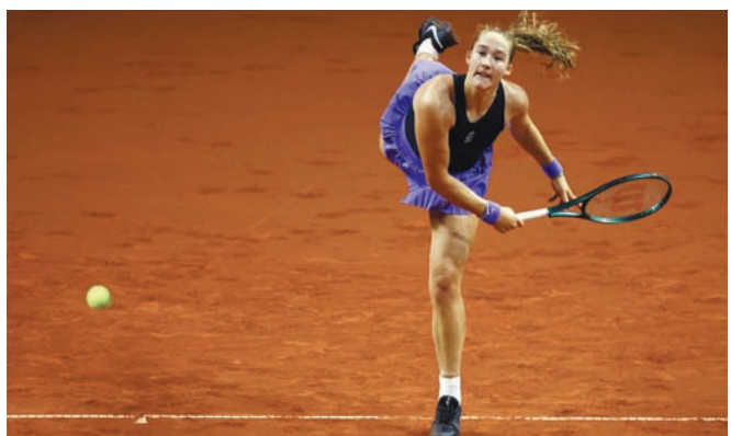
Russia's Mirra Andreeva in action during her quarter-final against Poland's Iga Swiatek yesterday.

"It was a great fight. I'm just happy that I finally, finally beat her," Muchova said. "This was actually our first match on a clay court. On clay we were 0-0 in the matches - I tried to keep it positive." Fourth seed Svitolina moved past Czech Linda Noskova 7-6 (7/2), 7-5 to book her semi-final spot. The in-form Ukrainian has now reached five semi-finals this season. Svitolina told reporters she had re-discovered her fighting spirit after a difficult 2025.