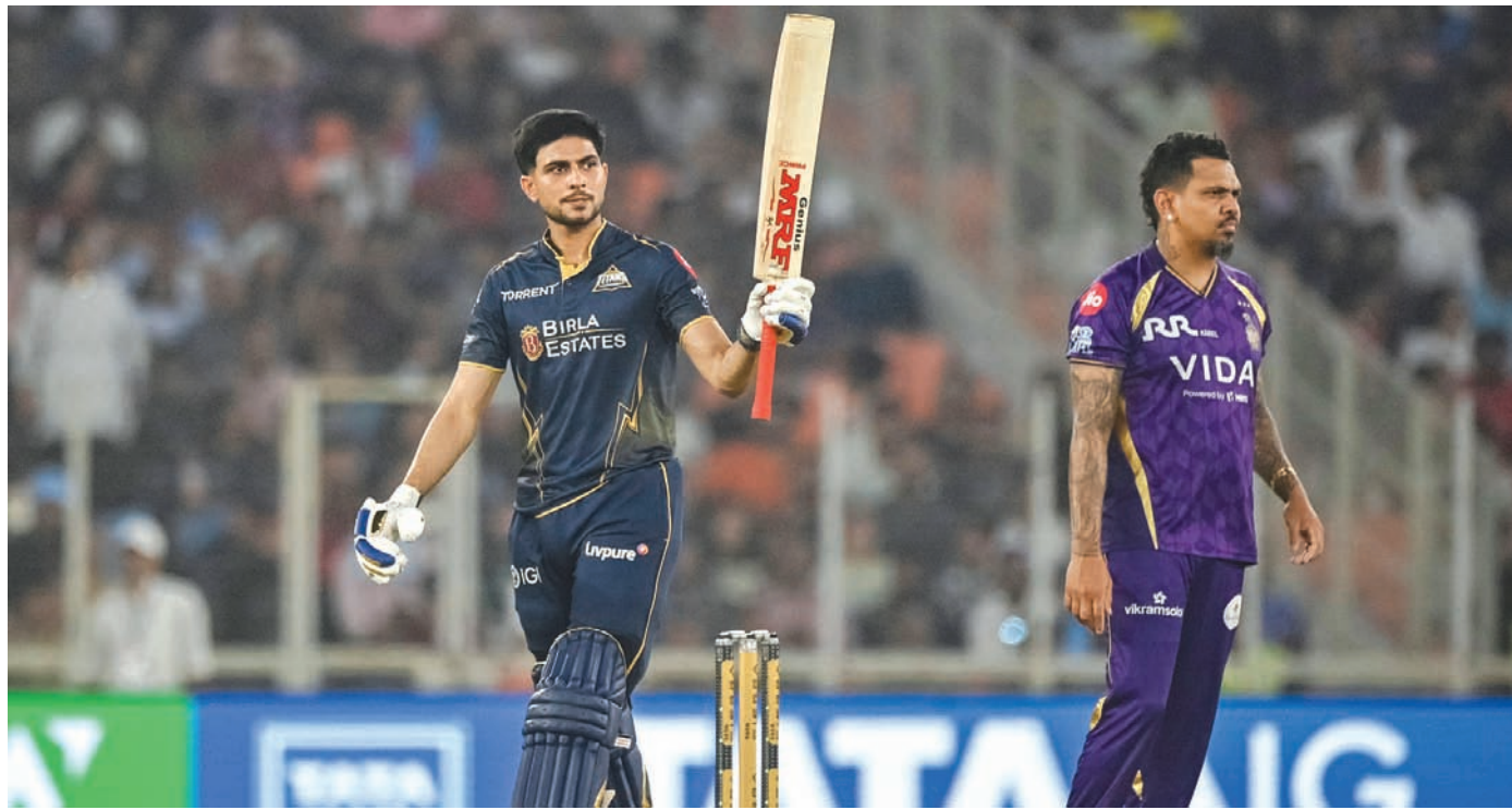
Gujarat Titans' captain Shubman Gill (left) celebrates after scoring a half-century during the IPL match against Kolkata Knight Riders in Ahmedabad yesterday.

Opening batsman Gill hit third straight half-century for the Titans