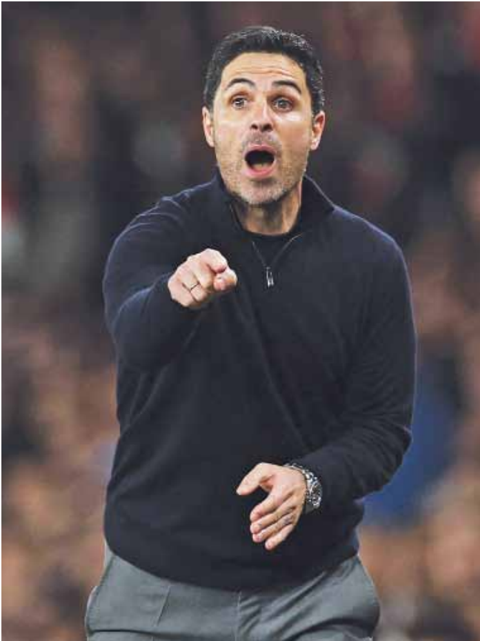
Arsenal's manager Mikel Arteta reacts during the UEFA Champions League quarter-final, second-leg match, against Sporting Lisbon at the Emirates Stadium in London on Wednesday.

In 2023 and 2024 they squandered substantial leads that al-