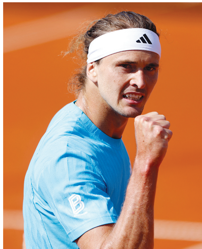
Germany's Alexander Zverev celebrates after winning his quarter-final against Argentina's Francisco Cerundolo in Munich yesterday.