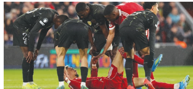
Players care for Liverpool's striker Hugo Ekitike who lies injured during the UEFA Champions League quarter-final, second-leg match, against PSG at Anfield in Liverpool last Tuesday.

"I'm 100 percent sure he will be one of those that in 10 to 15 years say, 'maybe this injury even helped me to become stronger and become even more ready to perform even at a higher level