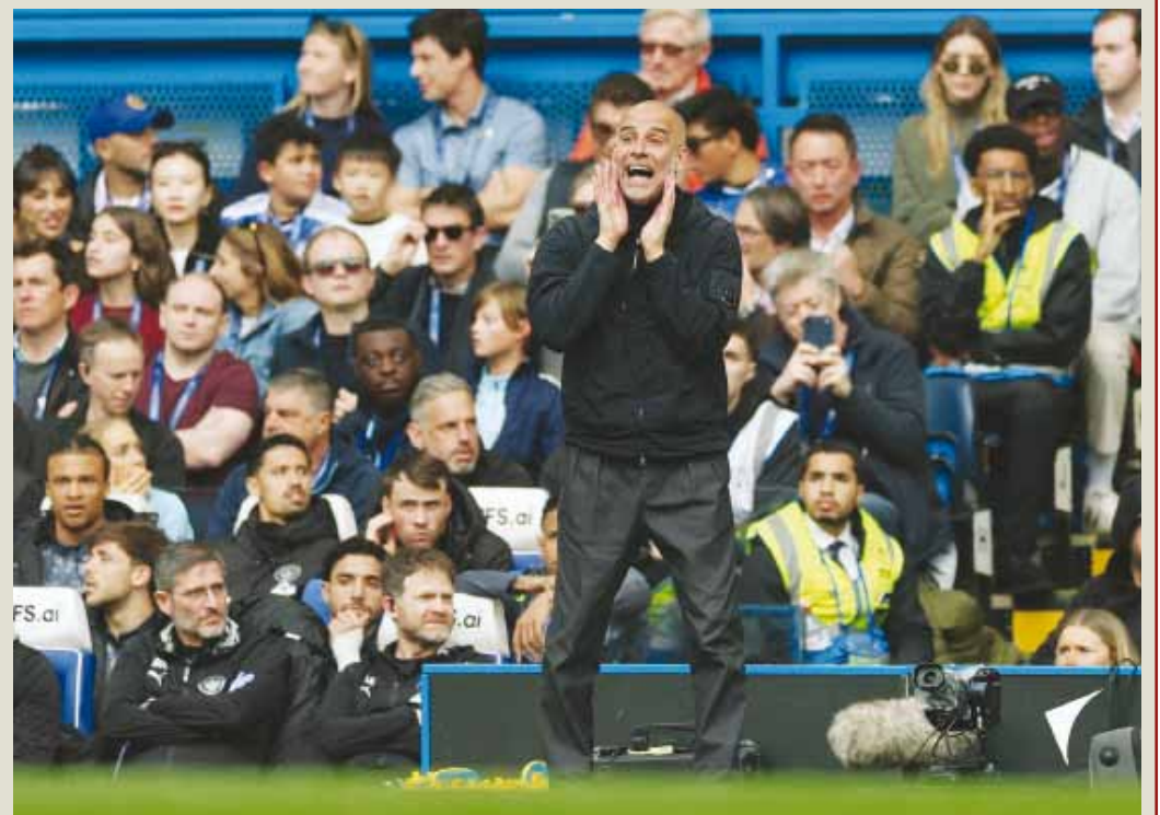
Pep Guardiola thinks that his side would have a lot more work to do even if they beat the Gunners.

Guardiola confirmed that Nico O'Reilly, who scored both goals in the League Cup final, is fit despite coming off injured in last weekend's 3-0 win at Chelsea. Captain Ruben Dias, though, remains sidelined.