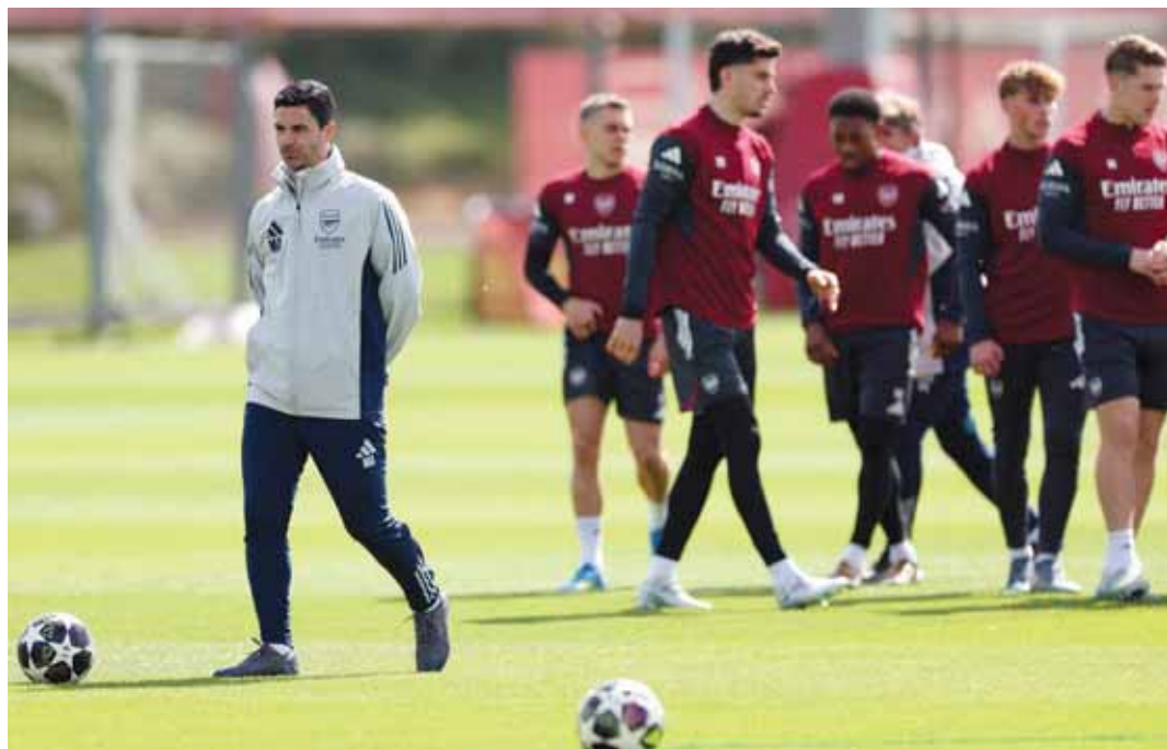
Arsenal's Spanish manager Mikel Arteta (left) during a training session in London yesterday, on the eve of their UEFA Champions League quarter-final second-leg match against Sporting Lisbon.

Arsenal are just six points ahead of second-placed City, who have a game in hand and host the Gun-