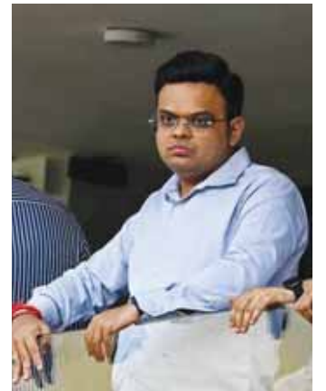
ICC chairman Jay Shah looks out from the stands before the start of IPL match between Delhi Capitals and Sunrisers Hyderabad in Visakhapatnam on March 30, 2025.