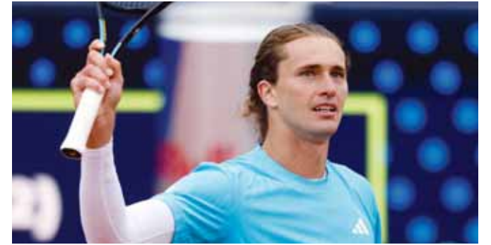
Germany's Alexander Zverev celebrates after winning his first-round match in Munich against Serbia's Miomir Kecmanovic.

Alexander Bublik, Flavio Cobolli and Joao Fonseca also all booked their spots in the second round with straight-set victories.