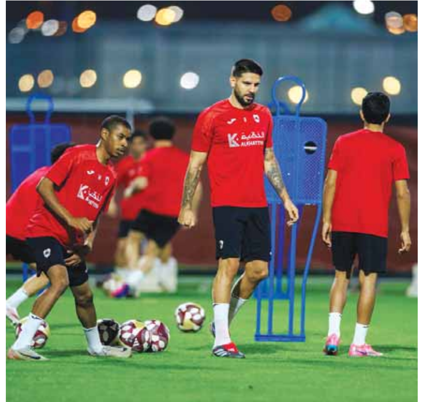
Al Rayyan players at a training session yesterday.