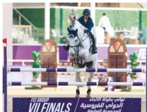
This year's FEI Group VII Finals introduces the Under-25 class for the first time.

The second day continues with individual and team competitions across all categories, with jumps ranging from 110 cm to 140 cm. On Friday, action starts at 2PM with a local junior class, followed by team competitions for juniors and youth. The highlight of the day will be the U-25 Grand Prix at 145 cm, scheduled for 9:30PM. The championship concludes on Saturday with a full afternoon of junior and youth competitions, featuring heights up to 135