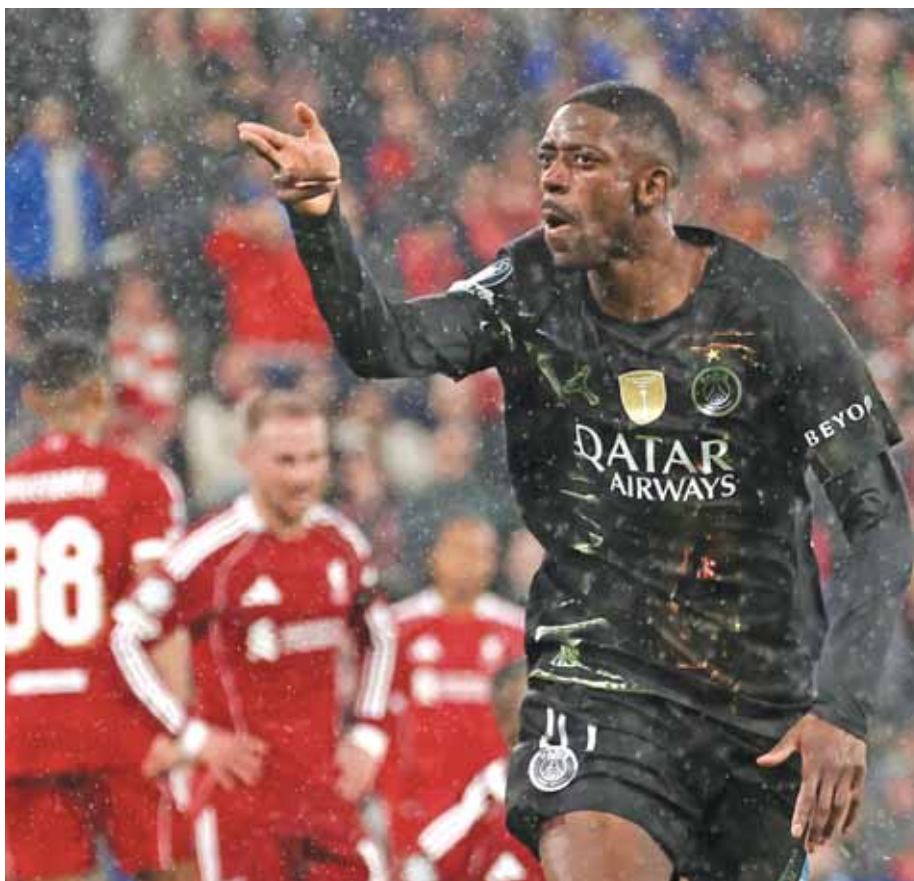
Paris Saint-Germain's Ousmane Dembele celebrates after scoring against Liverpool during the Champions League quarter-final second leg at Anfield in Liverpool. (AFP)

Giorgi Mamardashvili scrambled back towards his line to punch away Dembele's attempted chip before the Ballon d'Or winner blazed over from close range with just the Georgian to beat. Slot admitted before kick-off that Isak could only last for 45 minutes due to a lack of match practice and the Swede made way for Cody Gakpo at half-time in a further