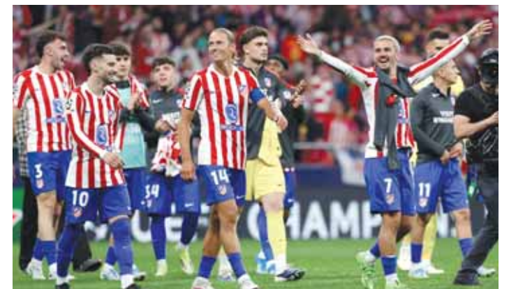
Atletico Madrid's Antoine Griezmann (right) celebrates with team-mates at Metropolitano Stadium in Madrid.

Matteo Ruggieri was left with blood streaming down his face after Gavi caught him with an elbow, with tensions rising. The game spun away from Barca when Eric Garcia was sent off for clipping Sorloth's heels as he ran through on goal, similar to Pau Cubarsi's red card in the first leg.