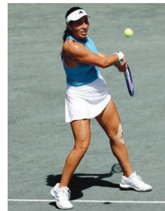
Jessica Pegula of the United States returns a shot to Diana Shnaider during Charleston Open quarter-final.