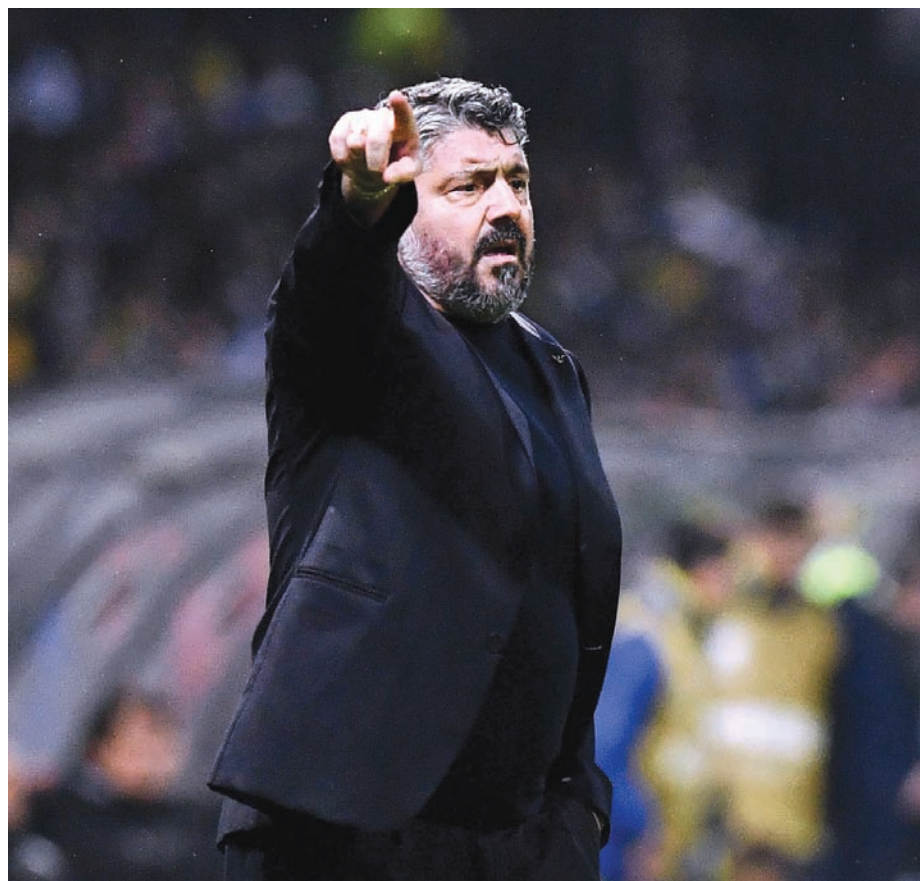
A World Cup winner in 2006, Gennaro Gattuso leaves after less than a year in charge of Italy, a team which has fallen far behind historic rivals like France and Spain in the last two decades.

Bosnia could easily have won the game in normal time but once Italy managed to get to the shoot-out Gattuso selected inexperienced