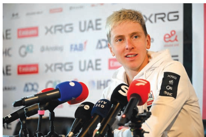
Slovenian rider Tadej Pogacar speaks to journalists during a press conference ahead of the 110th edition of Tour of Flanders in Waregem yesterday.

Evenepoel won the world championships in 2022 with a 25km solo breakaway having earlier in the year attacked solo 30km from the finish to win Liege-Bastogne-Liege, his first Monument success,