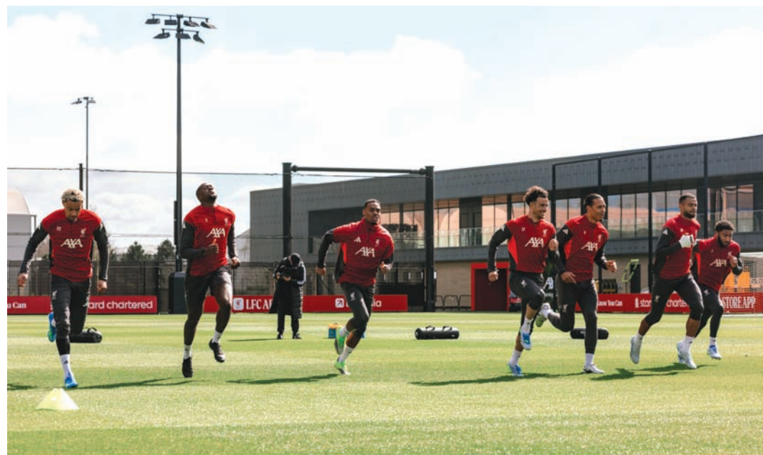
Liverpool players train on the eve of their FA Cup quarter-final against Manchester City.

Slot hailed the impact Salah has had on Liverpool during his nine