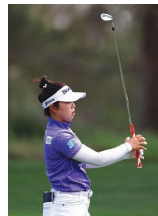
Miyu Yamashita of Japan plays a shot on the 14th hole during the Aramco Championship in Las Vegas.

Hataoka, a seven-time LPGA winner, also recovered from an early bogey, dropping a shot at the first but bouncing back im-