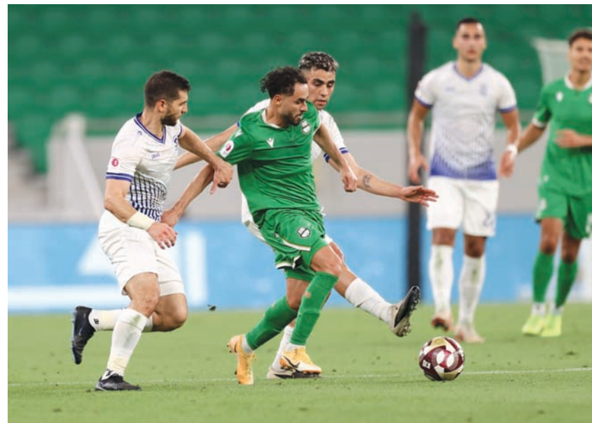
Al Sailiya rallied to snatch a thrilling 2-2 draw against Al Ahli at the Al Thumama Stadium.