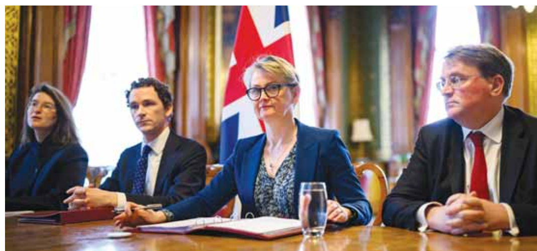
British Foreign Secretary Yvette Cooper prepares to speak during a virtual summit at the Foreign & Commonwealth Office in London, yesterday.

The US, China, and most Middle Eastern countries have not, according to a list provided by the UK government.