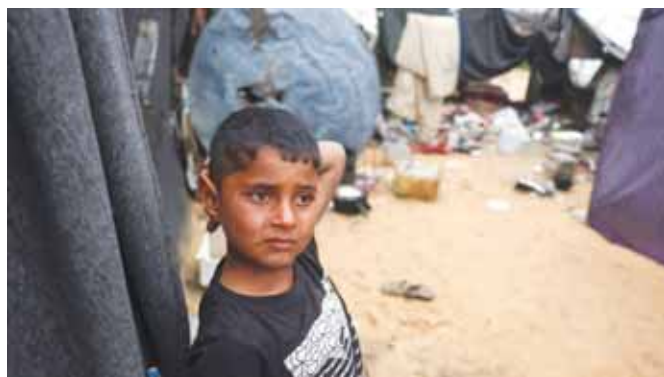
A boy stands at a makeshift camp for displaced Palestinians in the Nahr al-Bared area of Khan Yunis, in the southern Gaza Strip.