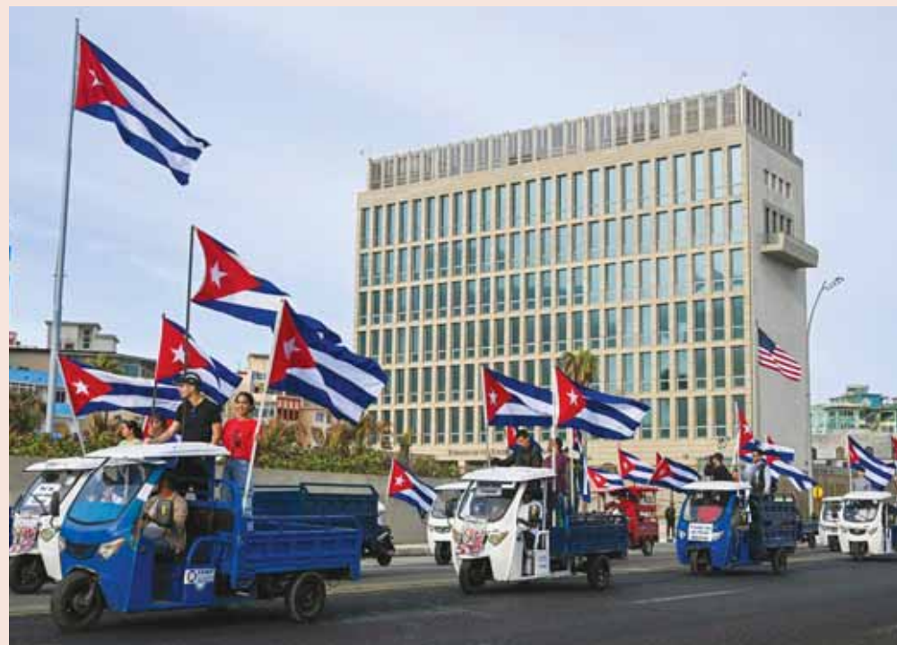
Hundreds of Cubans demonstrated in front of the US embassy in Havana yesterday, riding bicycles and electric vehicles as they waved flags and signs demanding an end to the decades-old trade embargo on the country. Cuban President Miguel Diaz-Canel greeted the crowd before the "anti-imperialist youth parade" set out across the capital's famed oceanfront Malecon.