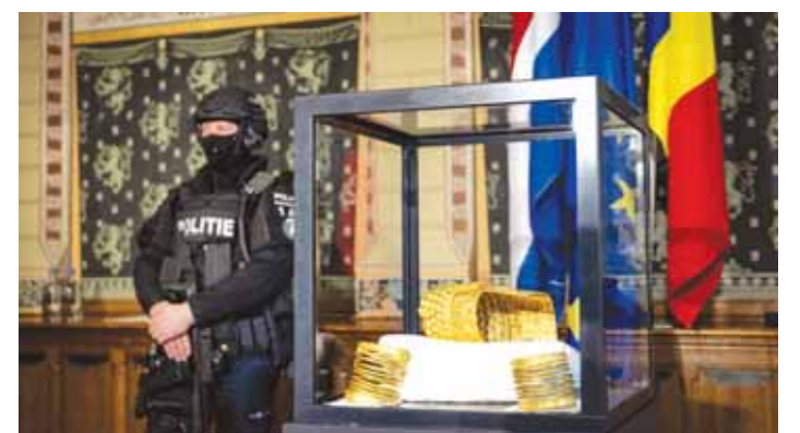
The recovered golden helmet of Cotofenesti and two gold bracelets that were stolen from the Drents Museum are displayed in a glass box in Assen yesterday.

The Dutch government last year paid 5.7mn euros ($6.6mn) to compensate Romania for the theft.