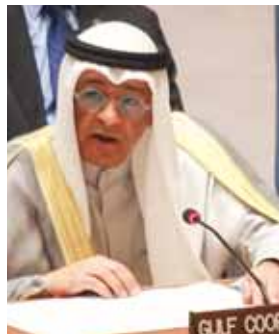
Jassim al-Budaiwi, Secretary-General of the Gulf Cooperation Council, during a briefing at the UN Security Council.

The secretary-general welcomed Security Council Resolution 2817, adopted on 11 March, which condemned the Iranian attacks and demanded their immediate cessation. He urged full implementation of the text to ensure accountability, warning that the