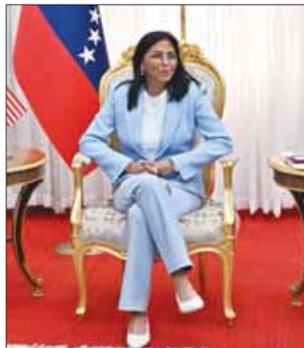
Venezuela's acting president Delcy Rodriguez meets with US Secretary of Energy Chris Wright (out of frame) at the Miraflores Presidential Palace in Caracas.

Rodriguez welcomed the decision, writing on X that it was part of the "normalisation and strengthening" of bilateral relations. "We trust that this progress will allow for the lifting of the sanctions currently in force against our country, and make it possible to build and guarantee an effective binational cooperation agenda for the benefit of our peoples," she added. Ties between Washington and