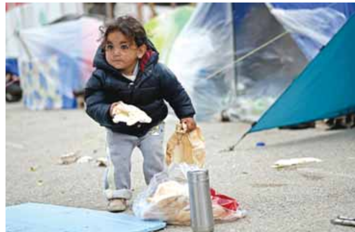
A displaced child holds a loaf of bread at an unofficial camp for displaced people on Beirut's waterfront area.

They include around 9,000 Lebanese Christians living in a cluster of border towns, who told Reuters