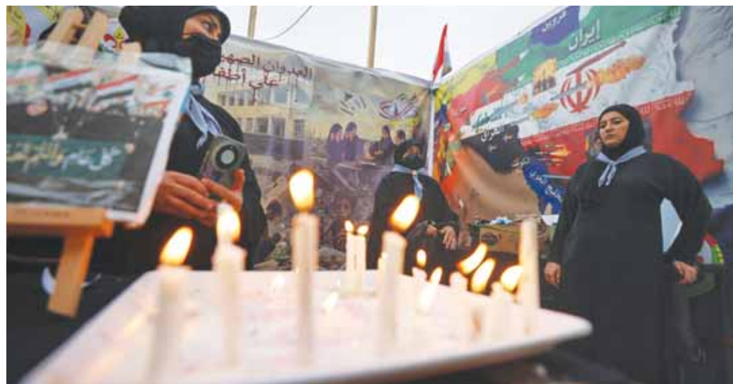
Women light candles in memory of the victims of the US-Israeli attacks on Iran and Lebanon during a rally yesterday in Baghdad's Tahrir Square.

Baghdad said they would "intensify co-operation" to prevent attacks and ensure Iraqi territory is not used to launch assaults against US facilities.