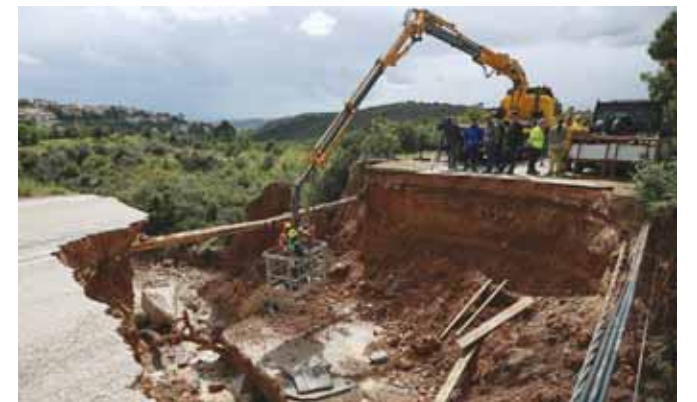
Emergency crews work at a road cut in two, after heavy rain and gale-force winds battered Greece, leaving flooded houses and the authorities rushing to repair damage, near Rafina, Greece, yesterday.