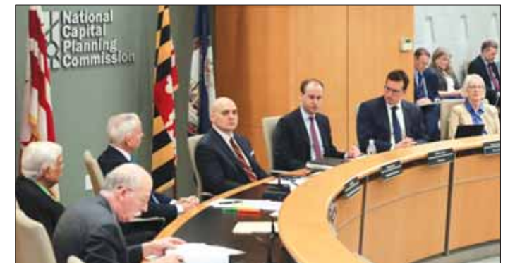
National Capital Planning Commission meeting to deliberate about the Trump White House East Wing ballroom project in Washington, yesterday.

Scharf, who was appointed by Trump, said that many of the negative comments the commission had received on the project dealt with issues beyond its scope,