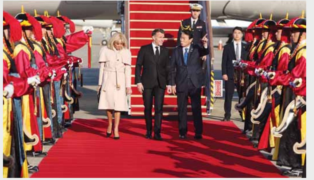
French President Emmanuel Macron (centre) and his wife Brigitte Macron (left) are welcomed upon their arrival at Seoul Air Base in Seongnam yesterday. Macron's two-day itinerary includes a summit with President Lee Jae Myung and a visit to a war memorial to pay tribute to French soldiers who fought in the Korean War, as well as an economic forum and a dinner with K-pop stars and South Korean cineastes.