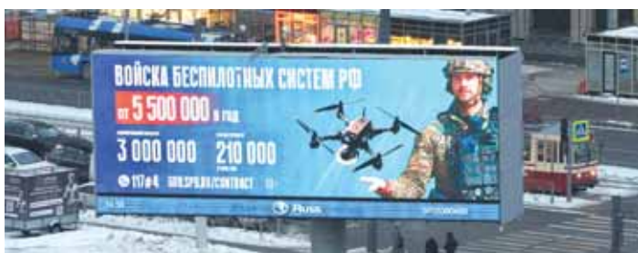
A digital screen displaying an ad promoting contract military service in the Russian army's unmanned systems forces, with payment details and contact information, in Saint Petersburg, Russia.

man of the Security Council, told state media last Friday that Russia's rolling recruitment system, which offers substantial financial packages to volunteers who sign up, continues to deliver. More than 400,000 people had signed up last year and over 80,000 so far this year, he said.