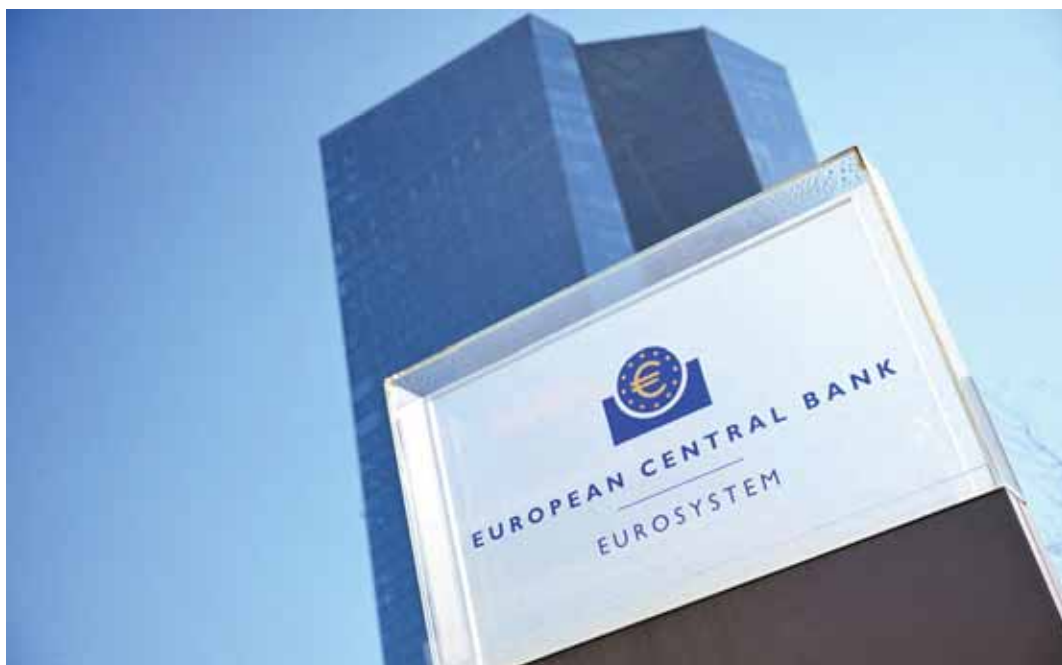
A view of the European Central Bank (ECB) headquarters in Frankfurt, Germany.

"Economics itself is not an exact science," ECB policymaker Primoz Dolenc said. "It's of course based on analytics but by definition there is also a perception and judgment element."