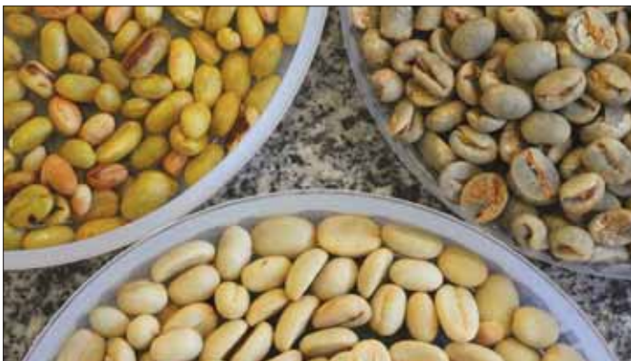
Different varieties of coffee are displayed at the Campinas Agronomy Institute during an interview with Brazilian researchers in Campinas, Brazil.

For example, liberica's hardiness in the face of hotter and drier conditions has drawn praise from farmers in Indonesia and Malaysia planting small plots of the species to see how they hold up against drought.