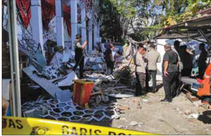
Police officers look at a building of the North Sumatra's National Sports Committee of Indonesia damaged following a severe 7.4-magnitude offshore quake in Manado, North Sulawesi, yesterday.

The Hawaii-based Pacific Tsunami Warning Center (PTWC) initially said hazardous tsunami waves were possible within 1,000km (621 miles) of the epicentre along the coasts of Indonesia, the Philippines and Malaysia.