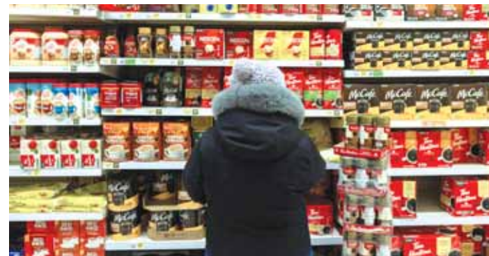
A shopper browses the coffee aisle at the Northern store in Cambridge Bay, Nunavut, Canada. Policymakers will only hike rates if they think a surge in energy costs induced by the Iran war will filter into other prices, lifting inflation expectations across the entire economy.

Policy-makers at the Bank of Canada acknowledged that global uncertainty meant they "would need to rely on judgment more heavily than usual" to plot the path of economy, according to