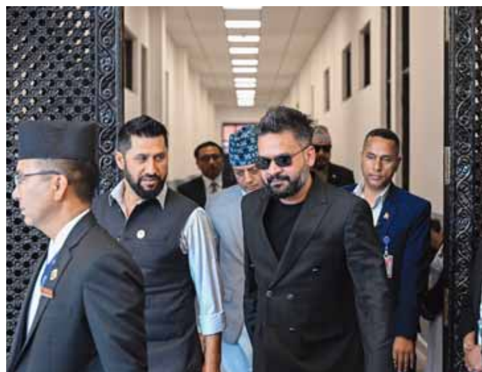
Nepal's Prime Minister Balendra Shah (second right) and Rastriya Swatantra Party President Rabi Lamichhane (second left) arrive to attend the parliament session in Kathmandu yesterday.