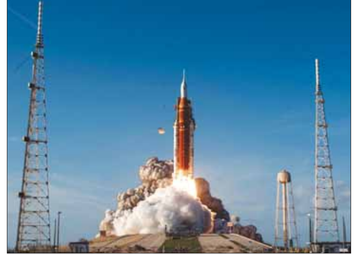
The Artemis II crewed lunar mission lifts off from Pad 39B at Kennedy Space Center in Cape Canaveral, Florida, on Wednesday.

The current era of American lunar investment has frequently been portrayed as an effort to compete with China, which aims