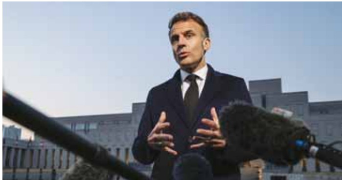
French President Emmanuel Macron speaks to the press during a visit at the War Memorial of Korea in Seoul yesterday.

The Strait of Hormuz, a vital shipping route for oil, has been virtually paralysed for weeks by the Middle East war, pushing up prices for crude and related products worldwide.