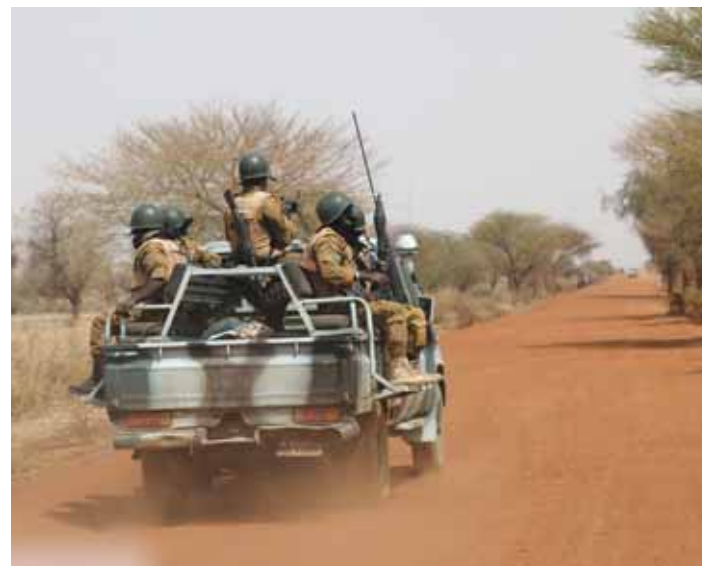
This picture taken in 2019 shows soldiers from Burkina Faso on the road in Gorgadji, in the Sahel region.

and JNIM's Sharia Committee in Burkina Faso did not respond to requests for comment from HRW.