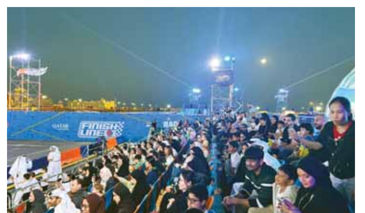
Spectators at Hot Wheels Speed City.