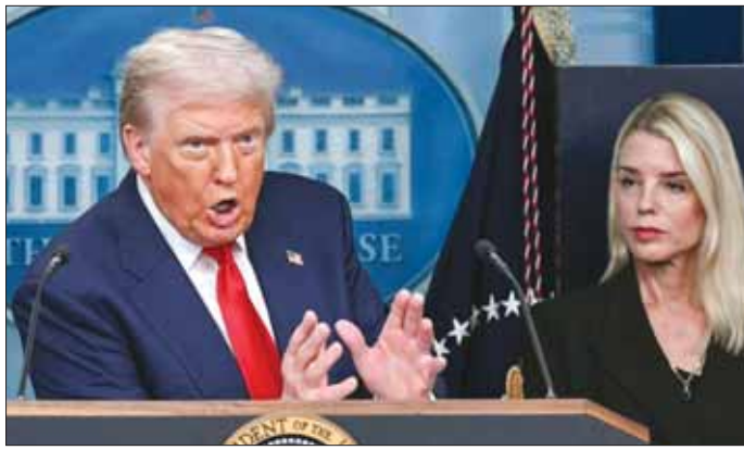
US President Donald Trump, alongside Attorney-General Pam Bondi (right), speaks during a news conference.

Bondi has been a staunch ally of the president but has drawn fire from some Trump supporters for