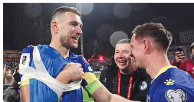
Bosnia's captain Edin Dzeko (left) celebrates after his side beat Italy to qualify for the FIFA World Cup 2026 in Zenica, Bosnia.

Home fans must have feared the worst when Bosnia's all-time top scorer made his way to the centre circle for the coin toss holding an ice pack on his shoulder, and in the end the striker left the pre-shootout formalities to a teammate.