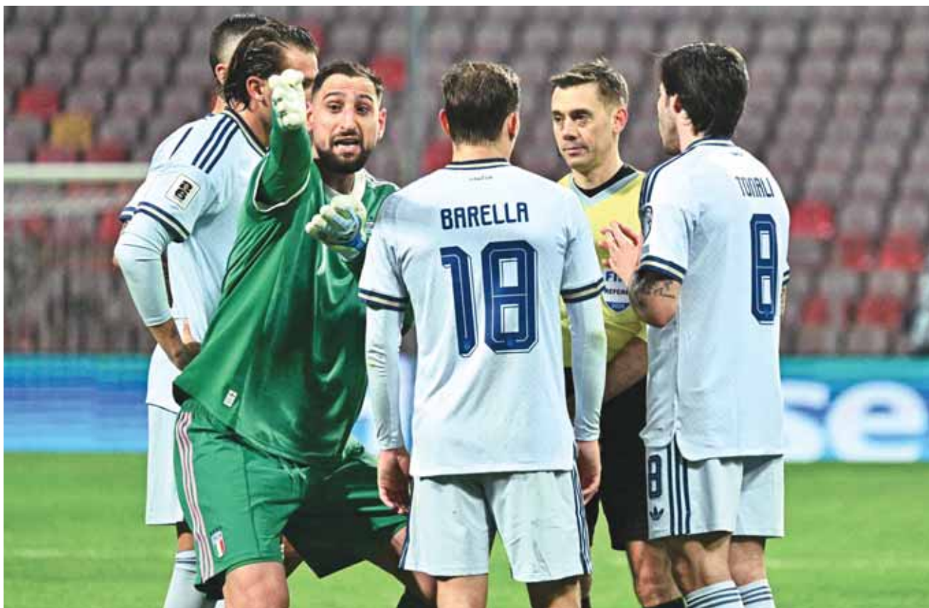
Italy's goalkeeper Gianluigi Donnarumma (left) argues with the referee after defender Alessandro Bastoni received a red card during the FIFA World Cup 2026 European qualification play-off final against Bosnia-Herzegovina in Zenica.

The 20th anniversary of Italy's last World Cup win falls on July 9, during this summer's finals in the United States, Canada