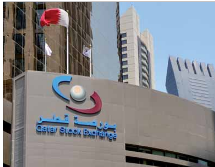
More than 98% of the traded constituents were in the red as the 20-stock Qatar Index plunged 4.29% to 10,581.03 points yesterday

The transport sector index dipped 6.25%, insurance (5.36%), banks and financial services (4.46%), consumer goods and services (3.67%), real estate (3.48%), indus-