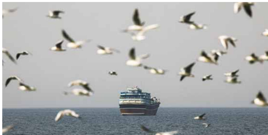
Birds fly near a boat in the Strait of Hormuz amid the US-Israeli conflict with Iran on Monday. Tanker traffic through the strait has dwindled, with vessels pooling on either side of the corridor.

A venture that's taken a dominant position in the global market for oil supertankers is asking for sky-high charter fees to deliver Middle East crude as the Iran war sends rates spiraling upward. South Korea's Sinokor is asking the equivalent of about $20 a barrel to transport oil from the region to China on very large crude carriers, according to shipbrokers. That compares with an average of about $2.50 last year. A smaller ship, controlled by Greece's Dynamac Tankers Management, was provisionally leased out at about double Friday's rate. Tanker traffic through the Strait of Hormuz has dwindled, with vessels pooling on either side of the corridor. Alongside a jump in oil prices, runaway freight is one of the most tangible market responses to a conflict that began on Saturday and culminated with the vital Strait of Hormuz chokepoint all-but closing to tanker traffic. Traders are now watching what comes next at the waterway, which handles about a fifth of the world's oil.