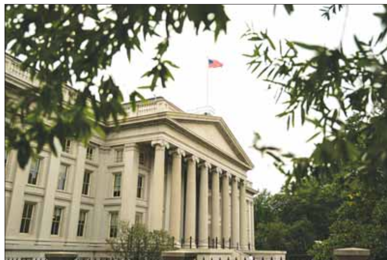
The US Treasury building in Washington, DC. US Treasuries fell as conflict in the Middle East sent oil prices soaring, stoking fear inflation will accelerate and forcing traders to scale back wagers on the likely scope of interest-rate cuts.

European government bonds also fell on Monday and market gauges of