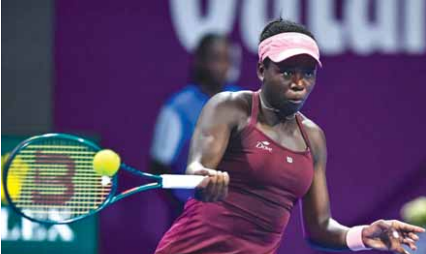
Tenth seed Victoria Mboko outmuscled Australian Open champion Elena Rybakina 7-5, 4-6, 6-4 at the Qatar Open.

The 30-year-old Greek won her first three career meetings with the young Swiatek but the last of those victories came in 2021. The Pole had won their last four matches, the most recent in straight sets in Qatar last year. "Last year in the second round here against her, I was not confident, I was not believing in myself and this year it's different. I feel a lot better," said Sakkari who will now face either 14th seeded Czech Karolina Muchova or