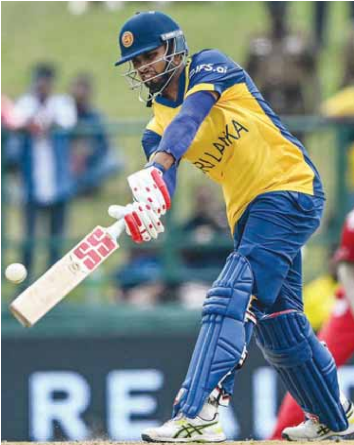
Sri Lanka's captain Dasun Shanaka plays a shot during the World Cup group stage match against Oman at the Pallekele International Cricket Stadium in Kandy yesterday.