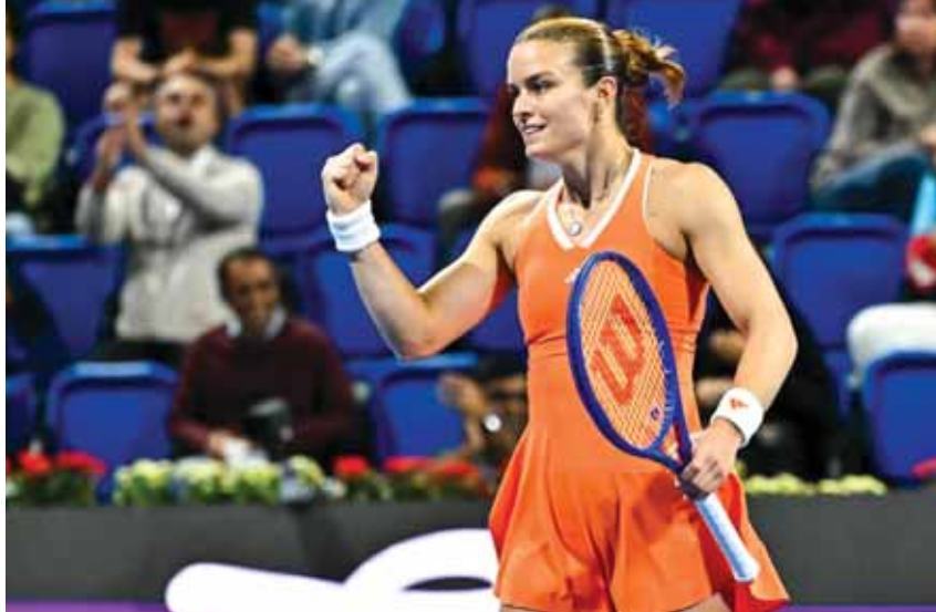
Maria Sakkari clawed her way to a nervy 2-6, 6-4, 7-5 victory over Iga Swiatek.

two-and-a-half hours and was followed by an equally gripping contest as Mboko underlined her growing reputation in a contest that was just six minutes shorter. Mboko, who had already defeated Rybakina in last year's Montreal semifinals, managed to break the Kazakh's serve three times in the opening set alone.