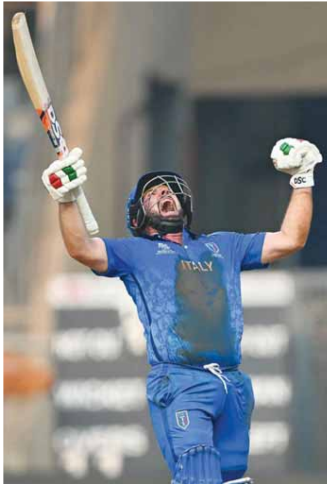
Italy's Anthony Mosca celebrates after winning the World Cup group stage match against Nepal at the Wankhede Stadium in Mumbai yesterday.

BRIEF SCORES: Italy 124 for 0 (A Mosca 62*, J Mosca 60*) beat Nepal 123 (Kalugamage 3-18) by 10 wickets.