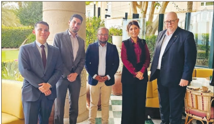
SilTest officials and partners in Doha after launch its operations in Qatar