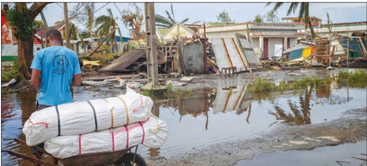
A resident leans on a cart near destroyed structures in the city of Toamasina, on the east coast of Madagascar, struck by Tropical Cyclone Gezani.

A cyclone packing violent winds has killed at least 31 people in Madagascar’s second-largest city, ripping roofs off buildings, causing flooding and felling trees, the Indian Ocean island’s disaster authority said yesterday, releasing an updated toll. Cyclone Gezani made landfall on Tuesday, slamming into the country’s second city Toamasina, with winds reaching 250 kilometres per hour. The National Office for Risk and Disaster Management (BNRGC) late yesterday said it had recorded 31 deaths, many after houses had collapsed. Four people remained missing and at least 36 were seriously injured, it said, with over 250,000 people affected. “What happened is a disaster: nearly 75% of the city of Toamasina was destroyed,” said Madagascar’s new leader, Colonel Michael Randrianirina, who had travelled to Toamasina ahead of the cyclone’s landfall to support residents. “The current situation exceeds