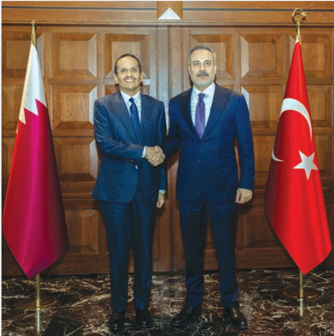
HE the Prime Minister and Minister of Foreign Affairs Sheikh Mohammed bin Abdulrahman bin Jassim al-Thani met yesterday in Ankara with Minister of Foreign Affairs of Türkiye Hakan Fidan. During the meeting, they discussed co-operation relations between the two countries and ways to support and enhance them, and the latest developments in the region, in addition to a number of topics of mutual interest. Both sides also stressed the importance of intensifying regional and international efforts to de-escalate tension in the region through dialogue and peaceful means, in order to consolidate regional security. (QNA)