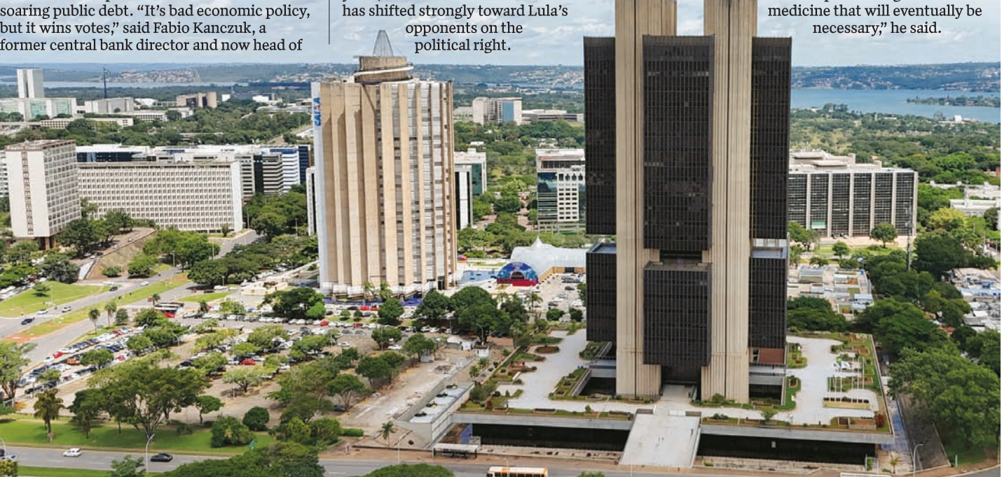
A drone view shows the Central Bank headquarters building in Brasilia. Unemployment is at a record low, the median wage is at a record high and inflation — especially for food — has cooled enough that interest rates are set to start falling next month.

"In elections, there is generally a tendency to avoid prescribing bitter medicine that will eventually be necessary," he said.