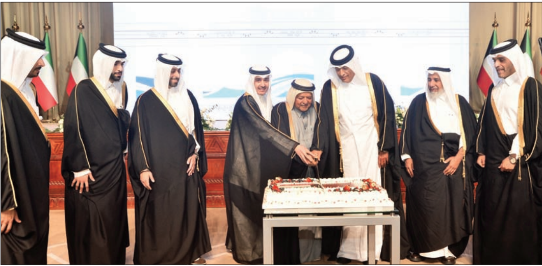
Qatari and Kuwaiti dignitaries lead the cake-cutting ceremony to mark the National Day of Kuwait yesterday.