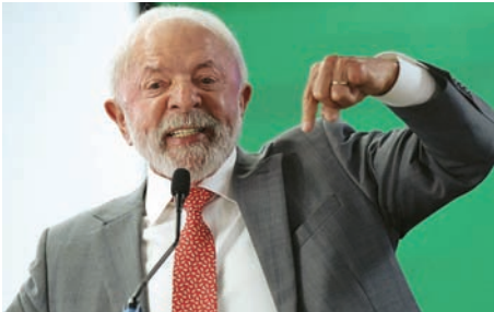
Brazil's President Luiz Inacio Lula da Silva speaks during a ceremony to launch a digital platform for tax reform in Brasilia, Brazil.