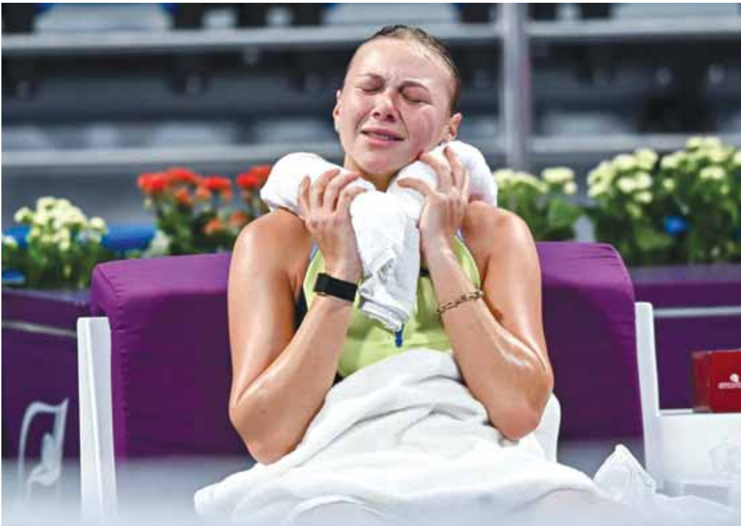
Amanda Anisimova grimaces in pain during Qatar Open match against Karolina Pliskova in Doha yesterday.

"I missed you guys as well, last year. As you know, I won here, so I have great memories. Two years ago, I played the semi-finals. So I just enjoy this place so much. And