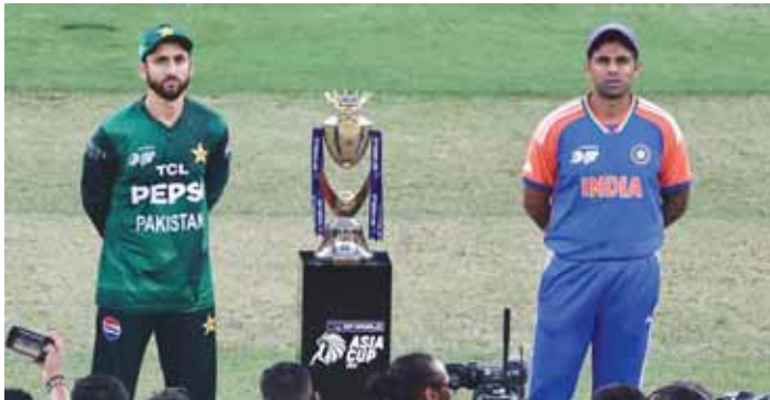
Pakistan captain Salman Agha and Indian counterpart Suryakumar Yadav pose with the Asia Cup trophy on September 28, 2025, in Dubai.

Pakistan, who are scheduled to play all their matches in Sri Lanka, would have forfeited two points if they had withdrawn from the match and also dealt a serious blow to the tournament since an India-Pakistan clash remains cricket's greatest blockbuster. Indian captain Suryakumar Yadav said last week that his team would travel to Colombo as planned, regardless of Pakistan's decision on the fixture. New Delhi's ties with both Islamabad and Dhaka have deteriorated in recent months, with political