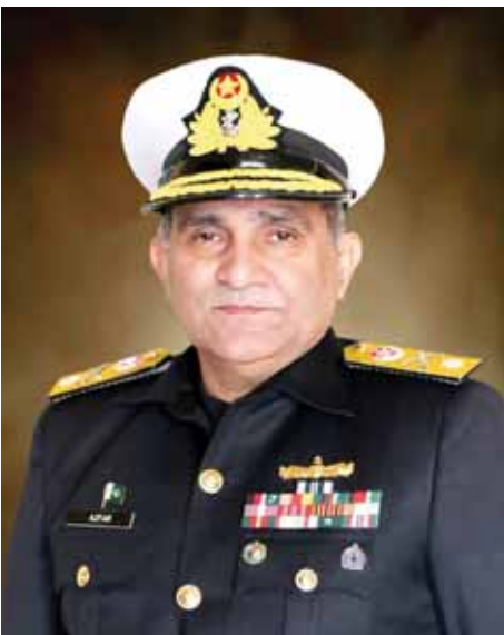
Author: Commodore Azfar Humayun

The book delivers a winning formula. It is robust and engaging, composed of episodes drawn from the author’s life and career, narrated with clarity, restraint, and quiet determination.