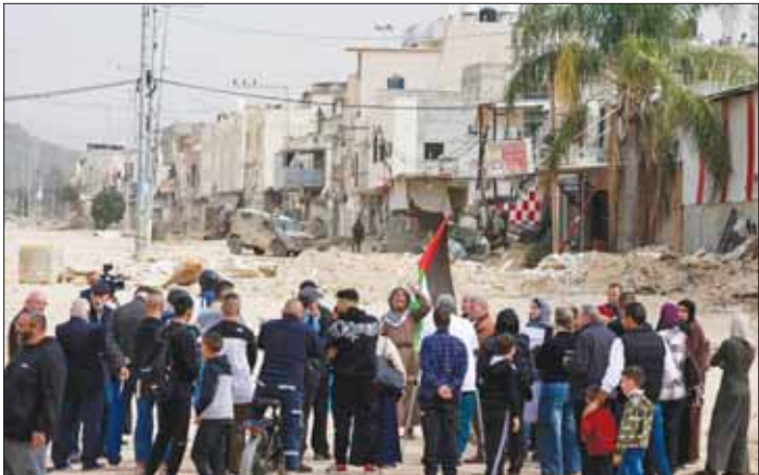
Palestinians protest after Israeli soldiers blocked the entrance of the Nur Shams Palestinian refugee camp in the occupied West Bank, yesterday, demanding to be allowed to return to their homes from where they were expelled last year during an ongoing Israeli army operation.

The security cabinet decided to repeal a law dating from Jordan's control of the West Bank before 1967 to make land registries public rather than confidential, and to remove a requirement for a permit from a civil administration office. They said these moves would make it easier for Jews to purchase land in the West Bank. Hagit Ofra from the Israeli settlement watchdog group Peace Now said the decision was barred by international law and represented a step towards annexation of the West Bank. "The decision to allow every Israeli the right to buy land in the West Bank without government approval, without inspection, is also another way of saying it's normal life. It's not occupied territories, it's like part of Israel," she said. Annexation is opposed by US President Donald Trump, who last year said he would not allow Israel to carry out such a step. "It's not going to happen,"