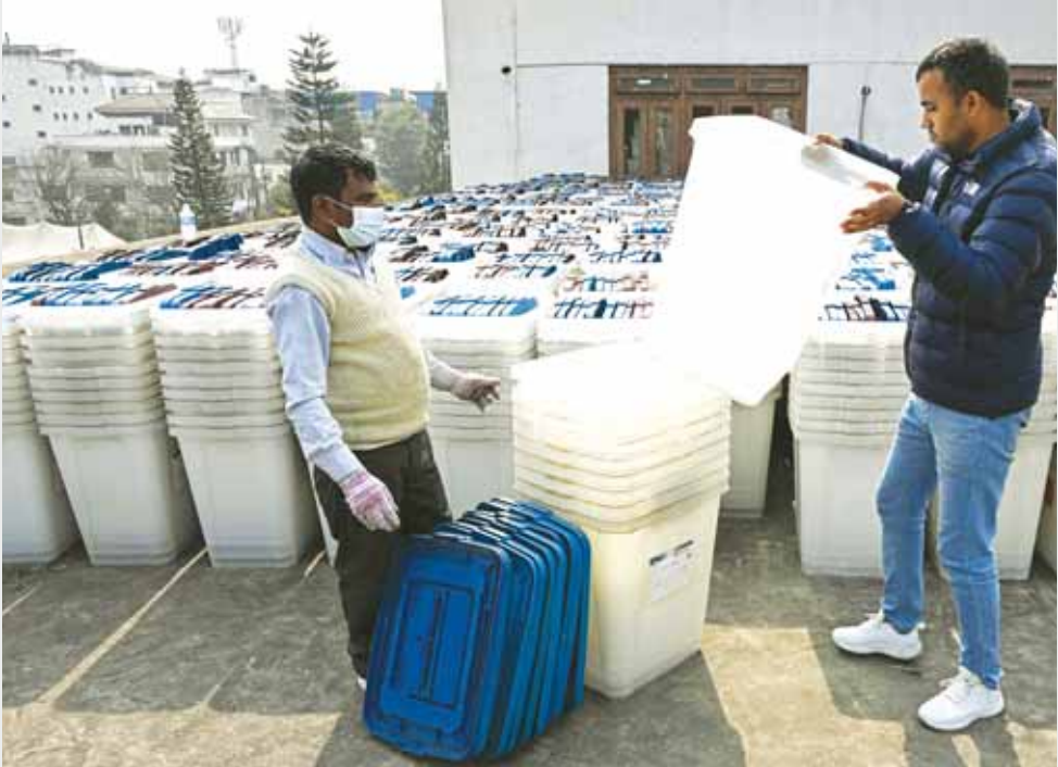
Election officials inspect ballot boxes before they are dispatched from the Election Commission office in Kathmandu yesterday ahead of Nepal's general elections.

India plans to maintain multiple sources of energy supply and diversify them when needed as New Delhi looks to ensure consumers receive "adequate energy at the right price through reliable and secure supplies", Indian Foreign Secretary Vikram Misri said yesterday. Misri was responding to a question seeking clarity on India's position on the purchase of Russian oil after US President Donald Trump said New Delhi had "committed to stop directly or indirectly" importing it. India's priority is to safeguard the interests of its consumers through an energy policy driven by adequate availability, fair pricing, and reliability of supply, Misri said. India is neither dependent on any single source for crude oil nor does it "intend to be", importing from a "mix of sources" depending on "objective market conditions", he said, adding "national interests" guide both the government and energy companies. - Reuters