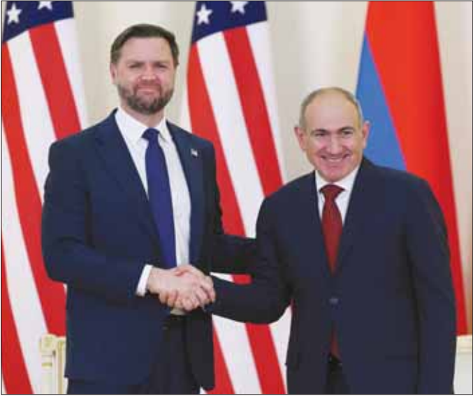
US Vice-President JD Vance and Armenia’s Prime Minister Nikol Pashinyan shake hands, as they attend a joint press conference, in Yerevan, Armenia, yesterday.

Pashinyan called the visit “truly historic” and said he had “great hope” that President Donald Trump would “rightfully” receive the Nobel Peace Prize for mediating the Armenian-Azerbaijani peace process.