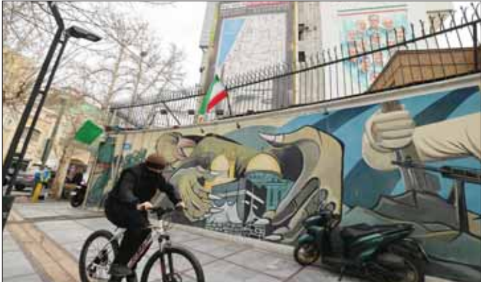
A man cycles past a mural and a giant billboard in Palestine Square, in Tehran, yesterday.

Iran could agree to dilute its most highly enriched uranium in exchange for the UN nuclear sanctions being lifted, its atomic chief said yesterday, one of the most direct indications so far of its position at talks with Washington. US and Iranian diplomats held talks through Omani mediators in Oman last week in an effort to revive diplomacy, after US President Donald Trump positioned a naval flotilla in the region raising fears of new military action. The talks follow a crackdown on anti-government demonstrations in Iran last month when thousands of people were killed, the biggest domestic unrest since the 1979 Revolution. Trump joined an Israeli bombing campaign last year and hit Iranian nuclear sites. He also threatened last month to intervene militarily during the protests but ultimately held off. Washington has demanded Iran relinquish its stockpile — estimated last year by the UN nuclear agency at more than 440kg — of uranium enriched to up to 60% fissile purity, a small step away from the 90% that is considered weapons grade. The head of Iran's Atomic Energy Organisation, Mohammad