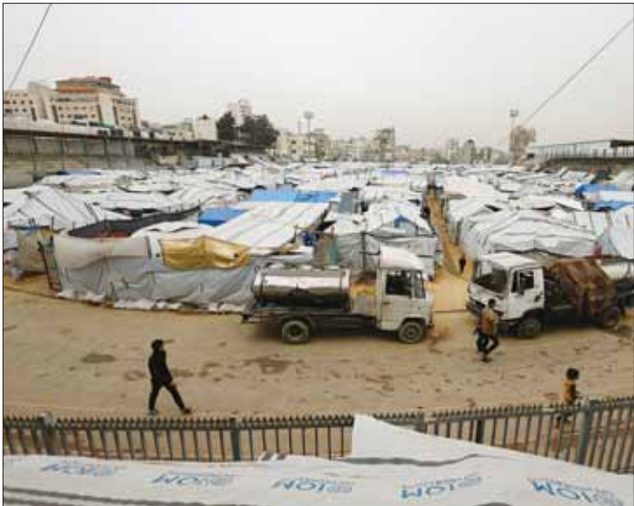
Palestinians displaced during the two-year Israeli offensive, shelter at a tent camp in Gaza City, yesterday.

Israeli forces killed four fighters in Rafah in the southern Gaza Strip yesterday after they emerged from an underground tunnel and opened fire on troops, Israel's military said. It described the attack on Israeli troops as a violation of the US-brokered ceasefire with the Palestinian Hamas group that went into force in Gaza last October and said it views it with the "utmost gravity." Israel has responded to similar incidents in recent months by carrying out air strikes across the enclave in which dozens of people have been killed. There was no immediate comment from Hamas, but some sources close to the group identified one of those killed as Anas Annashar, the son of a former senior Hamas politician. Dozens of Hamas fighters have been trapped in tunnels under Rafah since the ceasefire, and some have since been killed in clashes with Israeli forces. In a separate incident, Israeli forces shot and killed a Palestinian farmer in Deir Al-Balah in the central Gaza Strip, according to local health authorities. Israel did not immediately comment on the incident.