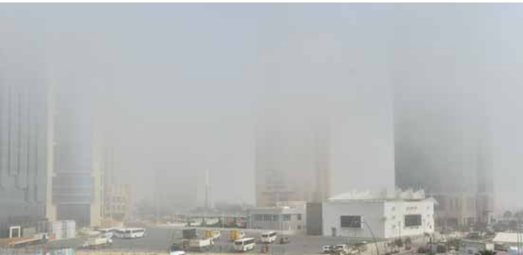
West Bay blanketed by fog.