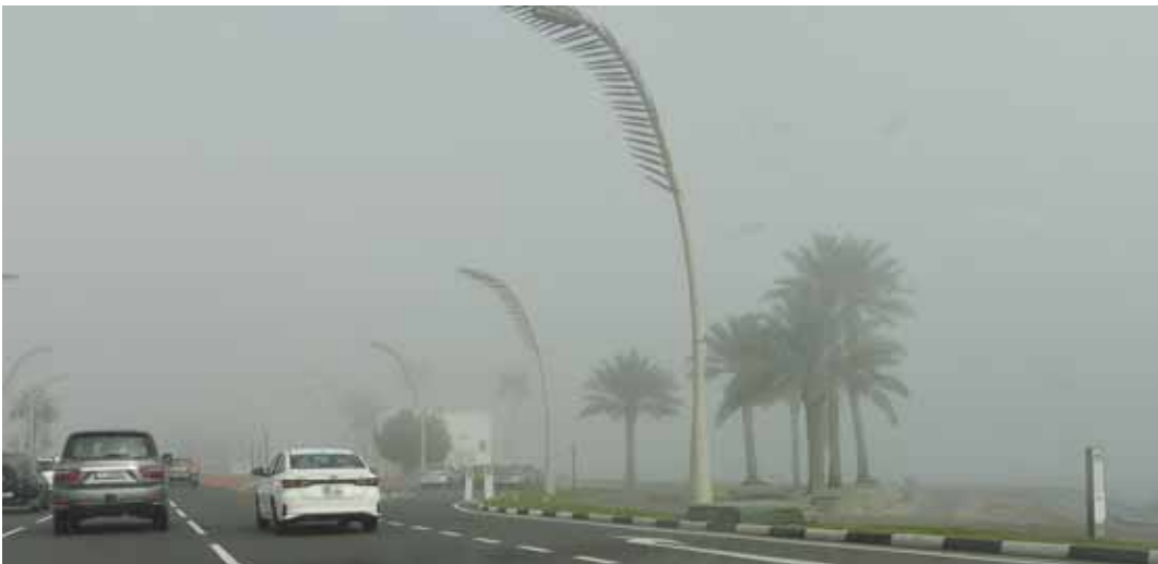
A view of fog-enveloped Corniche yesterday morning.