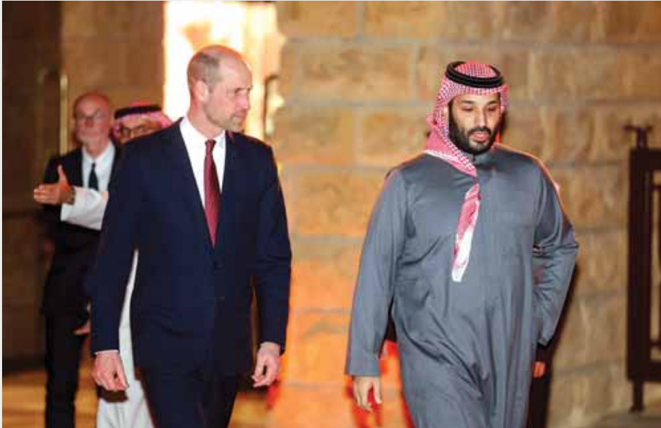
Britain's Prince William, Prince of Wales, takes part in a tour with the Crown Prince of Saudi Arabia, Mohammed bin Salman al-Saud, on day one of his first official visit to Saudi Arabia at the Unesco World Heritage site At-Turaif, in Riyadh, Saudi Arabia, yesterday.

With McSweeney's departure on Sunday, Starmer had hoped to reset the narrative and attempt to return to an agenda he has so far failed to keep any focus on - tackling the cost-of-living crisis and boosting the British economy.