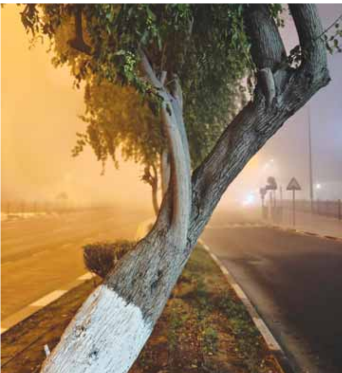
A view of the Old Airport area.

While fog of this nature is a familiar winter occurrence in Qatar, the spectacle never fails to transform the capital's rhythm – slowing commutes, softening the city's edges, and offering a fleeting glimpse of natural wonder amid the morning quiet.