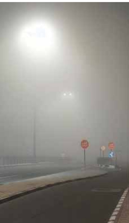
D-Ring Road late Sunday night.