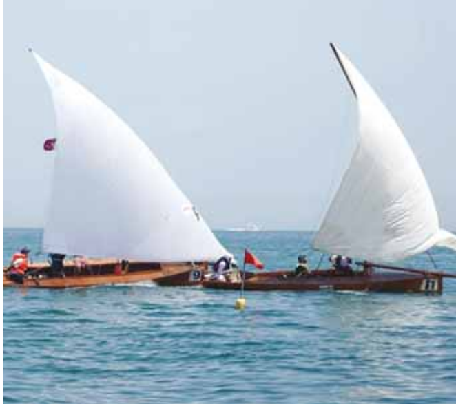
The 8th Al Dasha Marine Sports Festival kicks off today at Katara Beach

This is particularly evident given the participation of numerous marine companies, as well as factories specialising in marine equipment and boat manufacturing, making it the most comprehensive sporting gathering of its kind in Qatar. – QNA