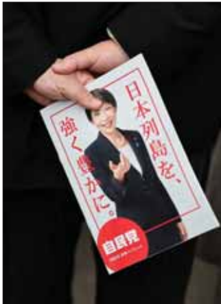
A person holds a booklet bearing a picture of Sanae Takaichi.

The arch-conservative Takaichi, a heavy metal drummer in her youth and an admirer of Margaret Thatcher, became Japan's fifth premier in as many years in October. This followed a string of calamitous elections for the once-mighty Liberal Democratic Party (LDP), leaving it short of a majority in both houses of parliament. With ordinary Japanese, especially younger ones, Takaichi has enjoyed sky-high popularity ratings, becoming something of a fashion icon and a hit on social media. Her tough talk on immigration appears, for now, to have slowed the sharp rise of the populist “Japanese first” Sanseito party, which did well in upper house elections last year. Immigration screening “has already become a little stricter, so that terrorists, and also industrial spies, cannot