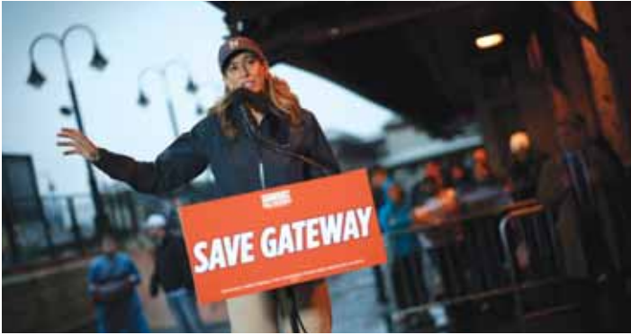
This picture taken on October 30 last year shows US Representative Mikie Sherrill, Democratic nominee for New Jersey governor, campaigning in support of the Gateway Tunnel Project at the Westfield NJ Transit Train Station in Westfield, New Jersey.