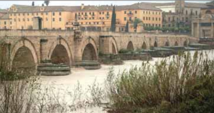
The rising Guadalquivir River flows beneath the Roman Bridge in Cordoba, Spain, yesterday.