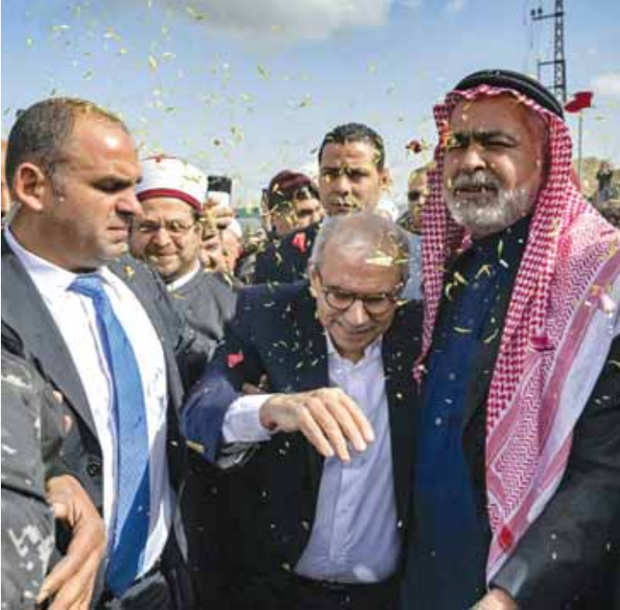
This handout picture released by the Lebanese Government Press Office shows Prime Minister Salam being showered with confetti as he is received by locals during a tour in the heavily-damaged southern village of Dhayra, near the border with Israel. - AFP

delegation of accompanying officials in nearby Dhayra, some waving Lebanese flags. In a meeting in Bint Jbeil, further east, with officials including lawmakers from Hezbollah and its ally the Amal movement, Salam said that authorities would "rehabilitate 32km of roads, reconnect the severed communications network, repair water infrastructure" and power lines in the district. Last year, the World Bank announced it had approved $250mn to support Lebanon's post-war reconstruction, after estimating that it would cost around $11bn in total. Salam said funds including from the World Bank would be used for the reconstruction and rehabilitation projects. The second phase of the government's disarmament plan for Hezbollah concerns the area between the Litani and the Awali rivers, around 40km south of Beirut. Israel, which accuses Hezbollah of rearming, has criticised the army's progress as insufficient, while Hezbollah has rejected calls to surrender its weapons. Despite the truce, Israel has kept up regular strikes on what it usually says are Hezbollah targets and maintains troops in five south Lebanon areas. Lebanese officials have accused Israel of seeking to prevent reconstruction in the heavily