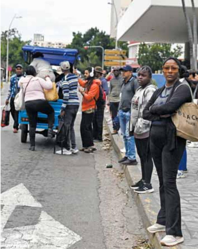
People wait for transportation in Havana as Cubans brace for fuel scarcity measures after the US tightened the oil supply blockade.

The Cuban government has announced emergency measures to address a crippling energy crisis worsened by US sanctions, including the adoption of a four-day work week for state-owned companies and fuel sale restrictions. Deputy Prime Minister Oscar Perez-Oliva Fraga blamed Washington for the crisis, telling Cuban television that the government would "implement a series of decisions, first and foremost to guarantee the vitality of our country and essential services, without giving up on development". "Fuel will be used to protect essential services for the population and indispensable economic activities," he said. "This is an opportunity and a challenge that we have no doubt we will overcome," Perez-Oliva said. "We are not going to collapse." Among the new measures are the reduction of the working week in state-owned companies to four days, from Monday to Thursday; restrictions on fuel sales; a reduction in bus and train services between provinces; and the closure of certain tourist establishments. School days will also be made shorter and universities will reduce the requirement of in-person attendance. These measures are intended