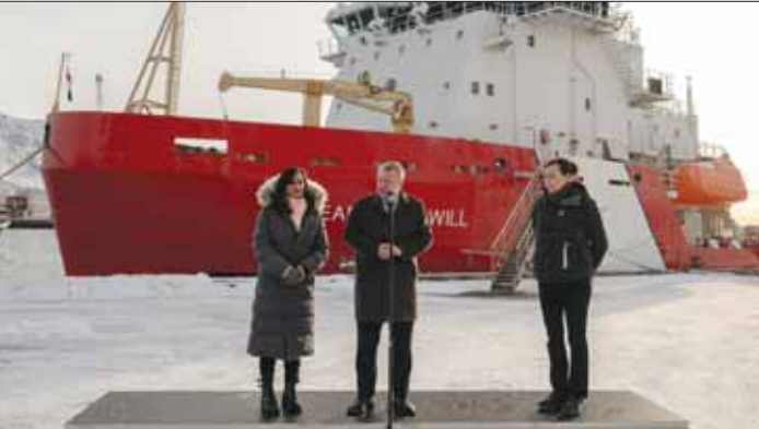
Canadian Foreign Affairs Minister Anita Anand (left), Danish Foreign Affairs Minister Lars Lokke Rasmussen (centre), and Greenlandic Foreign Affairs Minister Vivian Motzfeldt stand in front of a Canadian icebreaker during a joint press conference in Nuuk, Greenland, yesterday.

A US-Denmark-Greenland working group has been established to discuss Washington's security concerns in the Arctic, but details have not been made public. Greenland's foreign minister Vivian Motzfeldt, who spoke alongside Lokke Rasmussen, welcomed that the parties were now in "direct dialogue," and added that the talks were respectful. "But we are not where we want to be yet," she stressed and said it was "too early" to say where the talks would lead. While Denmark and Greenland have said they share Trump's security concerns, they have insisted that sovereignty and territorial integrity are a "red line" in the discussions. Asked about whether this red line was being respected in the talks, the Danish foreign minister said he would "not go into details" about the ongoing discussions, but said they believed this red line had been made "crystal clear" going into the talks. "So I take it as a clear sign that it should be doable to find a solution while at the same time respecting these red lines," Lokke Rasmussen said, noting that the talks had begun with this precondition stated.