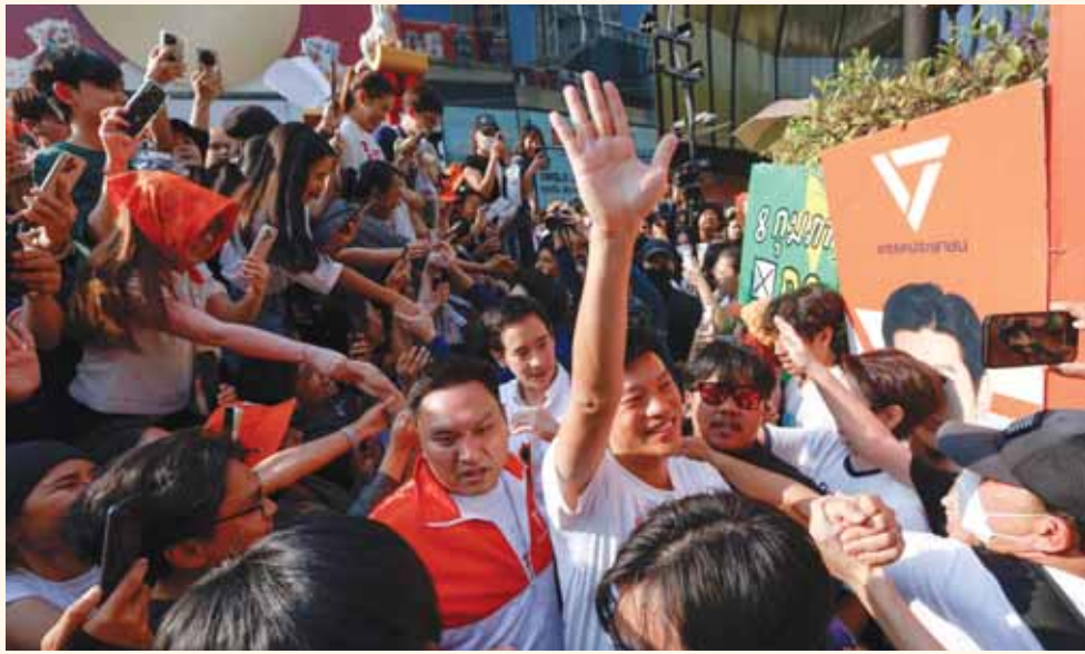
Natthaphong Ruengpanyawut, People's Party leader and prime ministerial candidate, meets with supporters during a rally event ahead of the February 8 election in Bangkok, Thailand.