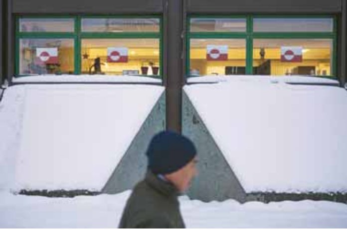
A man walks past a building with Greenland flags hanging in the windows in downtown Nuuk, Greenland.