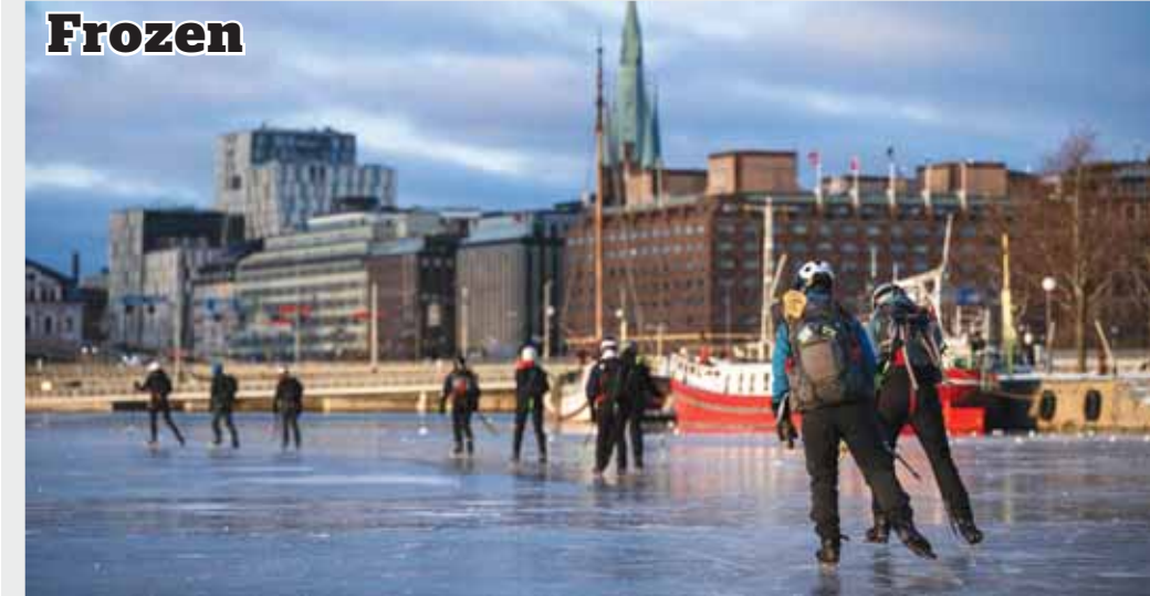
A group of people ice skate on frozen water in central Stockholm, Sweden, yesterday, as cold temperatures grip the capital. Stockholm has not been above 0°C so far in February 2026.