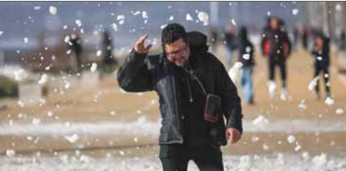
A person strolls at the seashore as waves' foam flies around in Costa da Caparica, Portugal, yesterday.