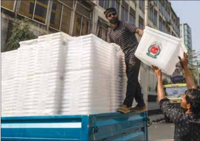
Bangladeshi workers load empty ballot boxes onto a truck at the Election Commission building in Dhaka.

is contesting 292 of them, with allies vying for the rest. Rahman declined to give a number but said “we are confident that we'll have enough to form a government.” All opinion polls have forecast a BNP victory but also a stiff challenge from the Jamaat alliance, which includes a Gen Z party that emerged from the anti-Hasina protests. New Delhi's decision to shelter Hasina, whom a Dhaka court last year sentenced to death for her role in a deadly crackdown on the protests, has badly strained Bangladesh-India relations while giving China an opening to expand its investments and political outreach. Asked whether he would pivot away from India toward