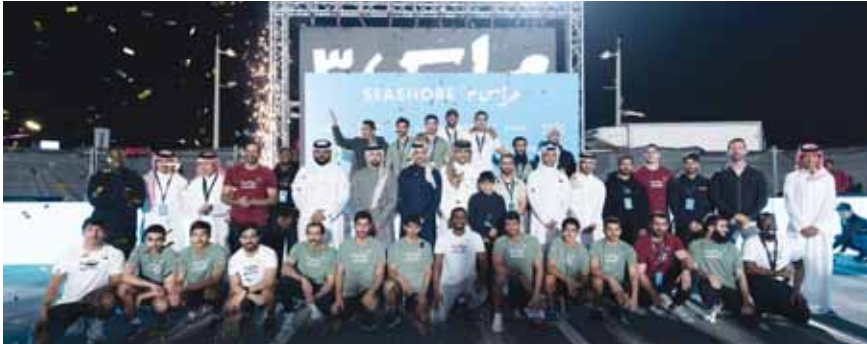
Competitors demonstrated high levels of skill in exercises, such as push-ups, pull-ups, squats, muscle-ups, in addition to the 40kg dips exercise, which combines strength with precision performance.

A total of 43 Qataris competed for the championship titles in both categories.