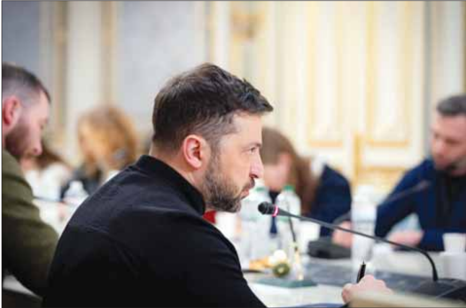
Ukraine's President Volodymyr Zelensky chairs a meeting with journalists at his office in Kyiv, amid the Russian invasion of Ukraine.

creation of a free economic zone, we will need fair and reliable rules," Zelensky said. The two sides have also failed to reach a "common understanding" on the issue of control over the Russian-occupied Zaporizhzhia nuclear power plant, Zelensky said. Russian forces seized the plant, the largest in Europe, at the start of the conflict and have held onto it since. Ukraine will not tolerate Russia and the United States making deals about Ukraine behind its back, Zelensky added. Throughout the negotiating progress Russia has launched waves of deadly strikes on Ukraine that have cut heating and power to millions during freezing temperatures. Russian attacks earlier Saturday forced Ukraine's three operating nuclear power plants to throttle their generation capacity,