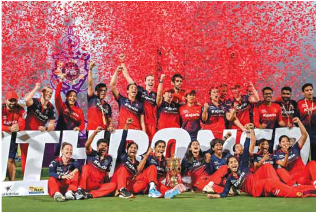
Royal Challengers Bengaluru’s players celebrate with the trophy after winning the Women’s Premier League final against Delhi Capitals at the Kotambi Stadium in Vadodara yesterday.