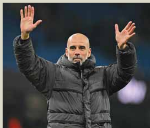
Manchester City's manager Pep Guardiola reacts after the League Cup semi-final second leg match against Newcastle United in Manchester.

“That first half we weren't good enough individually and our duels were off and it gave us huge problems.”