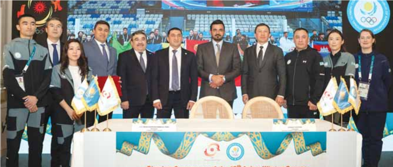
The signing ceremony was attended by HE Sheikh Joaan bin Hamad al-Thani, President of the Olympic Council of Asia, along with members of the International Olympic Committee and representatives of the National Olympic Committee of Kazakhstan in Milan yesterday, on the sidelines of the 2026 Winter Olympics.