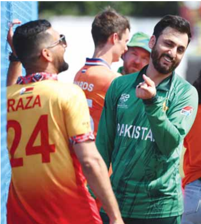
Pakistan captain Salman Agha shares a light moment with Zimbabwe's Sikandar Raza on the eve of the T20 World Cup in Colombo yesterday.

The government in Islamabad cleared the national team to take part but ordered them not to