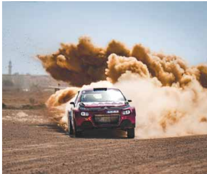
QMMF driver Mohammed al-Marri gets to grips with a Rally2 car in competition for the first time.

Today's action features two loops of three gravel stages. The morning's itinerary features runs through the brand new Lejthaya (16.54km) and Waab Al Mashrab (16.11km) stages and Al Waab (18.14km). The opening speed