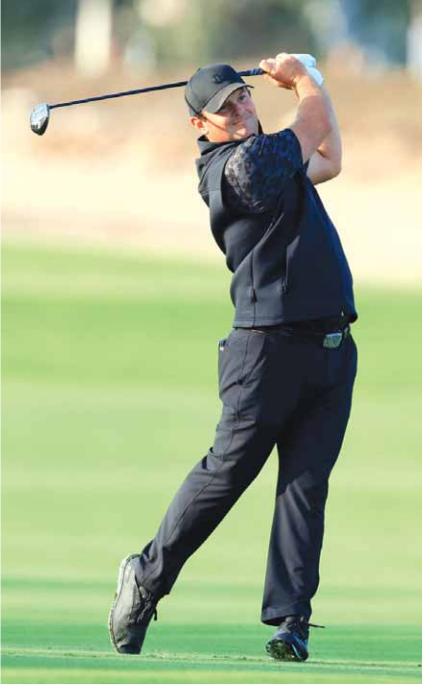
Patrick Reed of the US plays a shot during the first round of the Qatar Masters at Doha Golf Club yesterday.

American made flying start with three consecutive birdies and did not record his first par until sixth hole