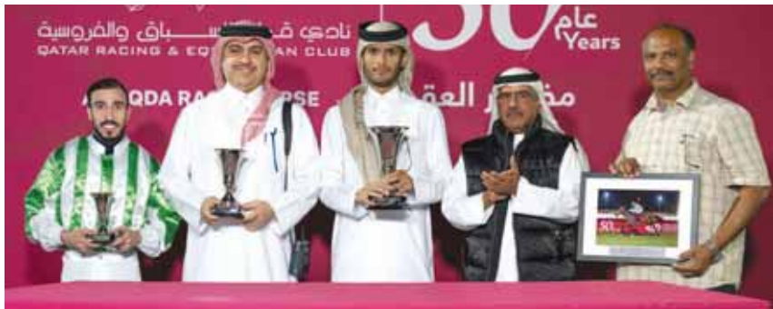
Connections of Silca Blue celebrate after the colt won the Al Markhiya Cup.