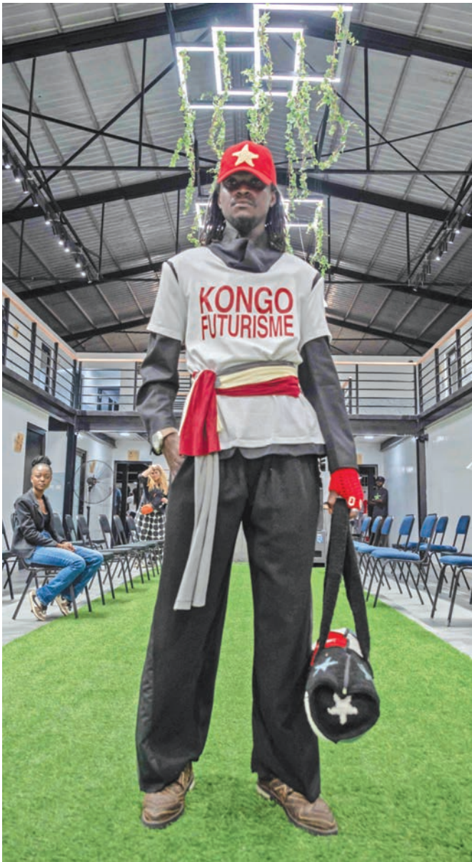
A model presents a creation on the catwalk during a dress rehearsal ahead of a fashion show at the Regional Fashion Institute in Africa (IRMA) in Kinshasa.

translating from French as the Society of Ambiance Makers and Elegant People. The subculture traces its origins to the colonial era when lo-