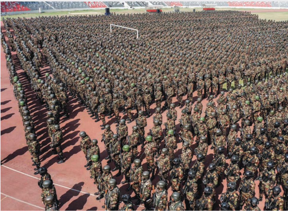
Bangladesh army personnel gather at the National Stadium in Dhaka yesterday, as they prepare for the upcoming country's general election on February 12.