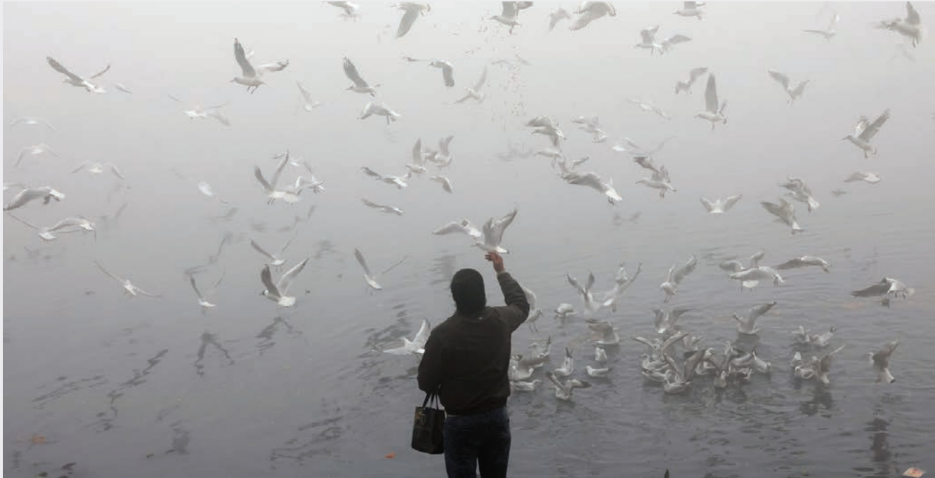
A man feeds birds on the banks of the Yamuna River on a foggy morning in New Delhi, India.