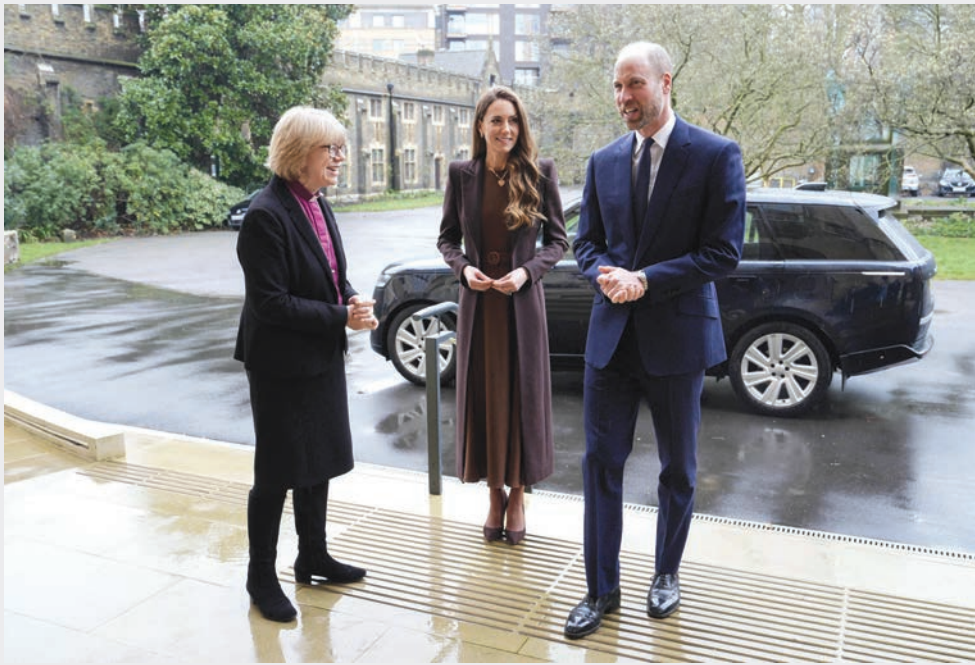
The archbishop of Canterbury Sarah Mullally (left) welcomes Britain's Prince William (right), Prince of Wales and Catherine, Princess of Wales at Lambeth Palace in London yesterday. The Prince and Princess of Wales have formally met the archbishop of Canterbury for the first time since she took up office.