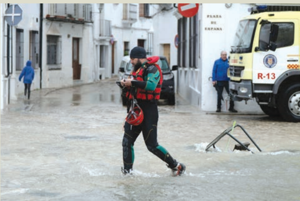
Emergency personnel get ready to carry out a total evacuation of the town of Grazaalema, southern Spain, yesterday, amid Storm Leonardo.

south of Lisbon, the Sado river burst its banks and flooded the town centre. Fire brigade divers helped evacuate residents on inflatable boats. The Civil Protection authority told AFP that 89 people had been rescued.