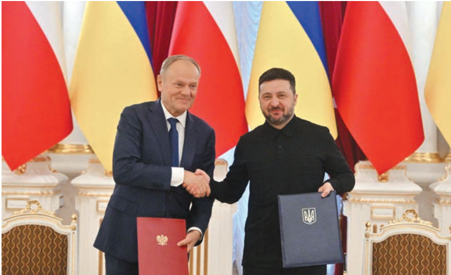
Ukrainian President Volodymyr Zelensky (right) and Poland's Prime Minister Donald Tusk shake hands after a document signing ceremony at the Mariinskyi Palace in Kyiv yesterday, amid Russian invasion in Ukraine.

Moscow had not commented on the announcement. 'Not easy' Moscow and Kyiv agreed to swap more than 300 prisoners at the talks in Abu Dhabi, but there were no immediate signs of progress on the thornier issue of territory. "It is certainly not easy, but Ukraine has been and will remain as constructive as possible," Zelensky said of the talks. "We want faster results," he told a press conference in Kyiv, speaking alongside Polish Prime Minister Donald Tusk. US mediator Steve Witkoff conceded that "significant" work still lay ahead in the quest for a broader deal to end the war, dimming hopes for a quick breakthrough.