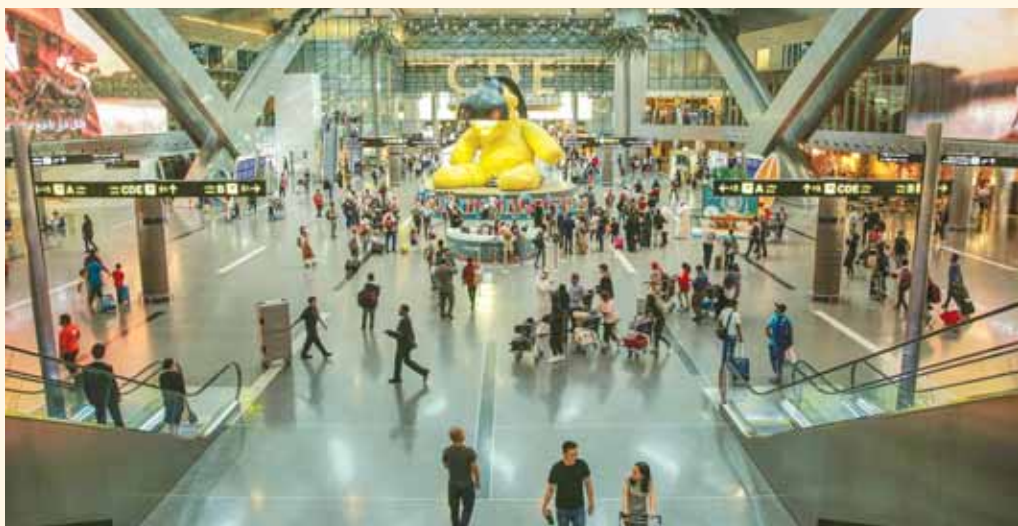
An inside view of the Hamad International Airport.

The forum highlights the Middle East's growing economic influence through sovereign wealth funds and strategic energy assets. Last year's edition attracted over 3,000 participants from 95 countries. Business Page 1