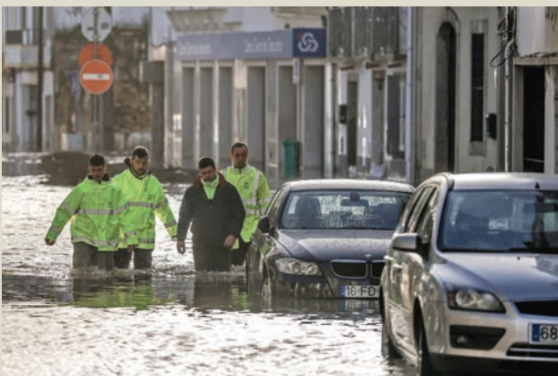
City hall workers waded through floodwaters from the Sado river covering a street in Alcacer do Sal, south of Portugal, amid Storm Leonardo yesterday.

Alcácer do Sal, Portugal: Spanish rescuers searched yesterday for a woman missing after a new storm hit the Iberian peninsula, as Portugal warned of a heightened flood risk after several months' worth of rain fell in a few hours. One death has already been confirmed in Portugal from the seventh storm to hit the peninsula this year. Portugal has barely recovered from last week's battering by rain and winds that killed five people, injured hundreds and left tens of thousands without power. Scientists say human-driven climate change is increasing the length, intensity and frequency of extreme weather events such as the floods and heatwaves that have struck the Spain and Portugal in recent years. Storm Leonardo on Wednesday dumped more than 40 centimetres (15 inches) of rain in some districts of Andalusia, southern Spain, the equivalent of several months of rainfall. Thousands of people were evacuated and roads and rail lines paralysed. Portuguese officials yesterday issued their highest flood alert for the Tagus river in the Santarem region.